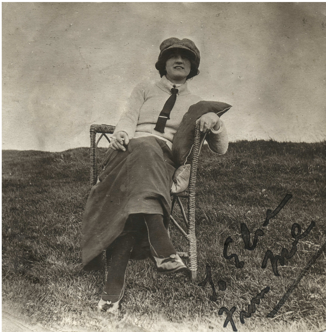
MPS-0004 - A chair at Trent Lock.