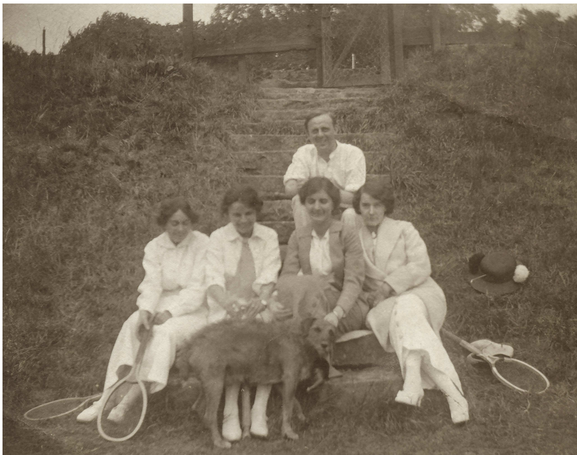
MPS-0001 - Tennis Family.