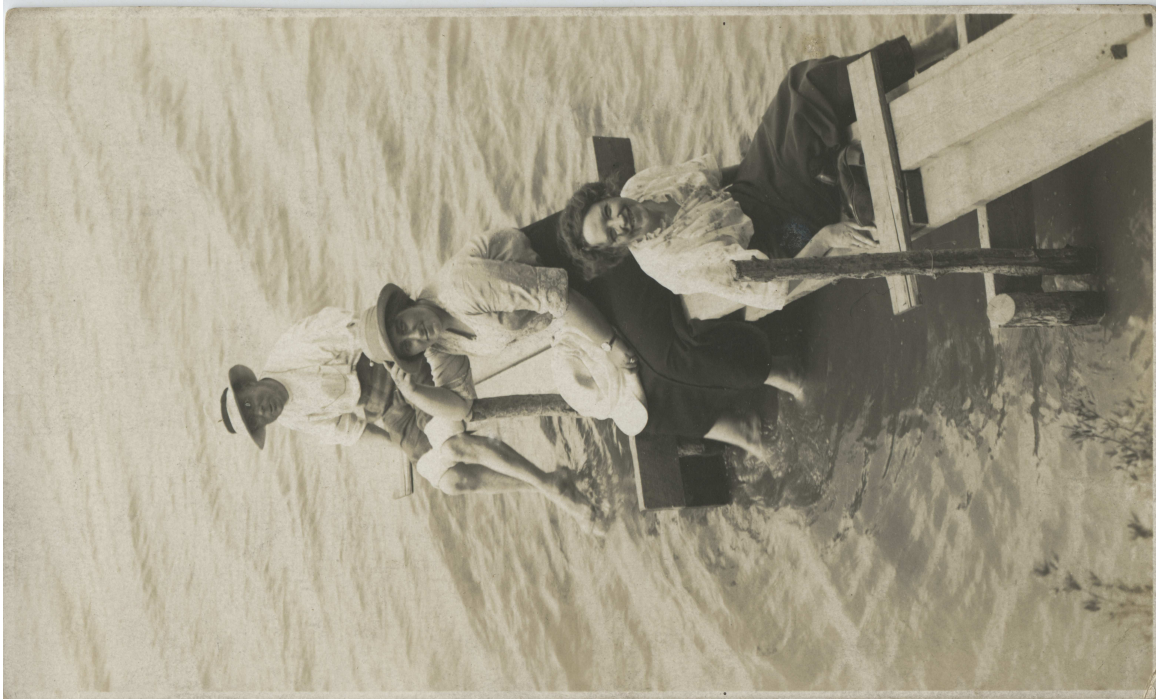
MPS-0003 - Cooling off.