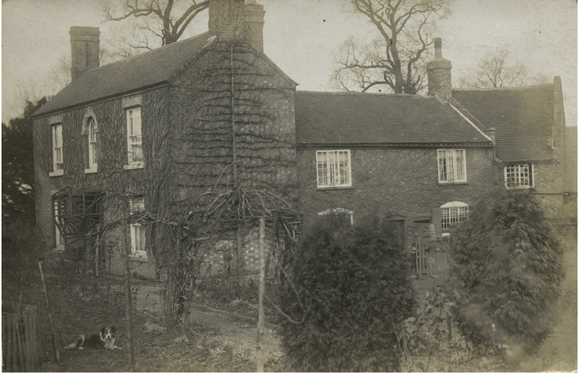
MPS-0001 - Stanford Hills.