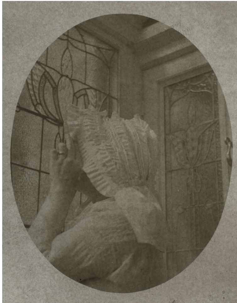
MPS-0001 - Eclipse of the Sun 1914.