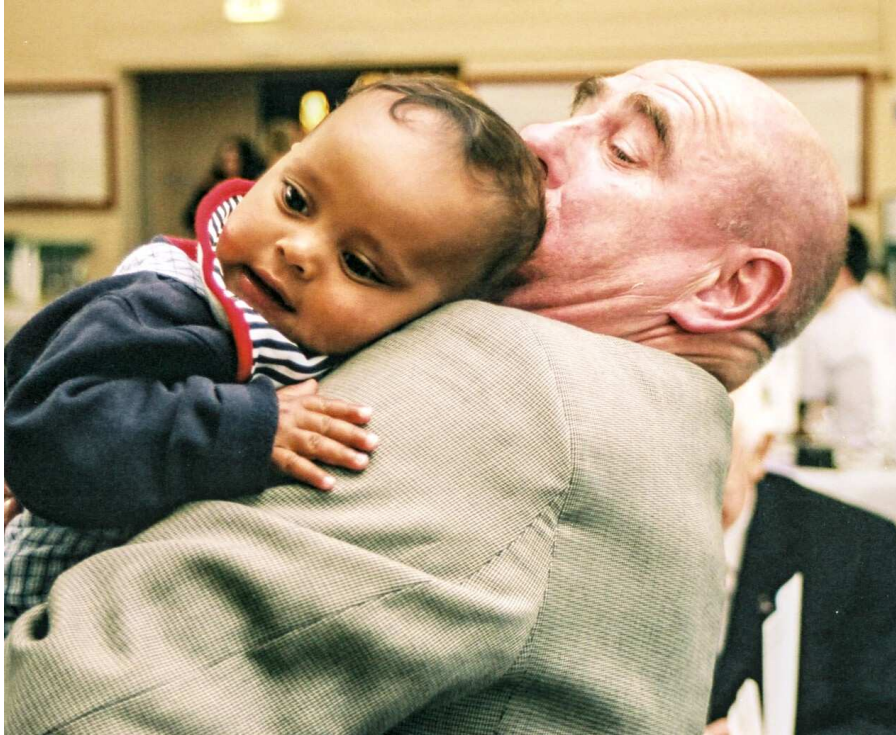
cnv00032 - Uncle and cousin.