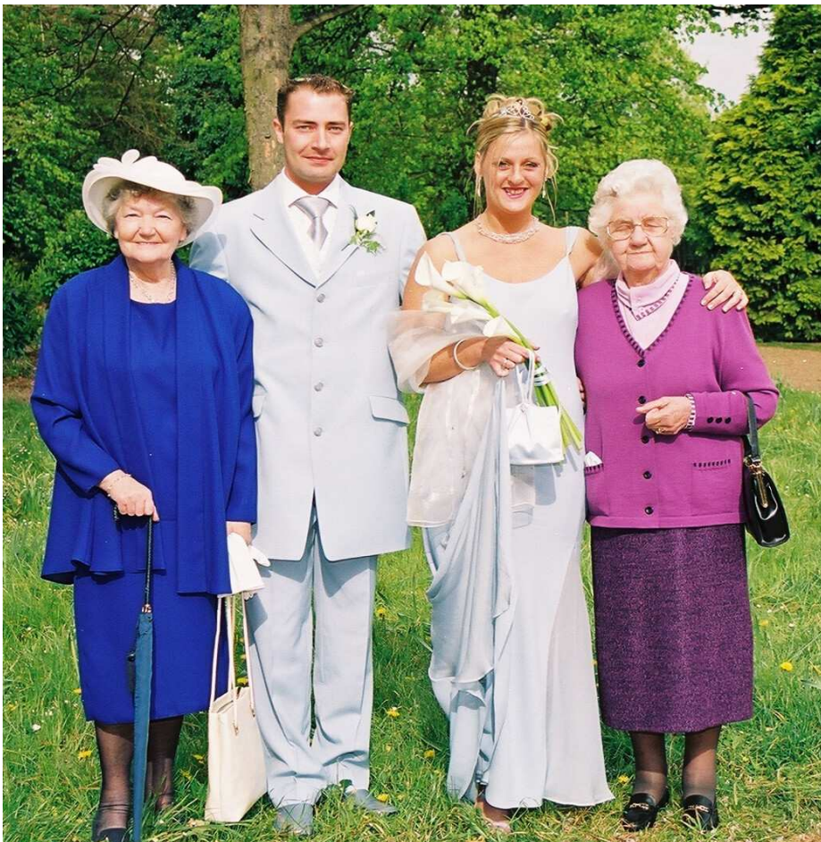
cnv00030 - Grandparents.