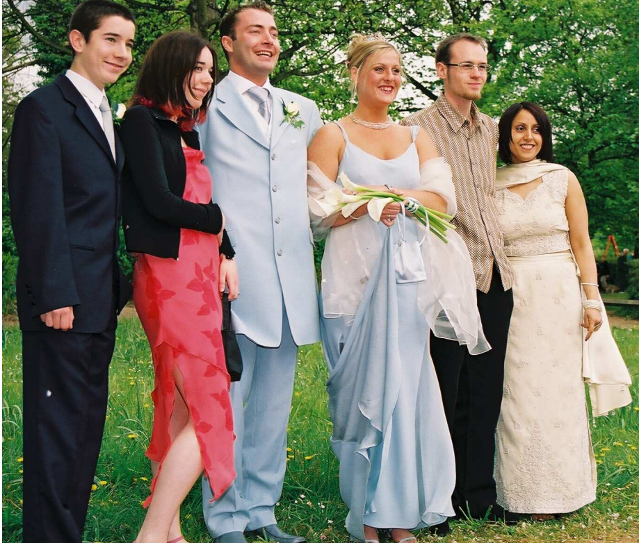
cnv00029 - Siblings of the bride and groom.