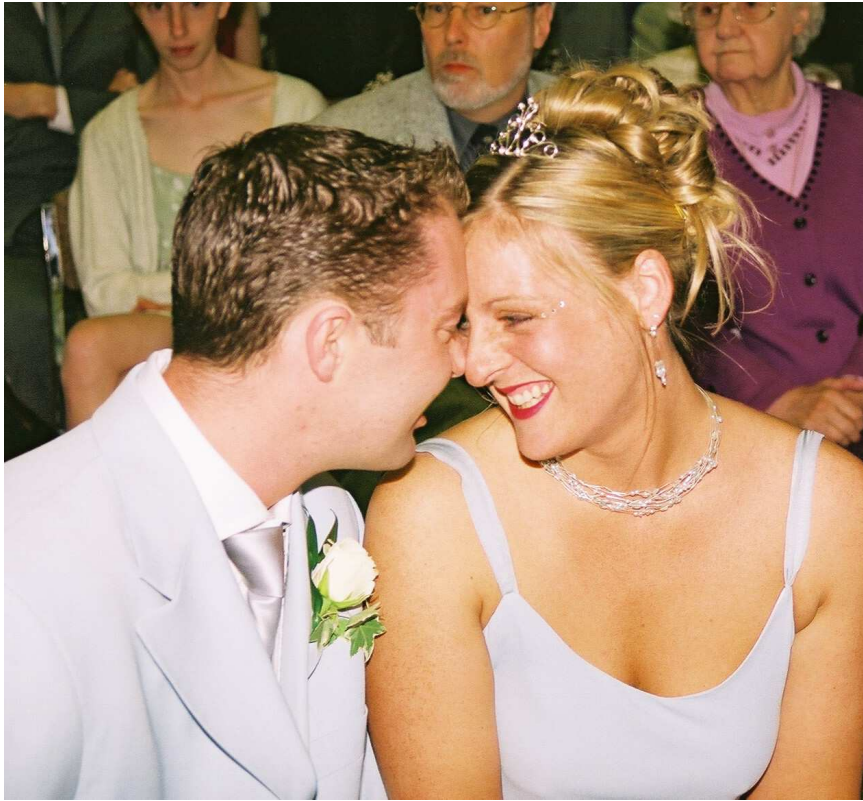
cnv00009 - Nose to nose.