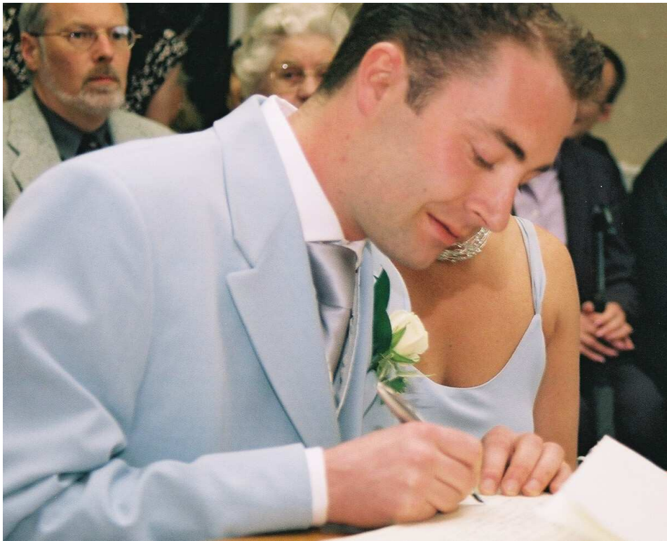
cnv00006 - Signing the registry.

cnv00026 20020427 11:55:00 Bride and groom. cnv00027 20020427 11:56:00 Parents of the bride and groom. cnv00028 20020427 11:57:00 Parents of the bride and groom. cnv00029 20020427 11:58:00 Siblings of the bride and groom. cnv00030 20020427 12:00:00 Aunt and cousin. cnv00031 20020427 12:01:00 Uncle and cousin. cnv00032 20020427 12:02:00 Uncle and cousin. cnv00033 20020427 12:03:00 Aunt and cousin. cnv00034 20020427 12:04:00 Aunt and cousin. cnv00035 20020427 12:05:00 Aunt and cousin. cnv00036 20020427 12:06:00 Step Grandmother and step aunt.