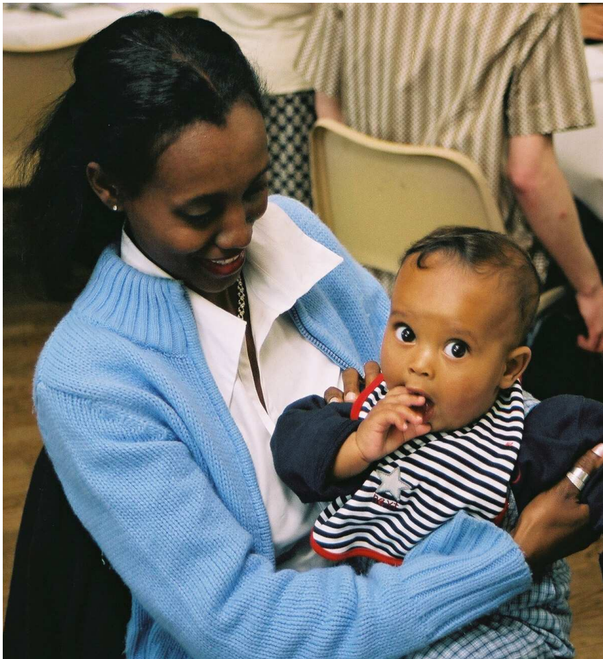
cnv00034 - Aunt and cousin.