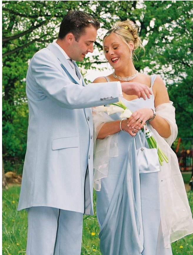
cnv00025 - Bride and groom.