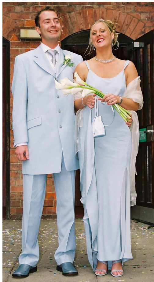
cnv00015 - Bride and groom.