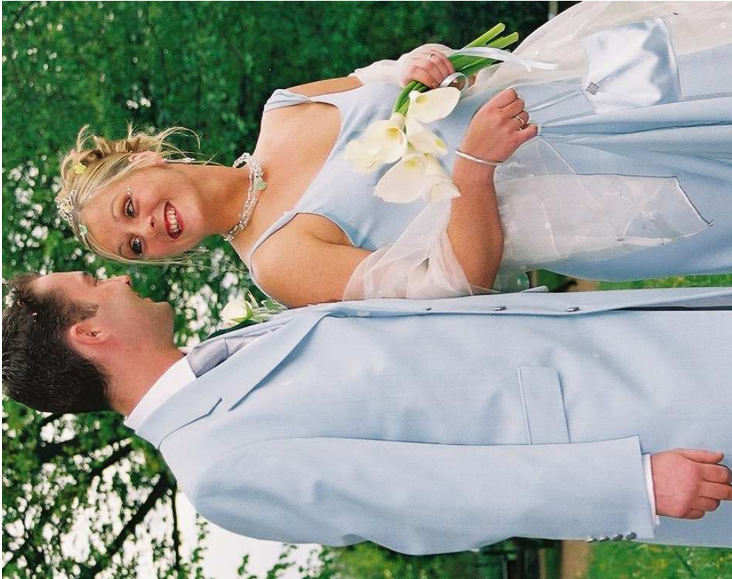
cnv00022 - The radiant smile.