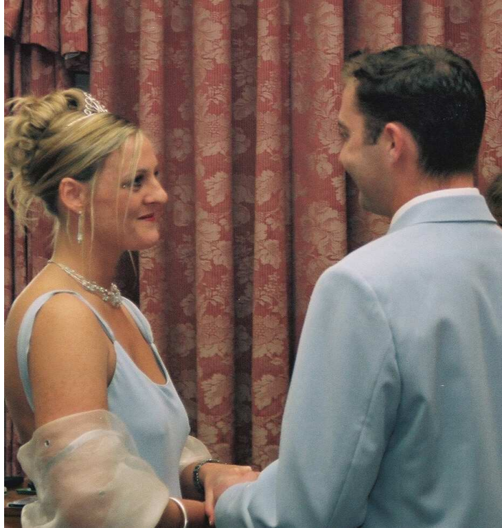
cnv00002 - Bride and groom.