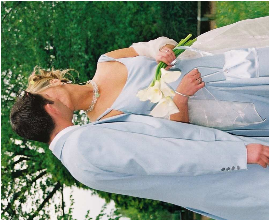
cnv00021 - Bride and groom kiss.