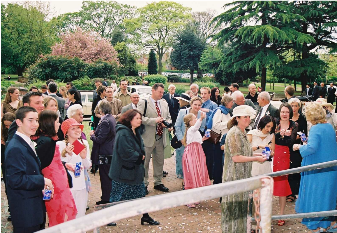
cnv00013 - The wedding guests.