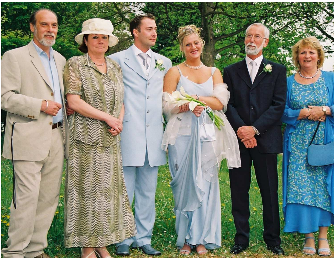
cnv00028 - Parents of the bride and groom.