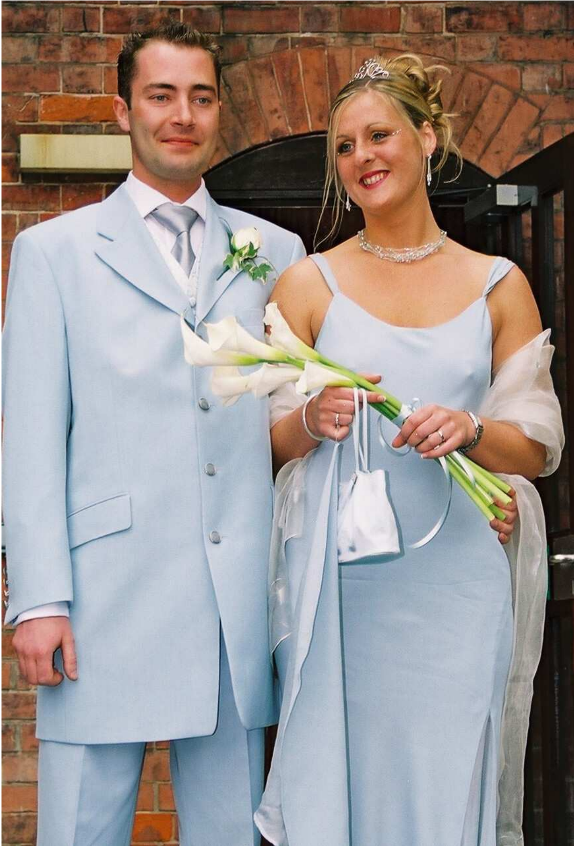
cnv00017 - Bride and groom.