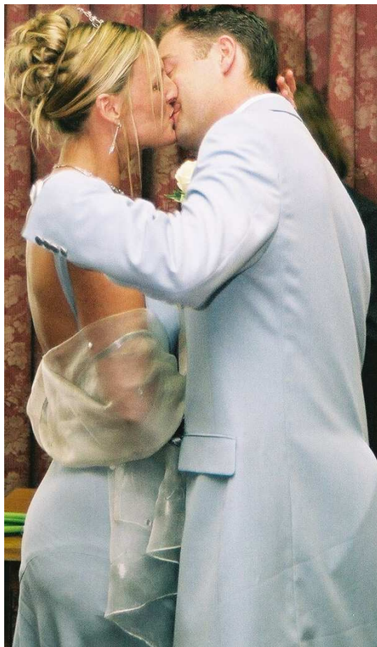
cnv00004 - The kiss.