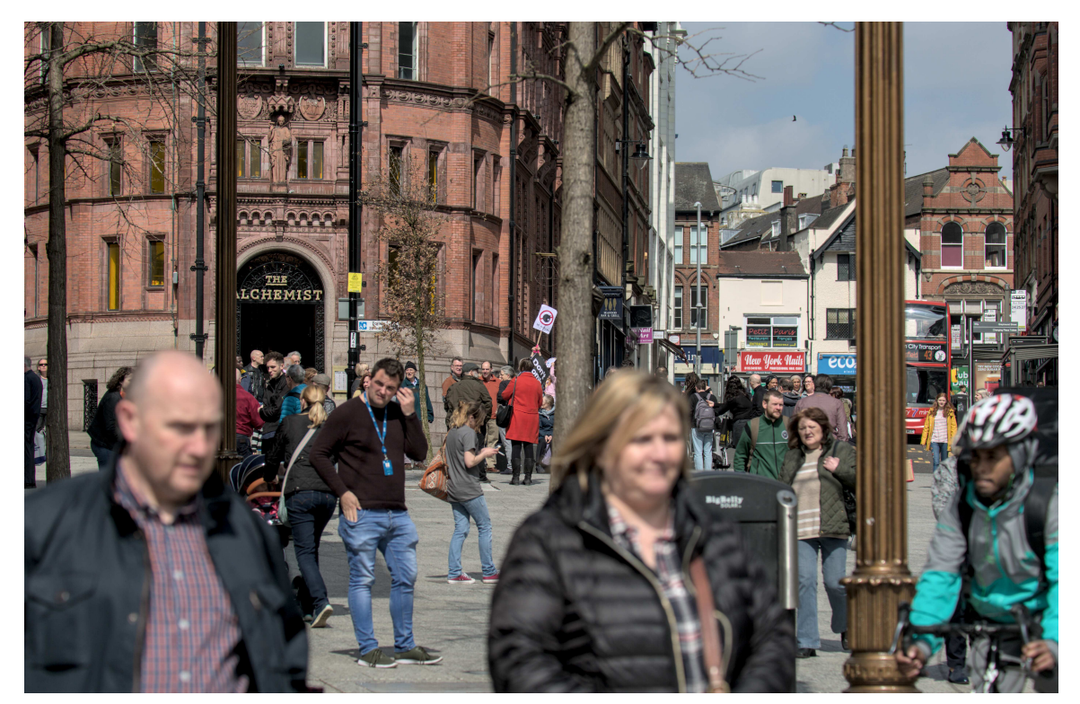
F47A4585 - Prudential Assurance Building.