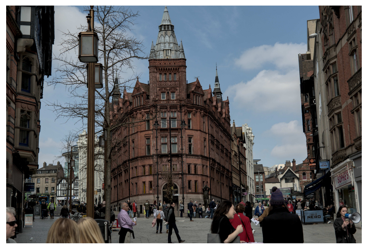
F47A4583 - Prudential Assurance Building.