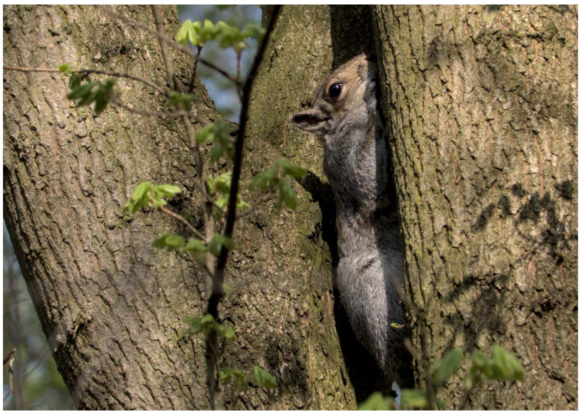
F47A4578 - Squirrel in the park.