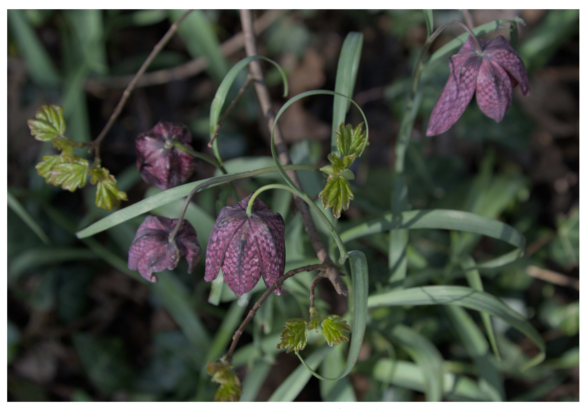
F47A4577 - Snakeshead fritillaria.