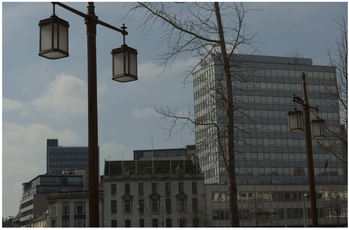
F47A4584 - From Queen Street.