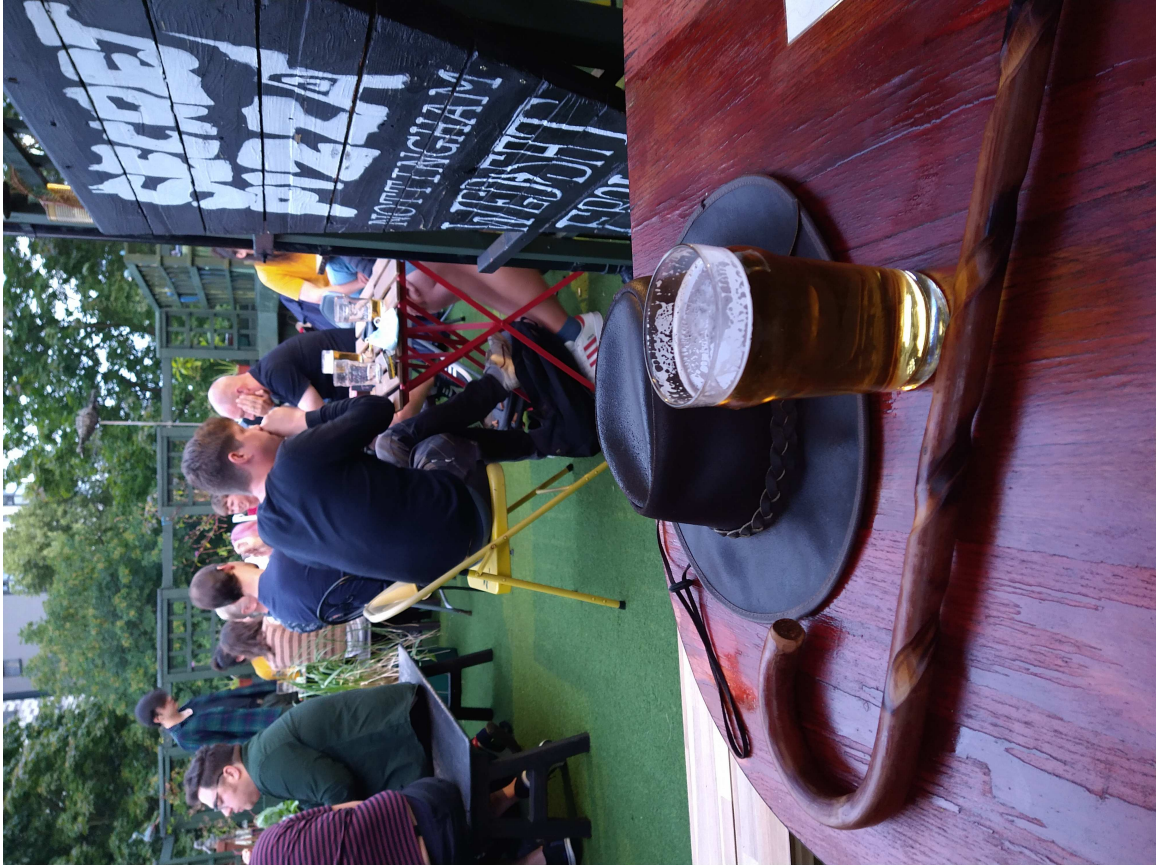
IMG_205446065 - Secret Pizza.