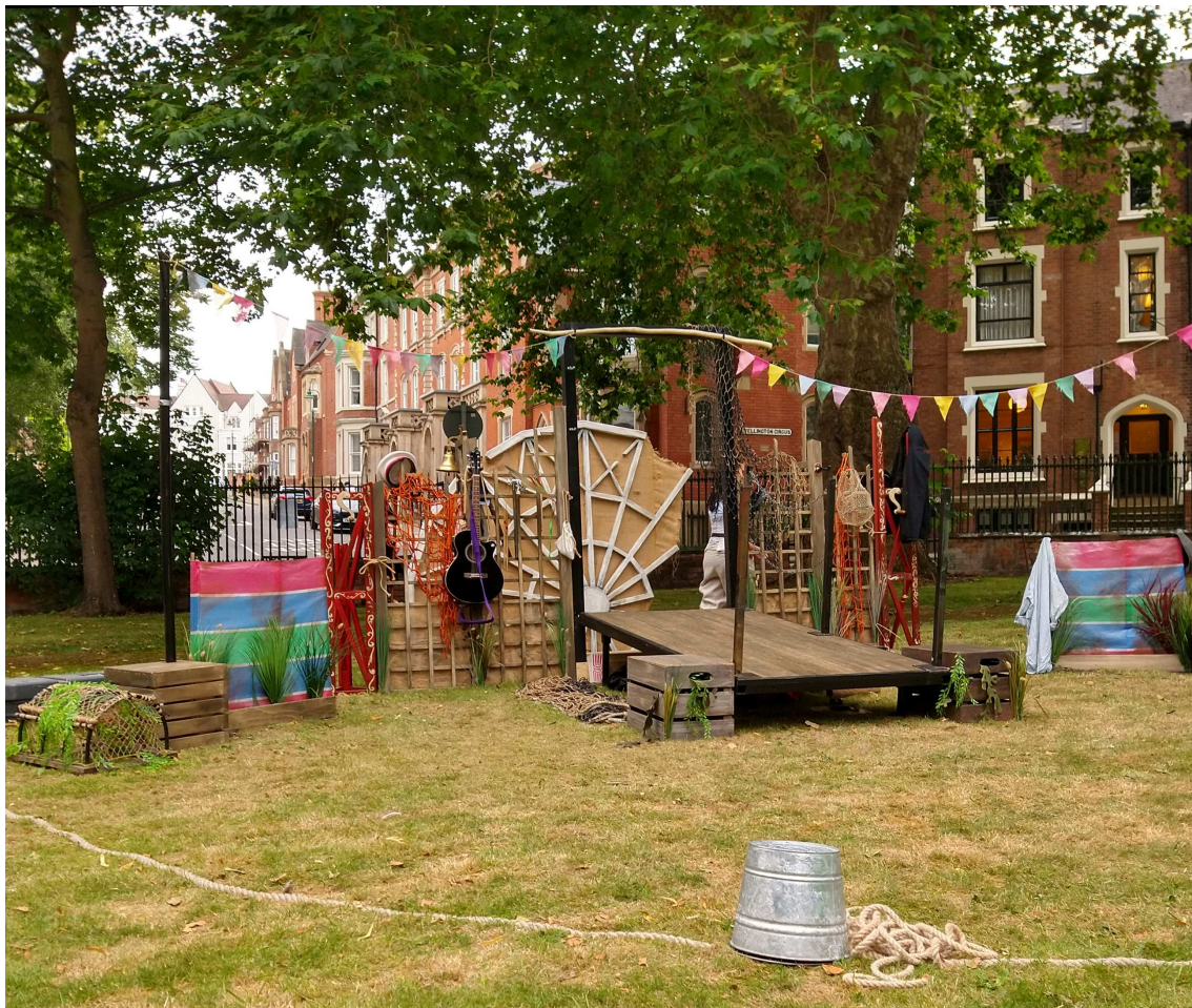
IMG_174824089_HDR - Prospero's island.