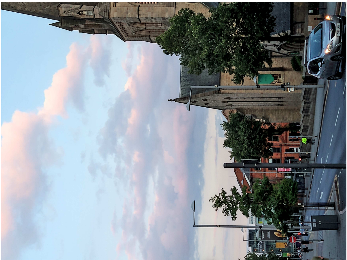
IMG_202656912 - Derby Road.