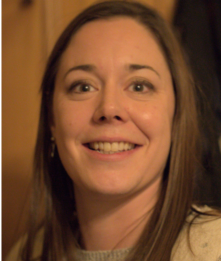
F47B7696 - Tase.