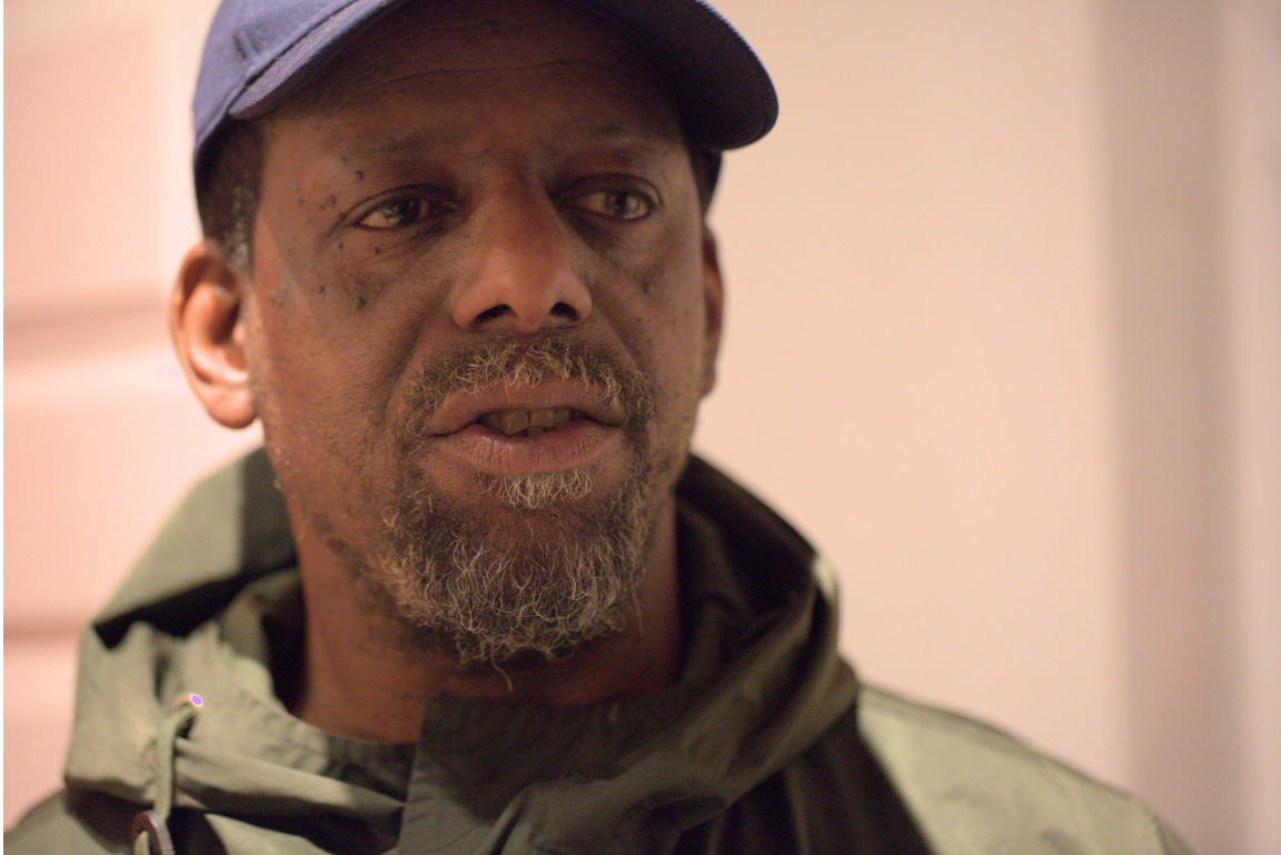
F47B7675 - Unknown.