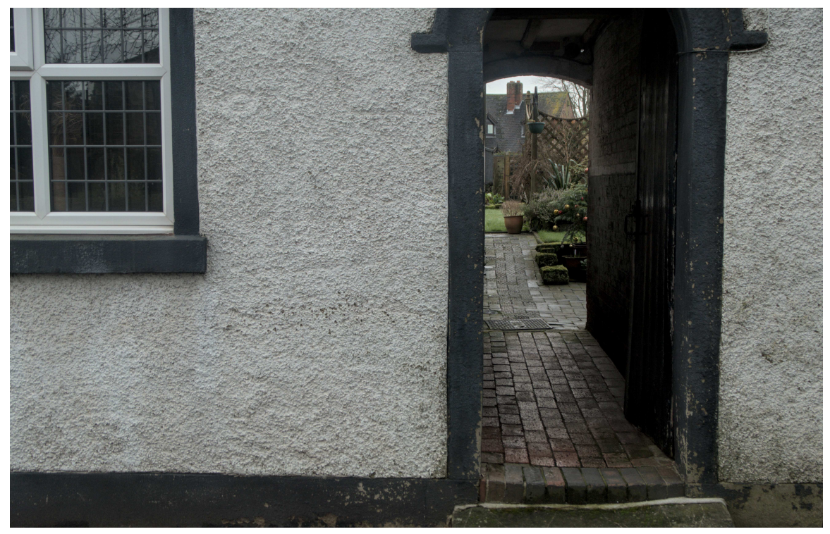
P1035987 - Village alleyway.