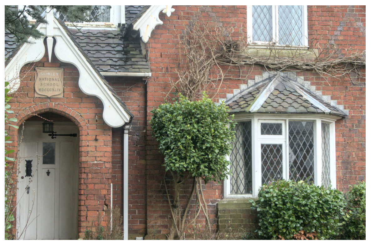
P1035985 - National School.