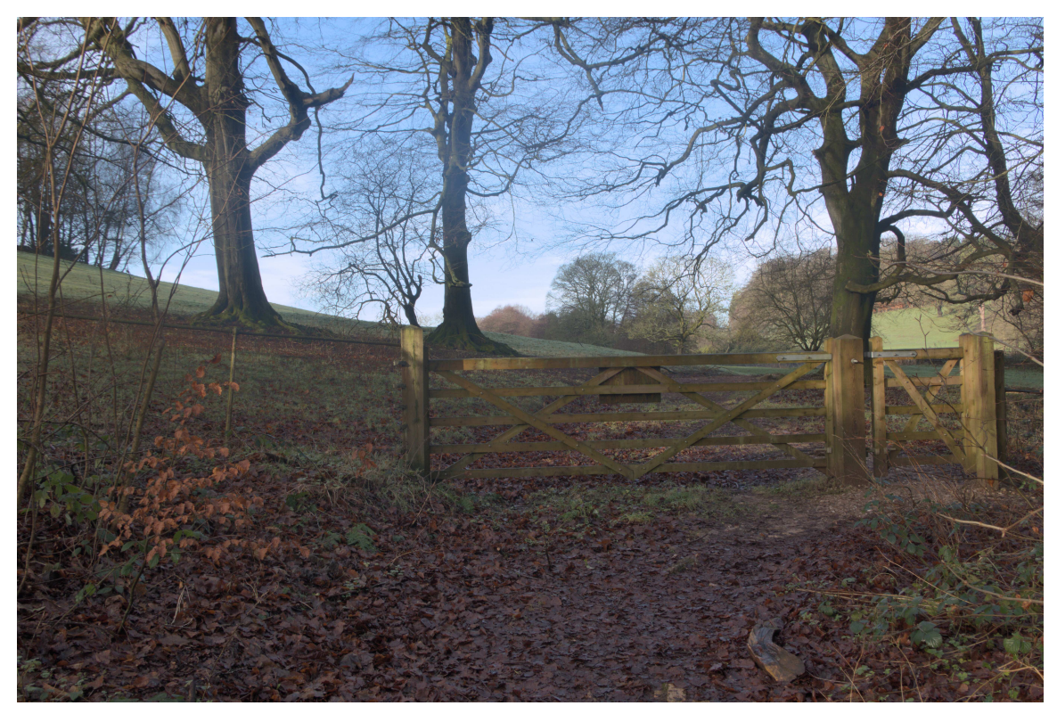
P1035966 - Footpath and gate.