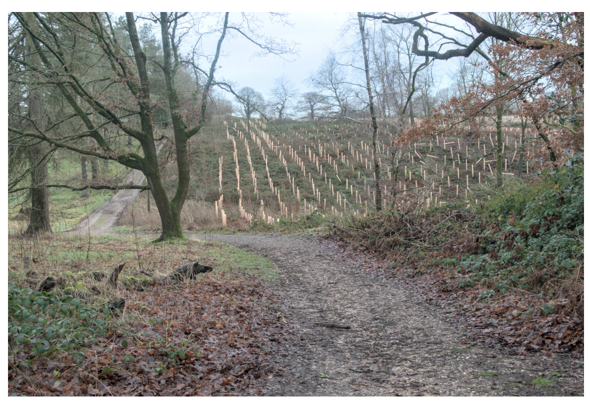
P1035983 - Plantation.