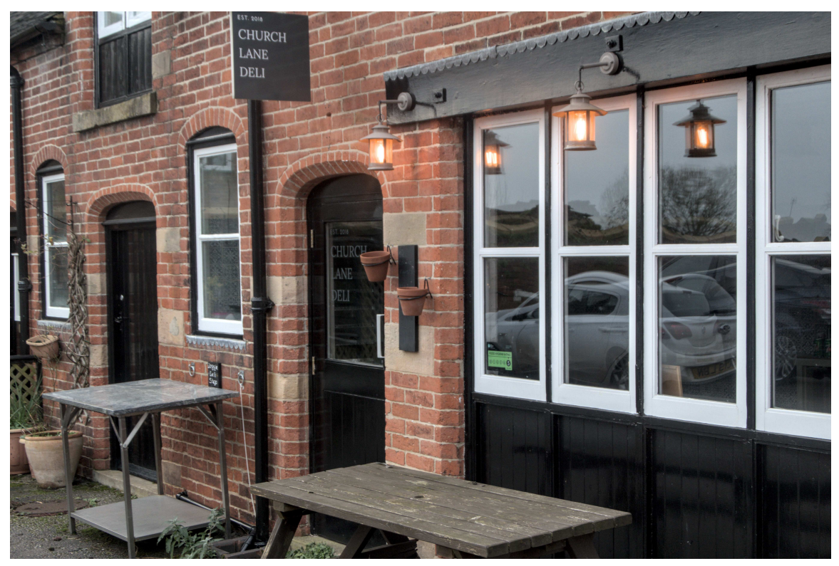
P1035989 - Church Lane Deli.