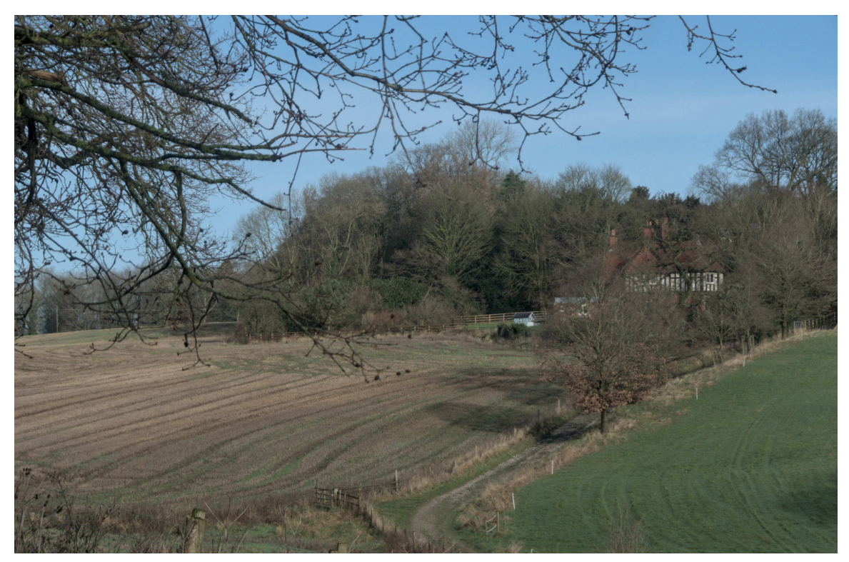
P1035976 - Osmaston Park.