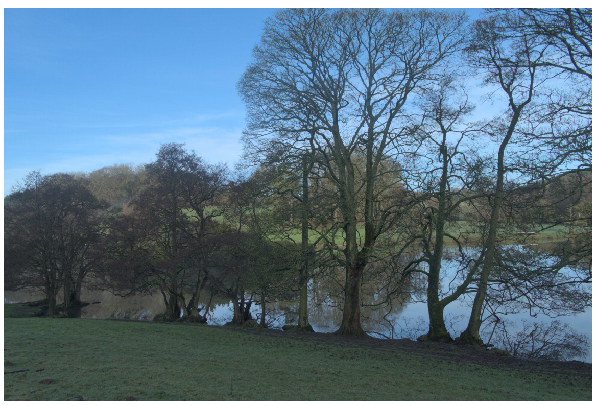
P1035970 - Tarn and trees.