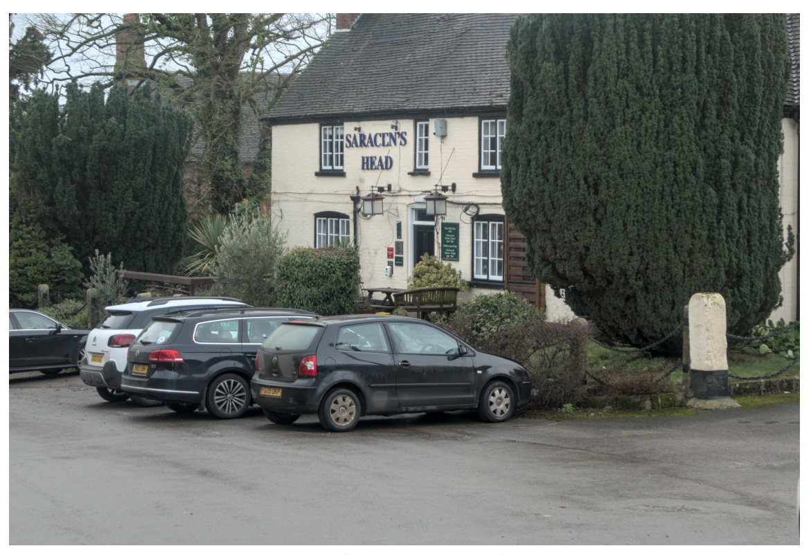
P1035988 - Saracen's Head.