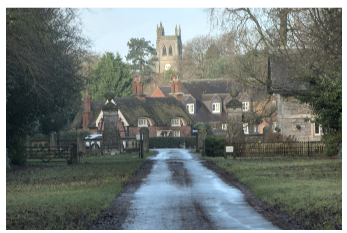
P1035979 - Entrance to Osmaston.