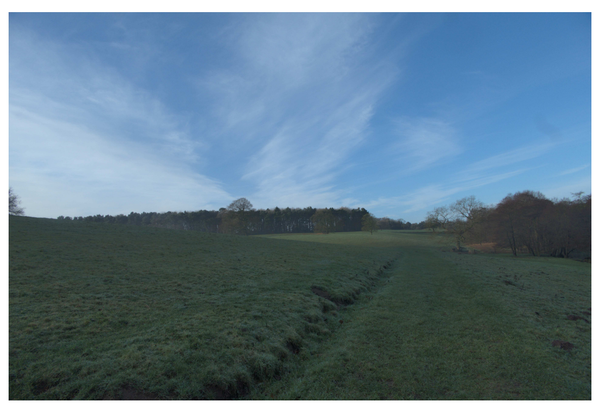
P1035968 - Herring bone skies.