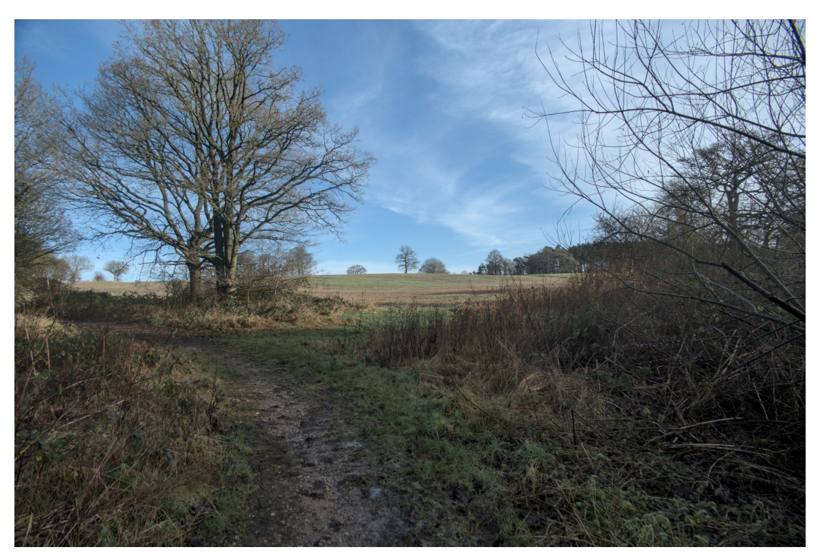
P1035973 - Foot path and skies.