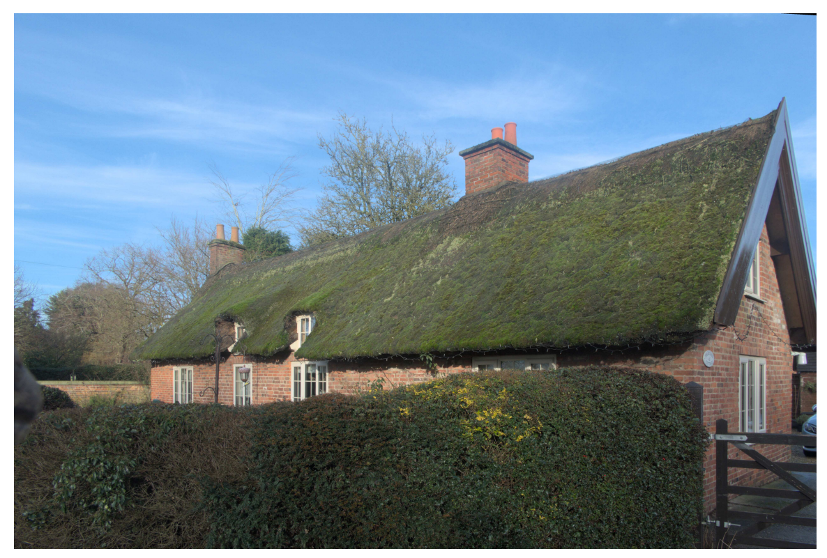
P1035980 - Thatched cottage.