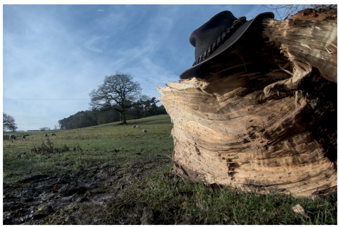
P1035971 - Fish eye view.