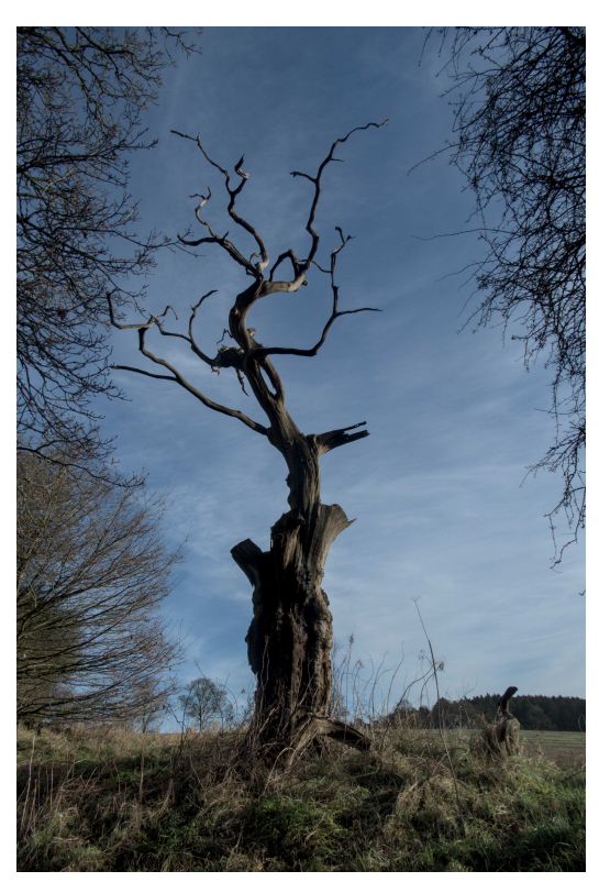
P1035974 - Extraordinary tree stump.