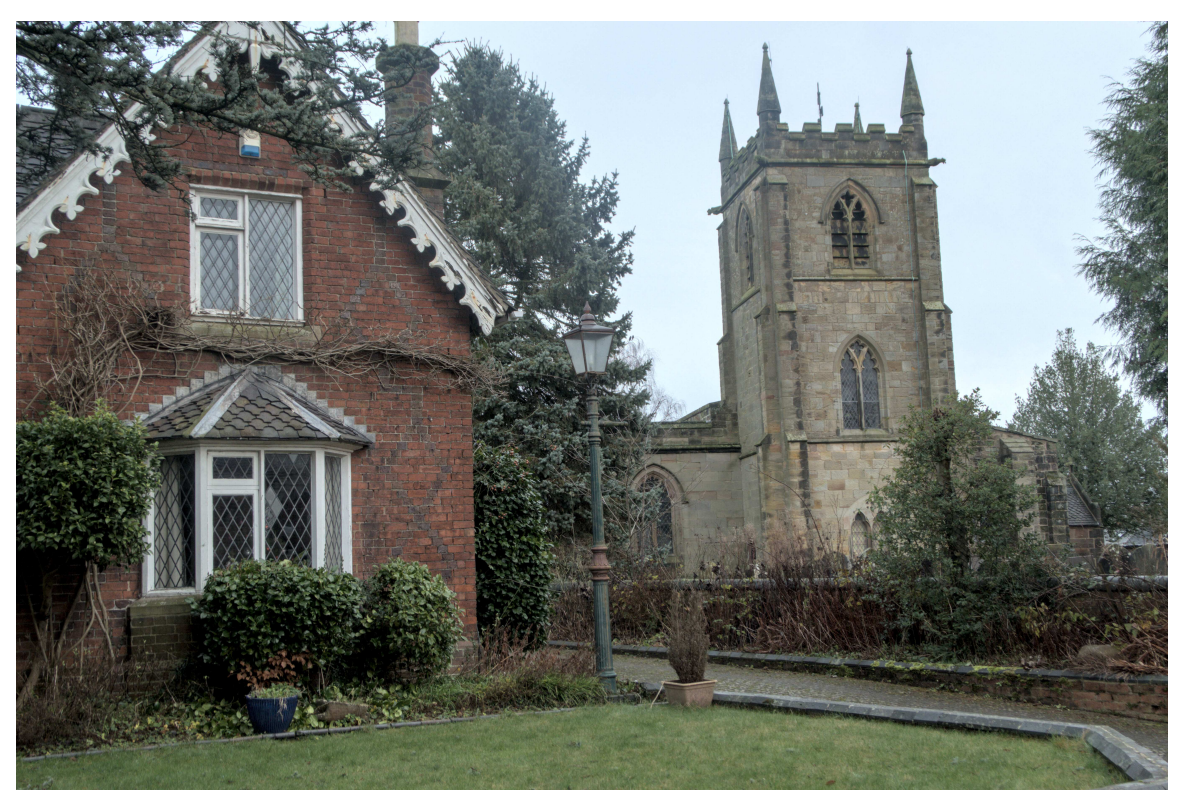
P1035986 - House and church tower.