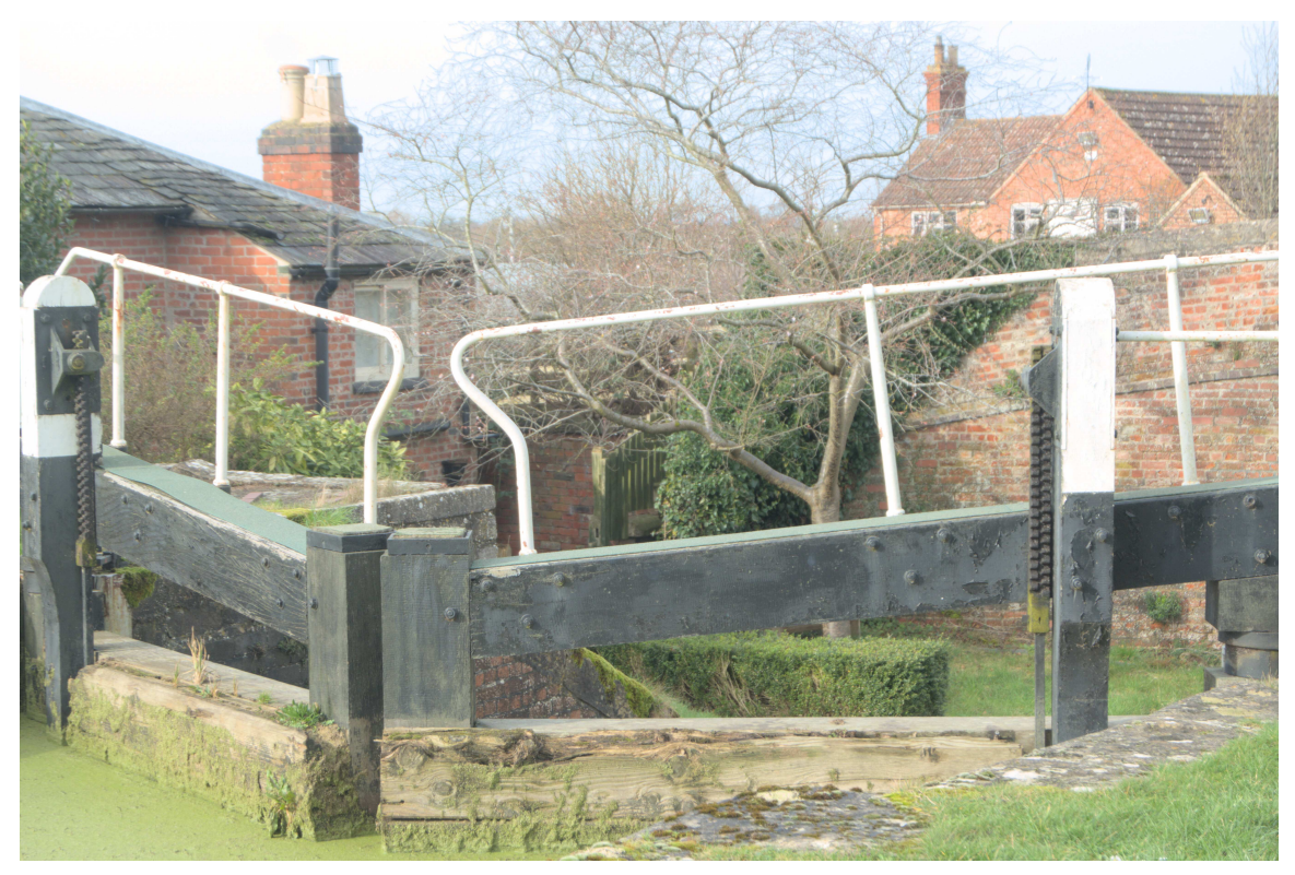
P1036092 - Lock and cottage.