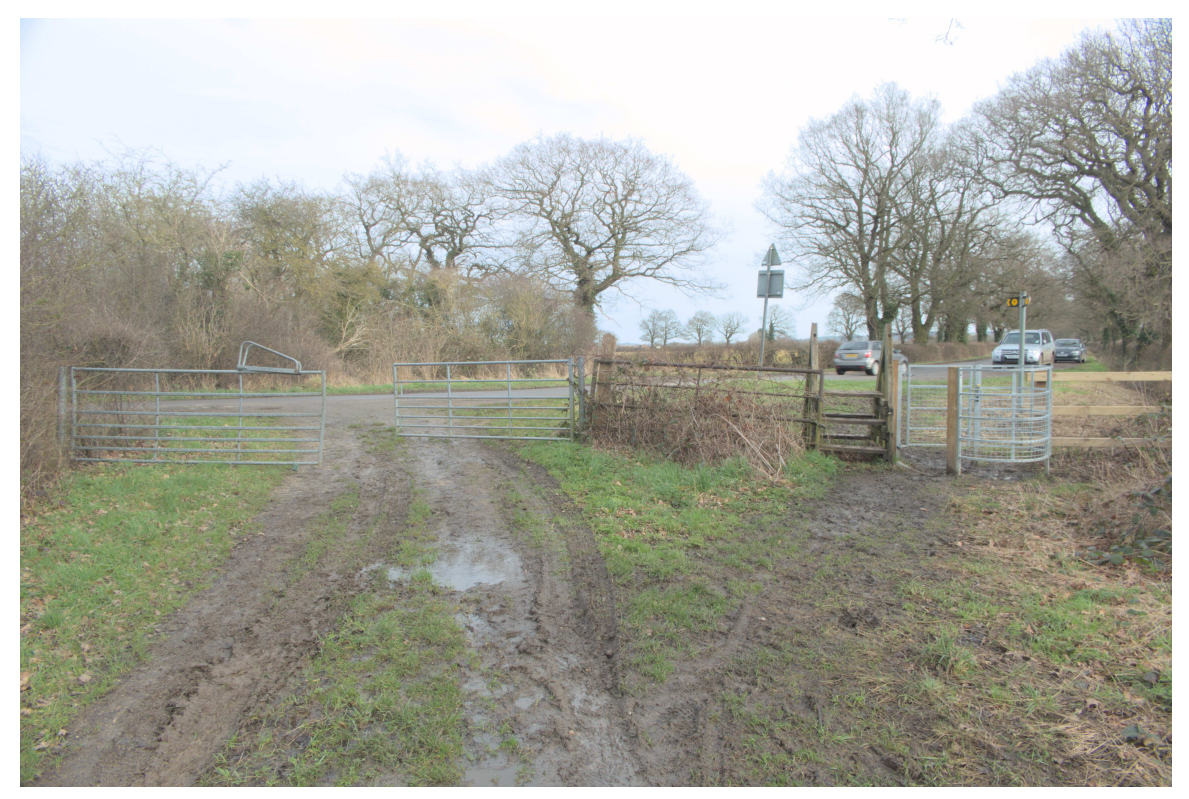
P1036083 - Spoilt for choice.