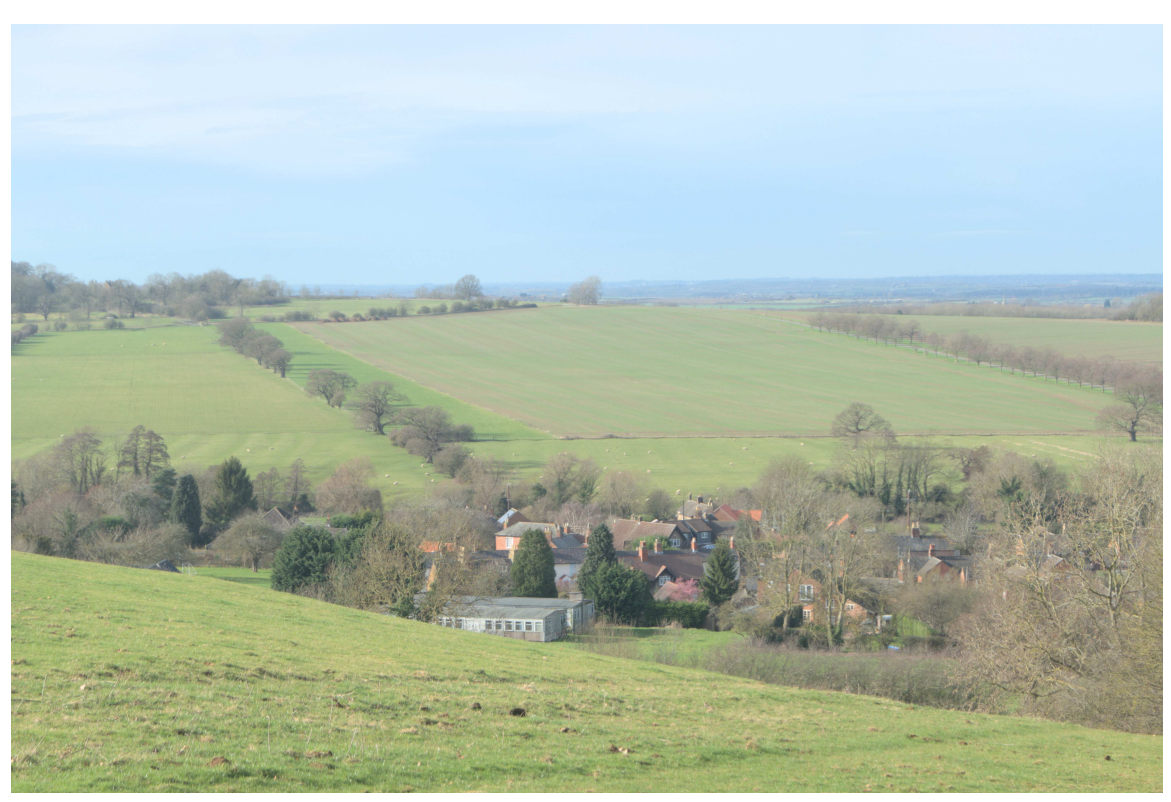
P1036100 - Woolsthorpe by Belvoir.