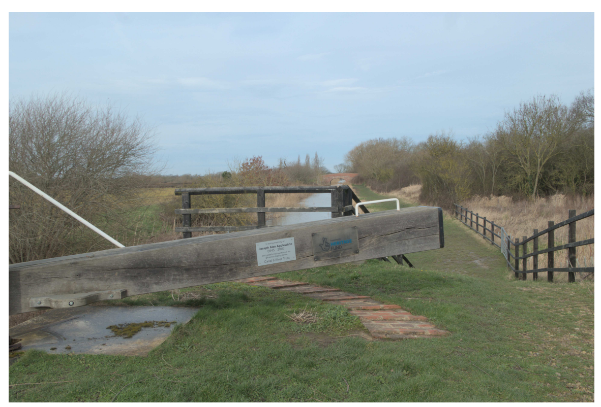
P1036085 - Lock gates.