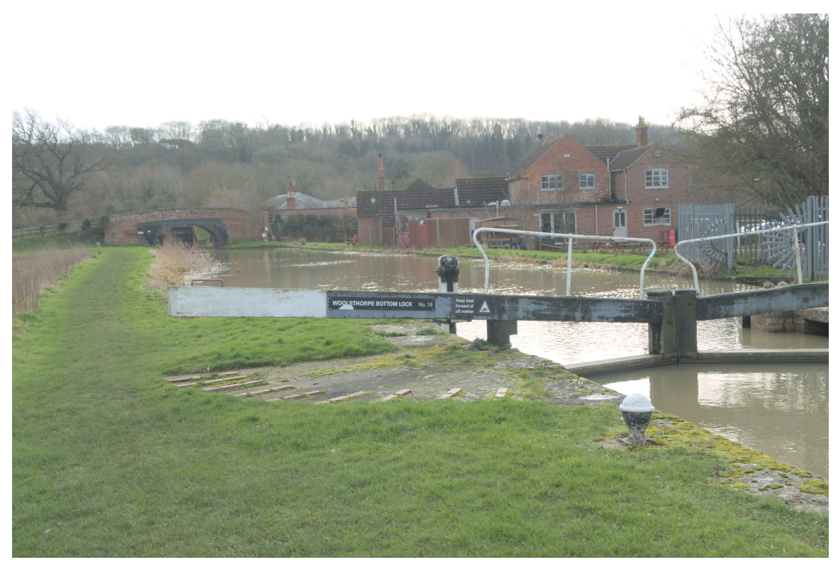
P1036088 - Woolsthorpe Bottom Lock No. 16.