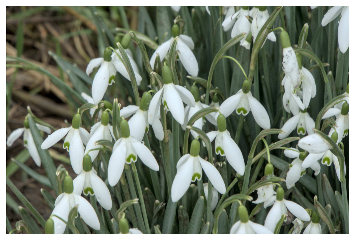
P1036075 - Snow drops.