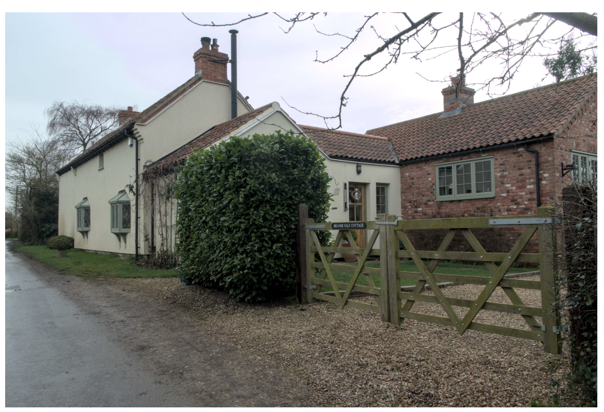
P1036079 - Belvoir Vale Cottage.