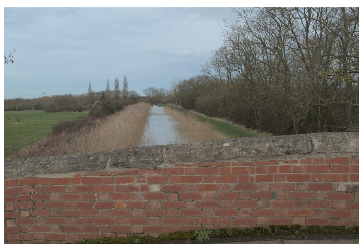
P1036081 - Grantham Canal.