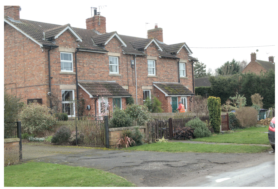
P1036073 - Terraced housing.