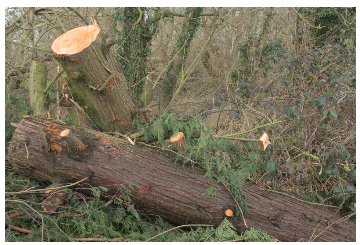
P1036076 - Interesting cuts.