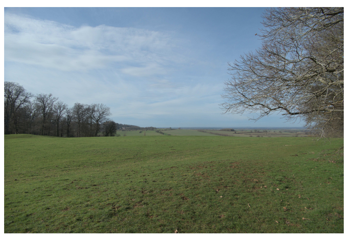
P1036094 - Belvoir Vale.