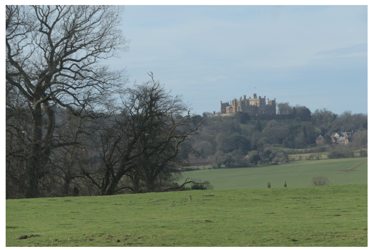
P1036096 - Belvoir Castle.