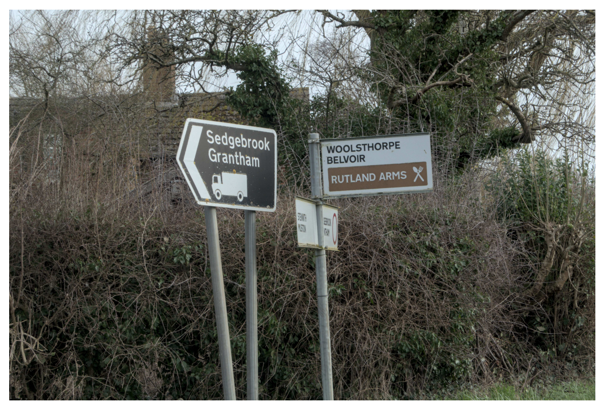
P1036080 - Signposts.