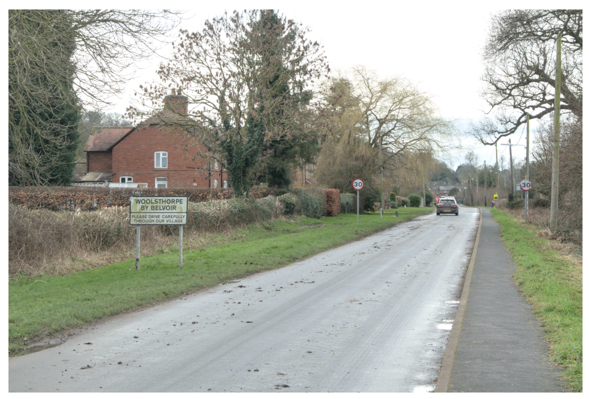
P1036072 - Village boundary.