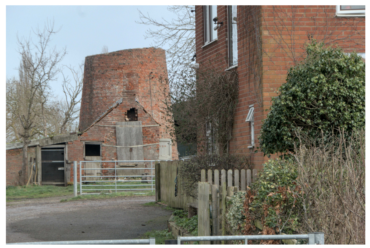
P1036078 - Derelict Mill.