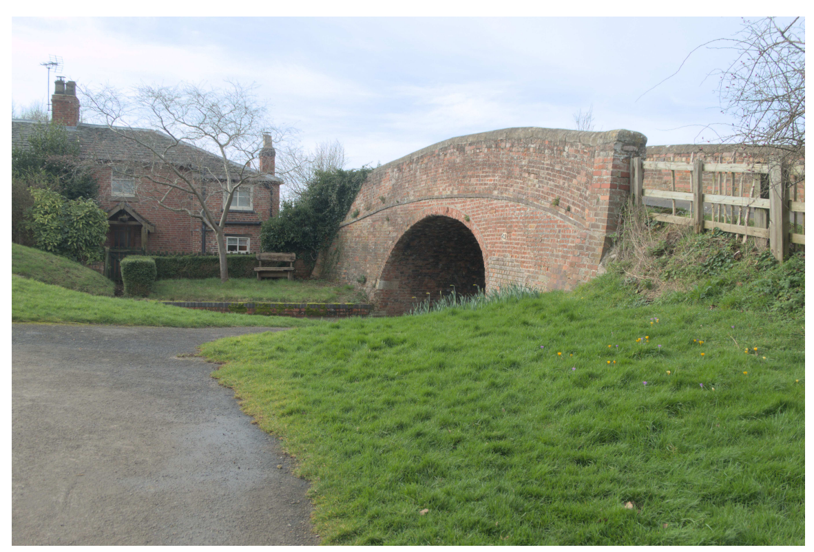
P1036089 - Bridge and cottage.