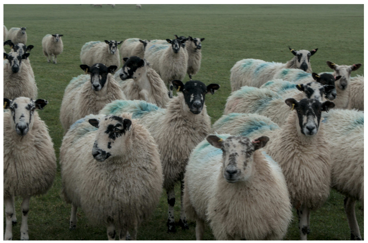
P1036117 - Curious sheep.