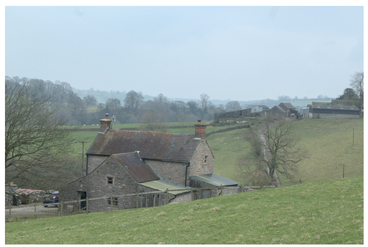
P1036118 - Rushley.