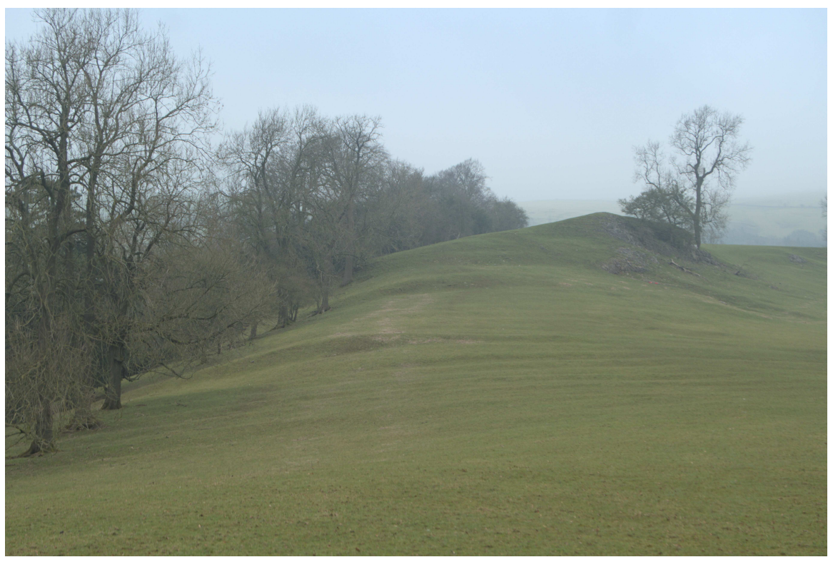
P1036106 - Ilam Park.