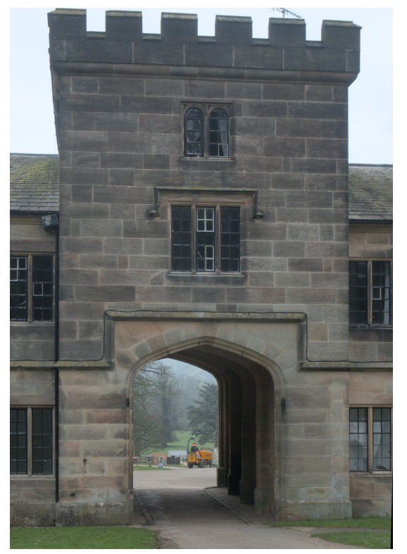
P1036126 - Ilam Hall.