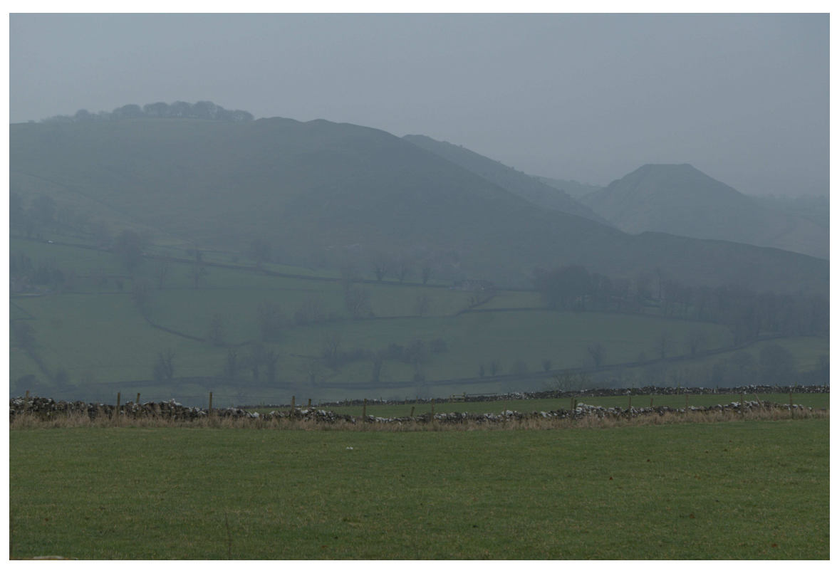
P1036115 - Hills in Mist.