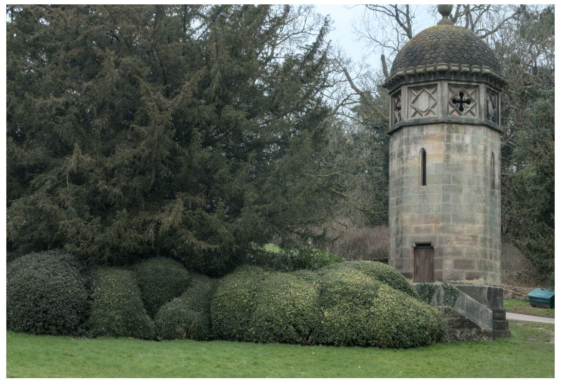
P1036129 - The Pepper Pot.