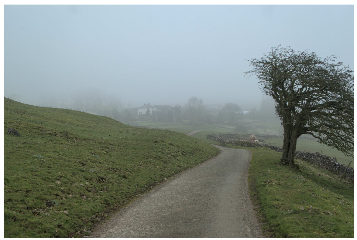
P1036107 - Track to Throwley.