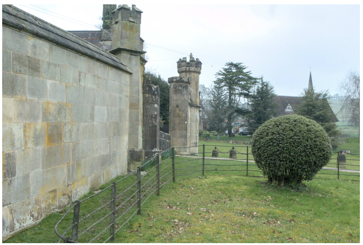
P1036131 - Ilam Hall Gates.