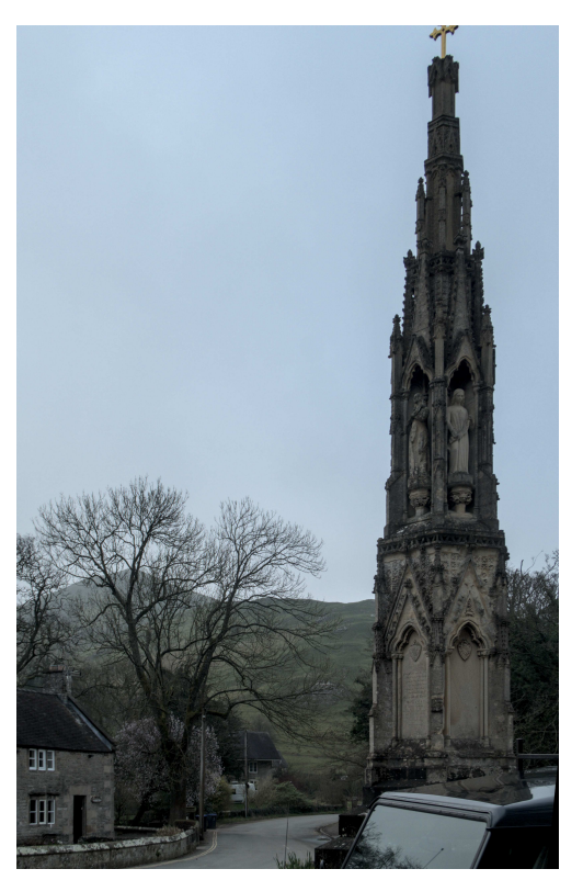
P1036103 - Ilam Cross.