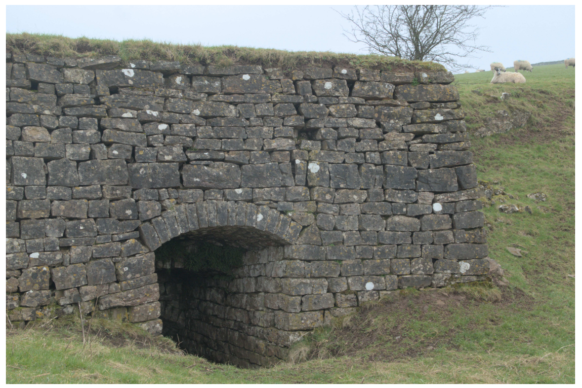
P1036112 - Entrance.