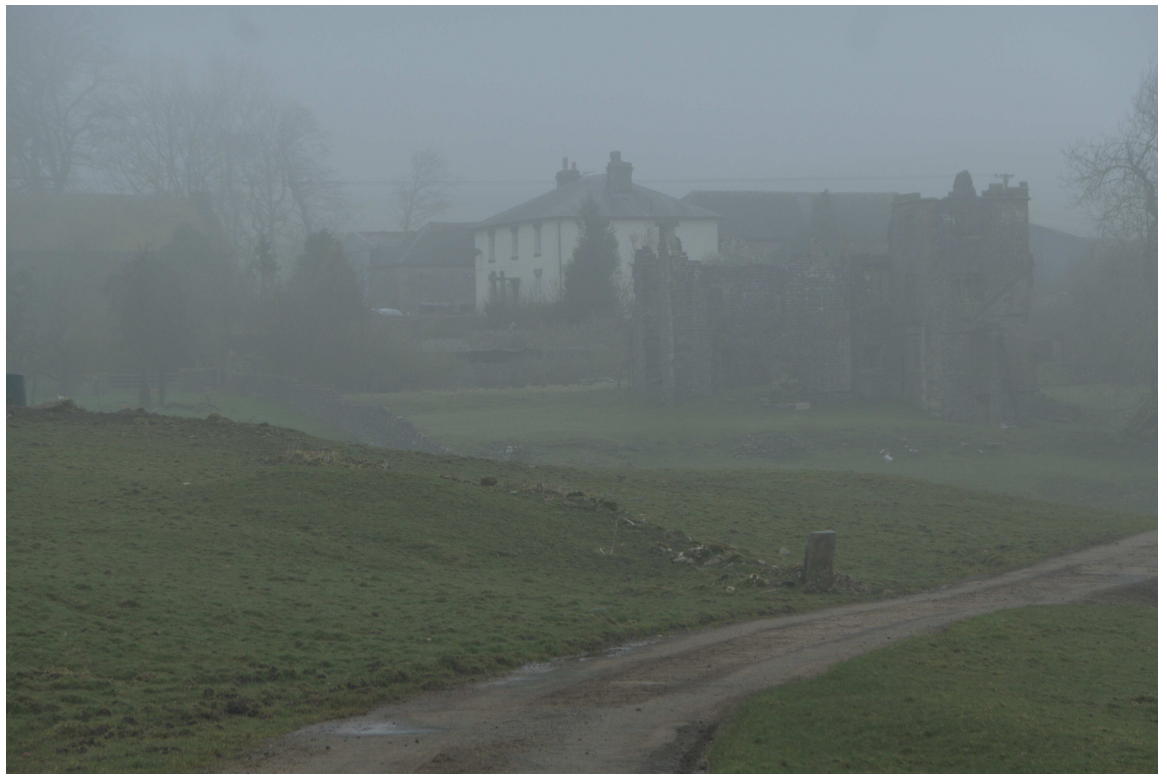
P1036109 - Throwley.