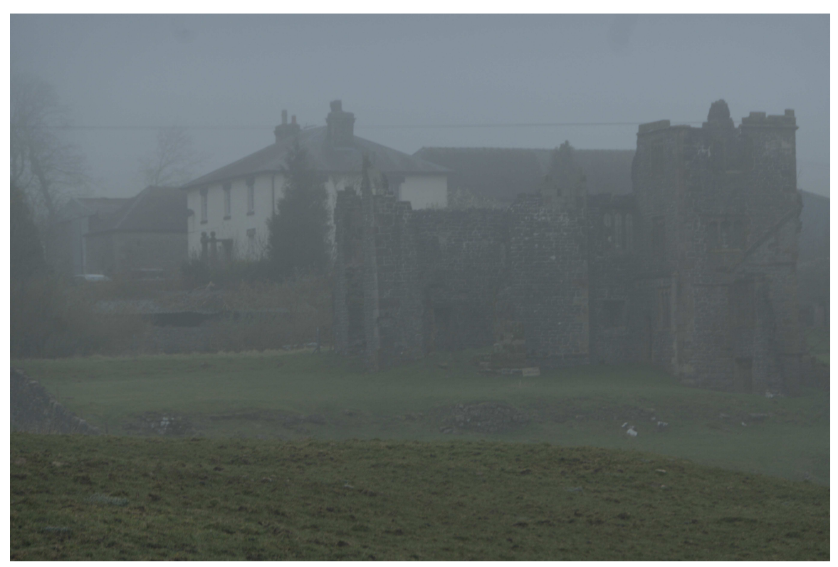
P1036111 - Throwley Old Hall.