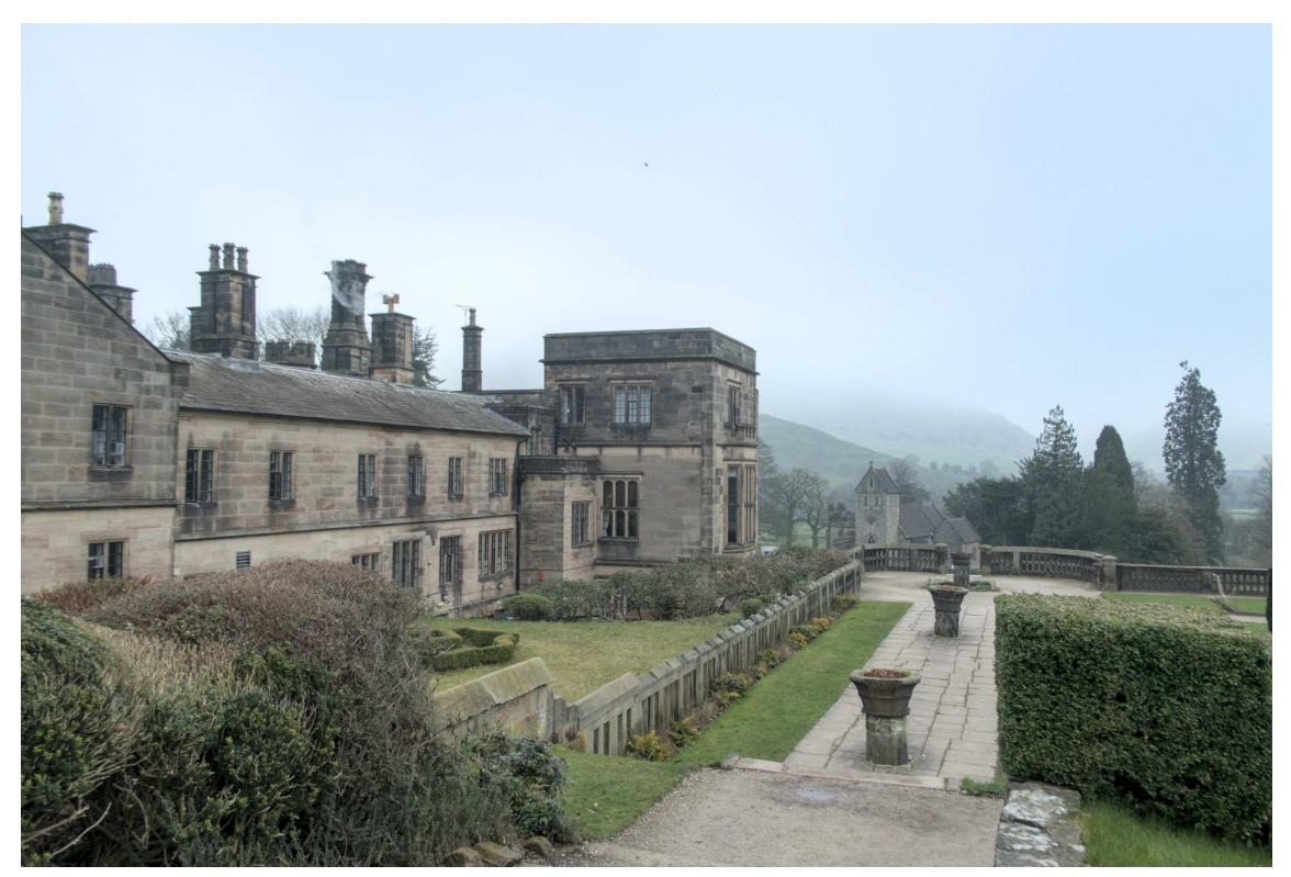
P1036105 - Ilam Hall.