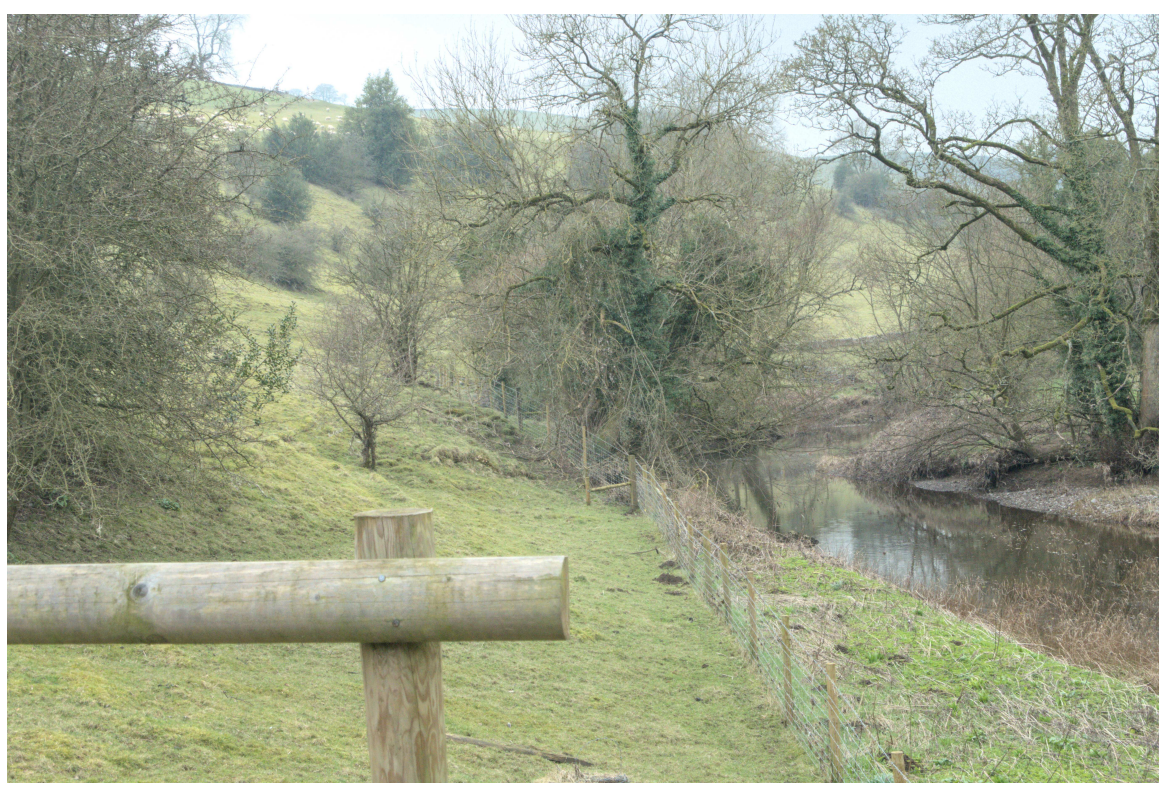
P1036121 - River Manifold.