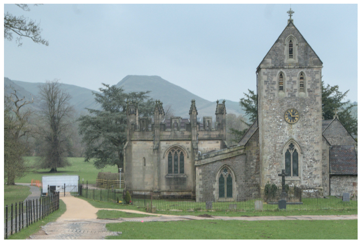
P1036130 - Church of the Holy Cross.