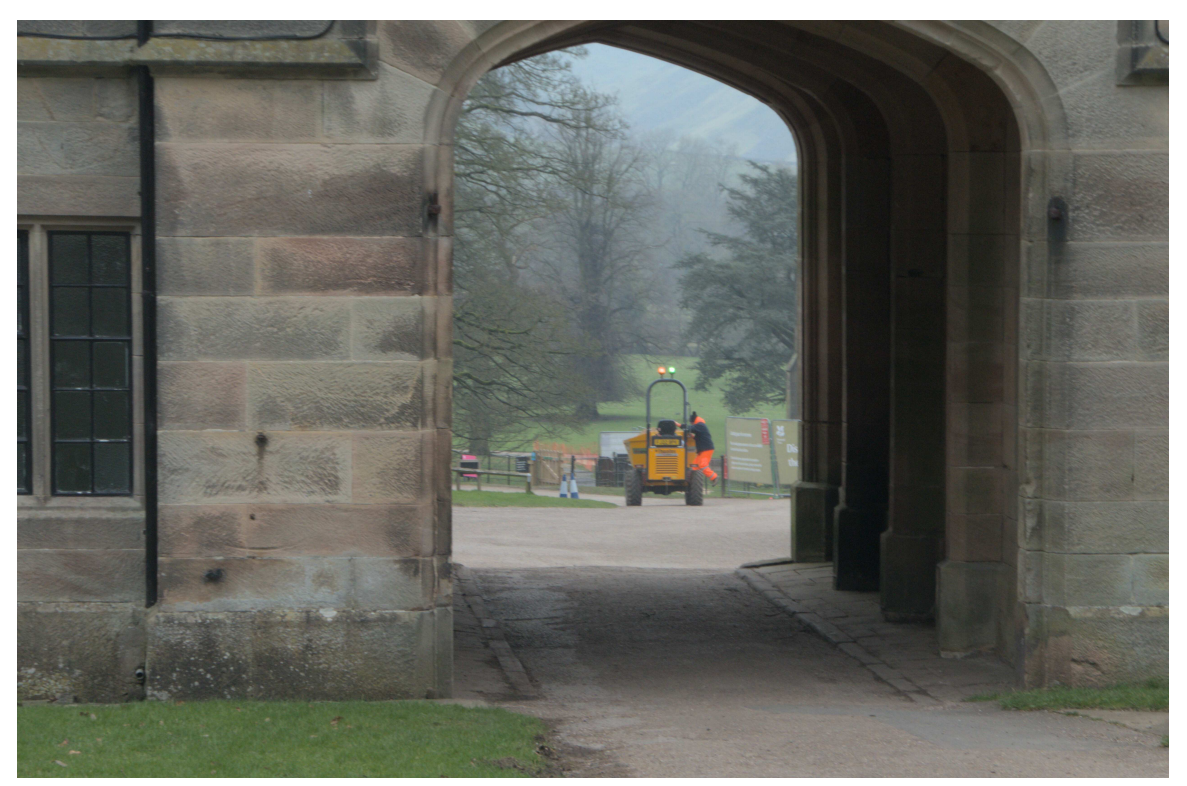
P1036125 - Ilam Hall.