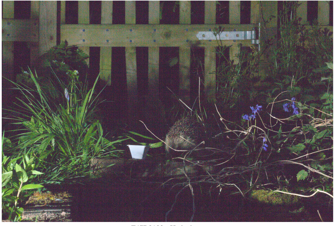
F47B8182 - Hedgehog.