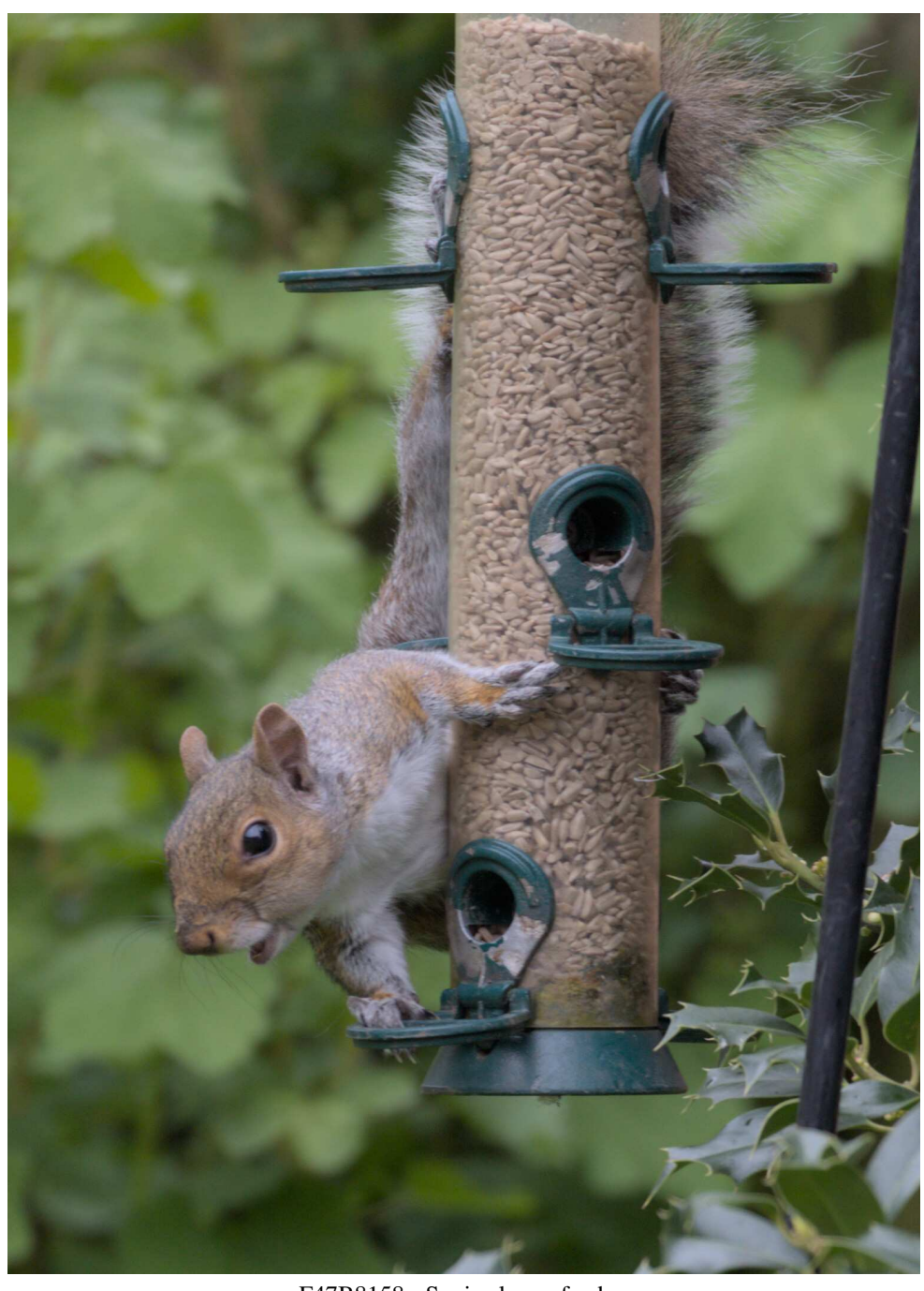
F47B8158 - Squirrel on a feeder.