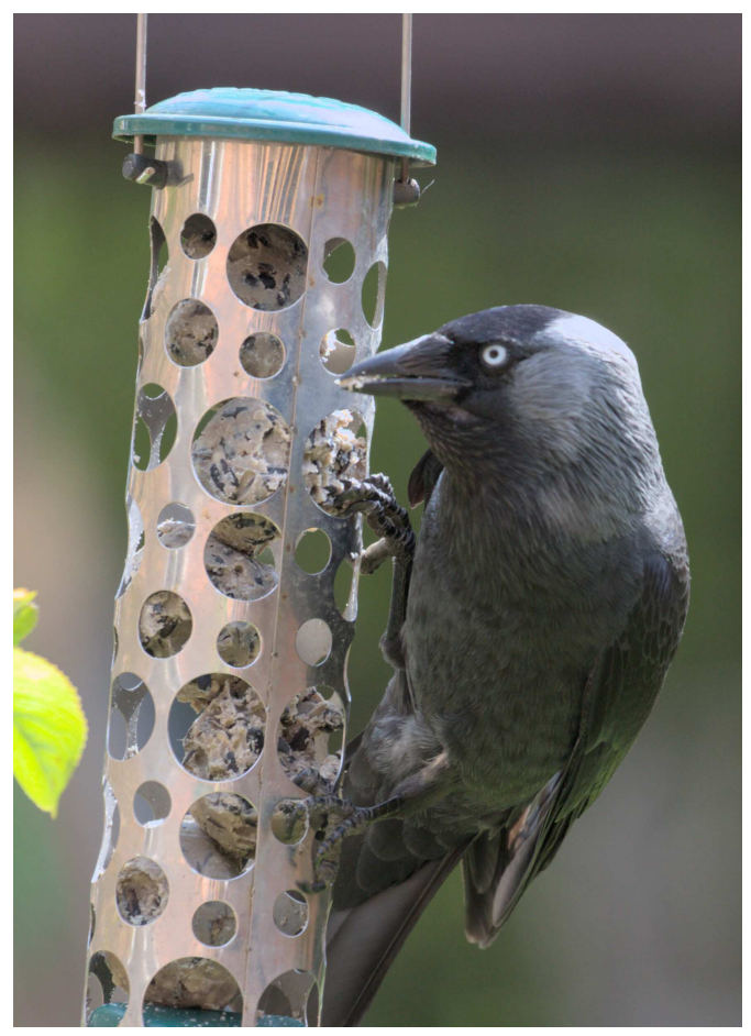
F47B8167 - Jackdaw on a feeder.