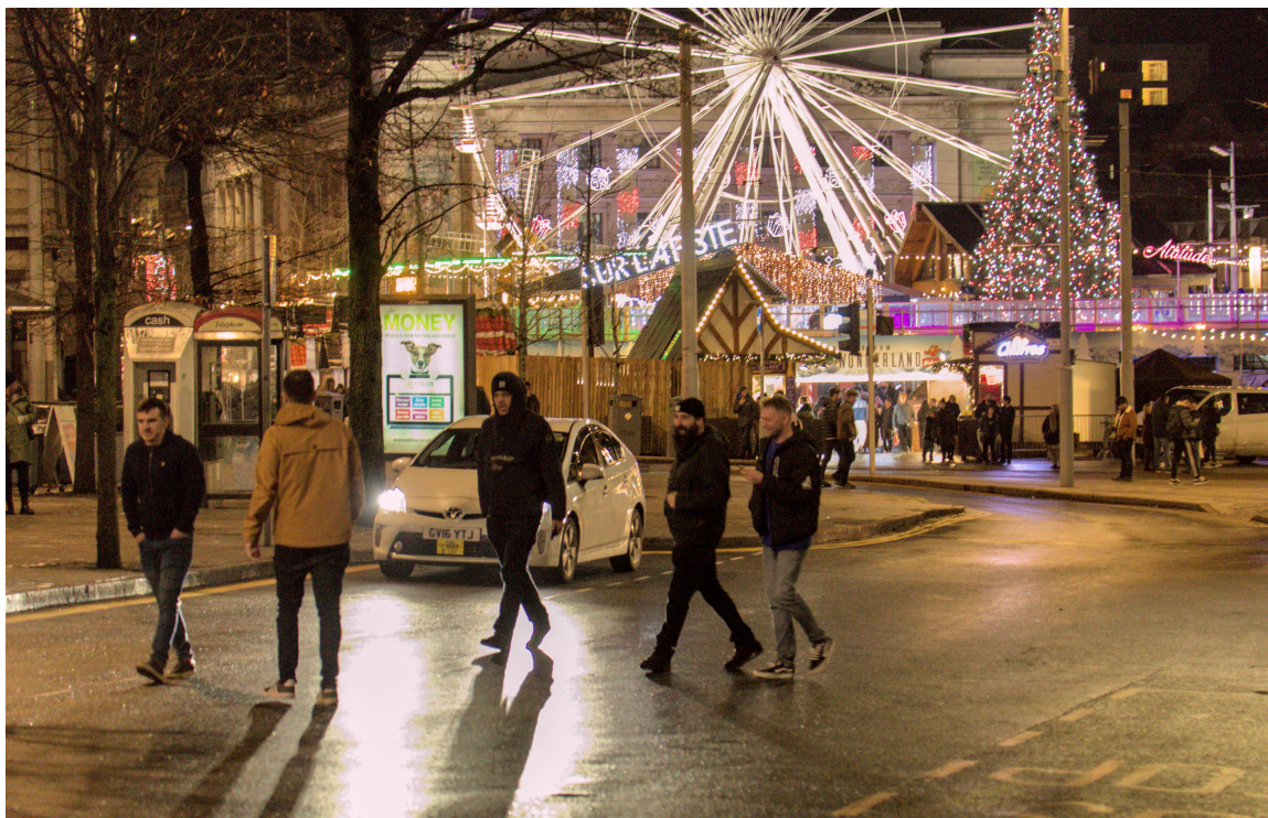
F47B5962 - Fairly right.