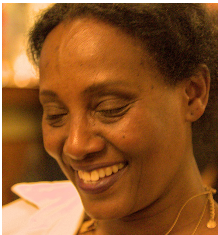
F47B6019 - Lady in bar.