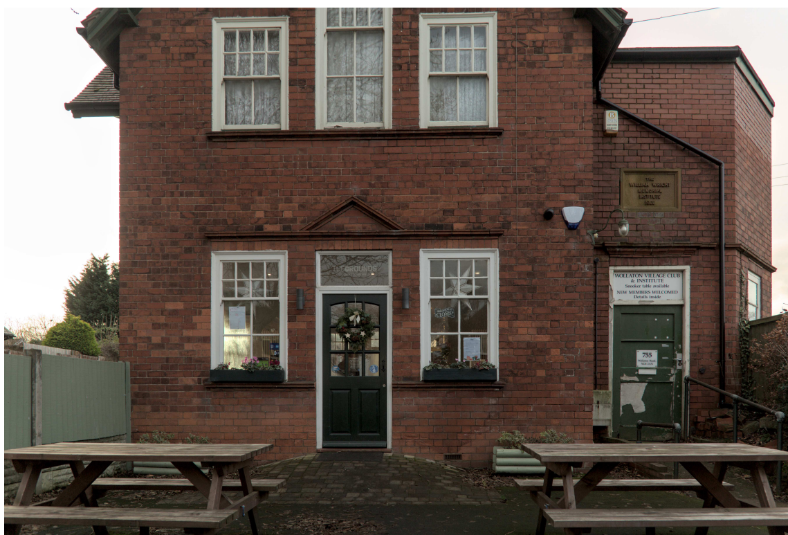
F47B5993 - Village Club.