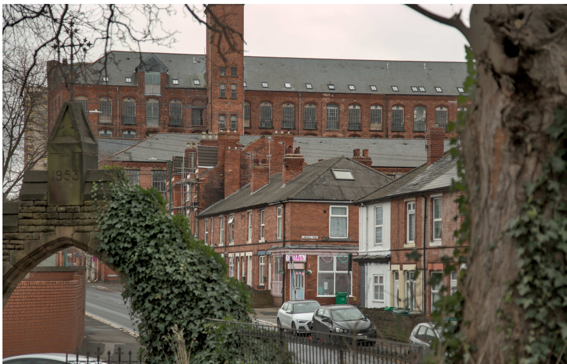
F47B5986 - Cotton Mills.