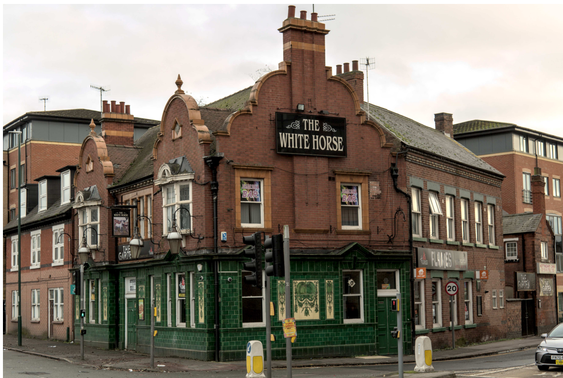
F47B5991 - The White Horse.