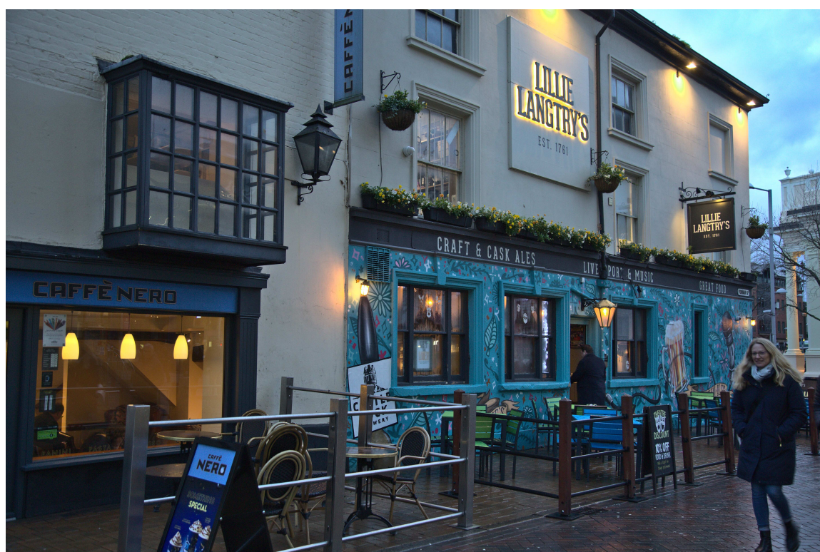
F47B5939 - The Peach Tree.