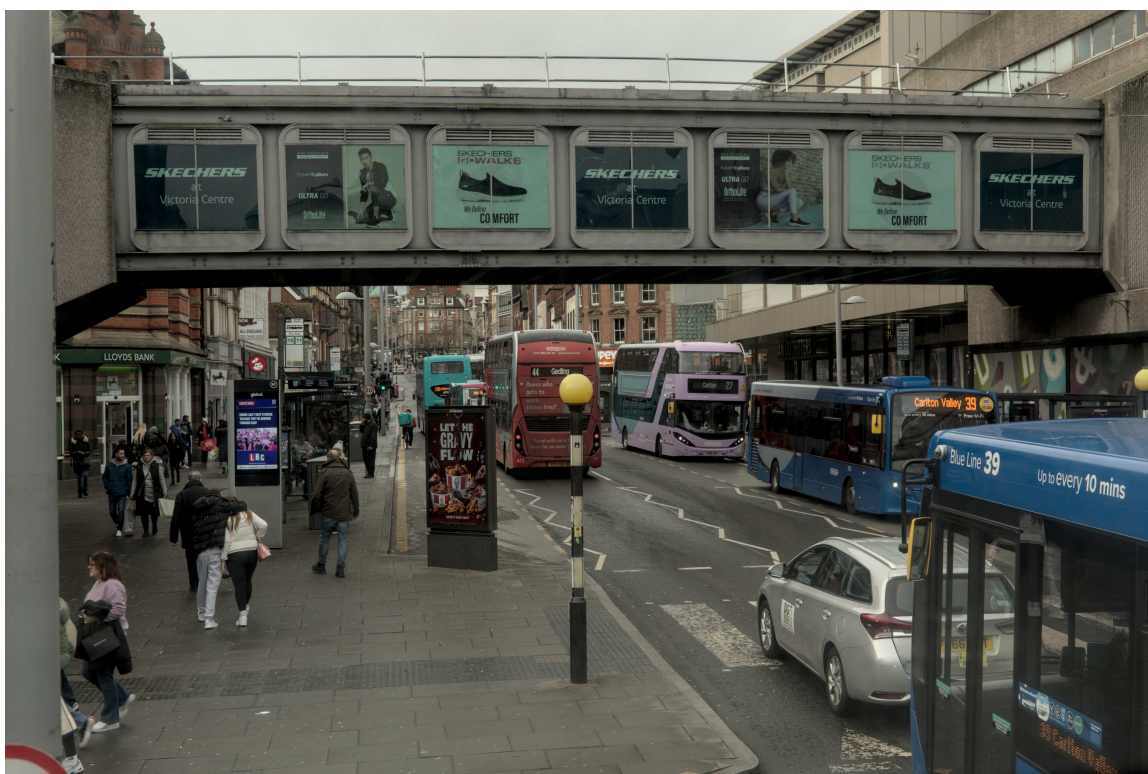
F47B5970 - On the buses.