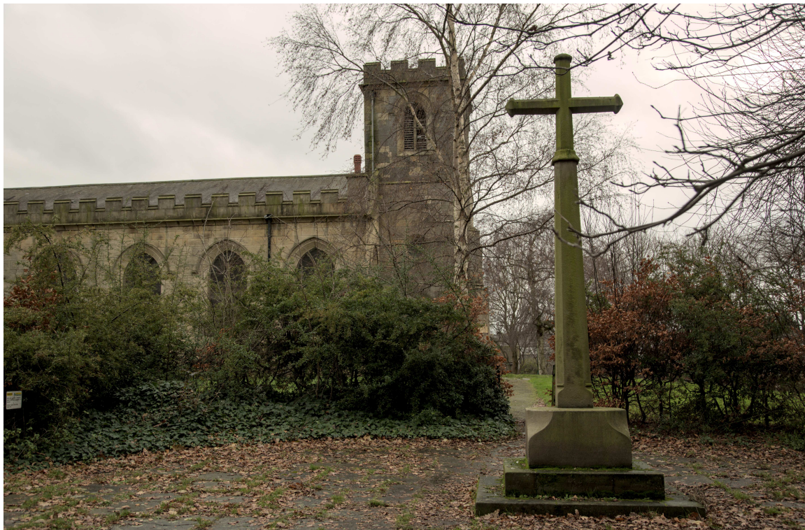
F47B5982 - St. Peter's Church.