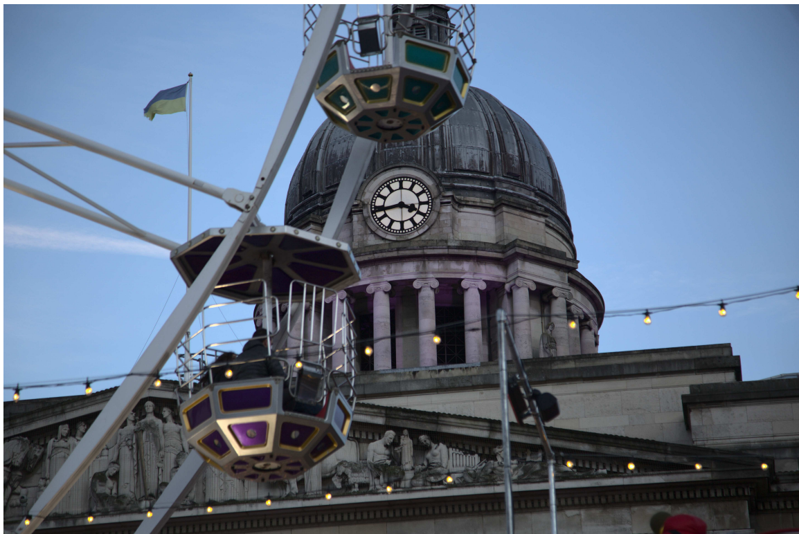
F47B5930 - Fair Council.

F47B5996 20221230 14:33:15 Village Club. F47B5997 20221230 14:34:39 Village Club. F47B5999 20221230 14:37:59 Admiral Rodney. F47B6001 20221230 16:04:16 Terraced housing. F47B6002 20221230 16:04:56 Terraced housing. F47B6004 20221230 16:05:25 Terraced housing. F47B6006 20221230 16:07:00 Terraced housing. F47B6009 20221231 20:49:36 Sings well. F47B6010 20221231 20:56:07 Sings well. F47B6011 20221231 21:03:14 Saturday Night. F47B6012 20221231 22:11:00 Sings well. F47B6014 20221231 22:53:29 Lady in bar. F47B6018 20221231 22:55:26 Lady in bar. F47B6019 20221231 22:56:17 Lady in bar. F47B6020 20221231 22:56:26 Lady in bar. F47B6021 20221231 23:03:51 At the bar. F47B6022 20221231 23:04:05 At the bar. F47B6023 20221231 23:21:54 Sings well. F47B6024 20221231 23:35:00 Sings well.