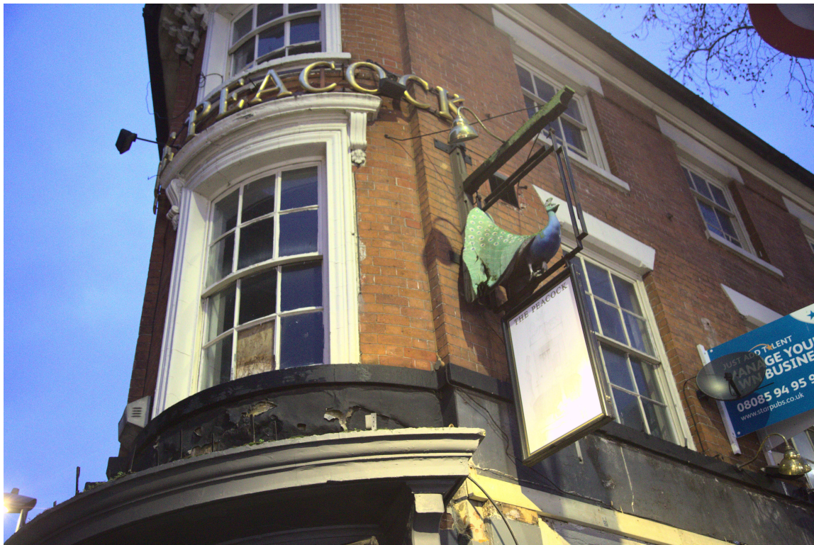
F47B5943 - The Peacock.