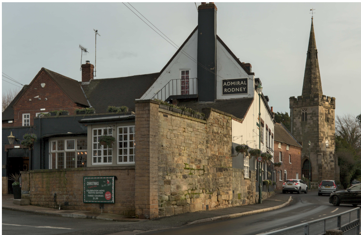
F47B5999 - Admiral Rodney.