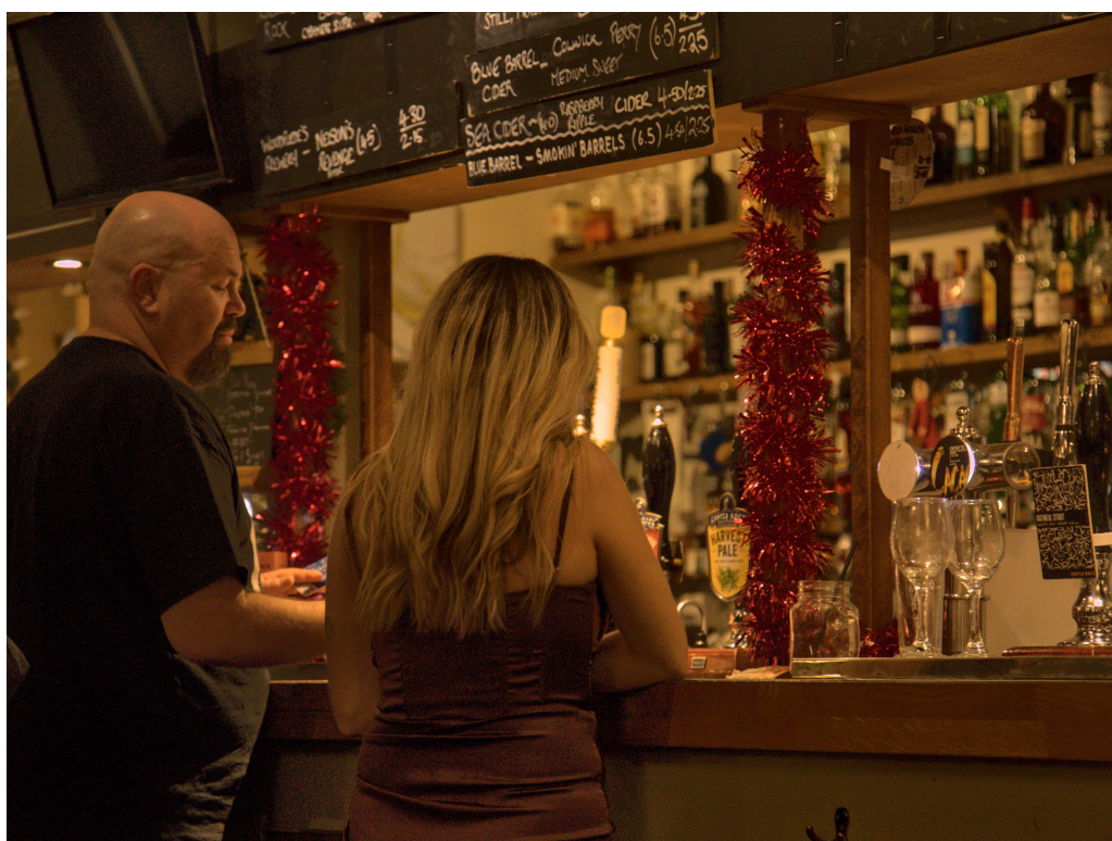
F47B6021 - At the bar.