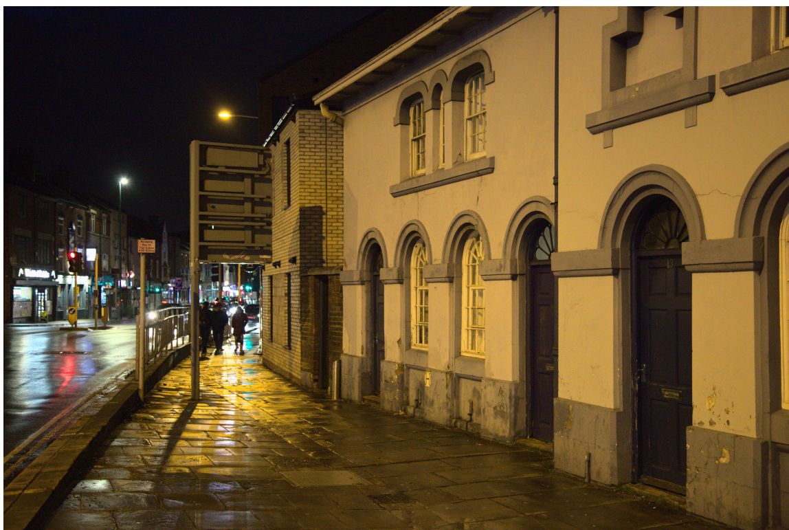
F47B5951 - Dead centre.