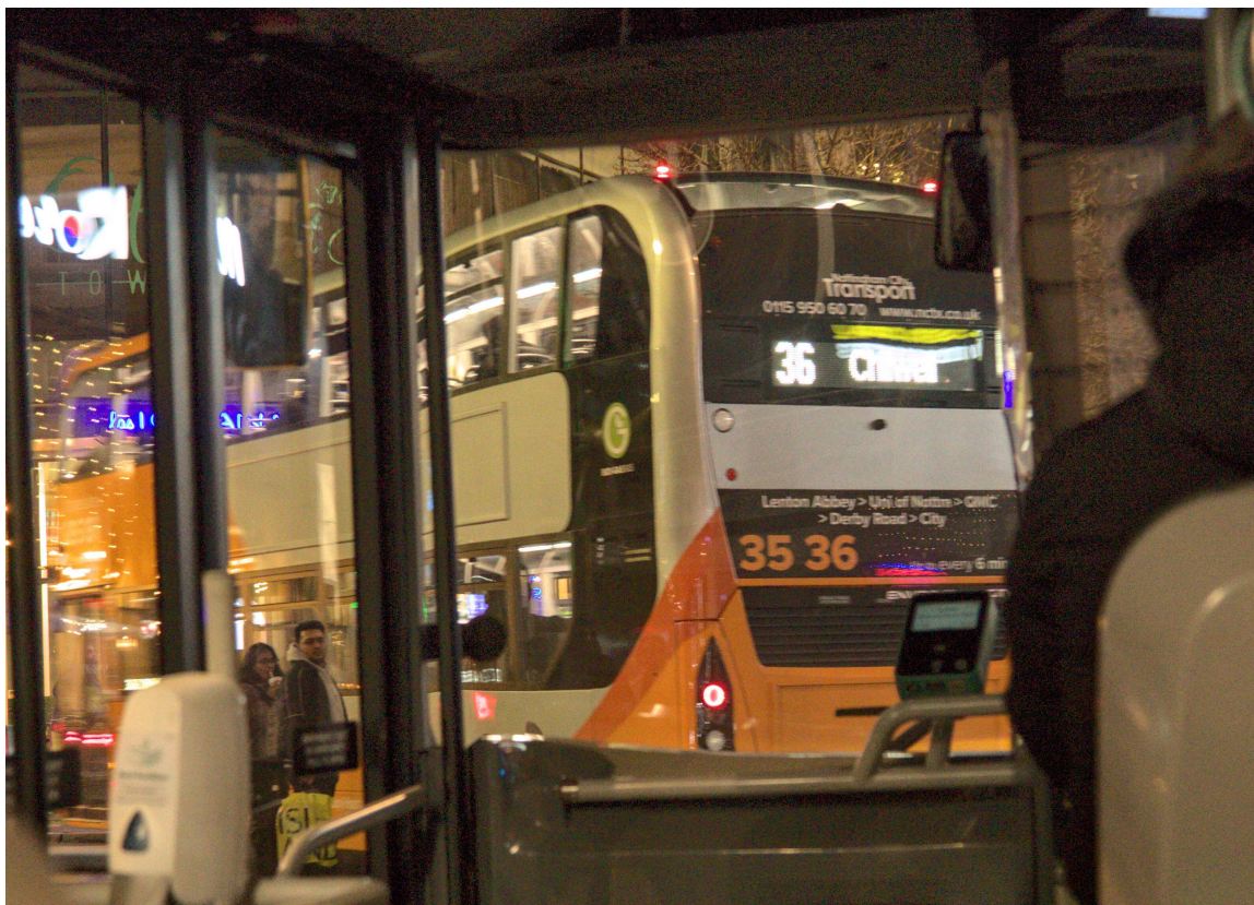
F47B5966 - On the buses.