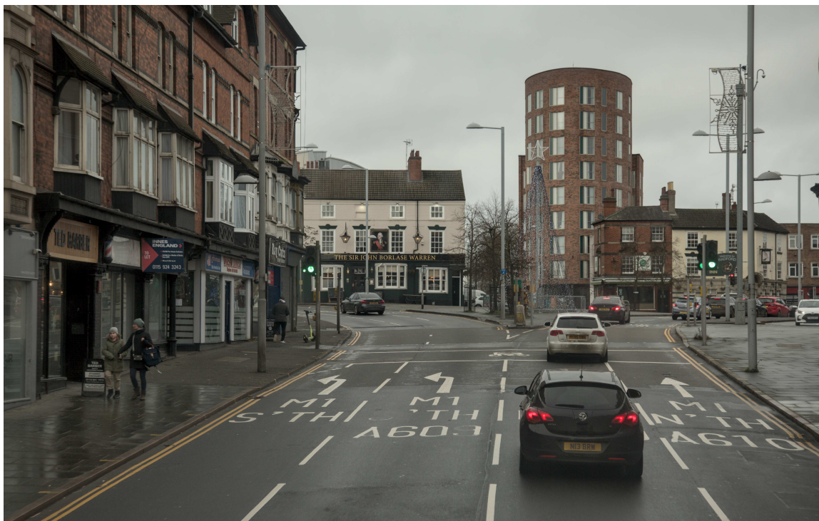
F47B5977 - Canning Circus.