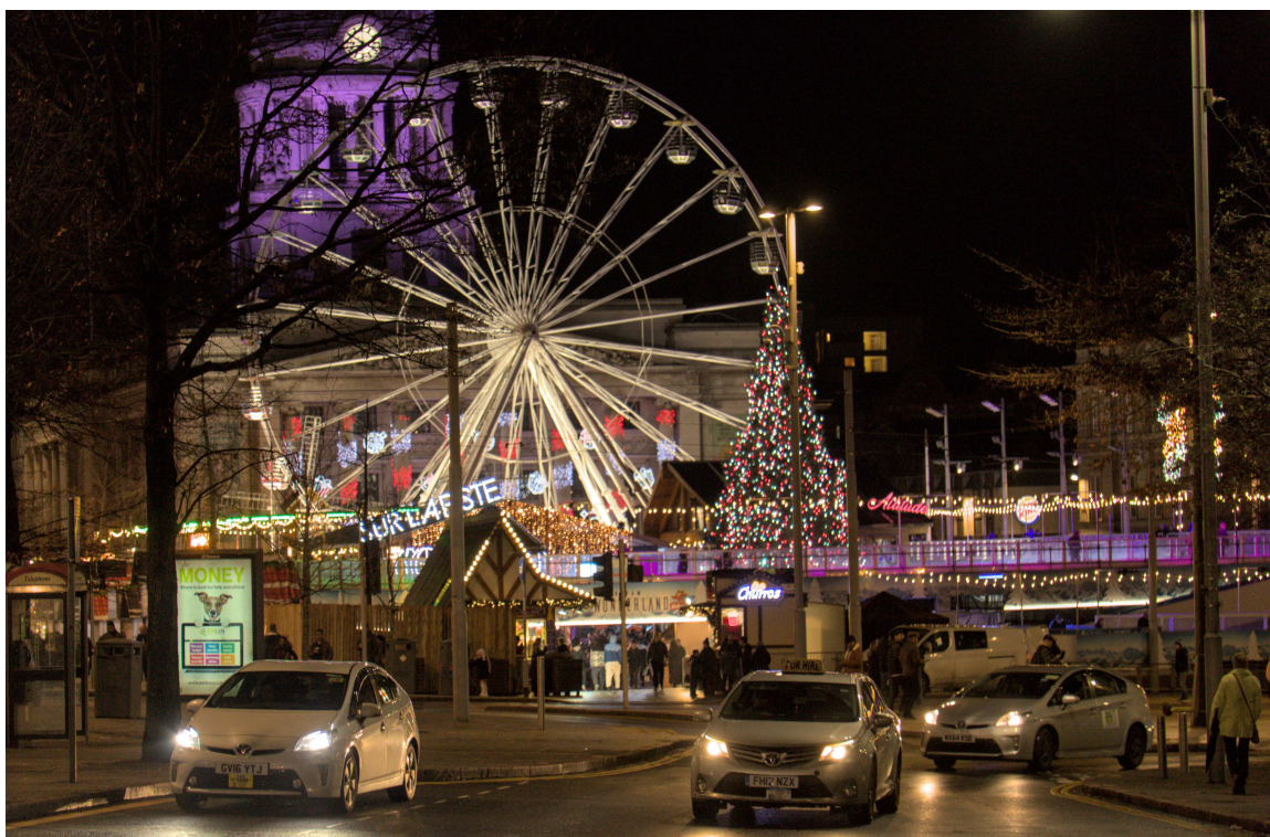
F47B5963 - Fairly right.