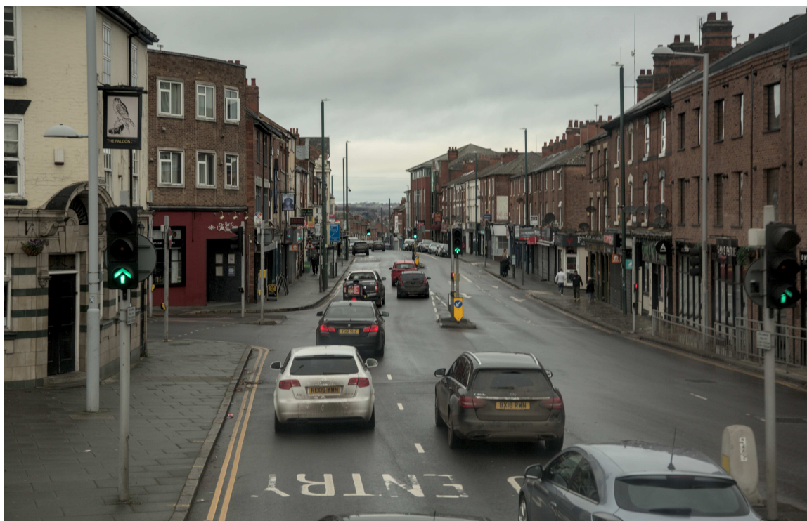
F47B5980 - Alferton Road.