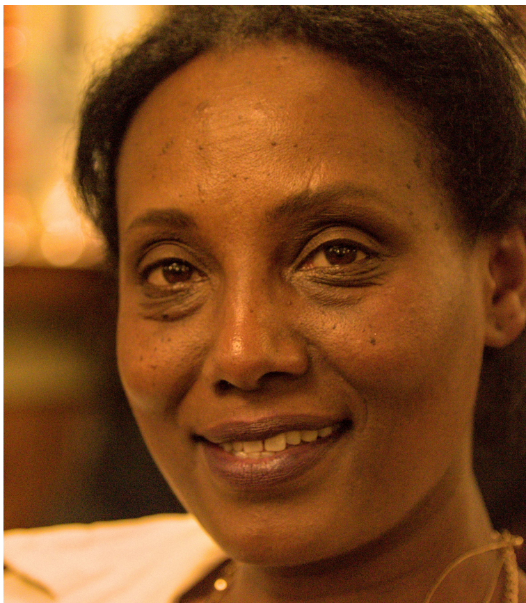
F47B6020 - Lady in bar.