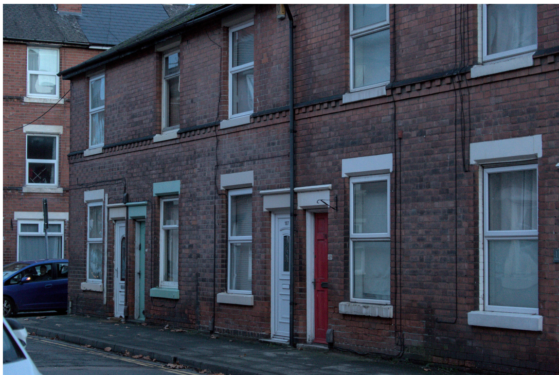
F47B6004 - Terraced housing.