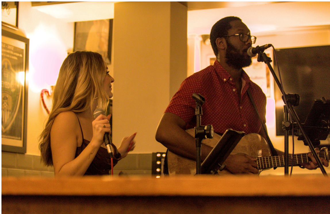
F47B6009 - Sings well.