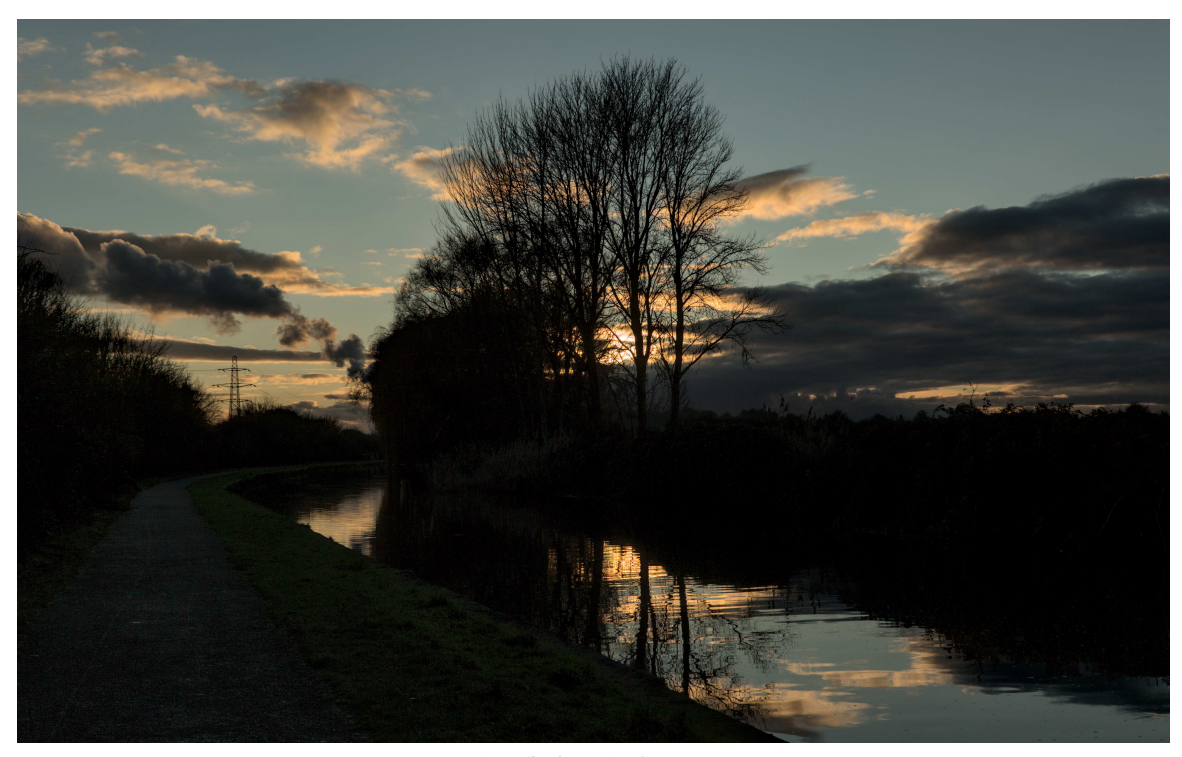
F47B6060 - Setting sun.