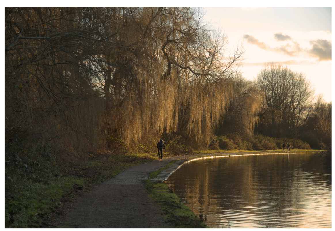
F47B6057 - Sunlit willows.