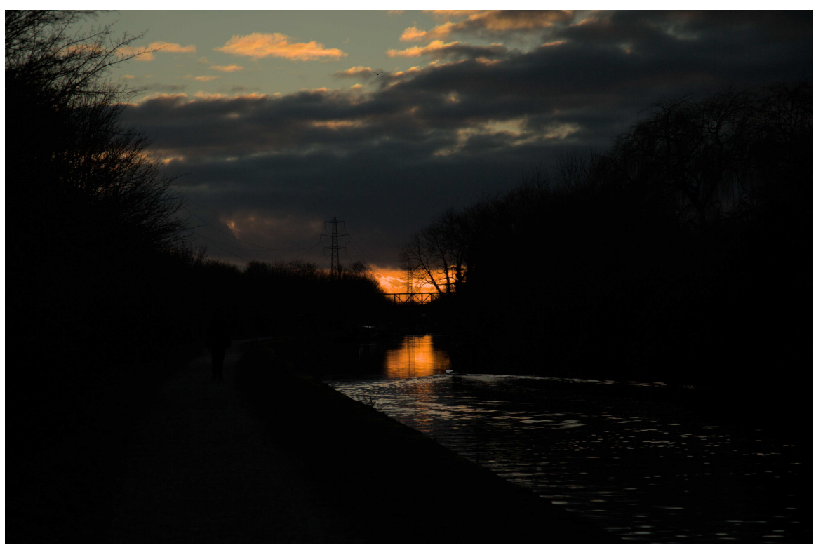
F47B6072 - Canal sunset.