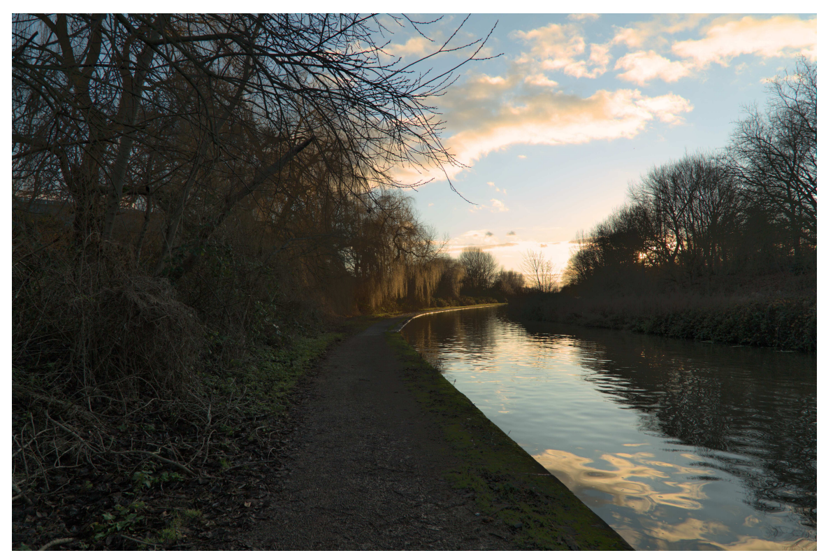
F47B6054 - Nottingham Canal.