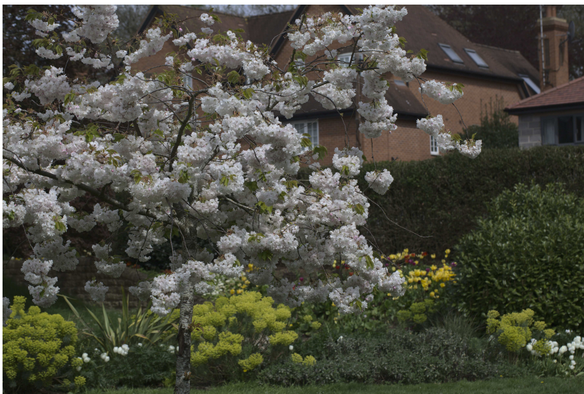
F47B6494 - White blossom in memoriam.