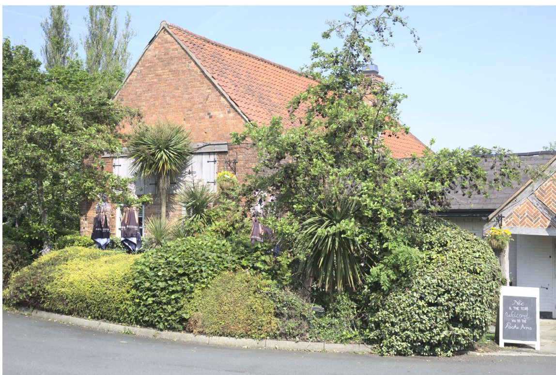
F47B6536 - Packe Arms.