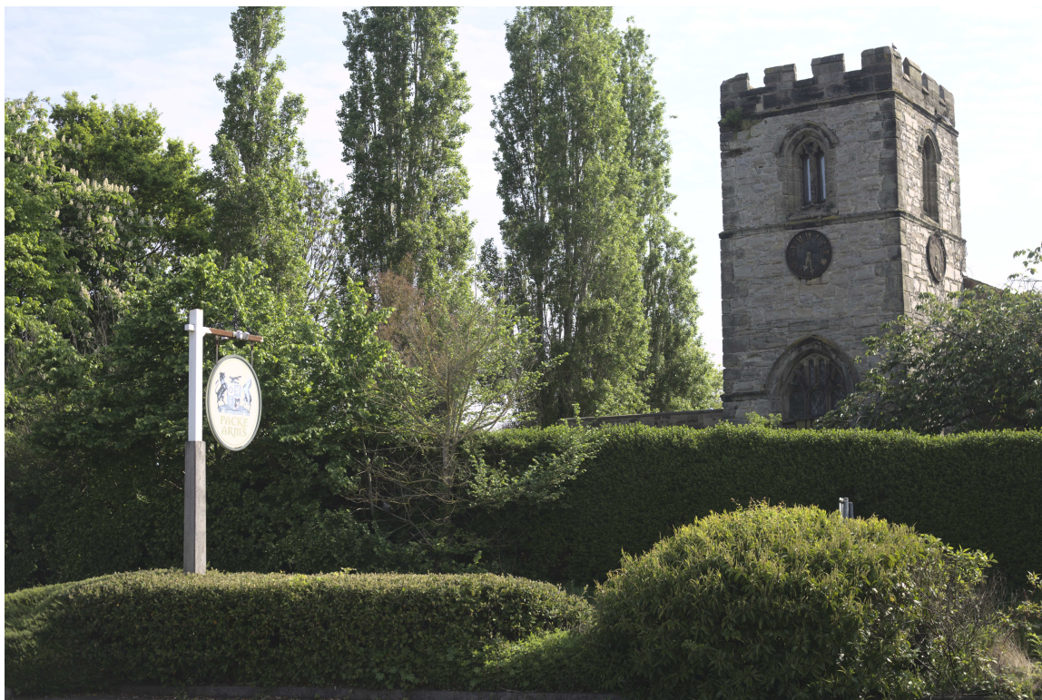
F47B6535 - Faith abandoned.