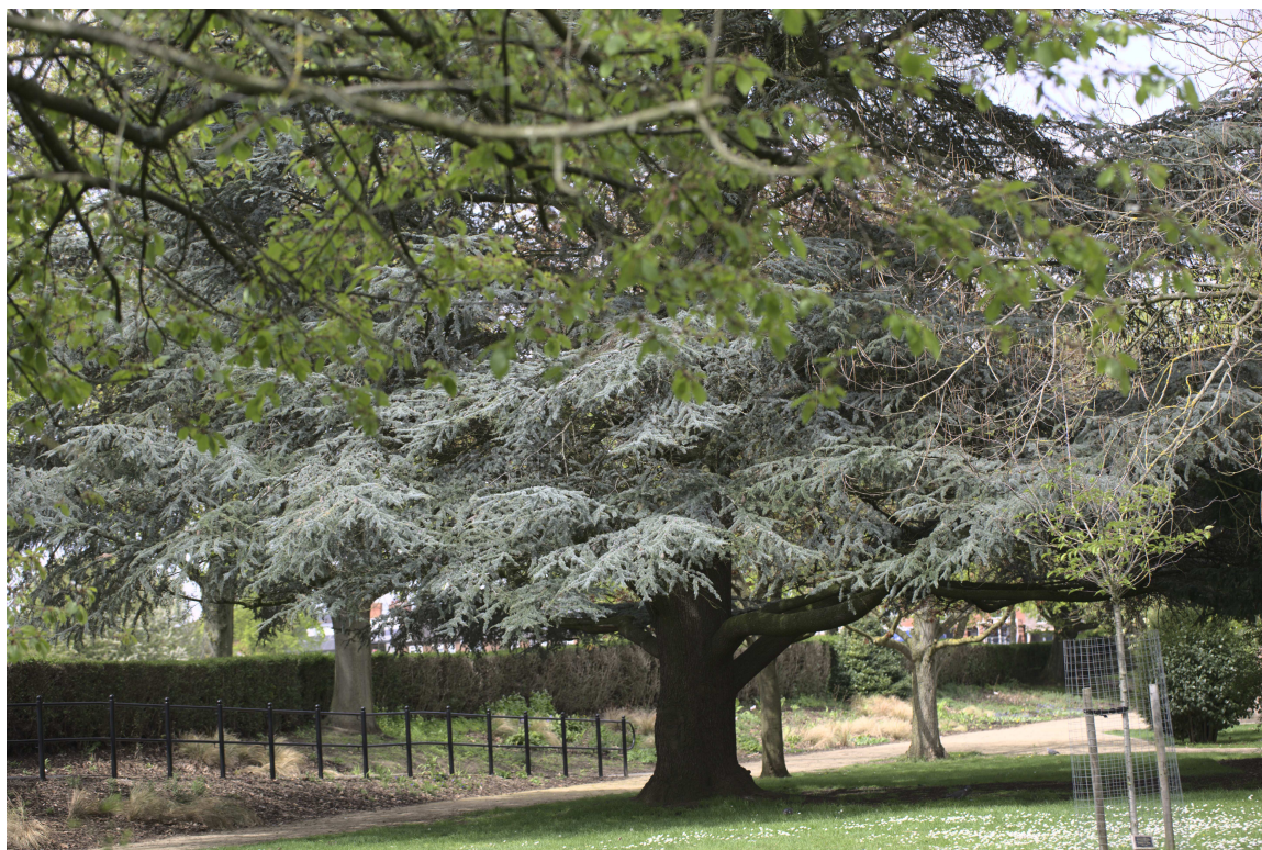
F47B6473 - Shades of green.

F47B6502 20230514 14:12:16 Lady Bay Arts Trail. F47B6503 20230514 14:30:23 Lady Bay Arts Trail. F47B6506 20230517 09:13:20 Great Tit. F47B6507 20230517 09:13:22 Great Tit. F47B6528 20230517 12:14:53 Wood Pigeon. F47B6534 20230518 08:43:37 From Packe Arms car park. F47B6535 20230518 08:44:16 Faith abandoned. F47B6536 20230518 08:44:41 Packe Arms. F47B6537 20230518 08:45:05 Packe Arms. F47B6538 20230518 09:59:36 The Anchor. F47B6539 20230518 10:00:34 The Green. F47B6540 20230518 10:00:56 A cottage.