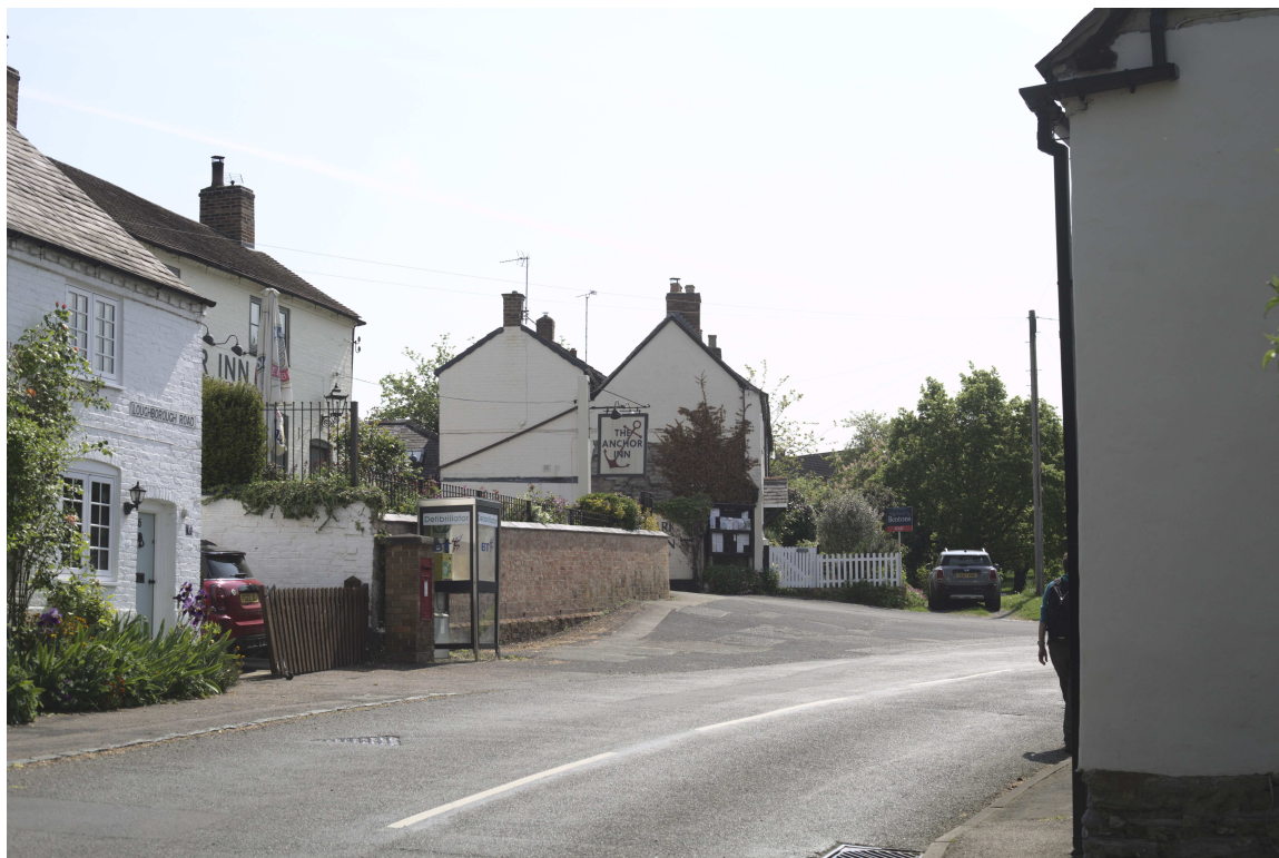
F47B6538 - The Anchor.