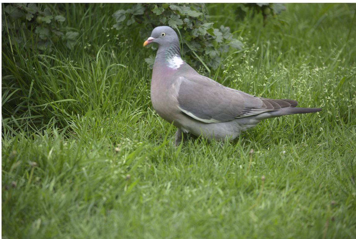
F47B6528 - Wood Pigeon.