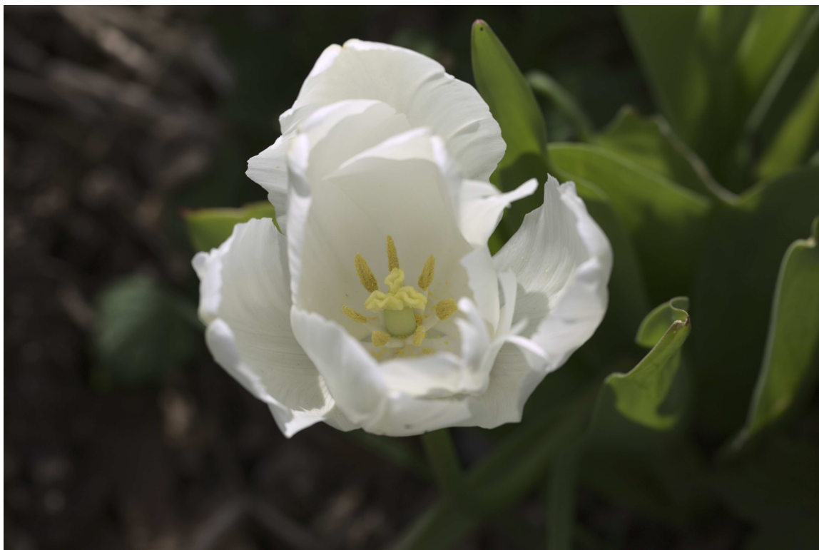
F47B6488 - White tulip.