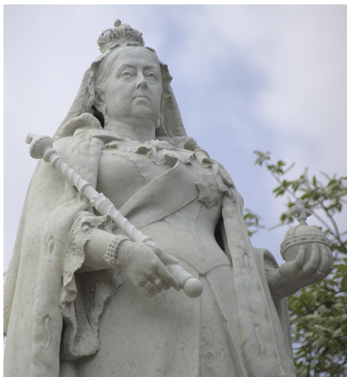
F47B6482 - Renovated.