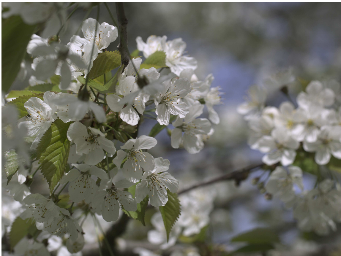
F47B6472 - May blossom.