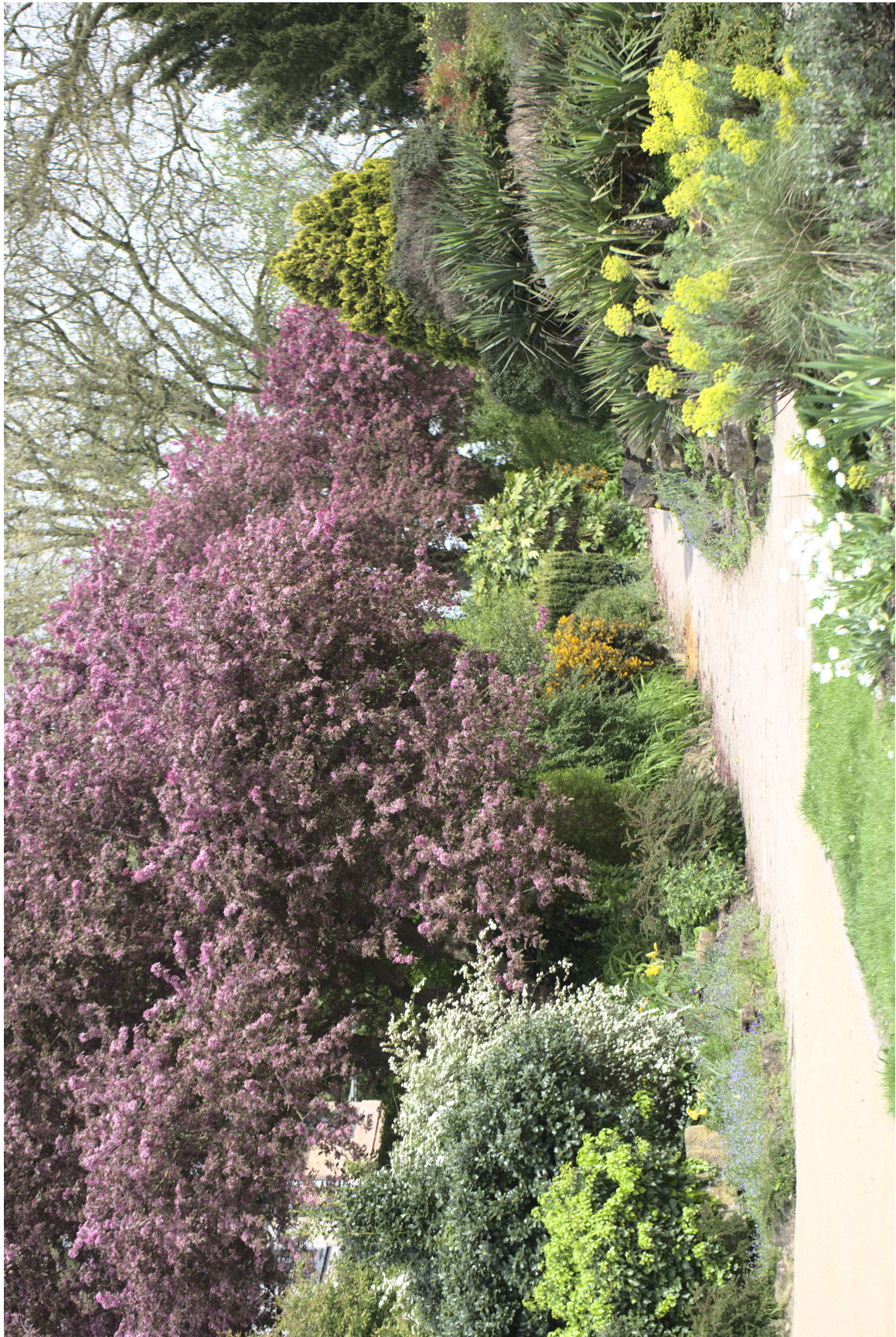
F47B6493 - Stunning.