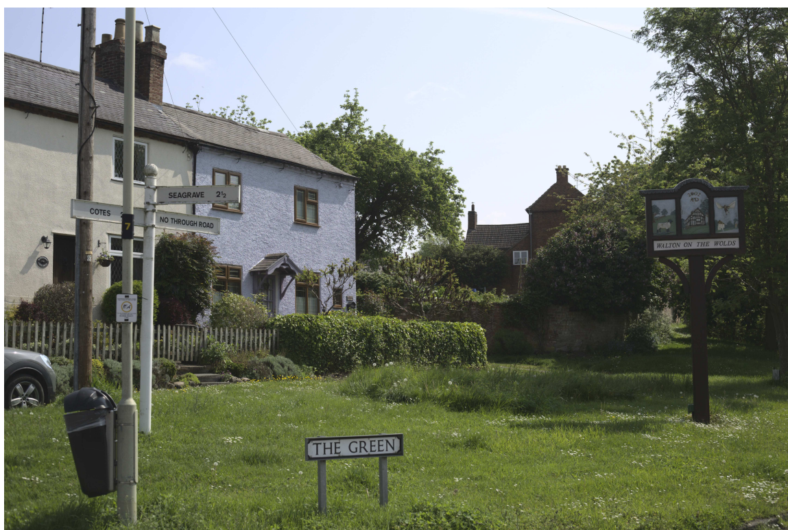
F47B6539 - The Green.