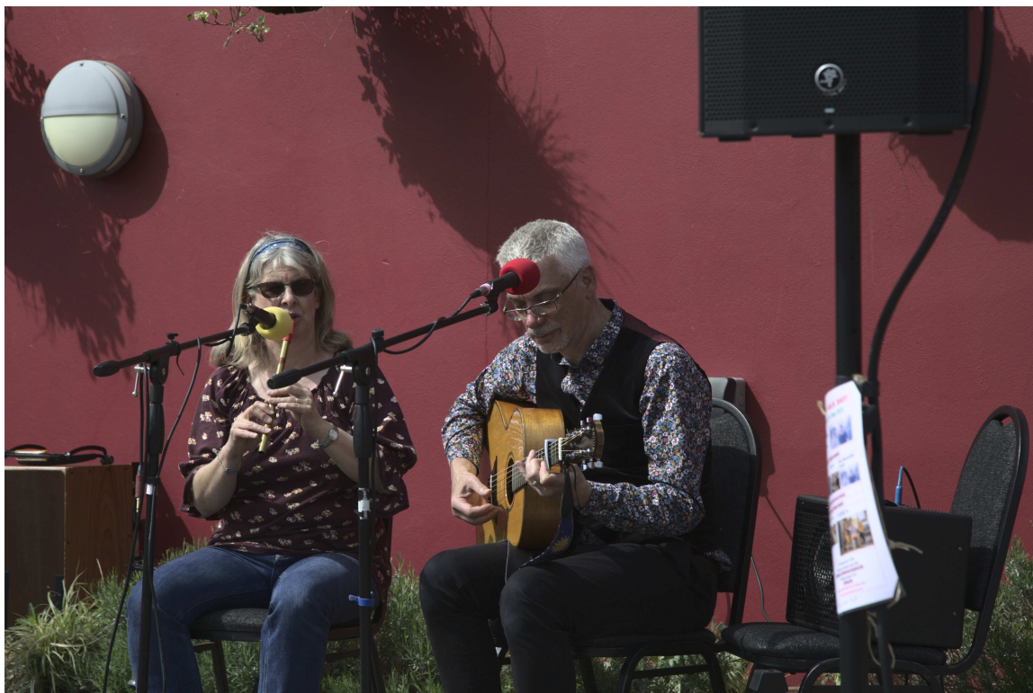
F47B6501 - Lady Bay Arts Trail.