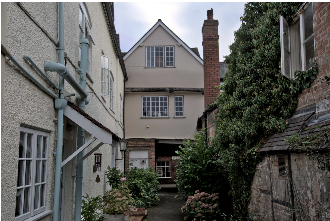
F47B7338 - Yard.