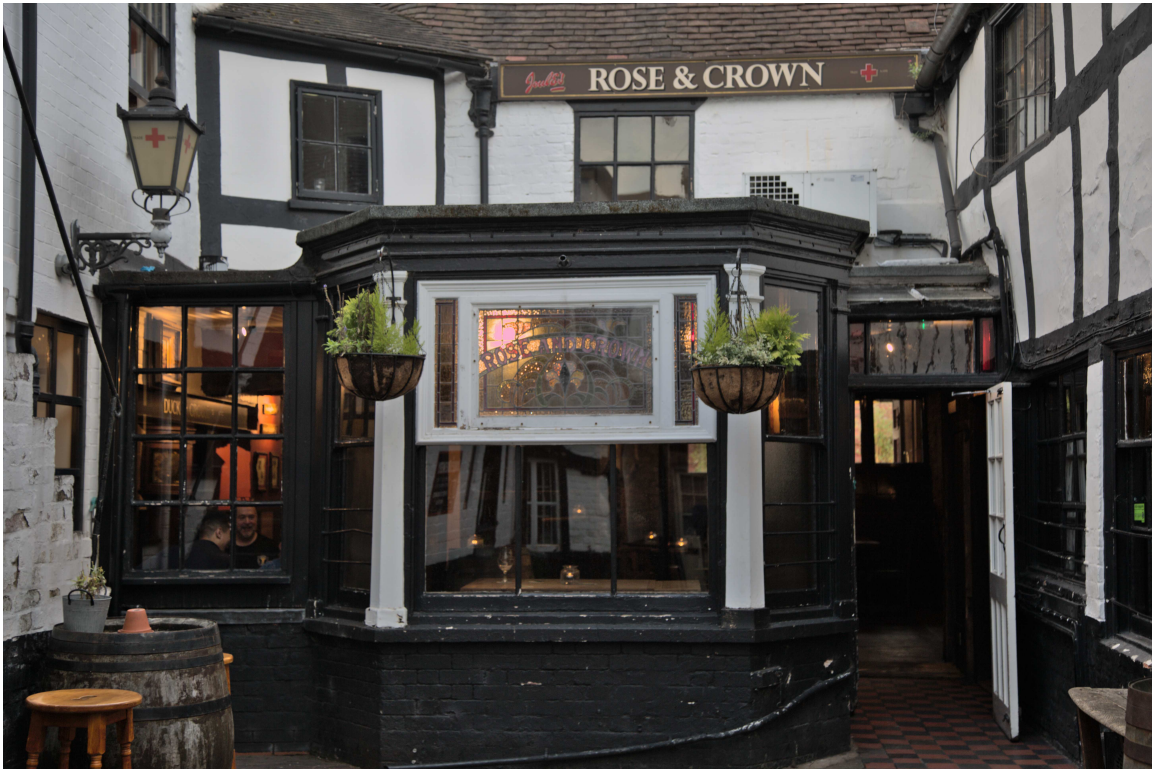
F47B7327 - Rose & Crown.