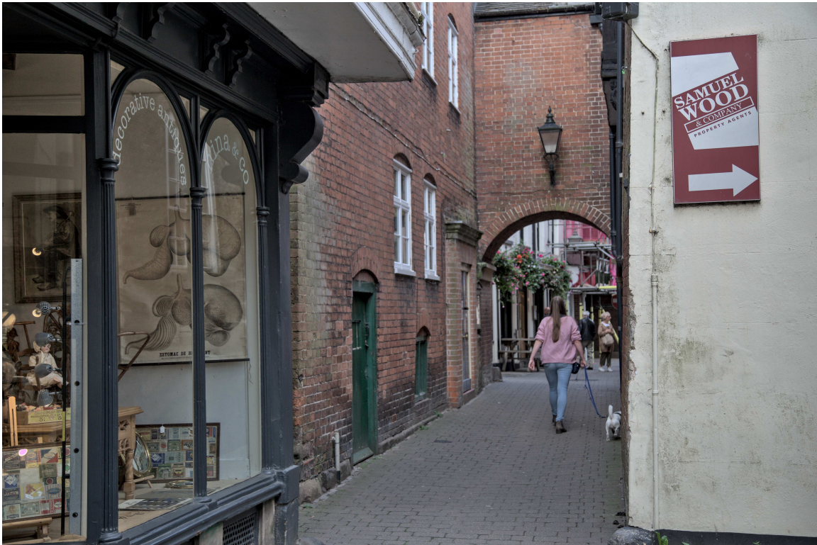
F47B7339 - Church Street.