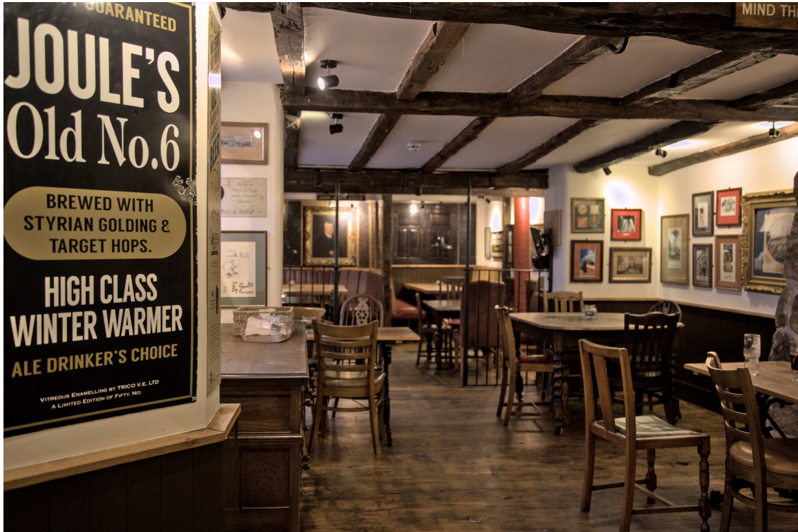
F47B7332 - Rose & Crown.