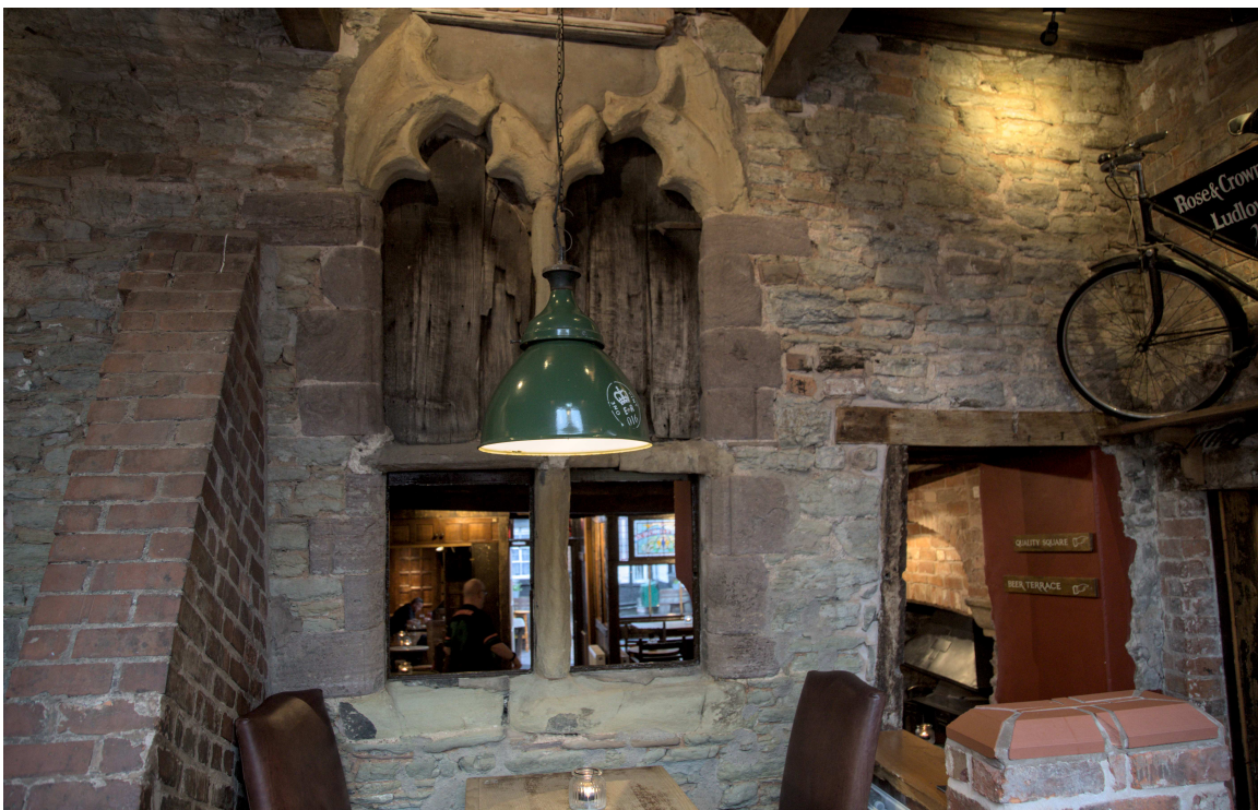
F47B7329 - Rose & Crown.