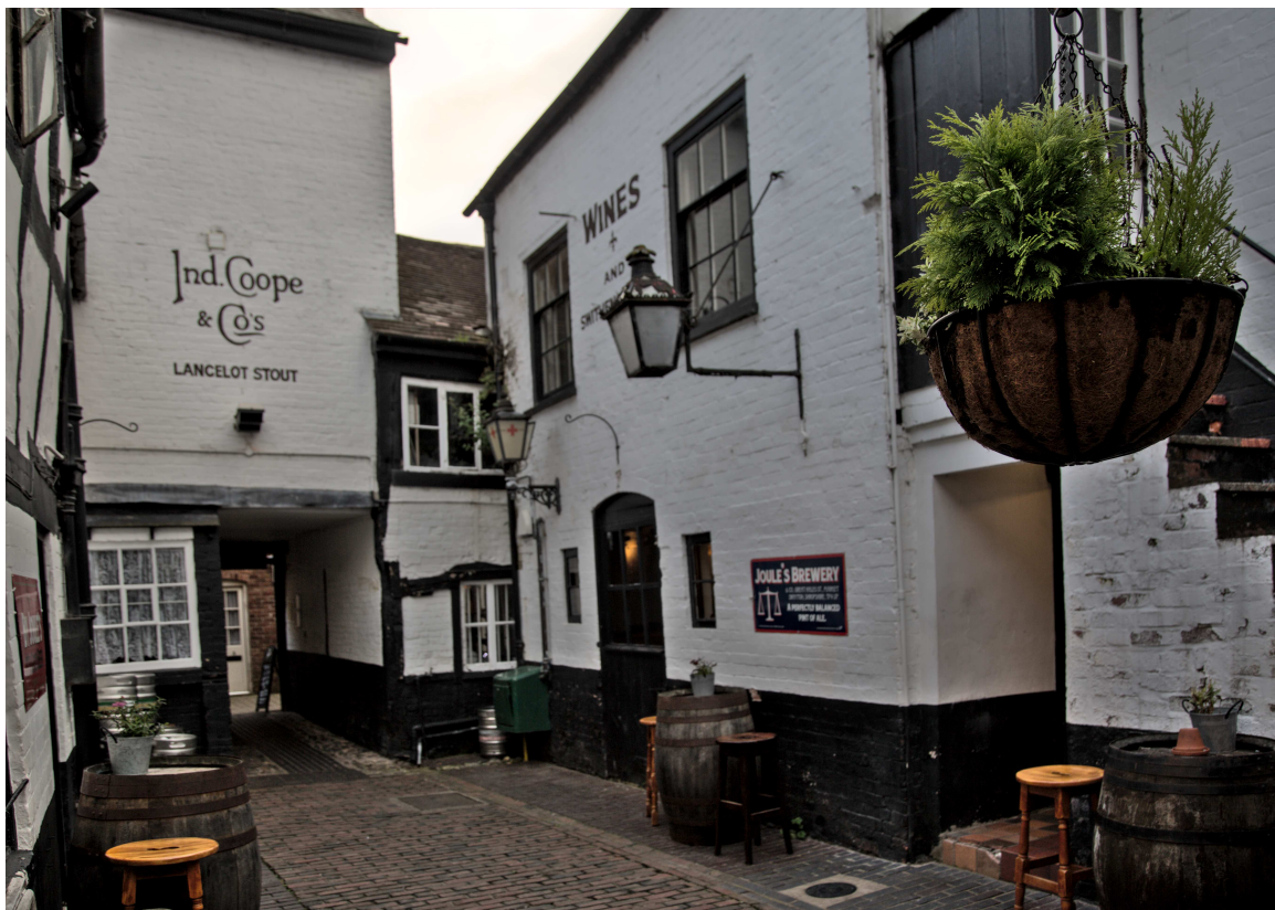
F47B7334 - Rose & Crown.