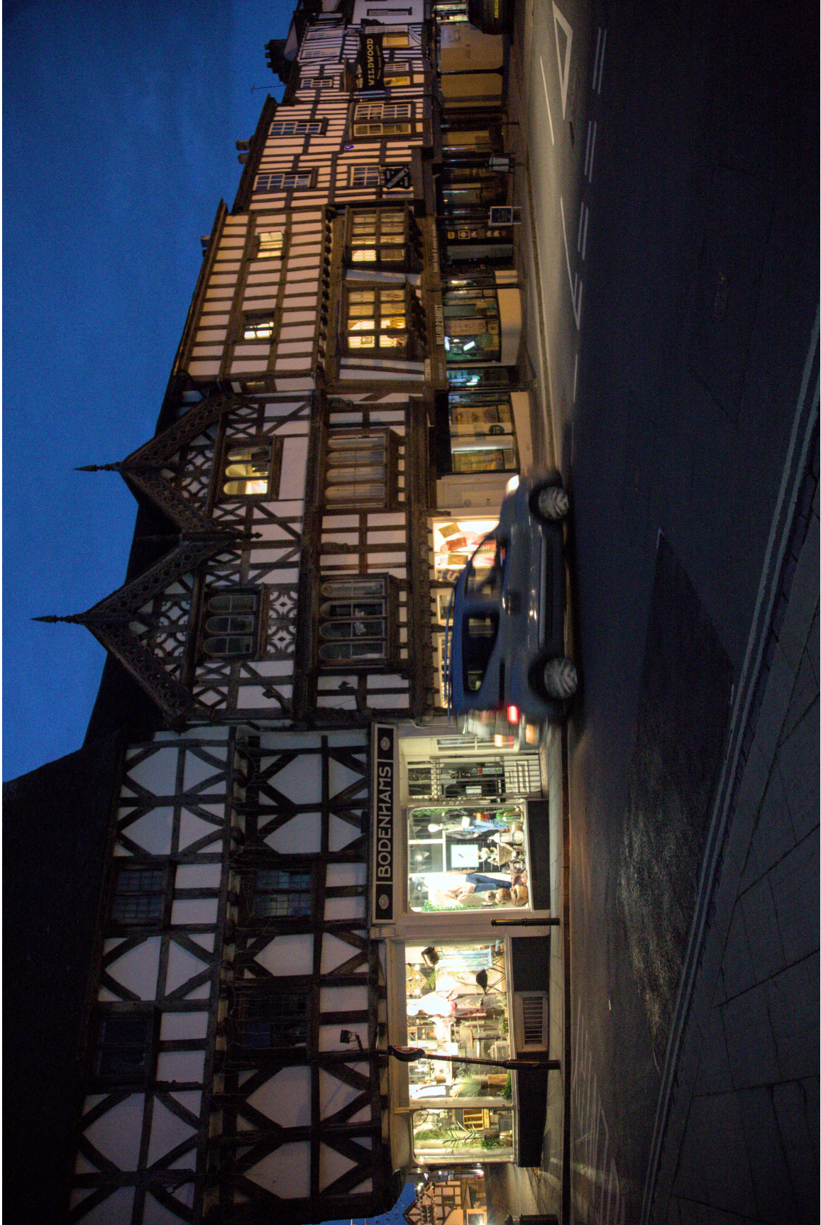
F47B7346 - Broad Street.