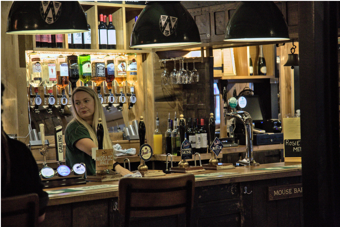
F47B7335 - The barmaid.