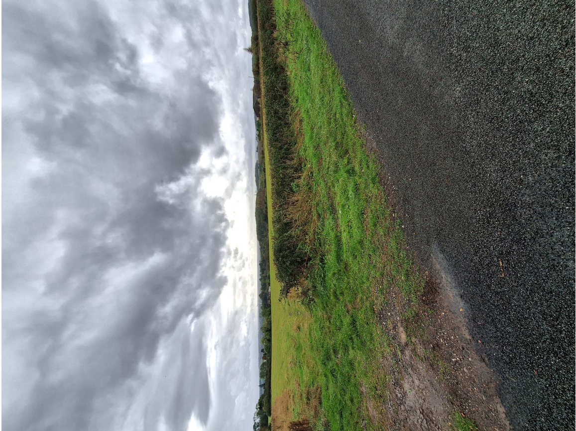
20231019_122428 - Country walk.