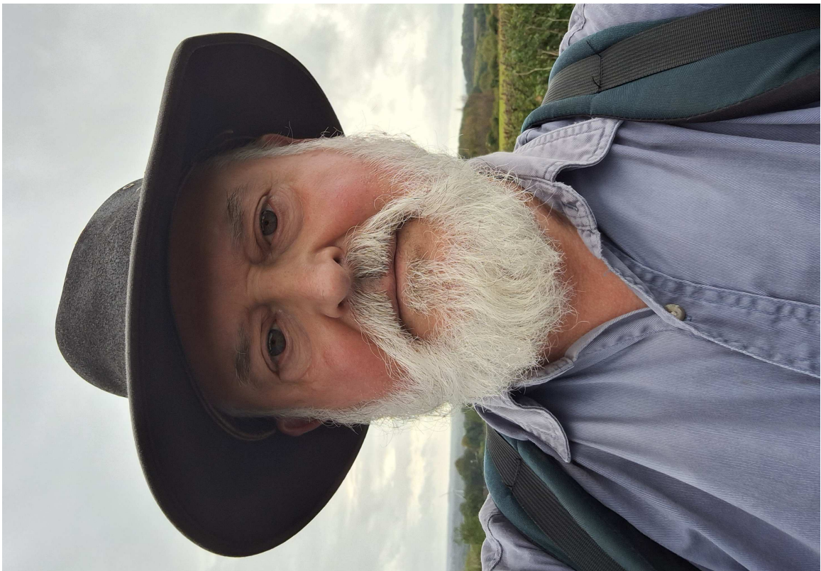
20231019_122512 - Self portrait on a country walk.