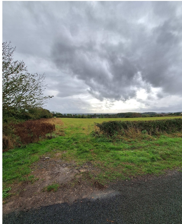
20231019_122419 - Country walk.