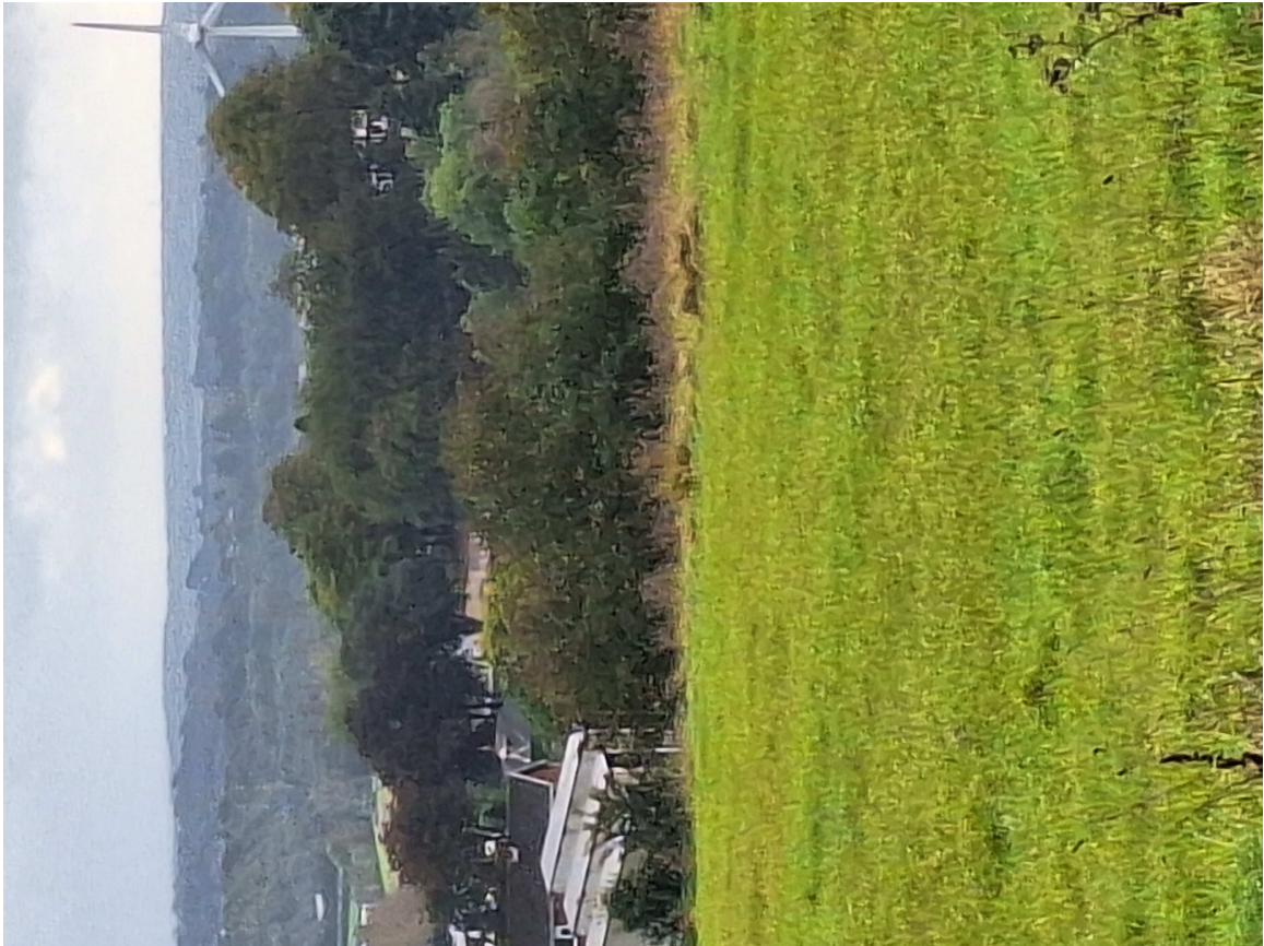
20231019_122733 - Country walk.