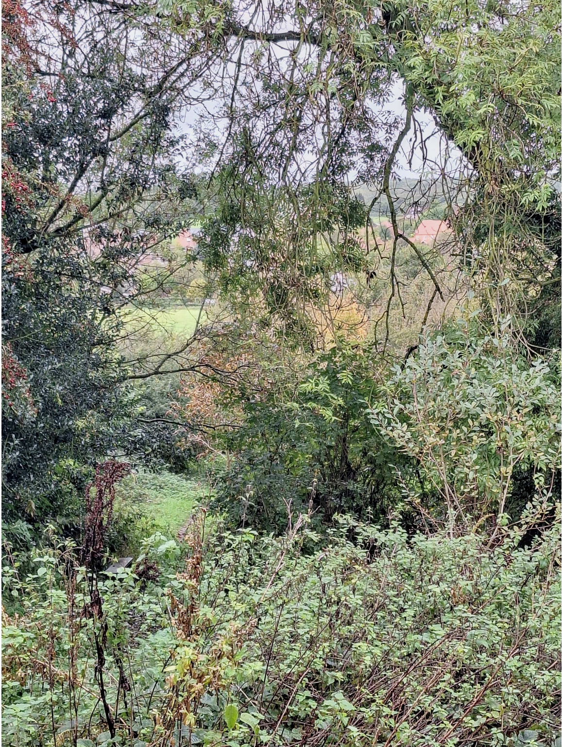
20231019_125258 - Dropping down to Lambley.