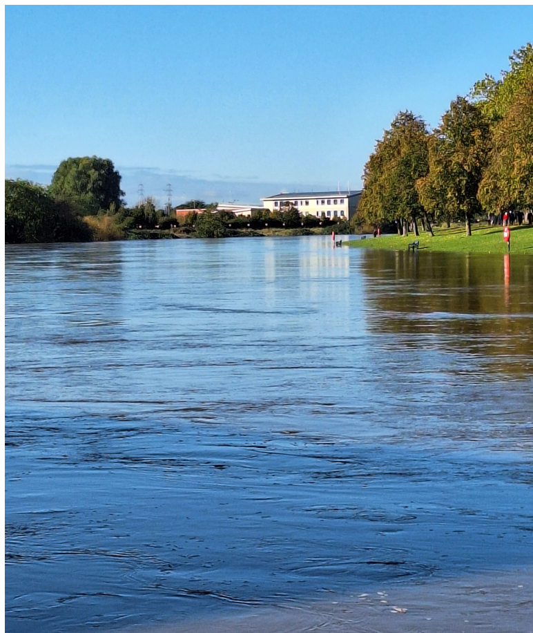
20231022_112035 - Looking West.