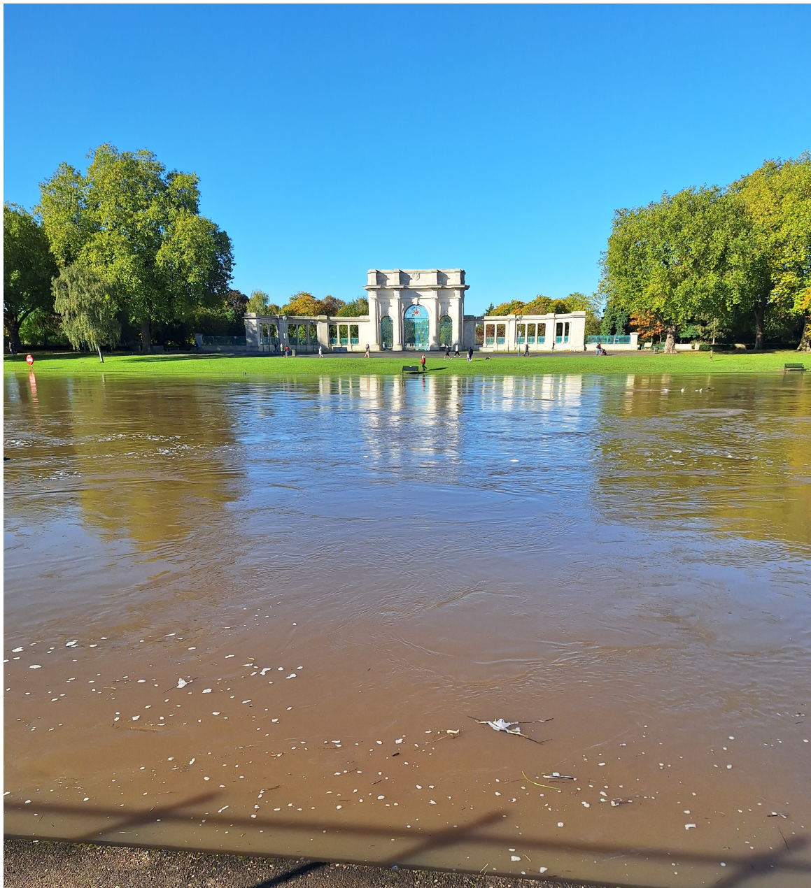
20231022_111248 - War Memorial.

20231022_122330 20231022 12:23:30 Kayaks. 20231022_122334 20231022 12:23:34 Through the arches. 20231022_122520 20231022 12:25:20 Kayaks. 20231022_122523 20231022 12:25:23 Kayaks. 20231022_122525 20231022 12:25:25 Kayak. 20231022_122528 20231022 12:25:28 Kayak. 20231022_122619 20231022 12:26:19 Wilford Suspension Bridge. 20231022_122620 20231022 12:26:20 Kayak. 20231022_122631 20231022 12:26:31 Beached. 20231022_122634 20231022 12:26:34 Beached.