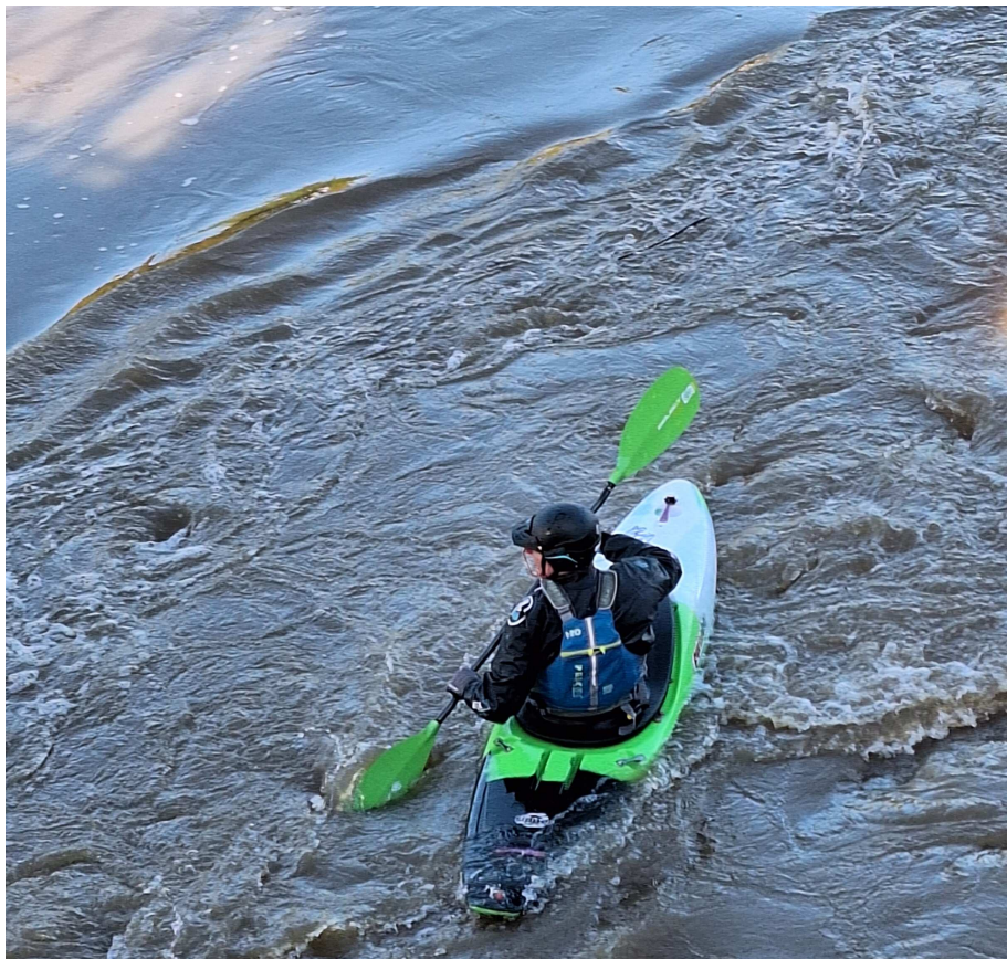
20231022_121951 - Kayak.