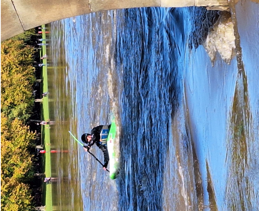
20231022_122525 - Kayak.