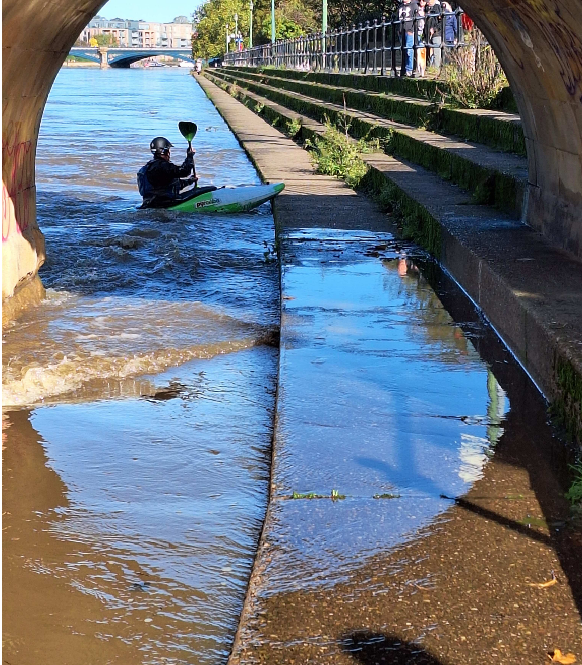
20231022_122631 - Beached.