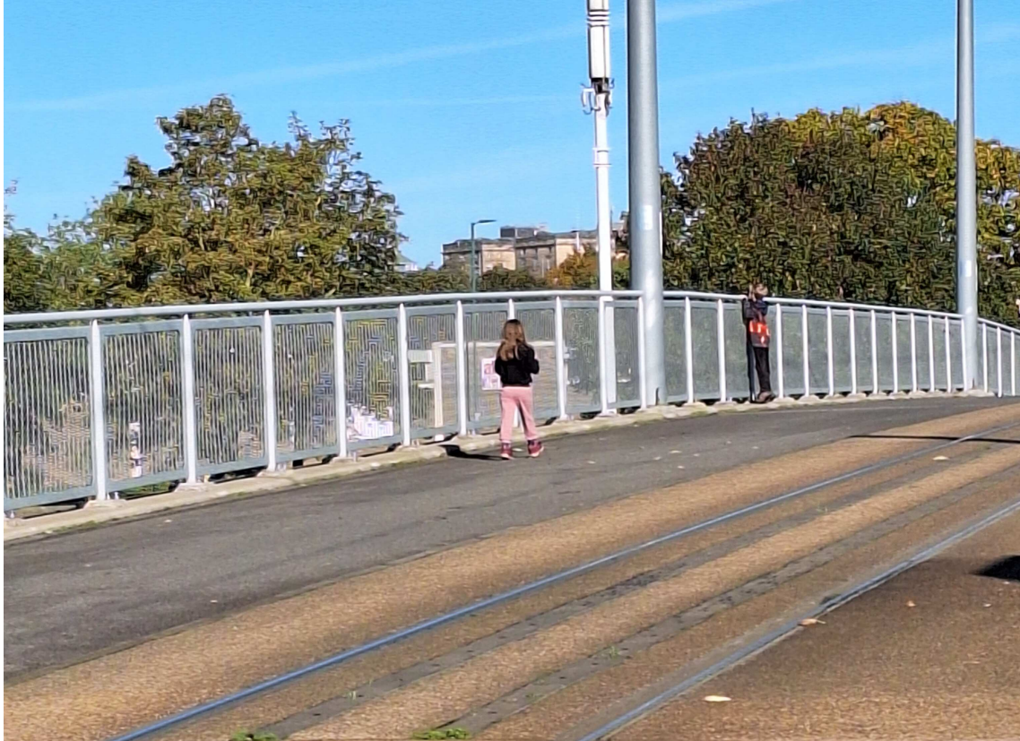
20231022_115026 - Wilford Toll Bridge.