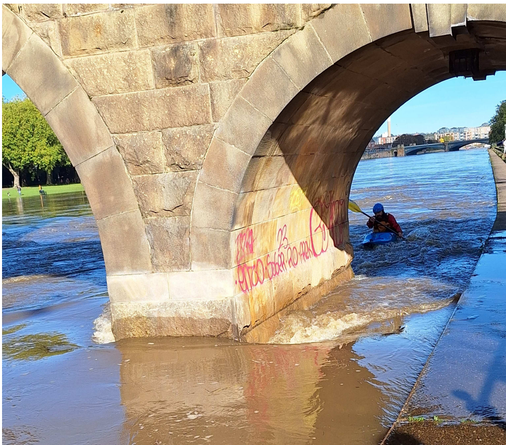
20231022_122318 - The arches.