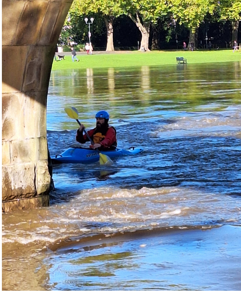
20231022_122334 - Through the arches.