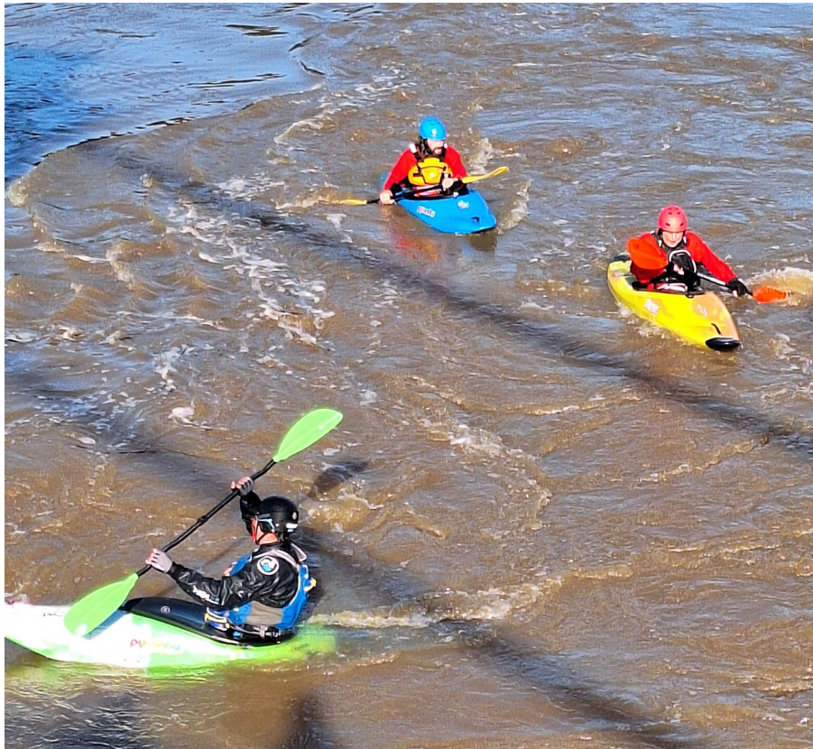
20231022_121904 - Kayaks.