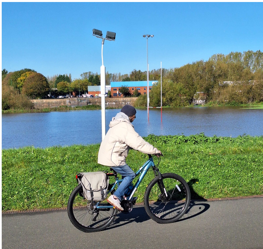
20231022_114603 - Cyclist by Nottingham Moderns.