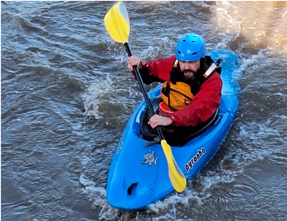
20231022_122031 - Kayak.