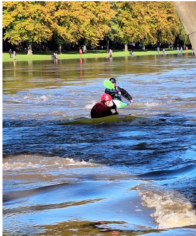
20231022_122523 - Kayaks.