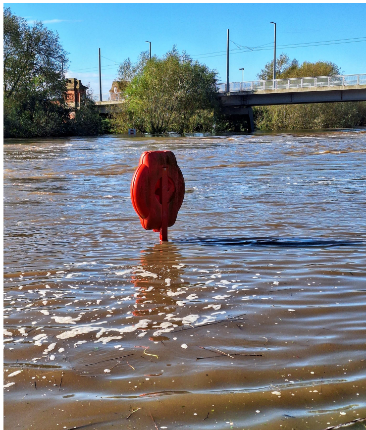
20231022_115546 - Life buoy.