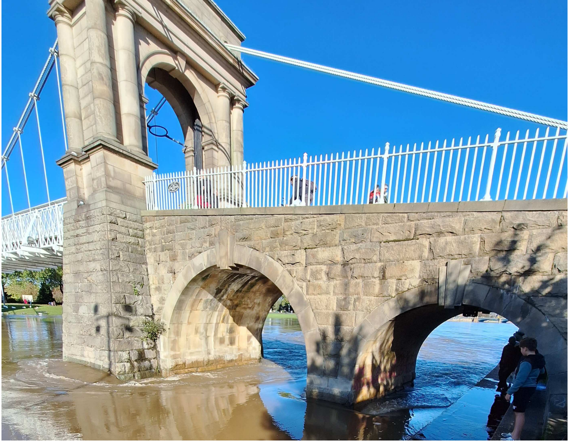
20231022_111837 - Wilford Suspension Bridge.