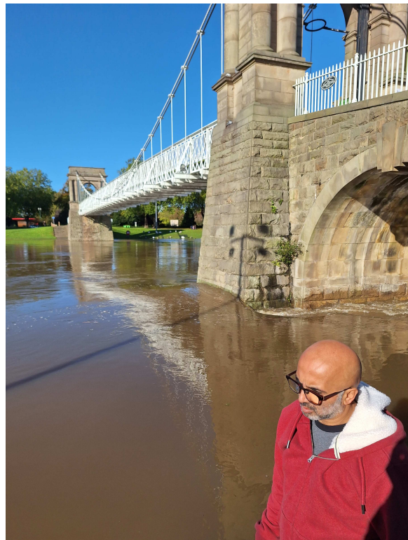
20231022_111848 - Wilford Suspension Bridge.