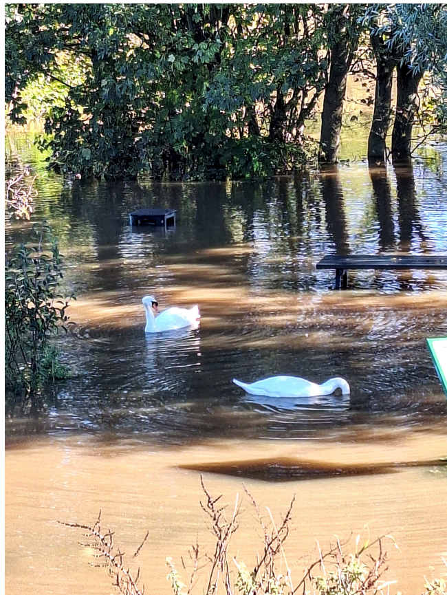
20231022_114235 - Iremonger's Pond.