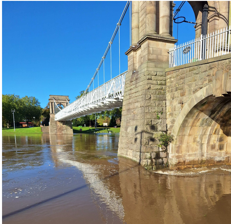
20231022_111850 - Wilford Suspension Bridge.