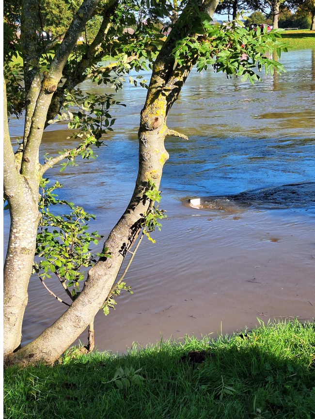
20231022_112718 - River level gauge.