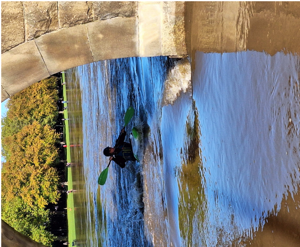
20231022_122620 - Kayak.