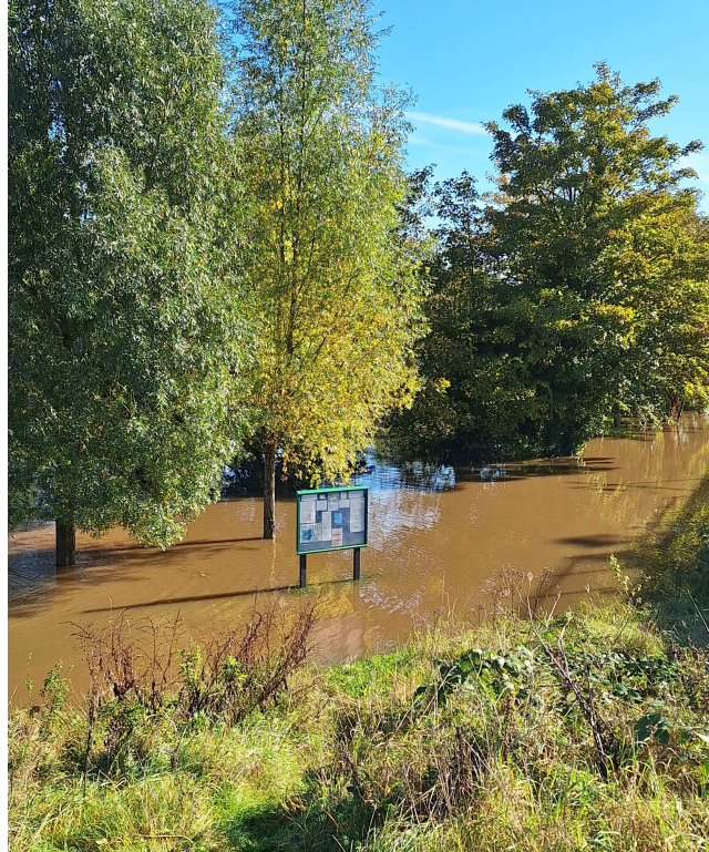
20231022_114252 - Iremonger's Pond.