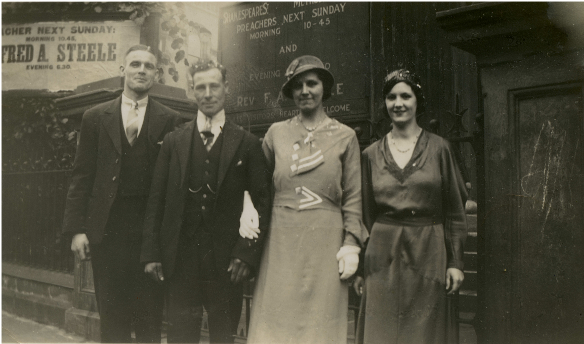
MPS-0003 - The wedding group.