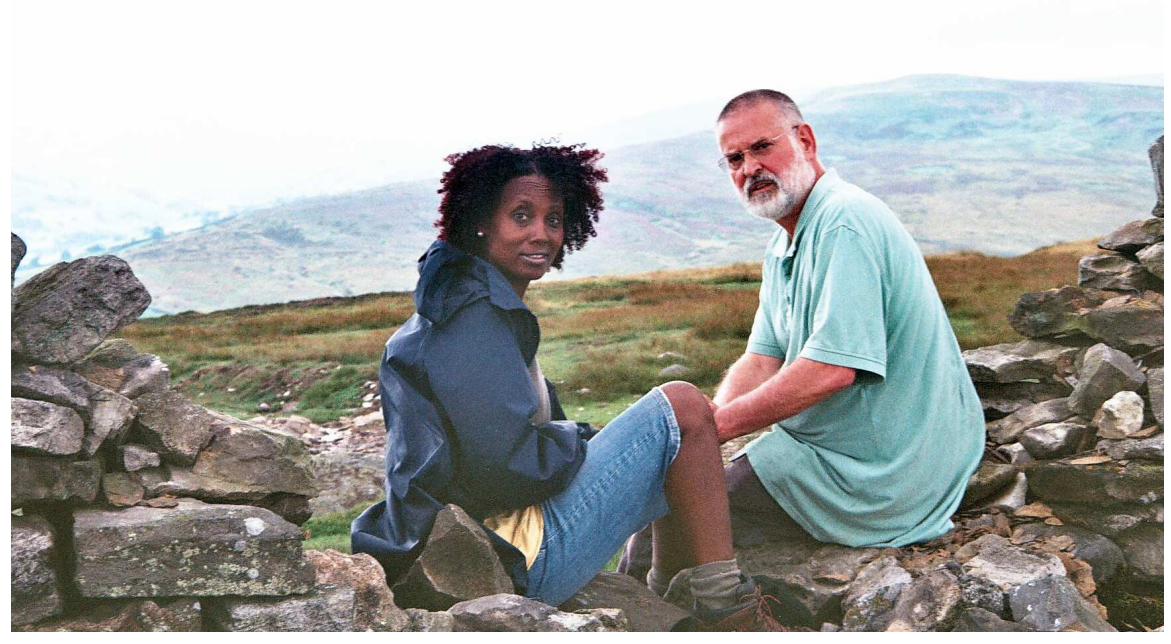
Photo08_7A - Summit of somewhere.