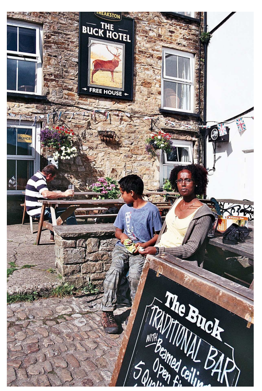
Photo12_11A - End of the walk.