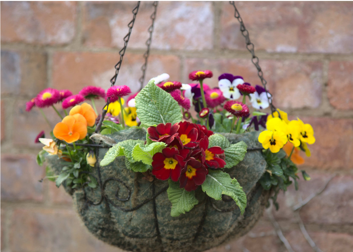
Rahel's hanging basket.