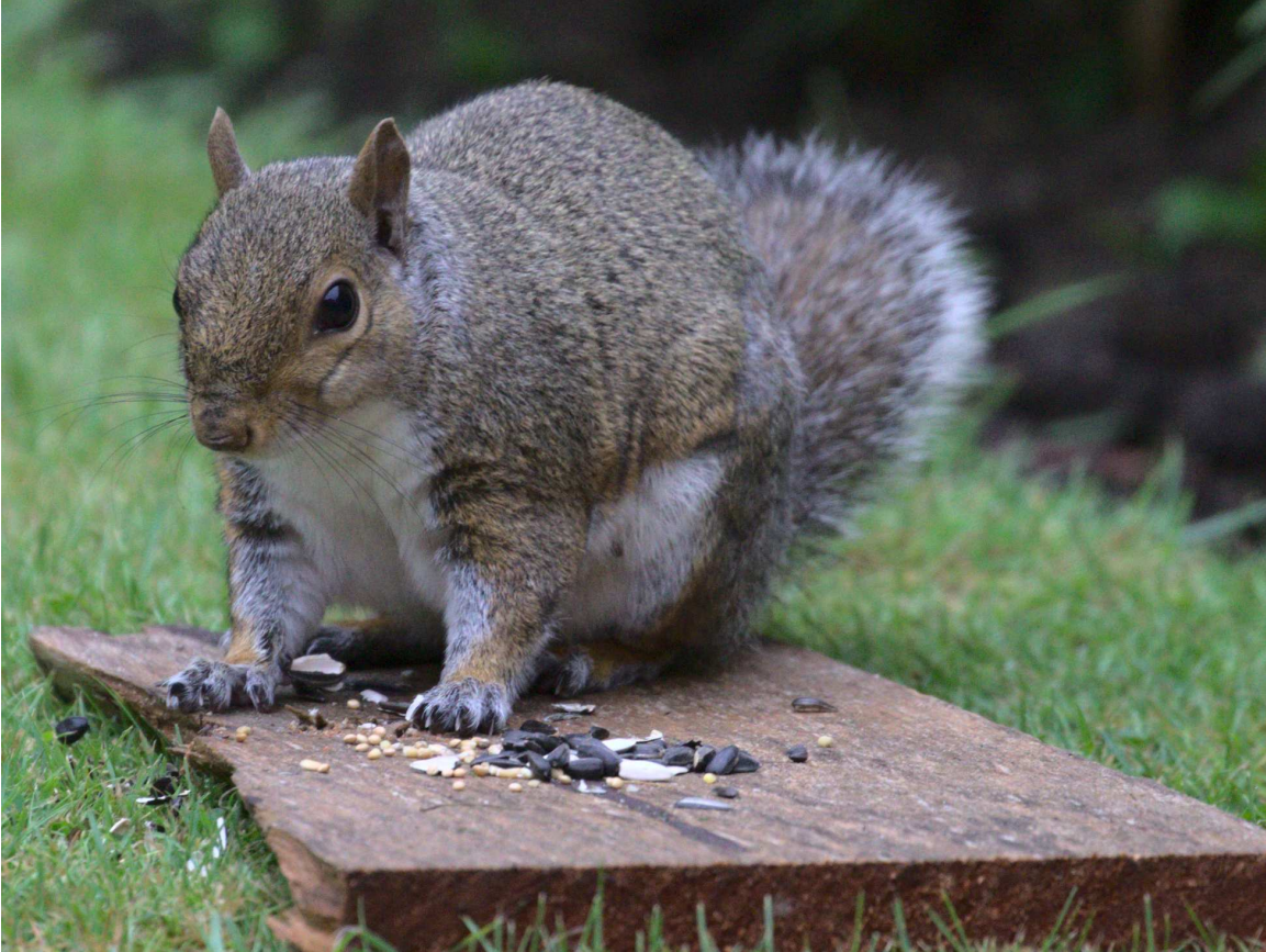
Squirrel on the lawn.