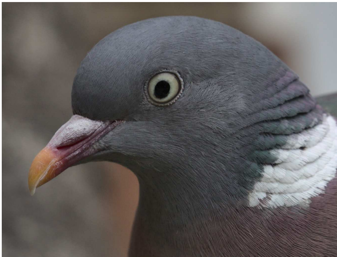
Large well fed wood pigeon.