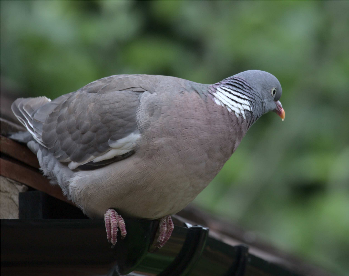
Large well fed wood pigeon.