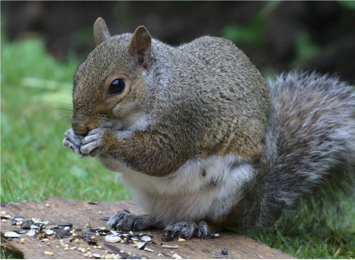
Squirrel on the lawn.