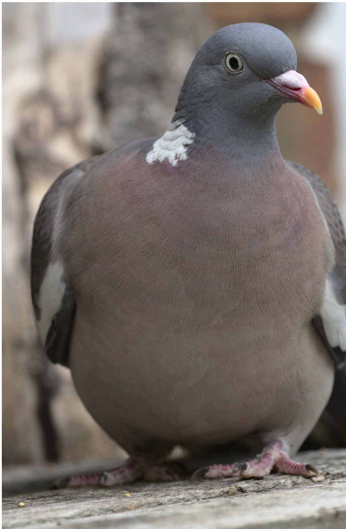
Large well fed wood pigeon.