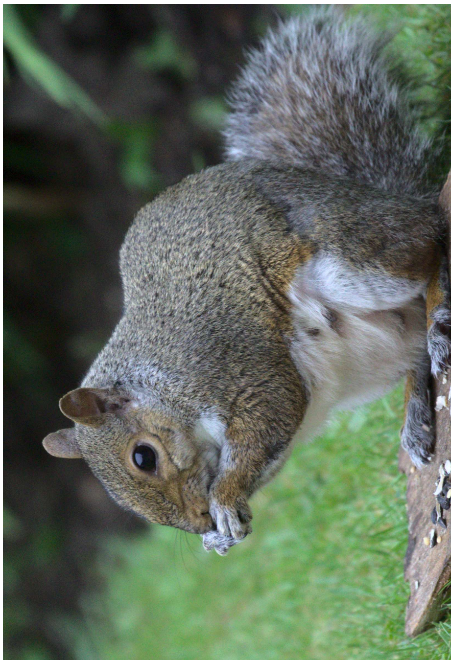
Squirrel on the lawn.