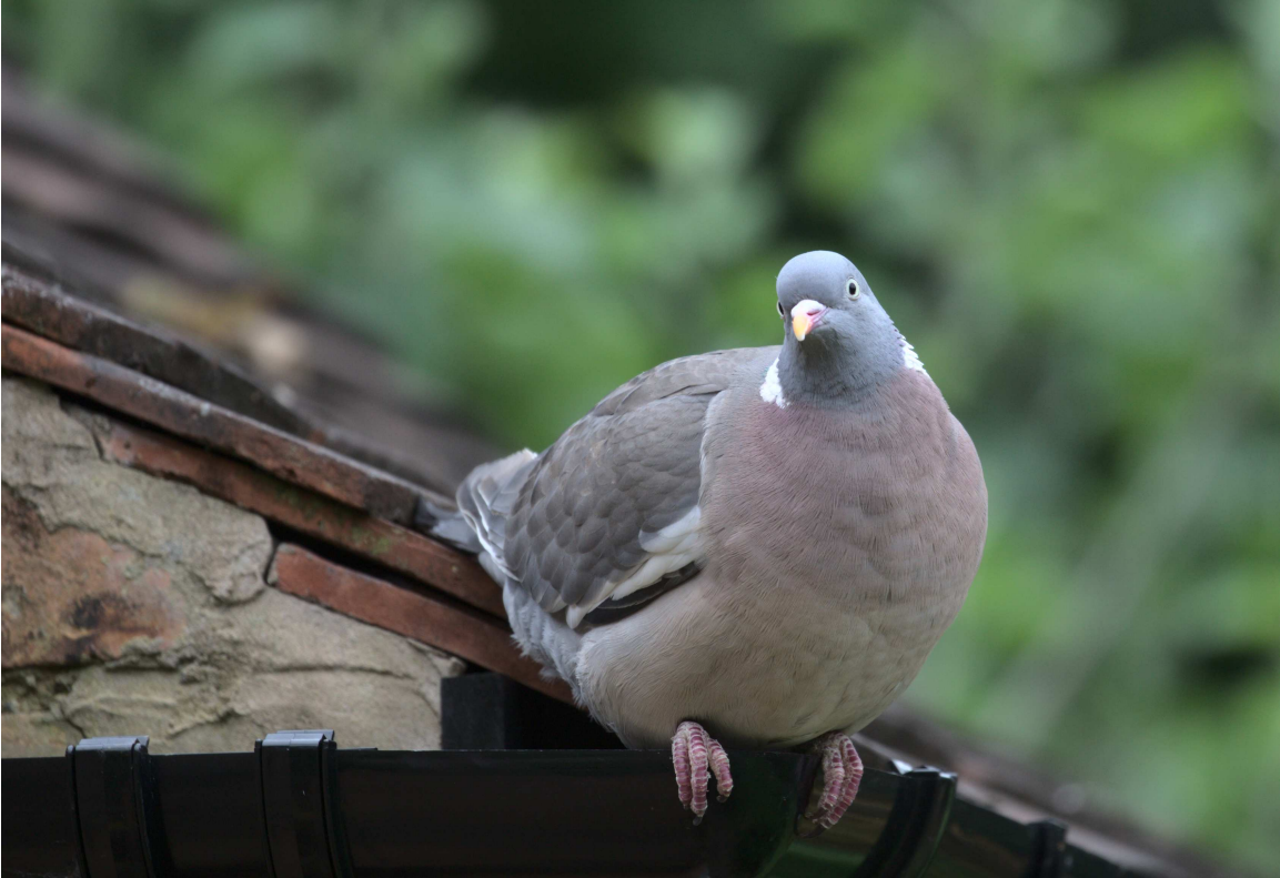
Large well fed wood pigeon.