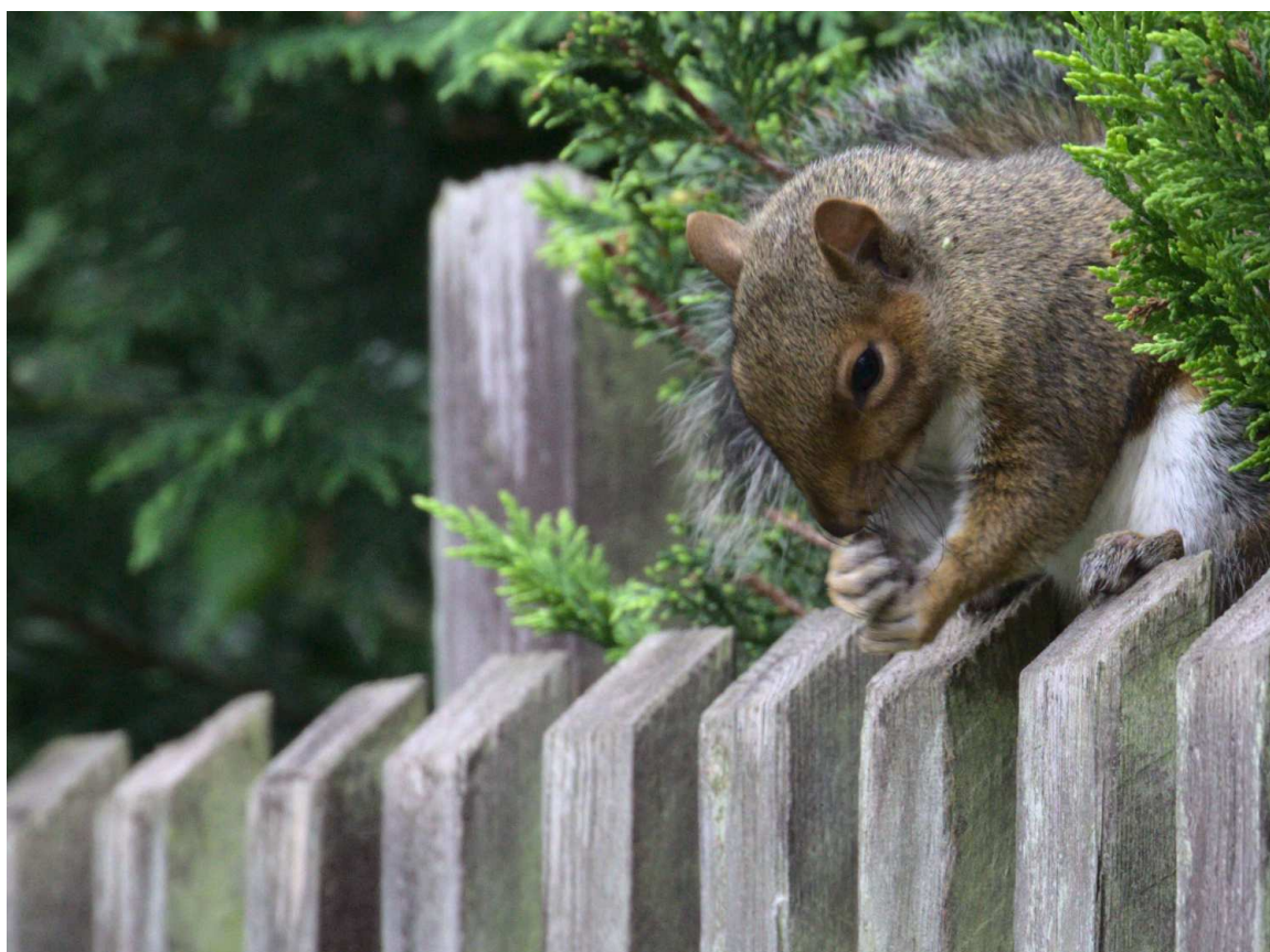
Sitting on the fence.