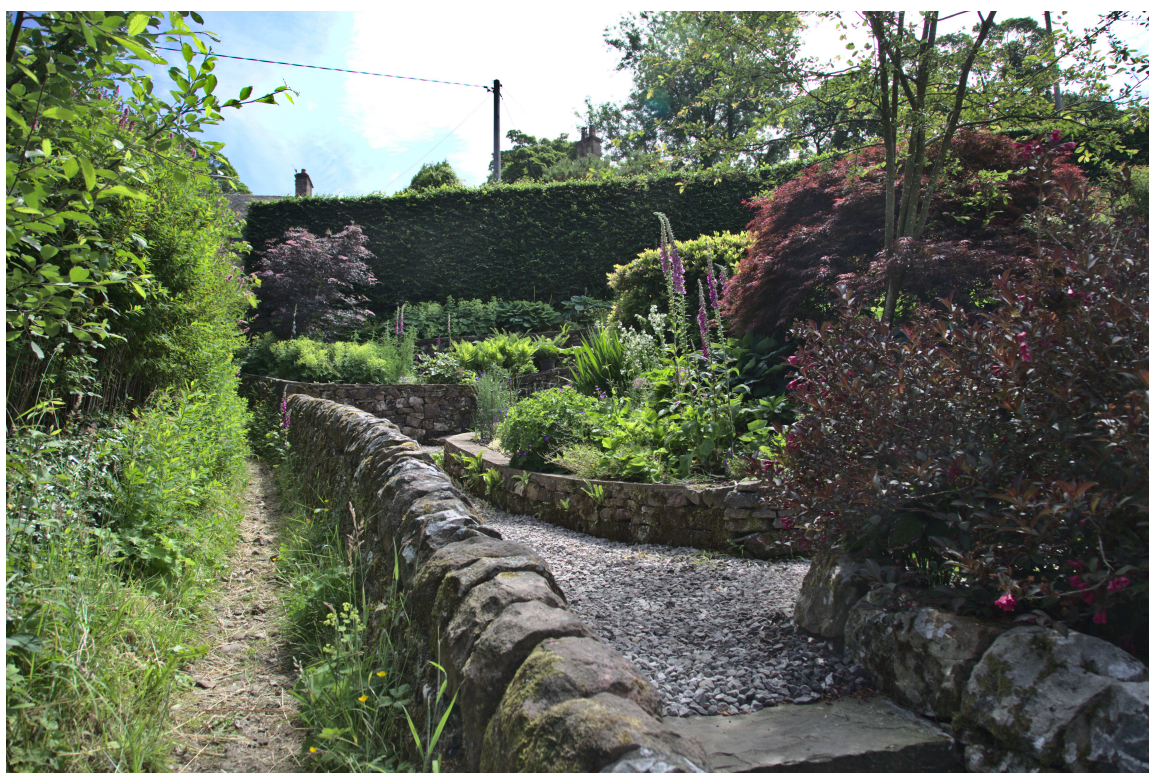
Danebridge footpath and garden.