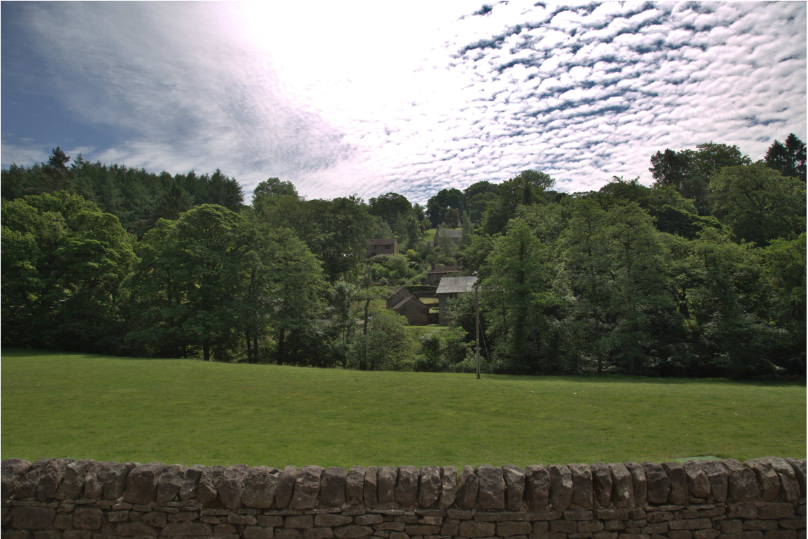
Danebridge from Wincle.