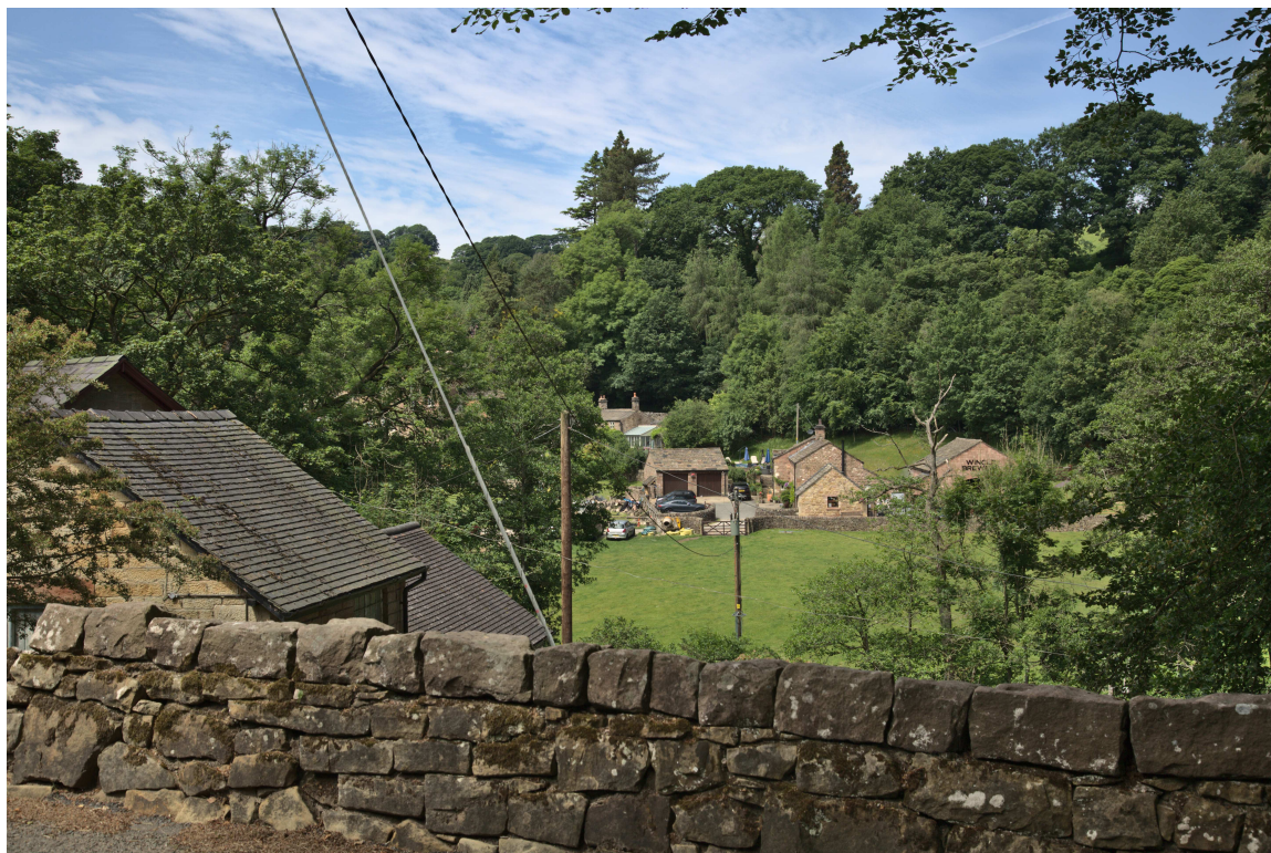
Wincle from Staffordshire.