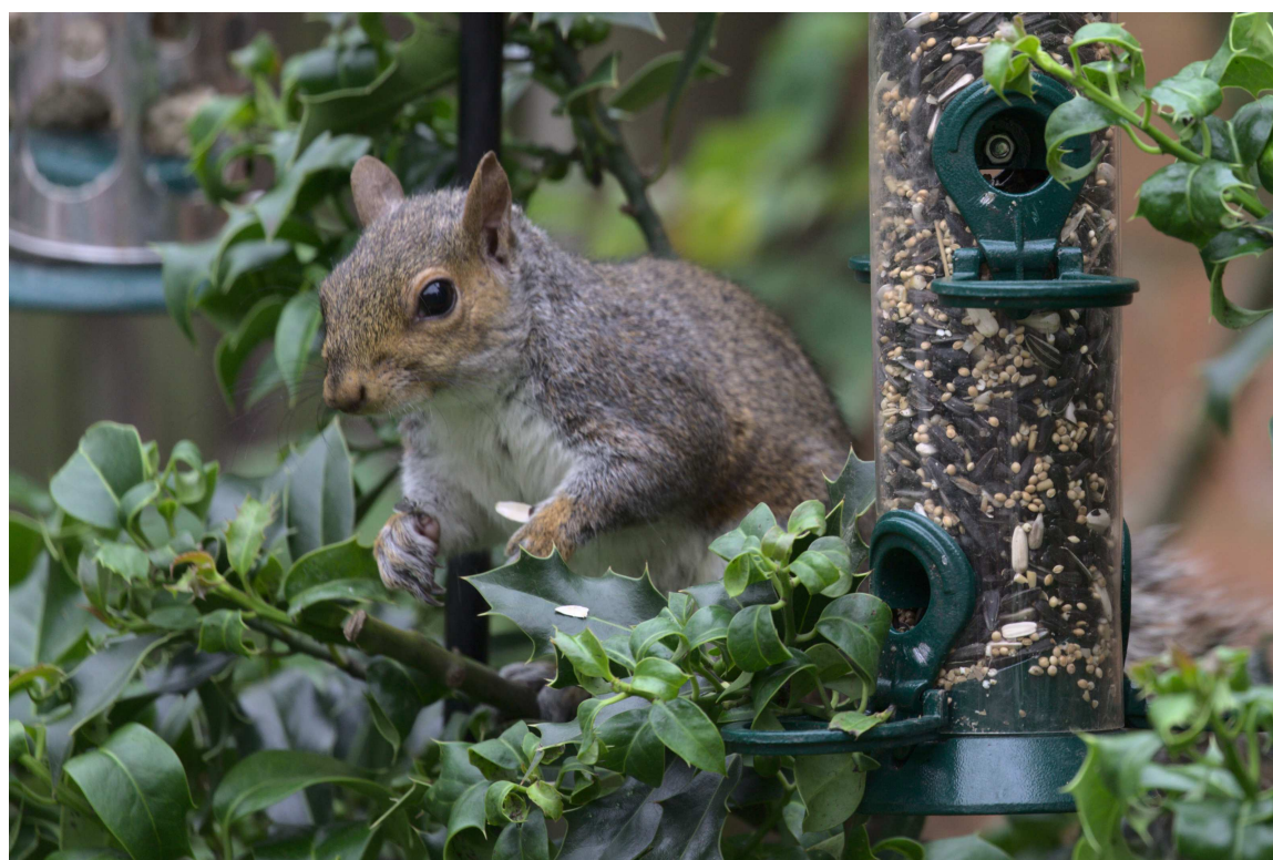
Squirrel on a Bird Feeder.