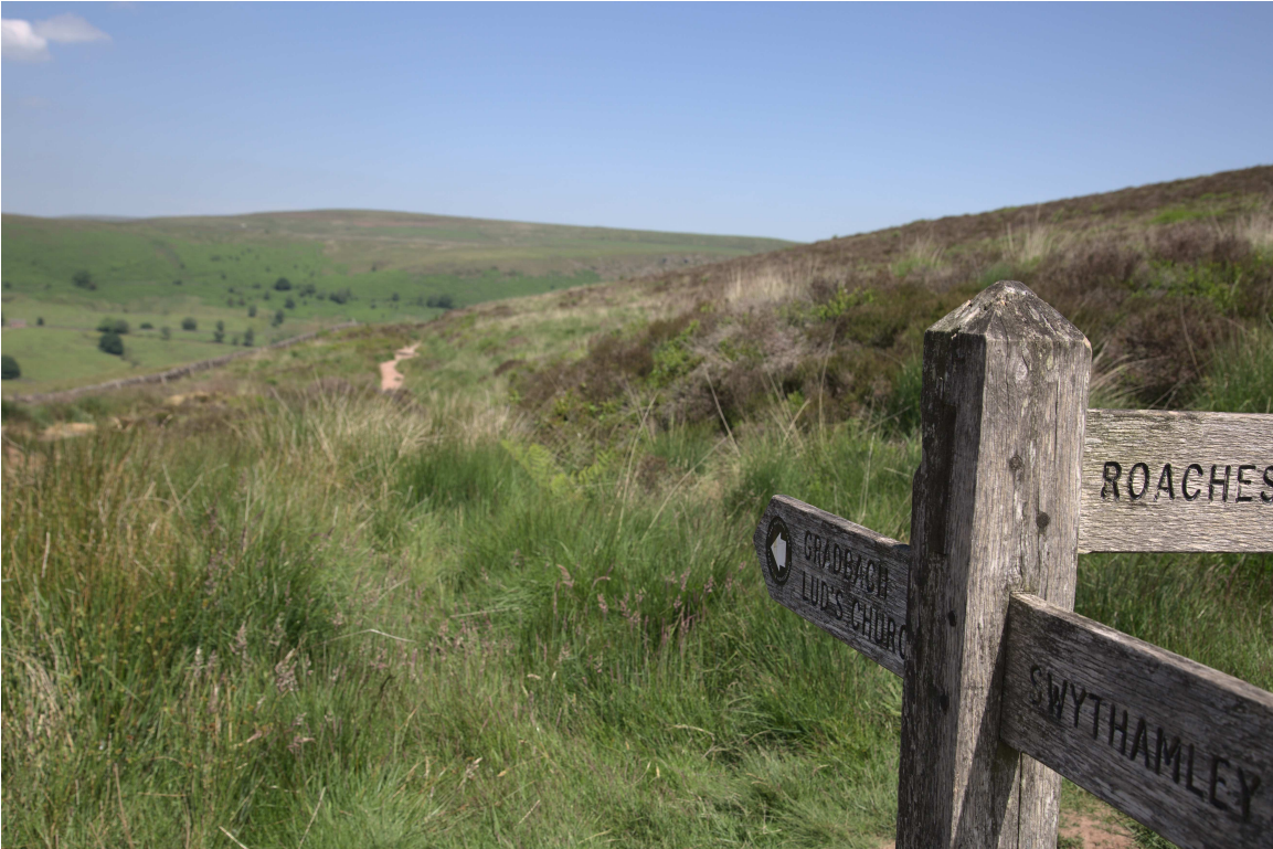
Signpost to the Roaches.