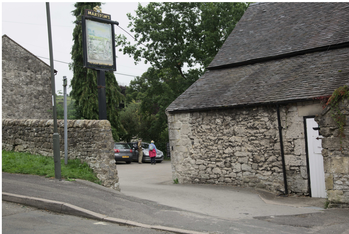
Olde Gate Inn car park.