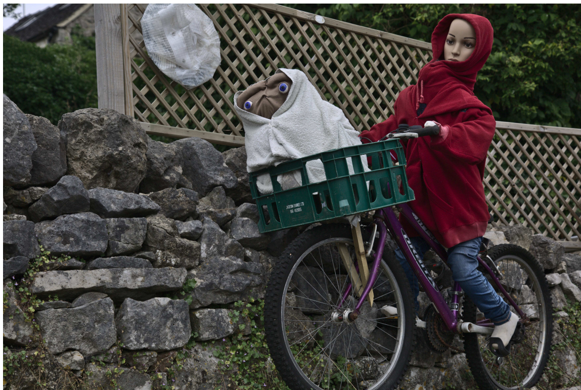
ET and Elliot.