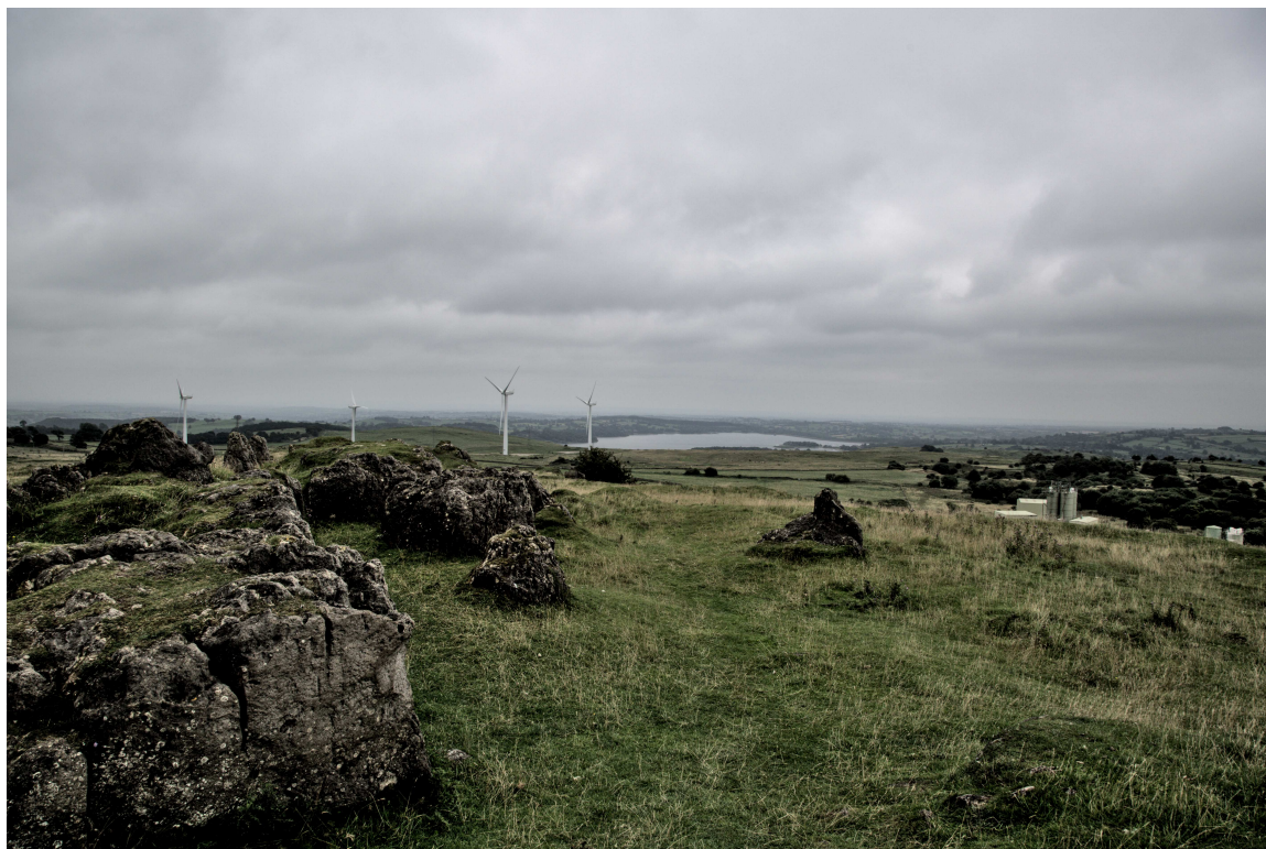
Carsington Water from Harborough Rocks.