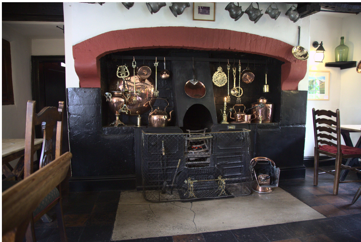
Fireplace and ovens.