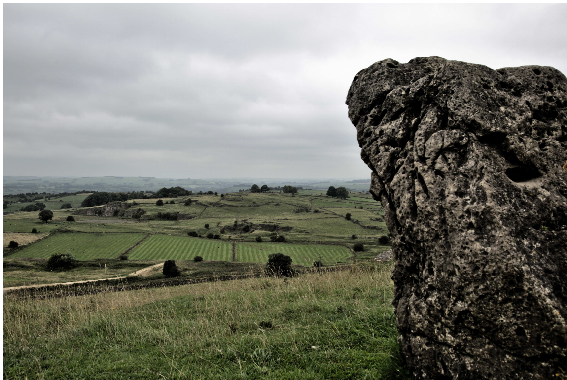
Dolomitic limestone & view.