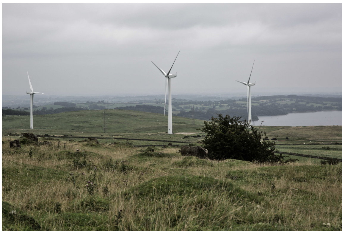
Carsington Water, wind turbines and cement works.