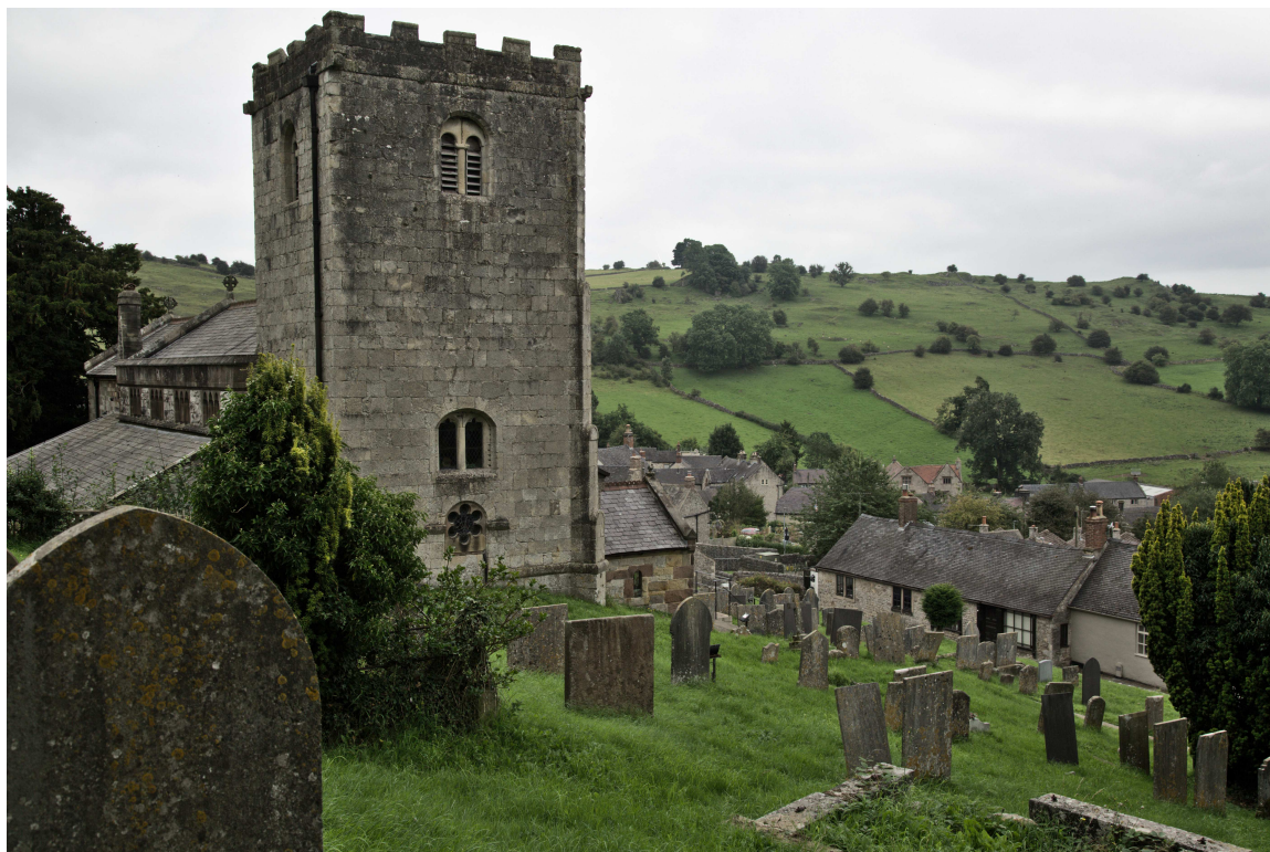
St. James' Church tower.