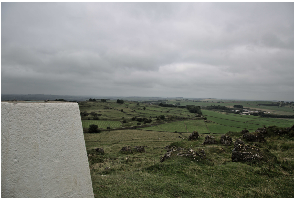
Trig Point Harborough Rocks.