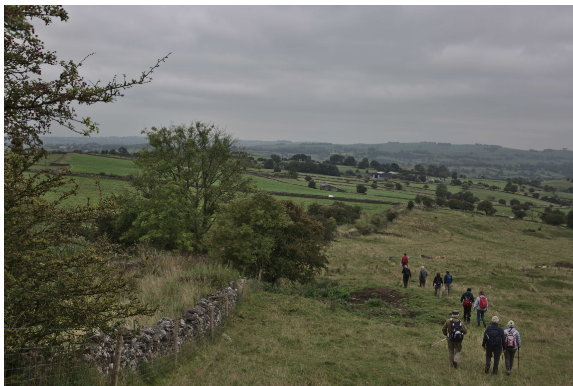
U3A Walkers leaving Rainster Rocks.