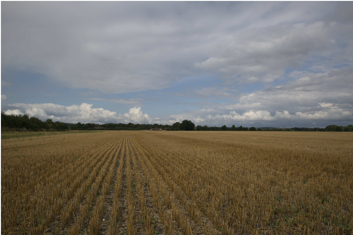
After the harvest.