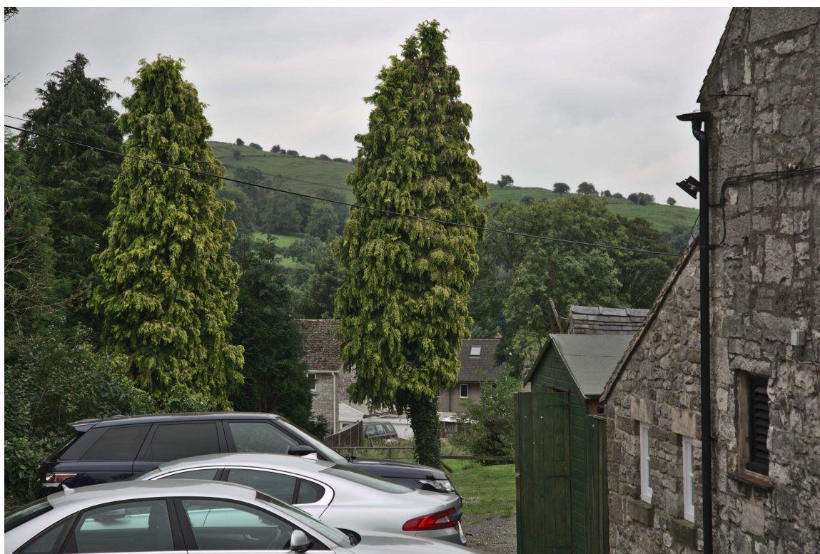
Car park and hills.