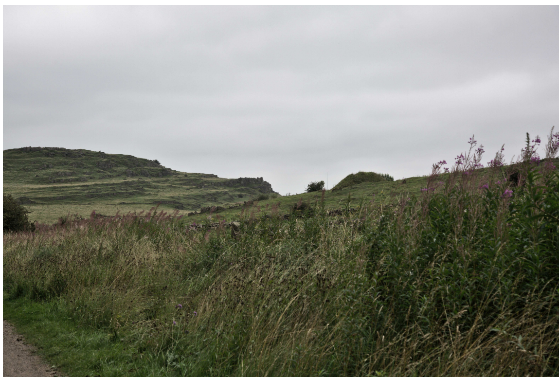
High Peak Trail.