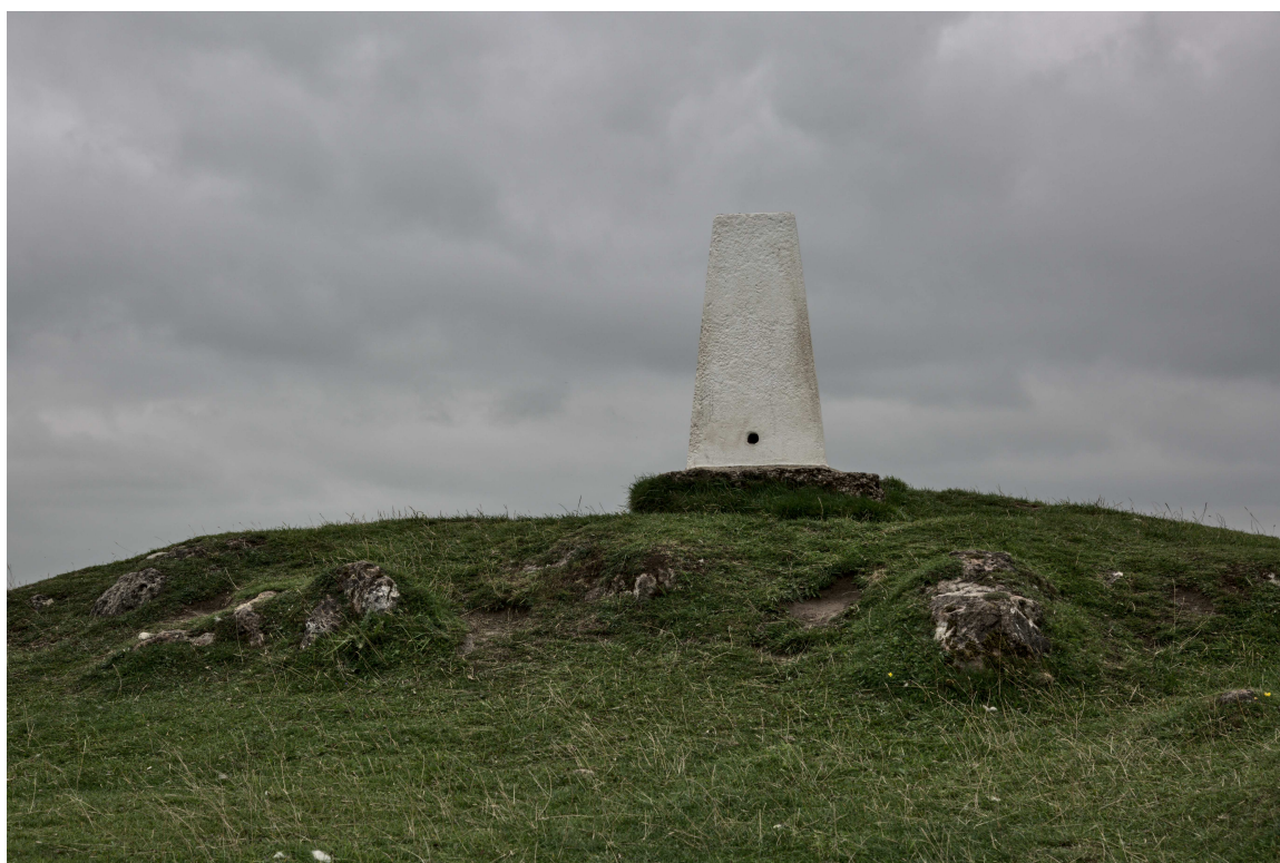
Trig point at Harborough Rocks.