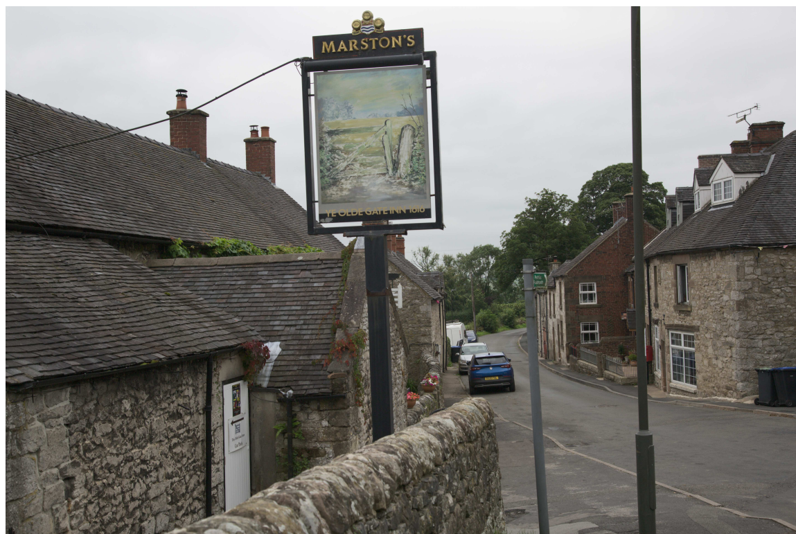
Ye Olde Gate Inn.