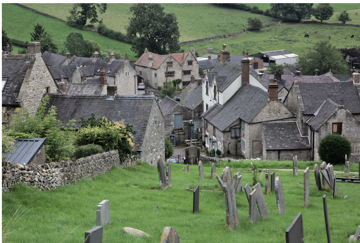
Church yard and Miners Arms.