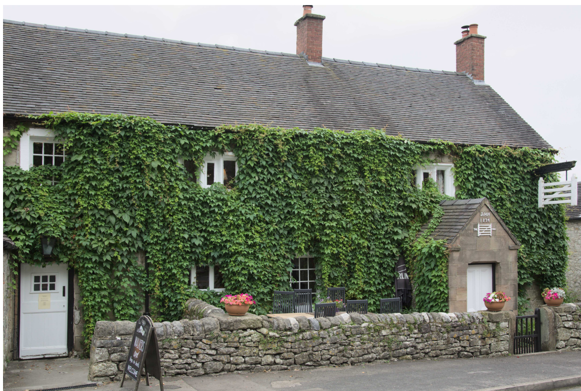
The Olde Gate Inn.