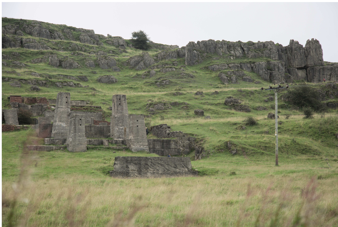
Mines at Harborough Rocks.