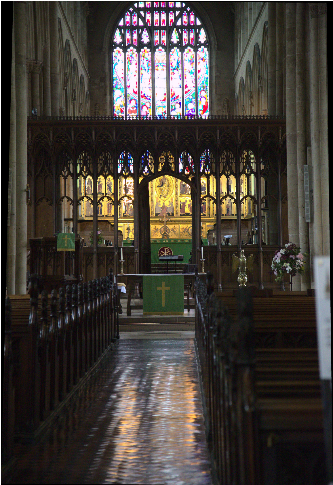
Nave St. Mary Magdalene.