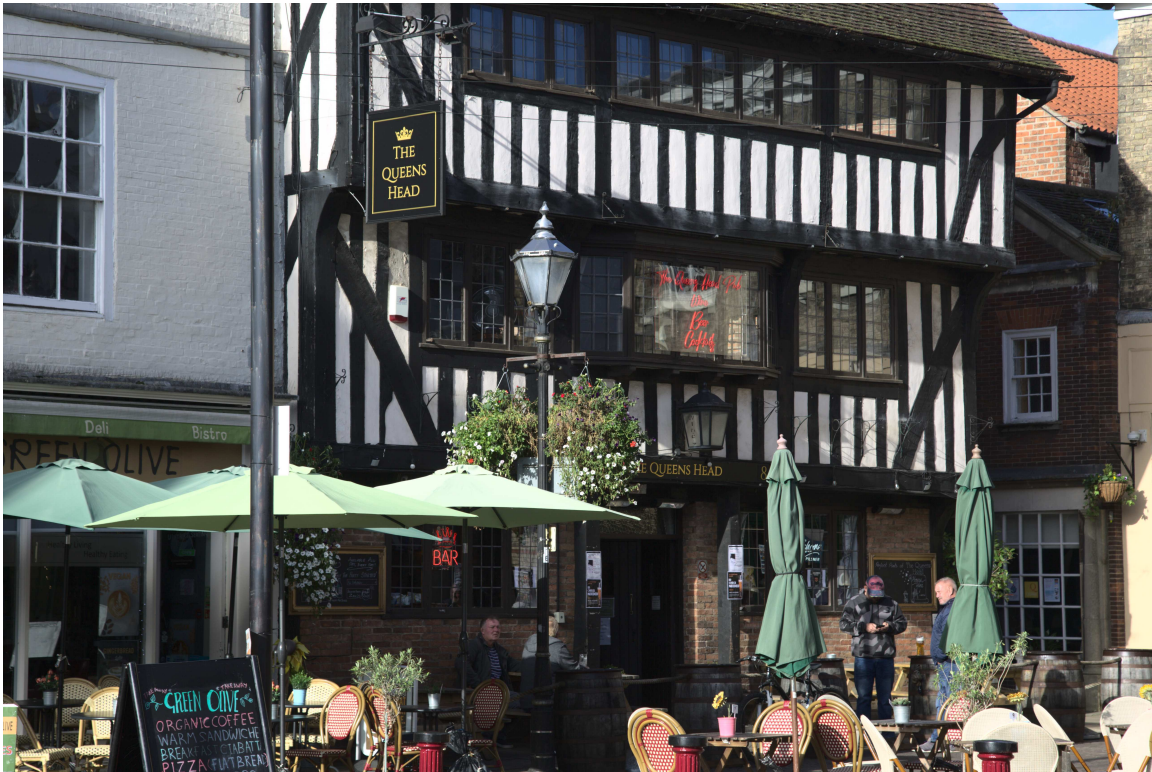
The Queens Head.