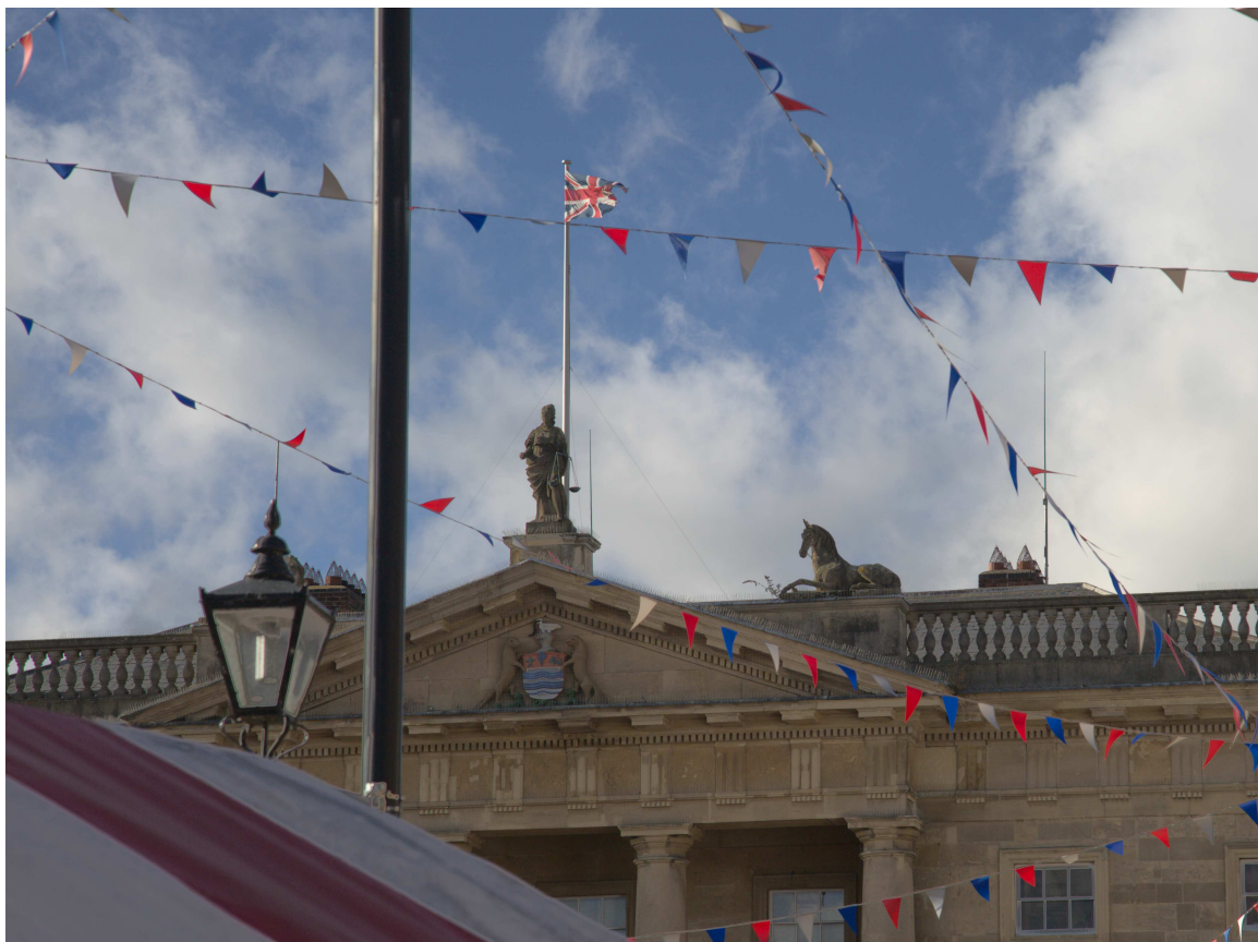
Town Hall Roof.