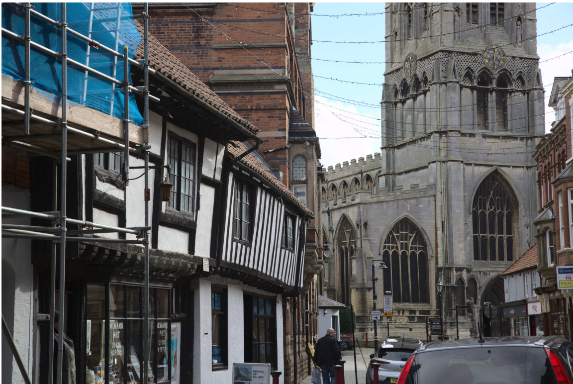
16th Century House.