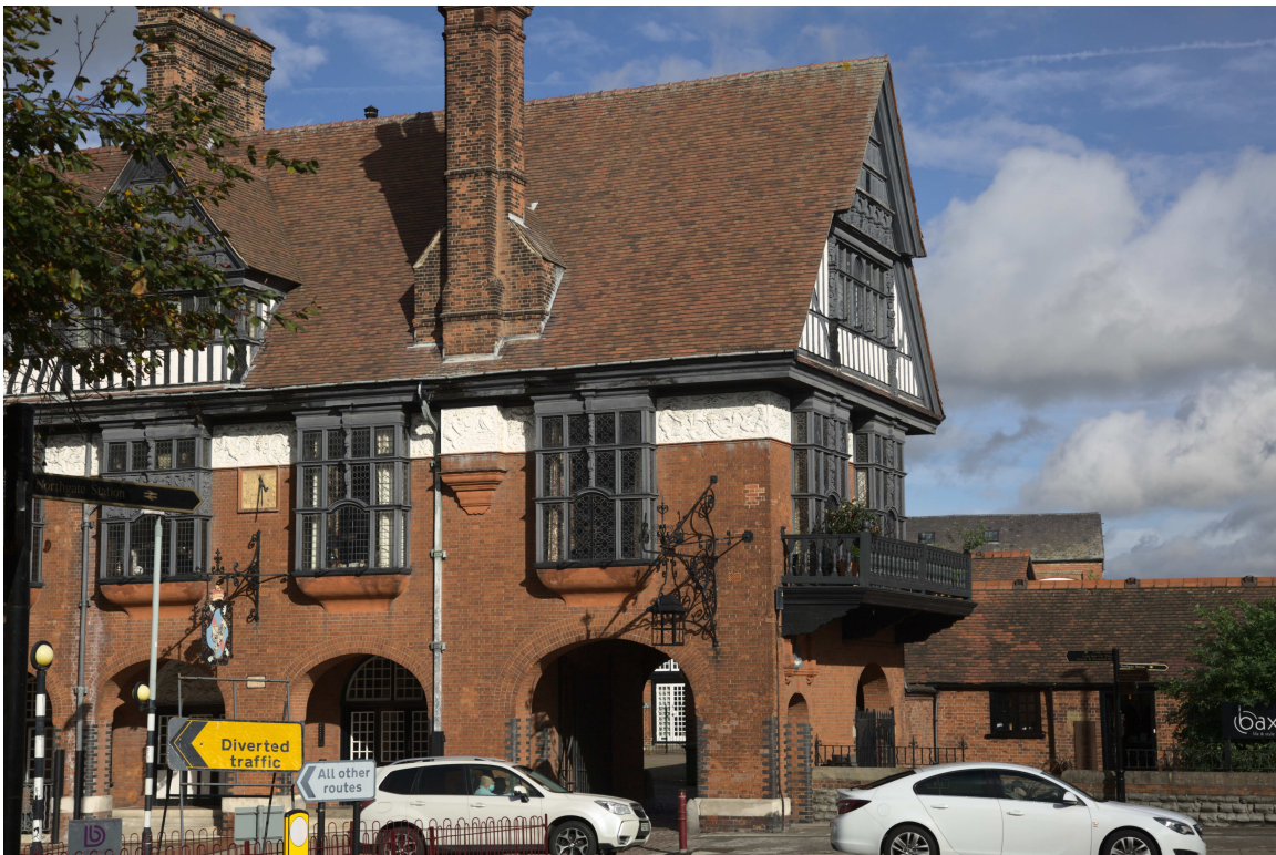
The Ossington Coffee Palace.