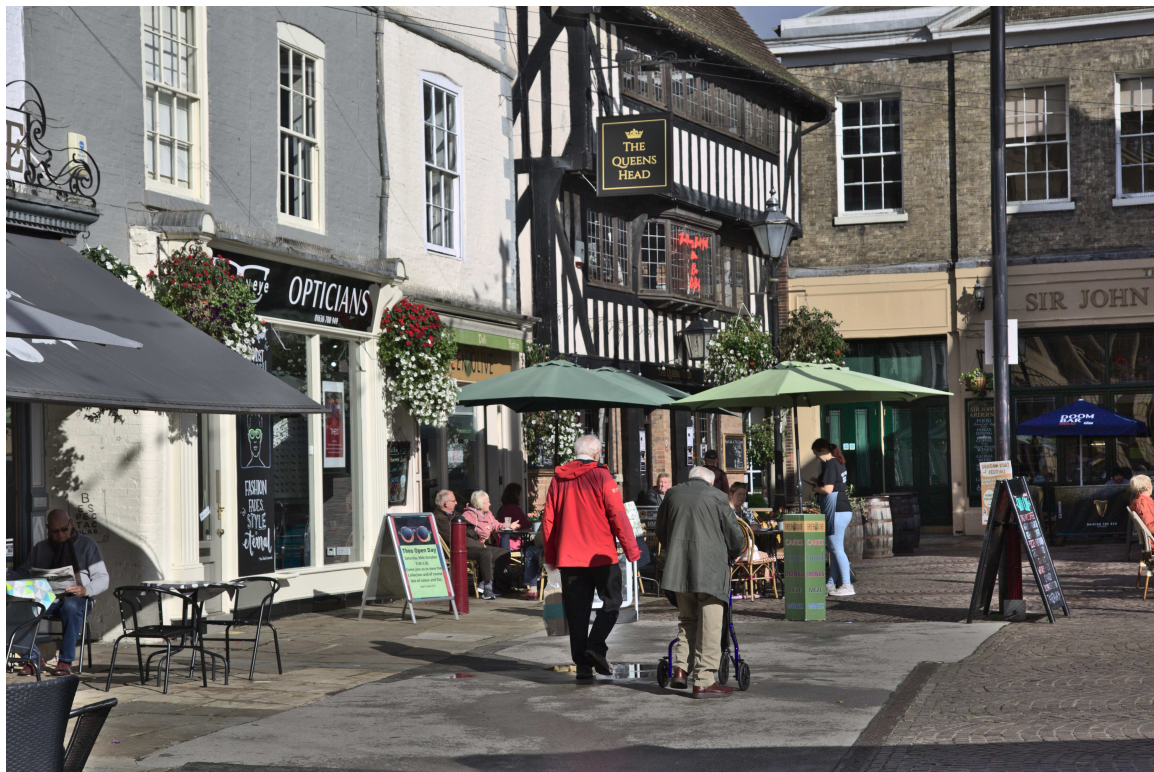
The Queens Head.