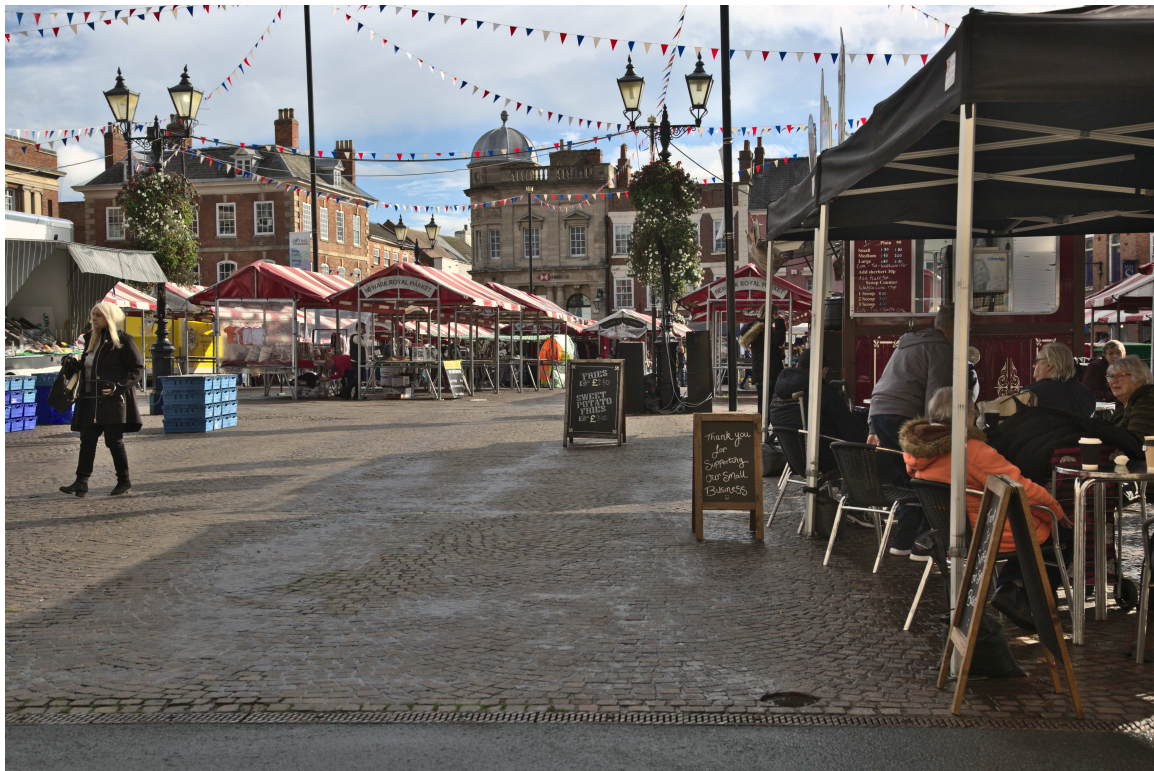
Newark Royal Market.

F47B3597 20211020 12:41:06 Royal Market. F47B3598 20211020 12:41:09 Royal Market. F47B3599 20211020 12:43:41 Bridge Street. F47B3600 20211020 12:49:45 Wilson Street. F47B3601 20211020 12:50:23 Nave St. Mary Magdalene Church. F47B3602 20211020 12:52:09 Font St. Mary Magdalene Church. F47B3603 20211020 12:52:09 Font St. Mary Magdalene Church. F47B3604 20211020 13:05:30 St. Mary Magdalene. F47B3605 20211020 13:09:10 Palace Theatre. F47B3606 20211020 13:09:11 Palace Theatre. F47B3607 20211020 14:18:38 Town Hall Roof. F47B3608 20211020 14:18:38 Town Hall Roof. F47B3609 20211020 14:19:10 Town Hall Roof. F47B3610 20211020 14:20:36 Moot Hall. F47B3611 20211020 14:22:06 The Queens Head. F47B3612 20211020 14:22:10 The Queens Head. F47B3613 20211020 14:23:29 Chain Lane. F47B3614 20211020 14:23:35 Chain Lane. F47B3615 20211020 14:24:13 Chain Lane.