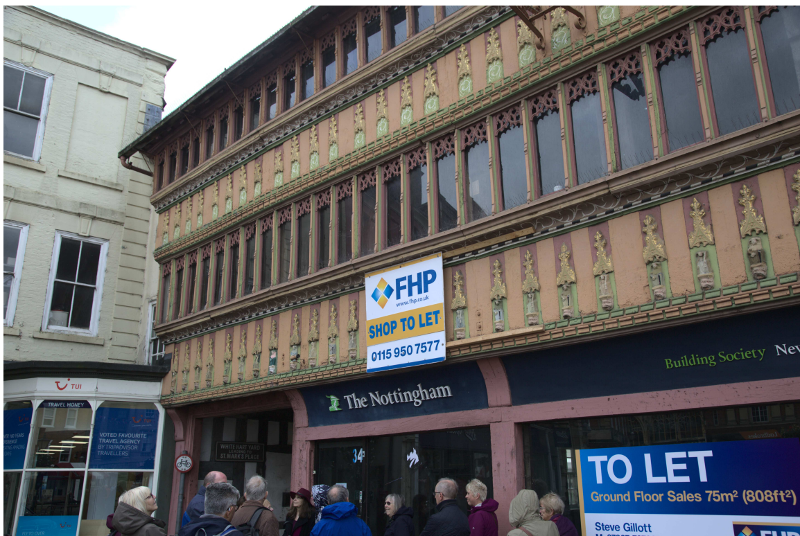
Old White Hart.