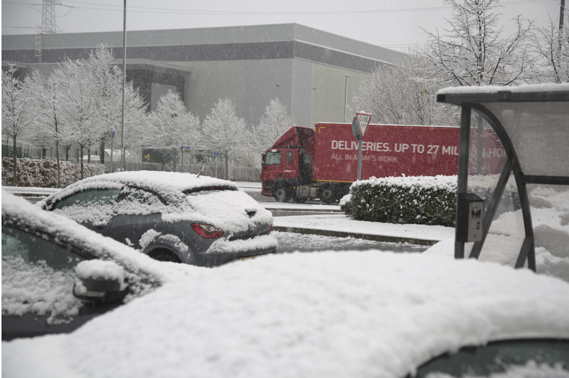
Marks & Spencer