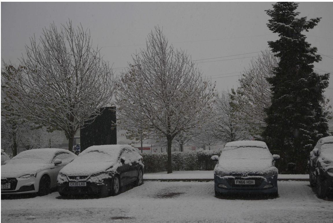
Marks & Spencer