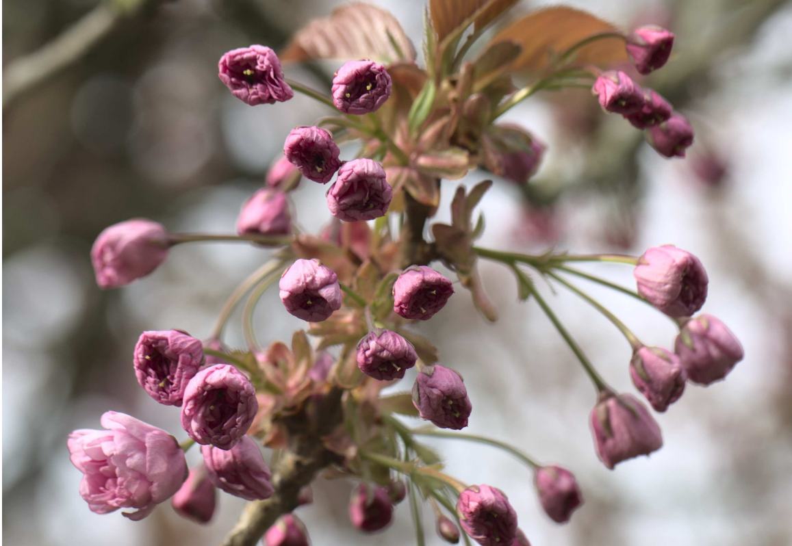
F47B4769 - Cherry blossom.