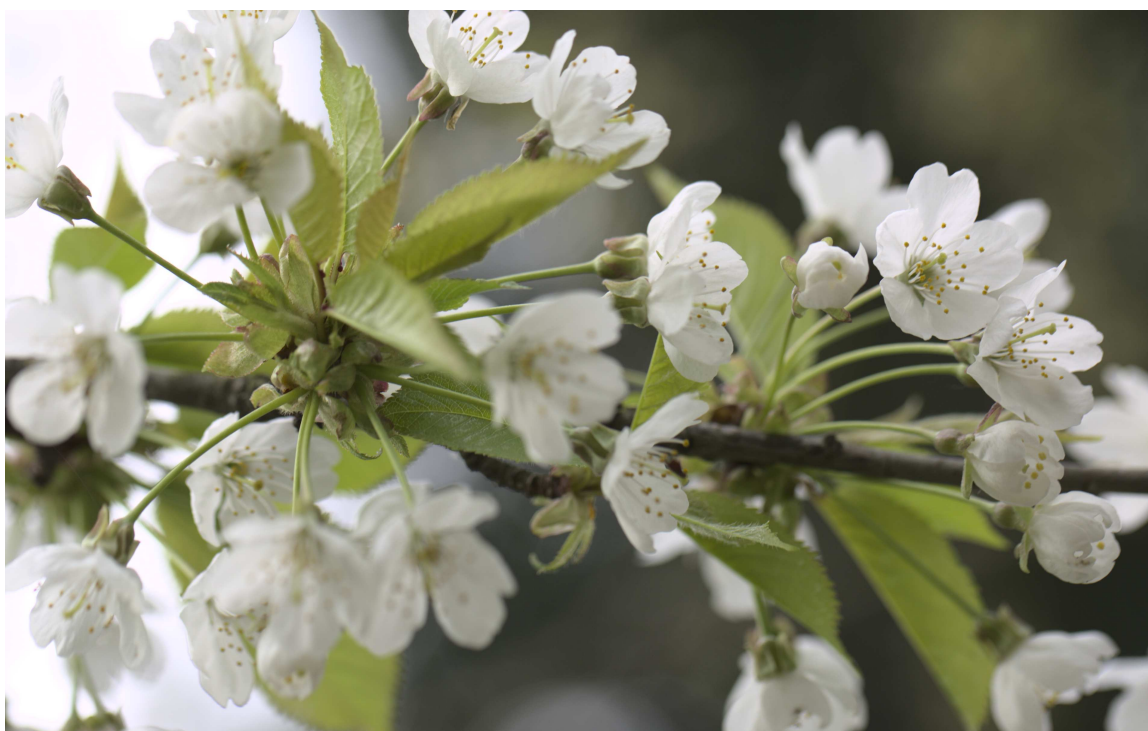
F47B4767 - May blossom.