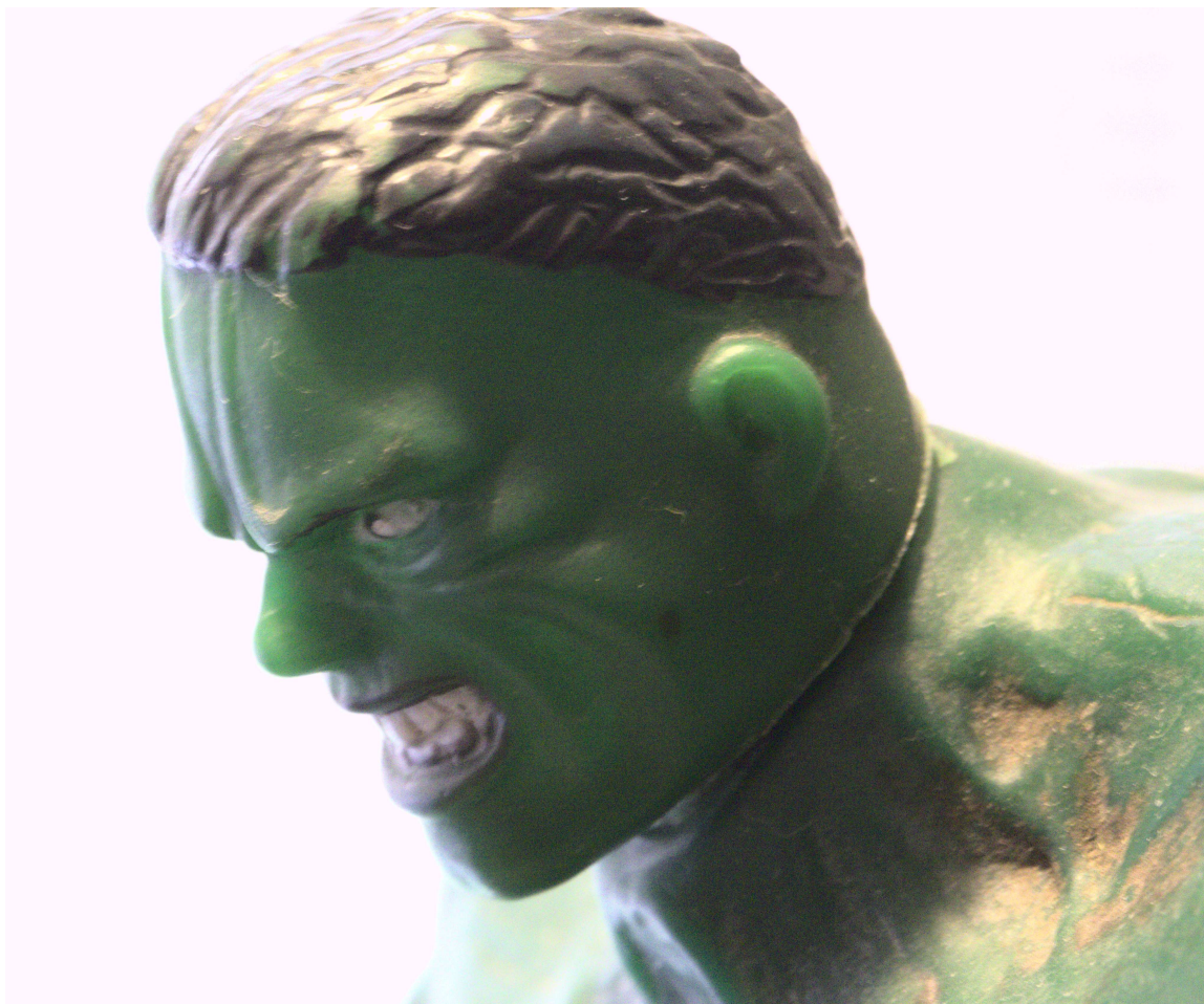
F47B4761 - Incredible.