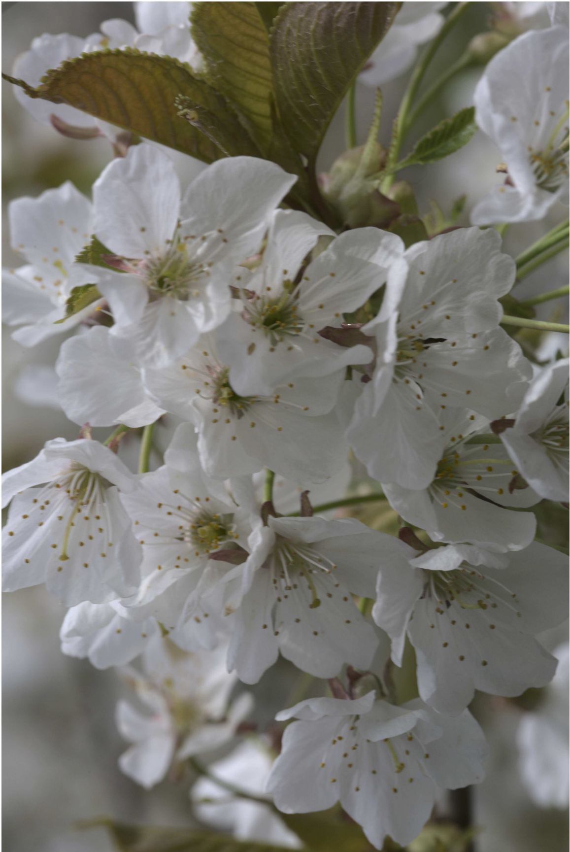
F47B4777 - May blossom.