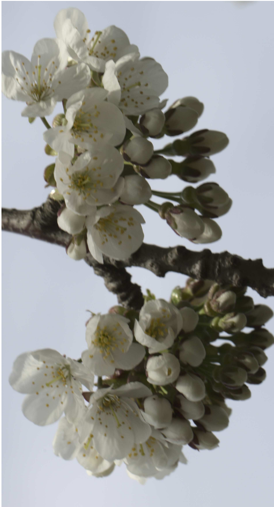
F47B4776 - Apple blossom.