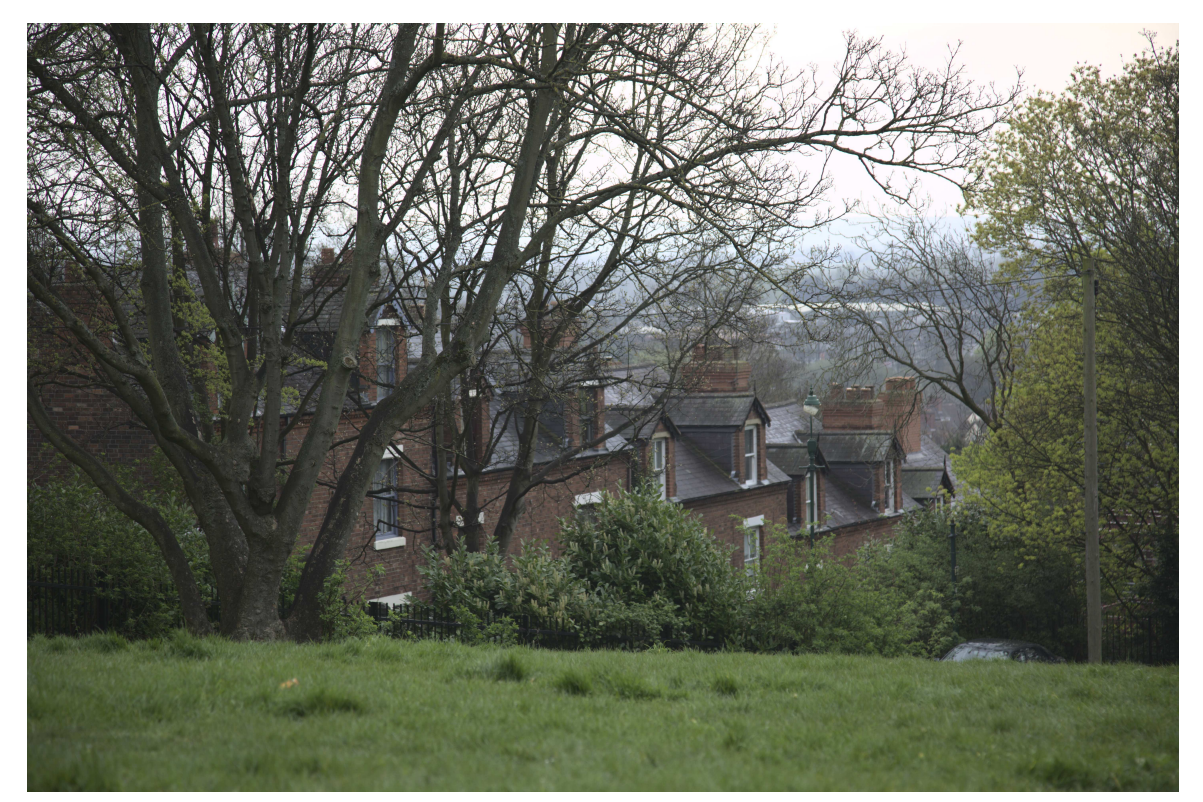
F47B4787 - Rutland Villas.