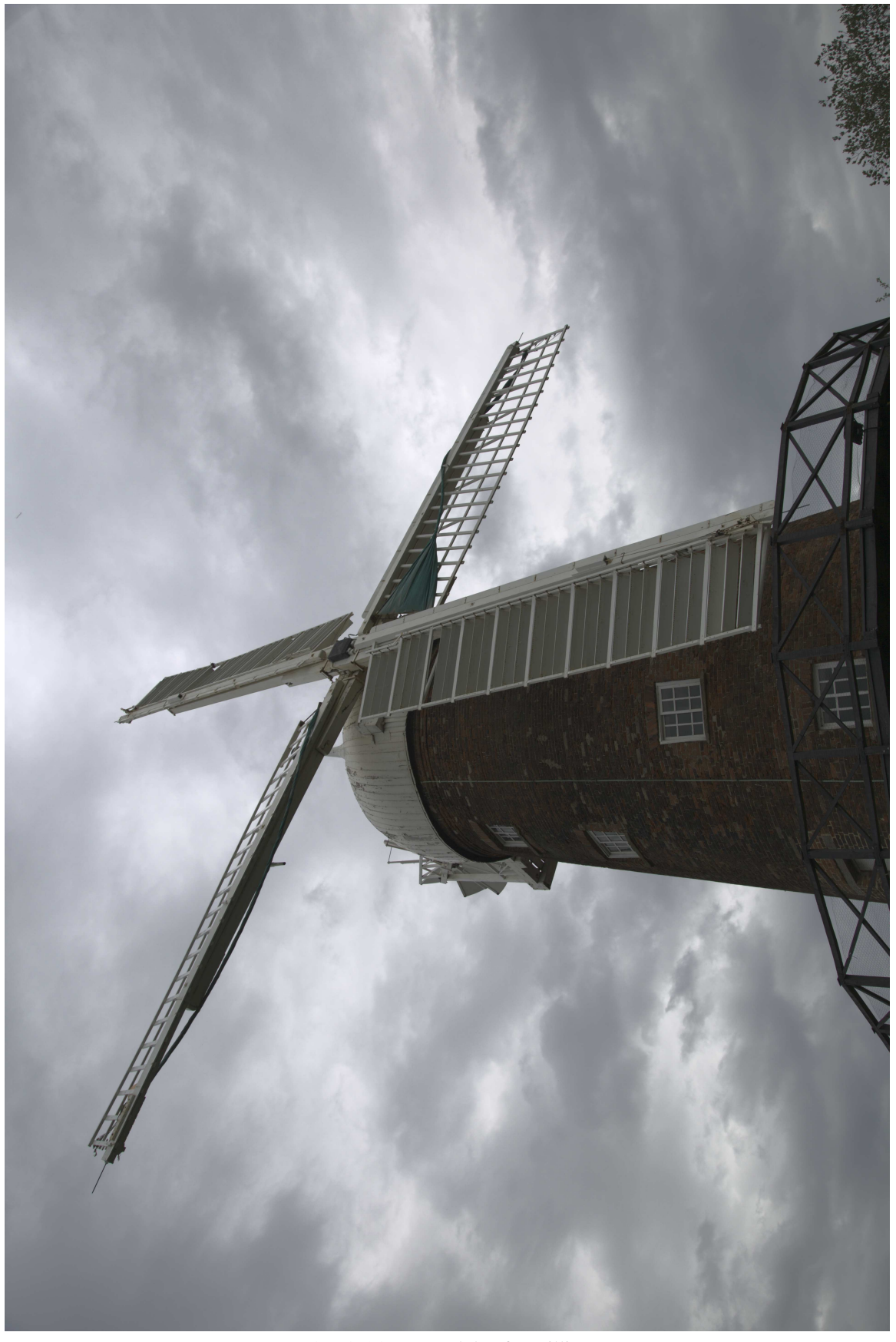
F47B4784 - A good day for milling.