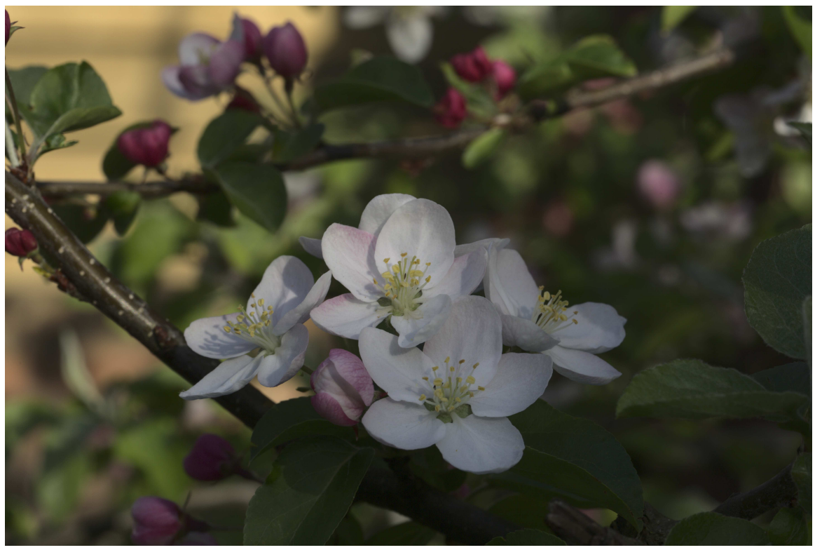
F47B4793 - Crab Apple Blossom.