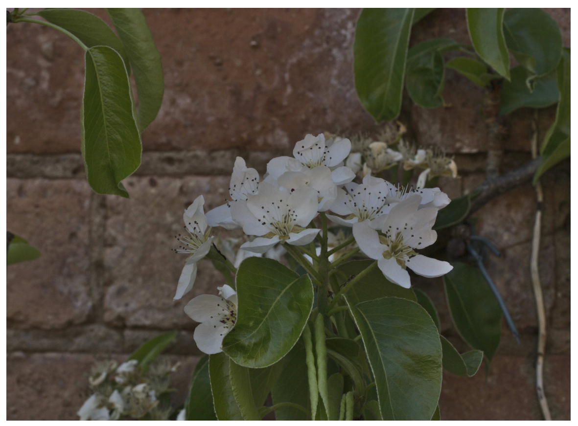
F47B4790 - Pear Tree Blossom.