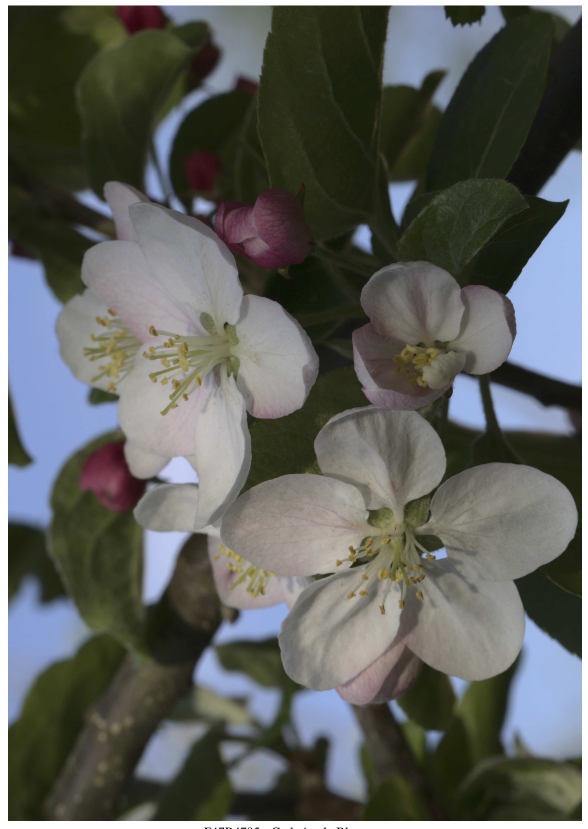
F47B4795 - Crab Apple Blossom.