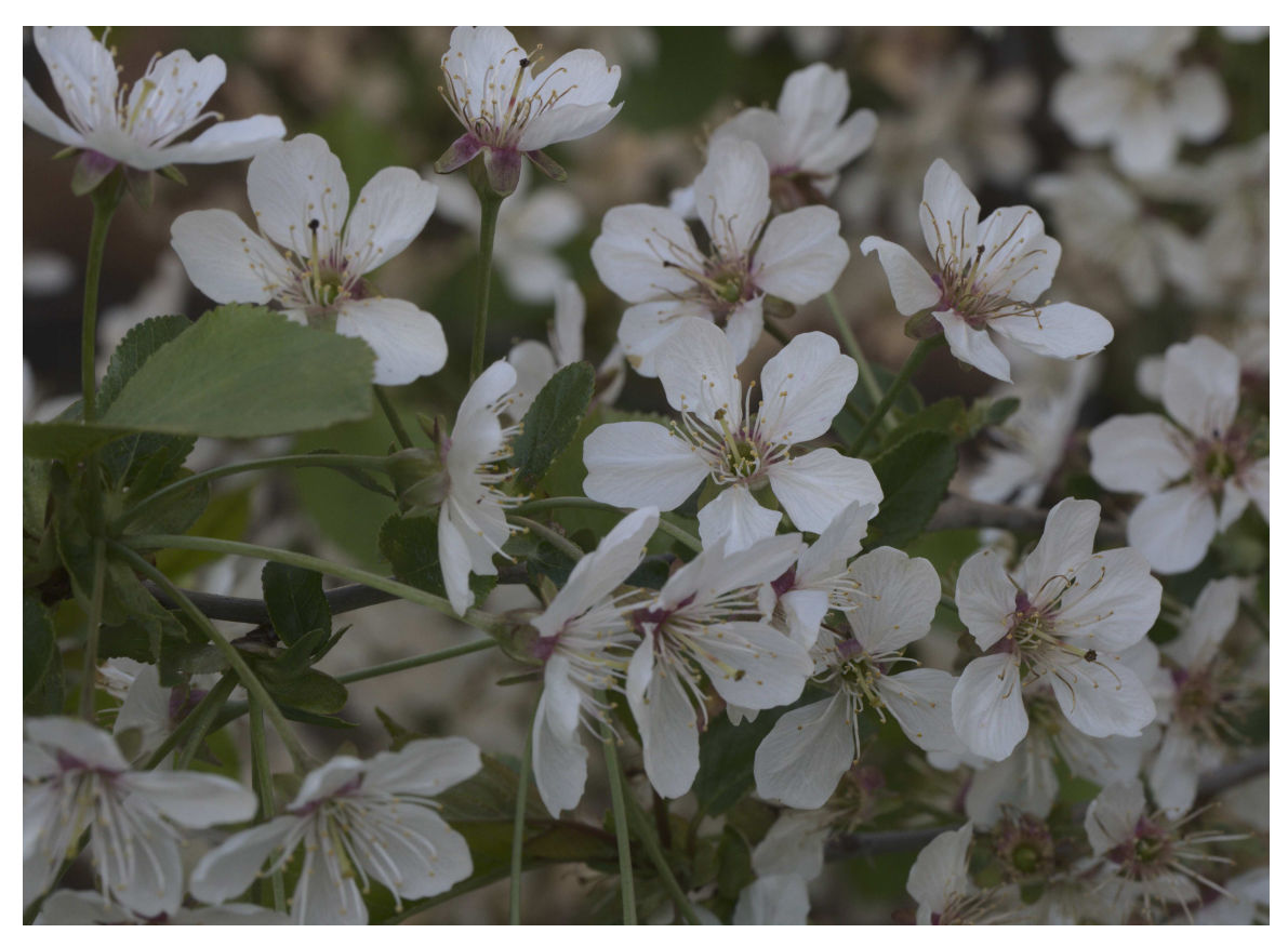
F47B4789 - Cherry Blossom.