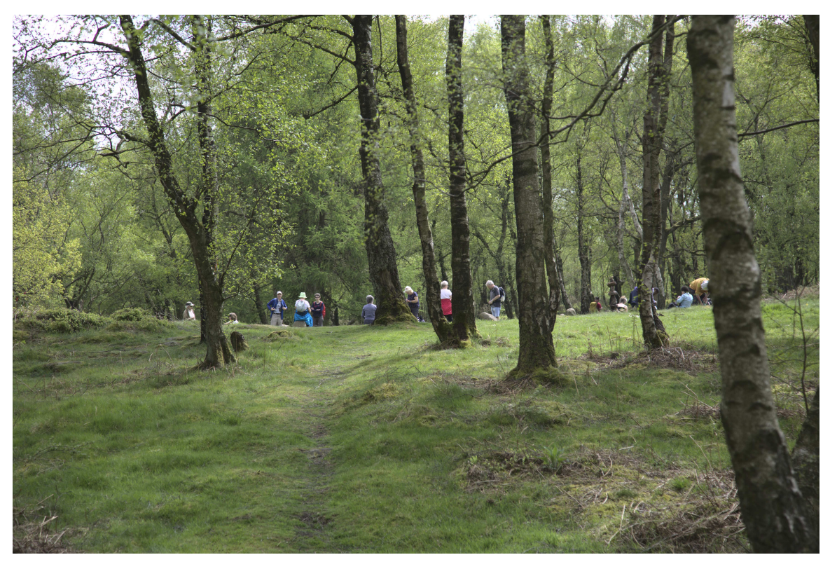
Trail through silver birch plantation.