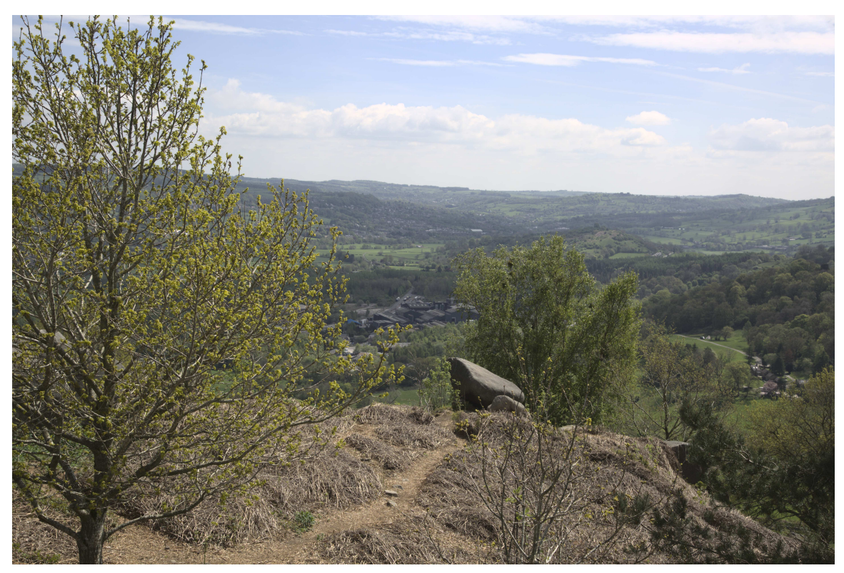
Works - Darley Bridge.