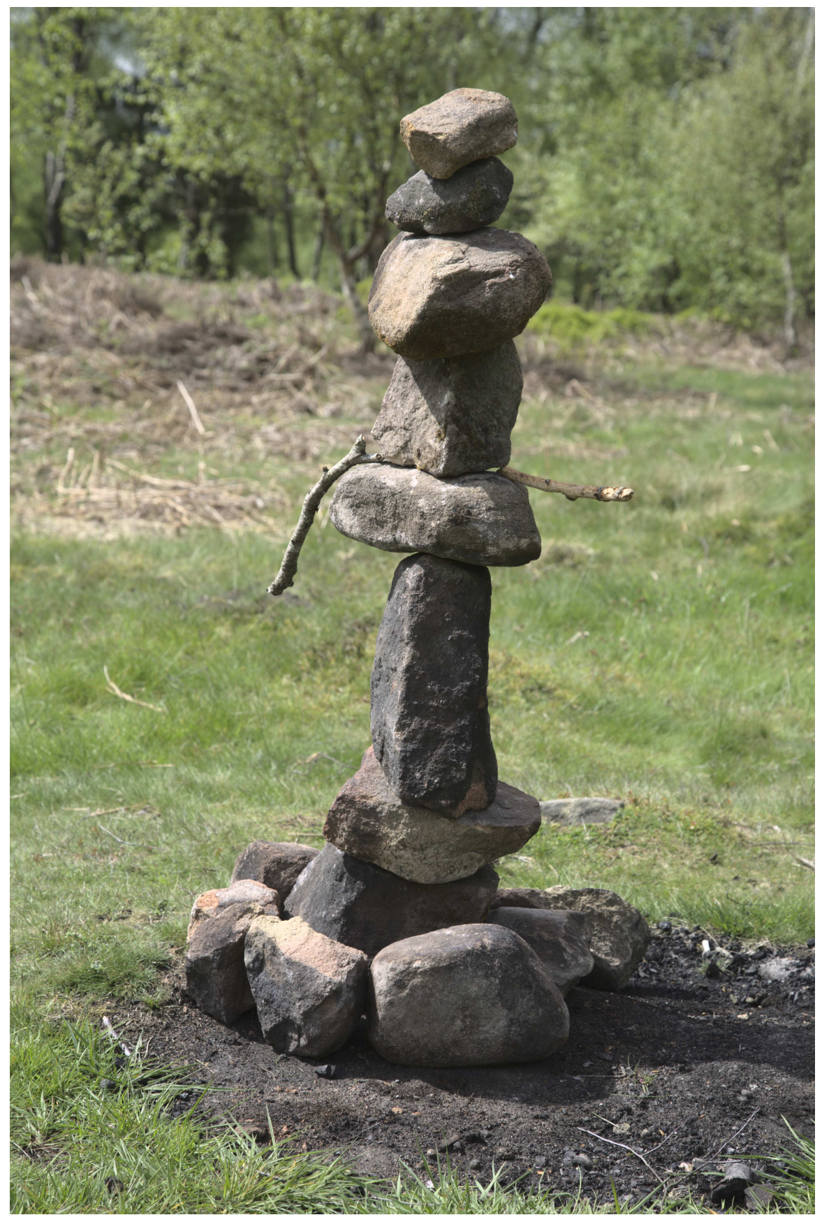
Stone balancing column.