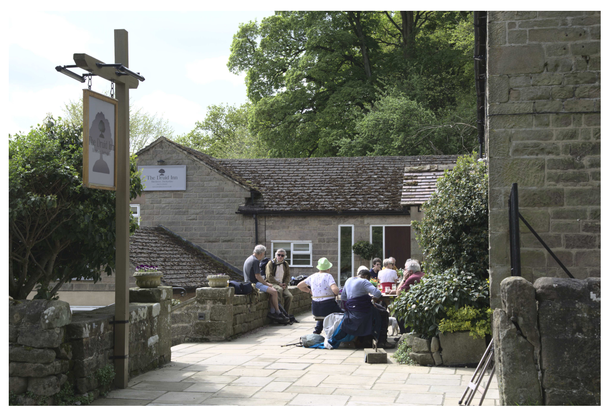
The Druid Inn.