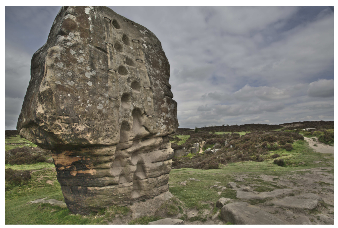
The Cork Stone.