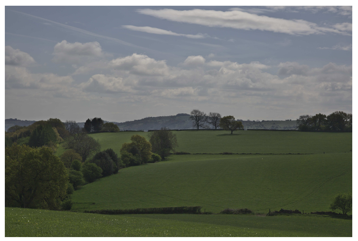
Darley Dale from Stanton Moor.