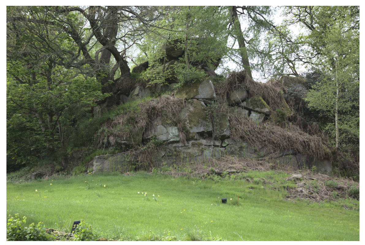
Disused quarry face.