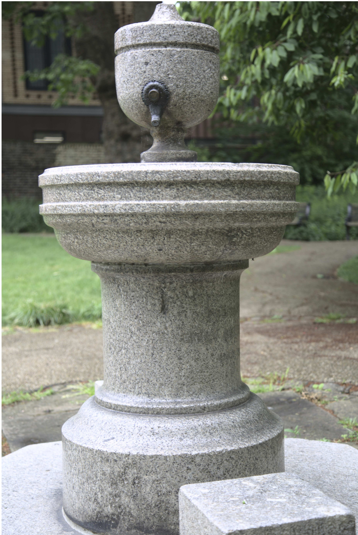
F47B4953 - Drinking Fountain - St. George's Gardens.