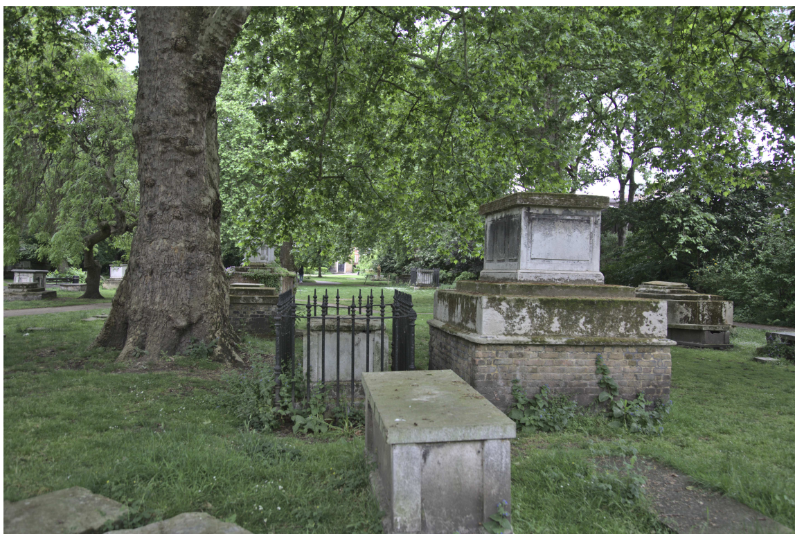
F47B4961 - Tombs - St. George's Gardens.