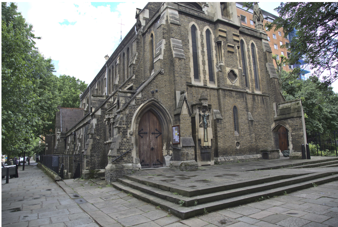
F47B4947 - Holy Cross Church.