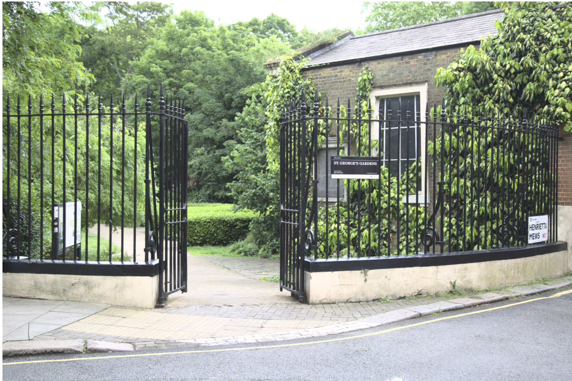
F47B4950 - St. George's Gardens.