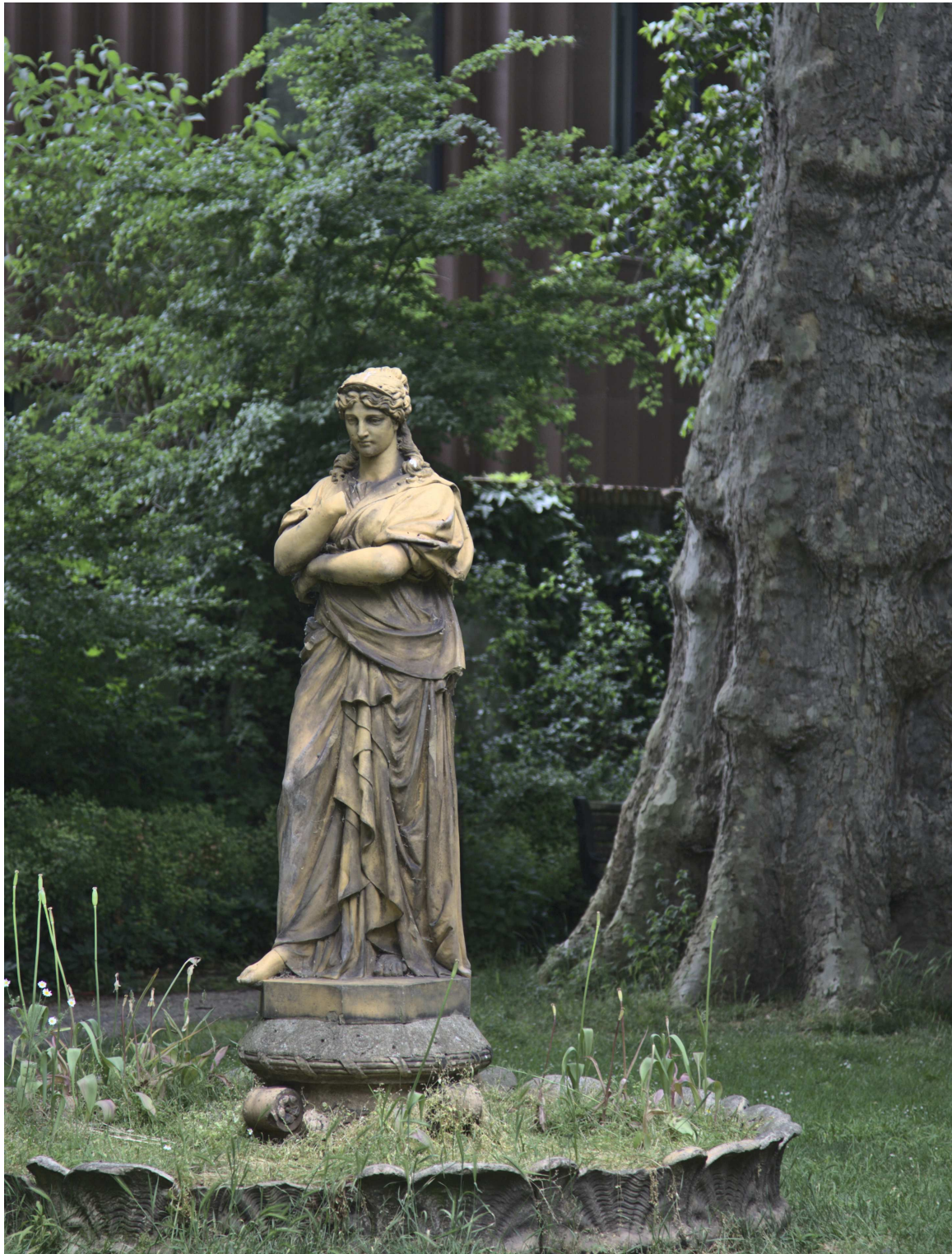
F47B4954 - Euterpe - St. George's Gardens.