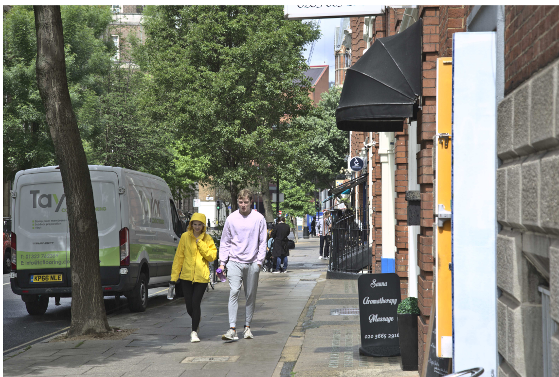
F47B4973 - Judd Street.