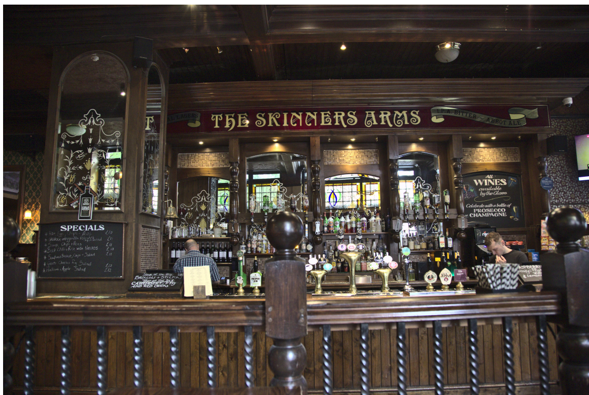
F47B4974 - The Skinners Arms - interior.