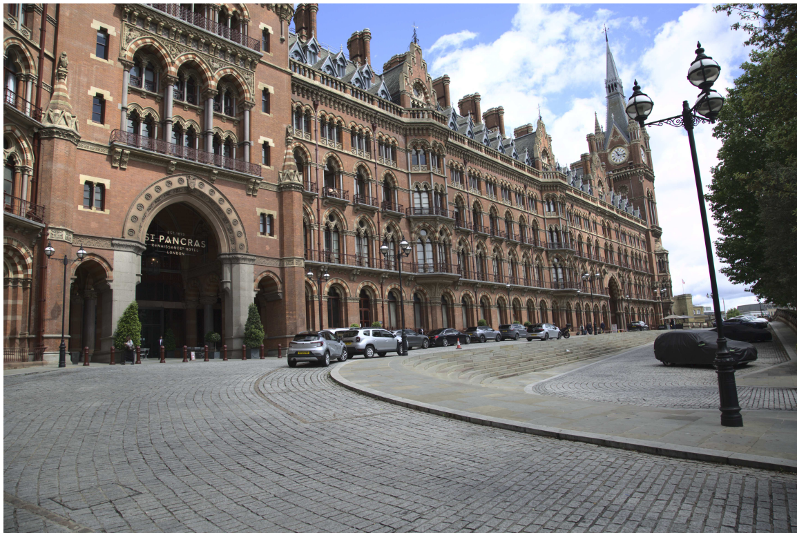
F47B4943 - St. Pancras Renaissance Hotel.