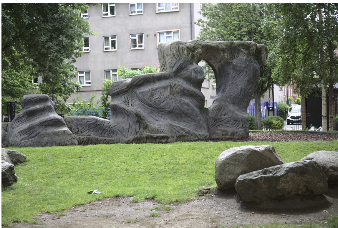
F47B4949 - Bramber Green.