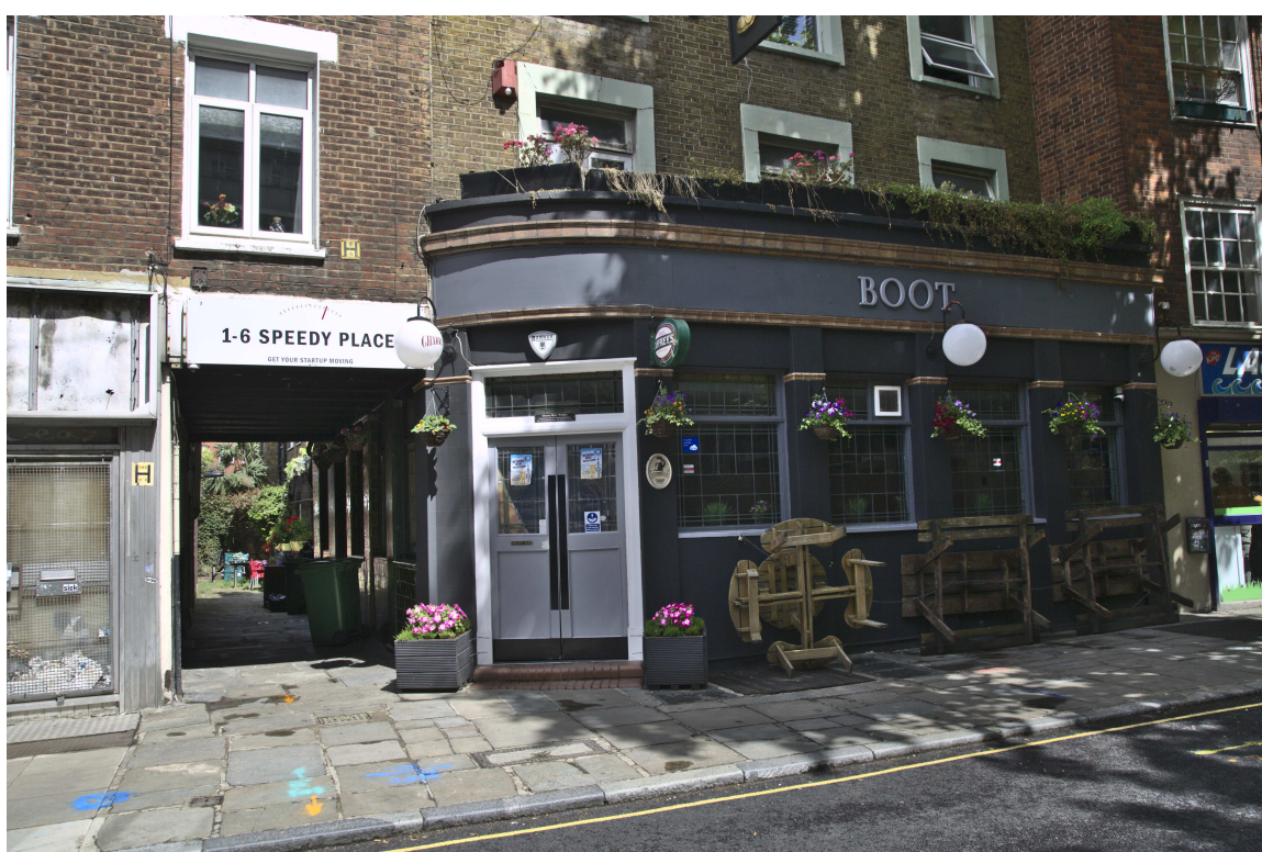
F47B4946 - Boot.