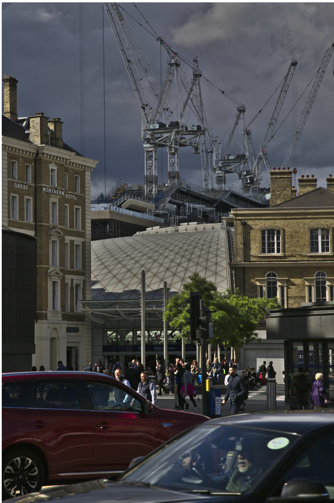
F47B4987 - Crane Towers behind The Great Northern Hotel.