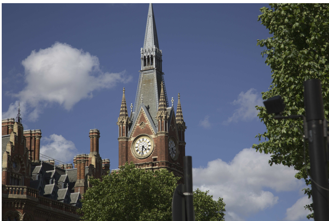
F47B4985 - Clock Tower - St. Pancras Station.