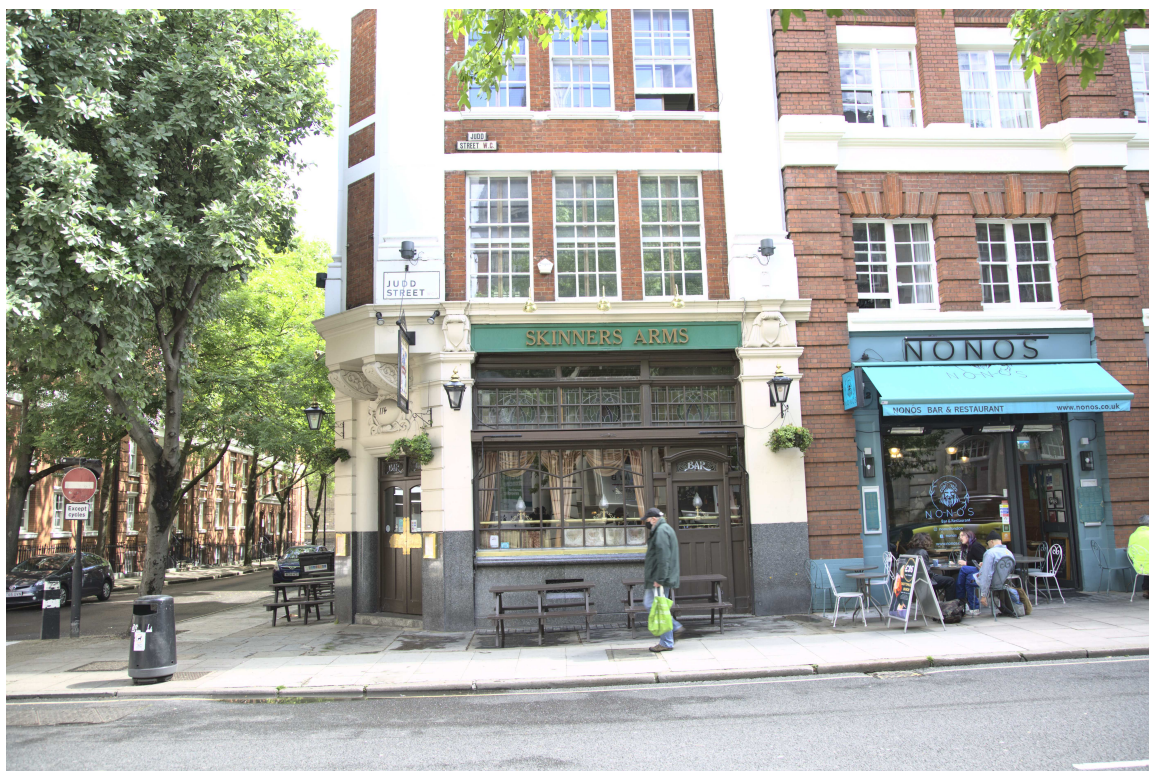
F47B4945 - The Skinners Arms.