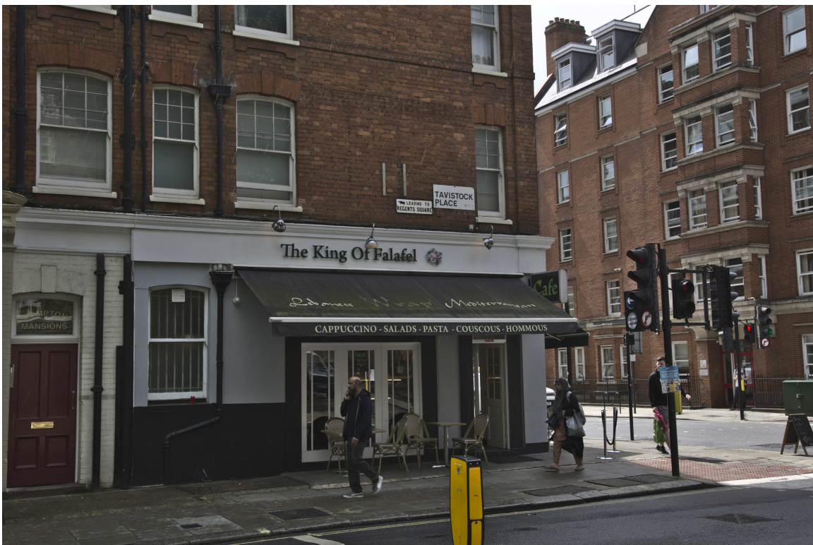
F47B4971 - The King of Falafel - Tavistock Place.