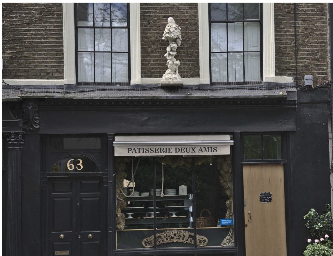
F47B4972 - Patisserie Deux Amis - Judd Street.