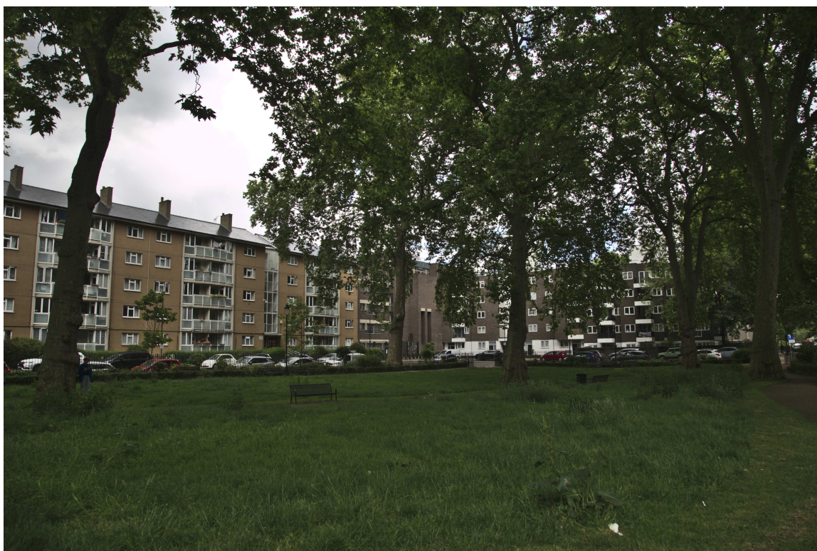
F47B4967 - Regent Square Gardens.