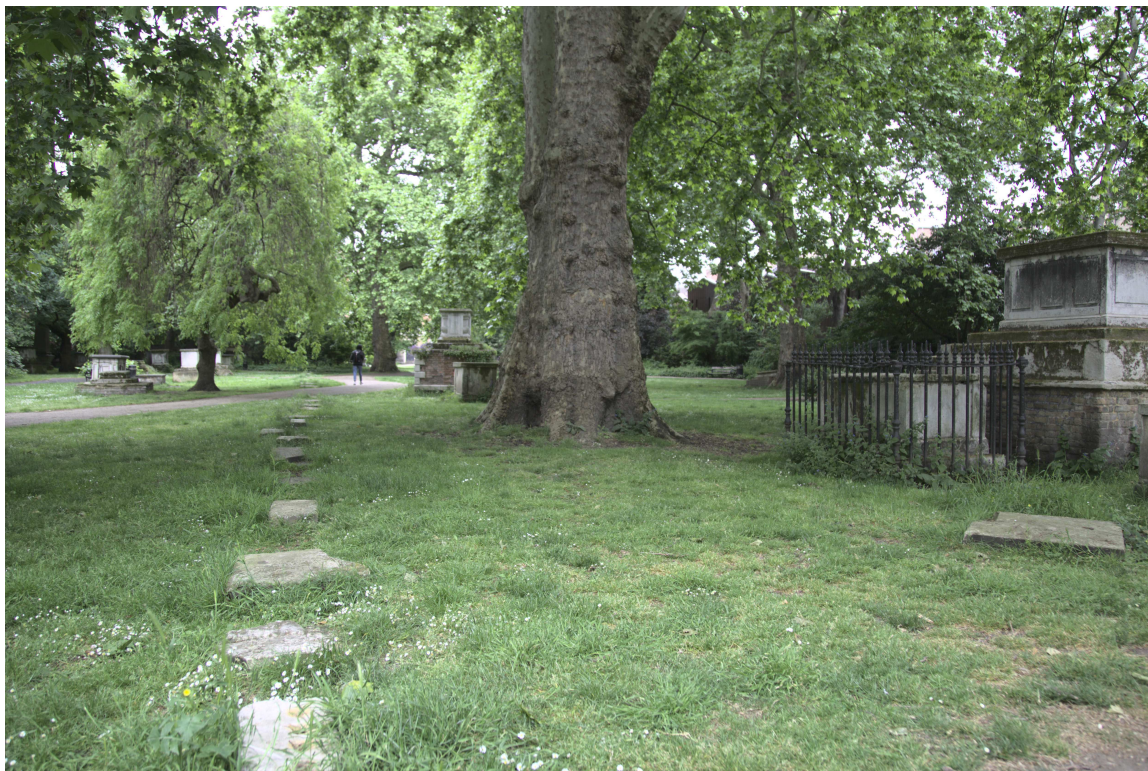
F47B4960 - The Dividing Wall - St. George's Gardens.