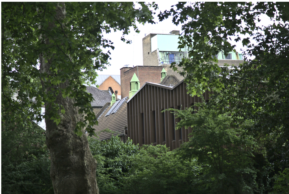
F47B4966 - View from St. George's Gardens.