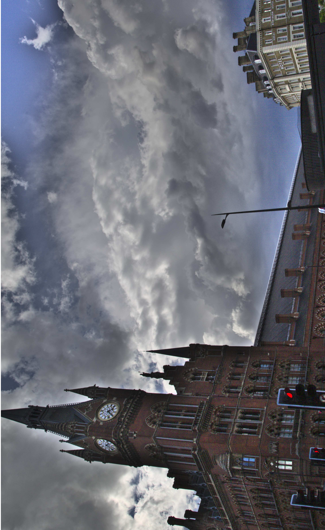
F47B4988 - Clock Tower - St. Pancras Station.