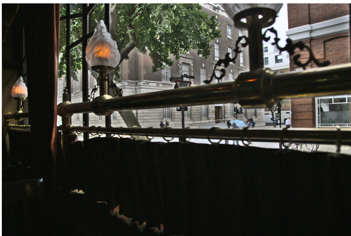
F47B4975 - Maggie from The Skinners Arms.