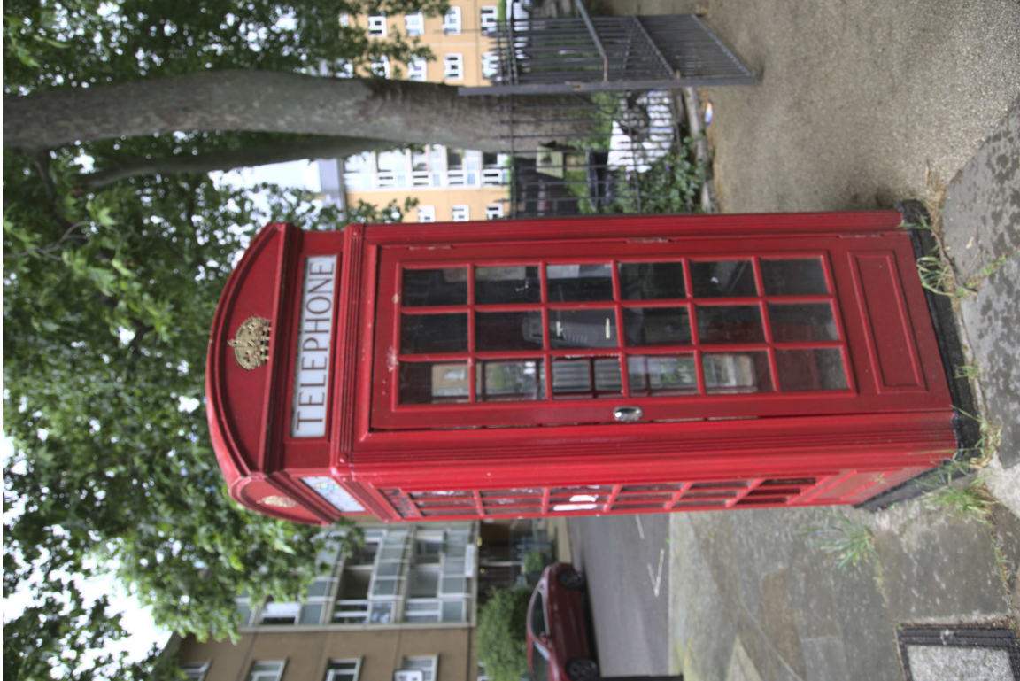
F47B4969 - Telephone kiosk.