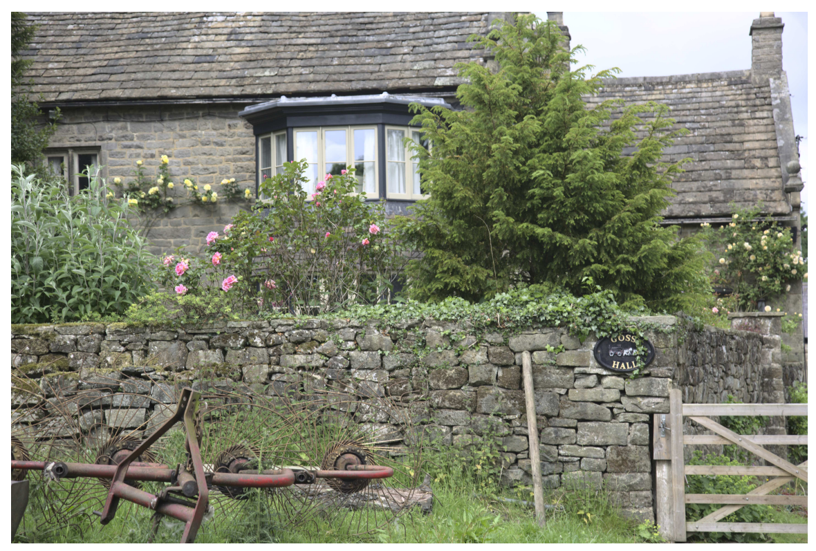
F47B5043 - Goss Hall.