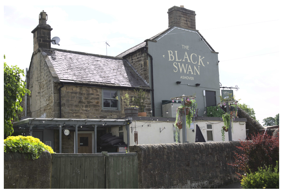
F47B5027 - The Black Swan.