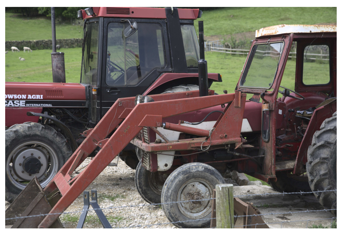
F47B5045 - Farm \ tractors.