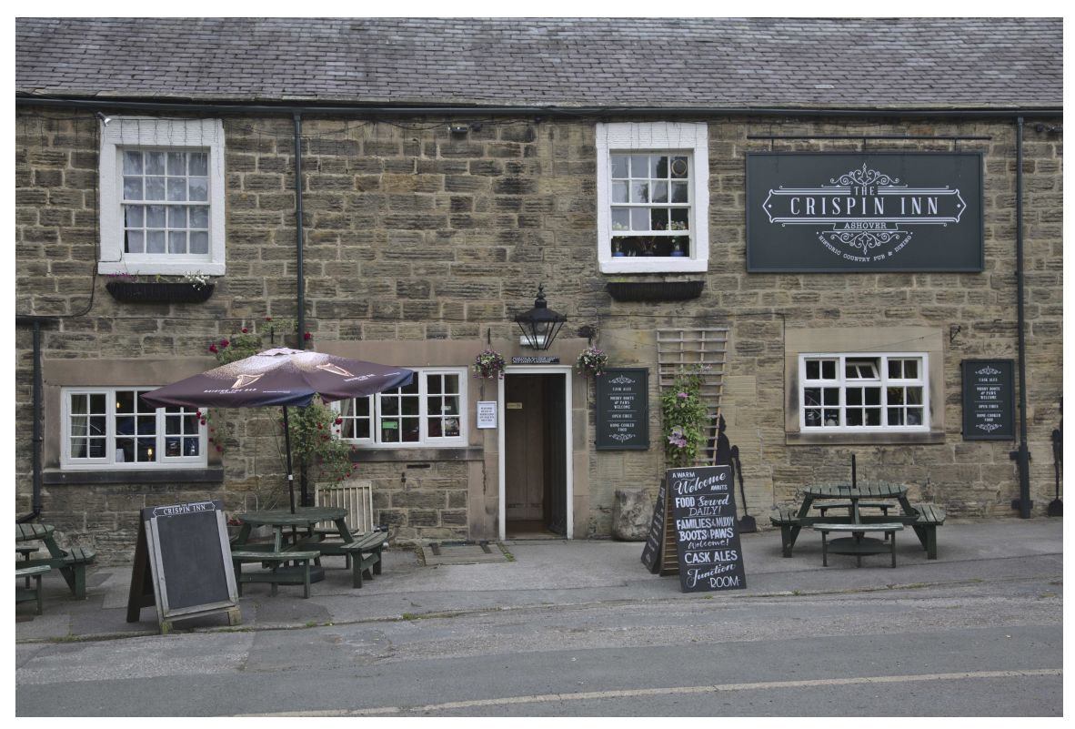
F47B5072 - The Crispin Inn.