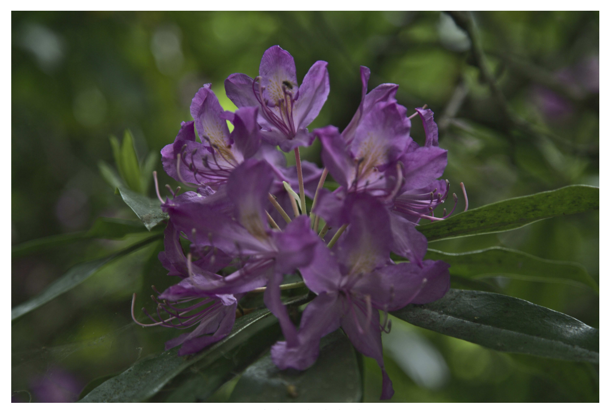
F47B5051 - Rhododendron.