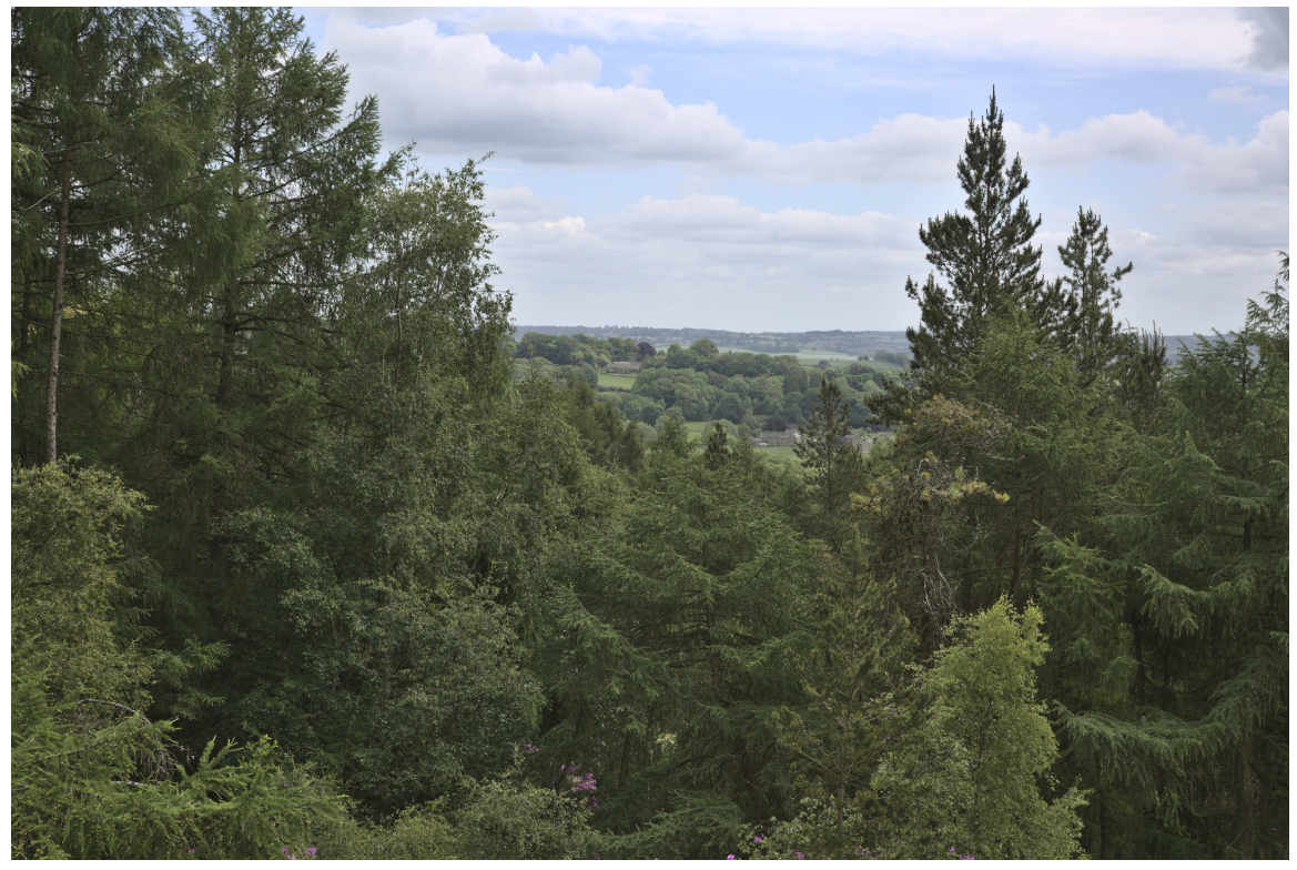
F47B5053 - Green vistas.