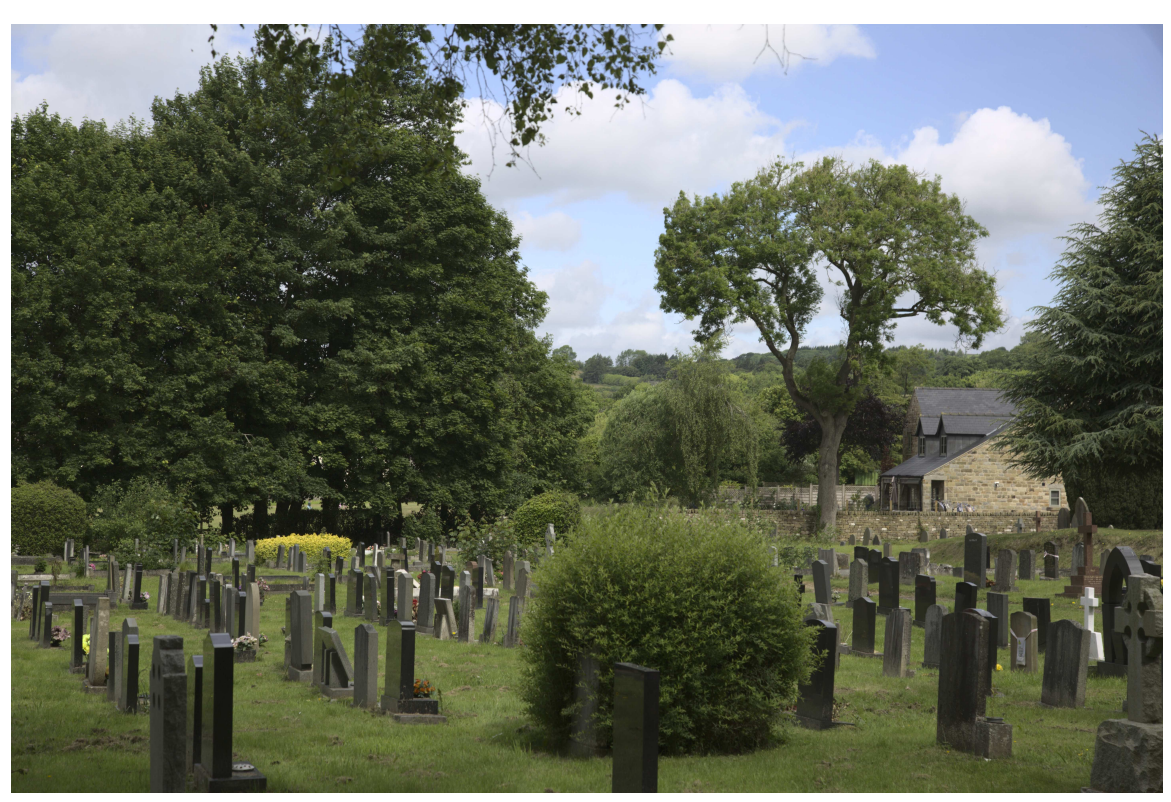
F47B5031 - Ashover Cemetery.