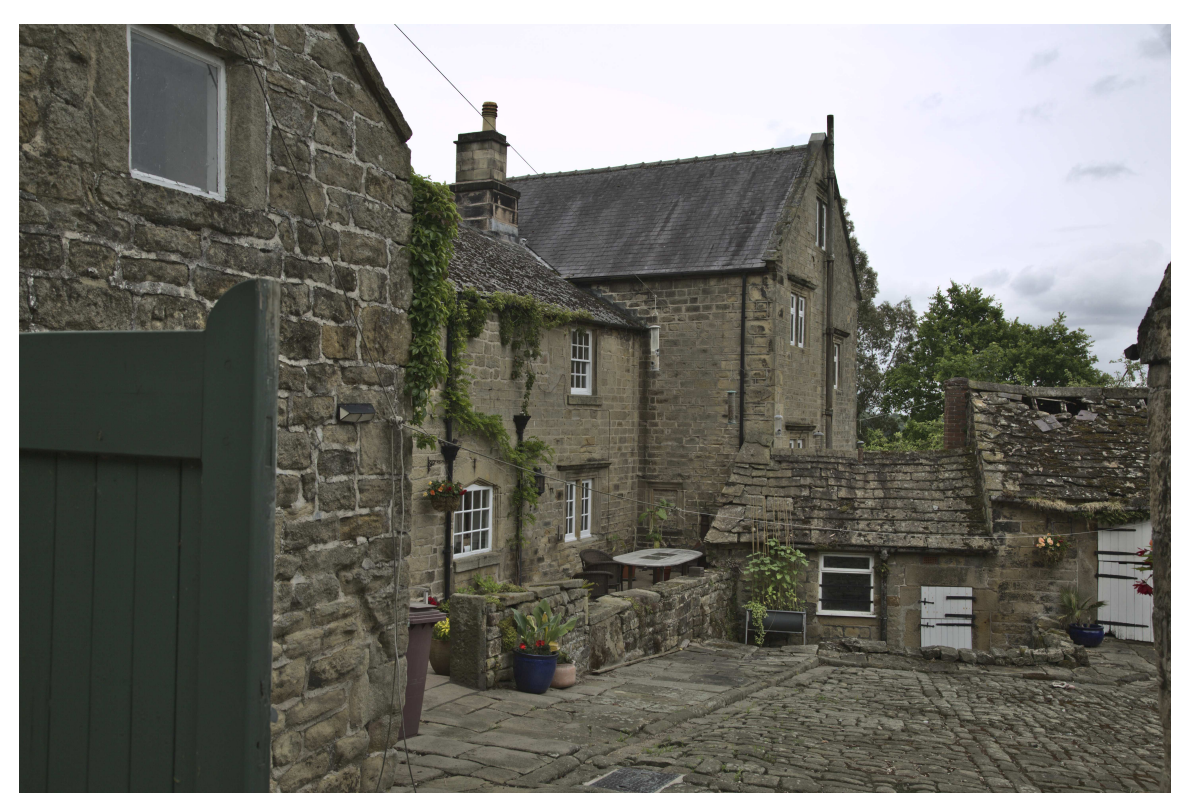
F47B5060 - Farrier's Cottage.