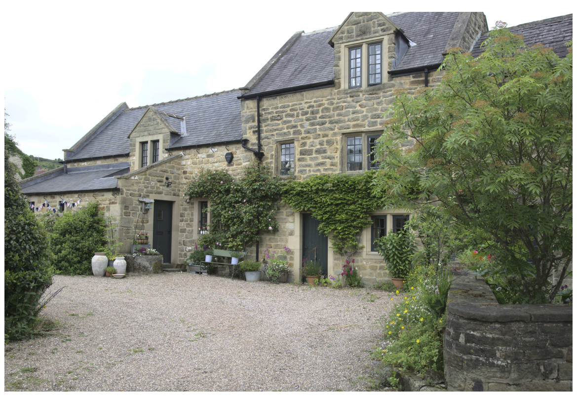
F47B5075 - Country Cottage.