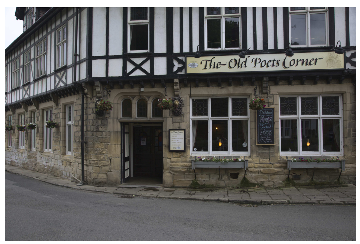
F47B5070 - The Old Poets Corner.