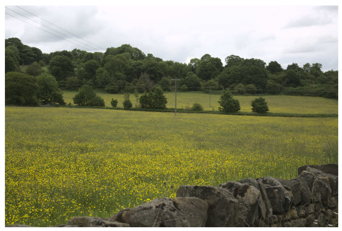
F47B5062 - Meadow Buttercups.