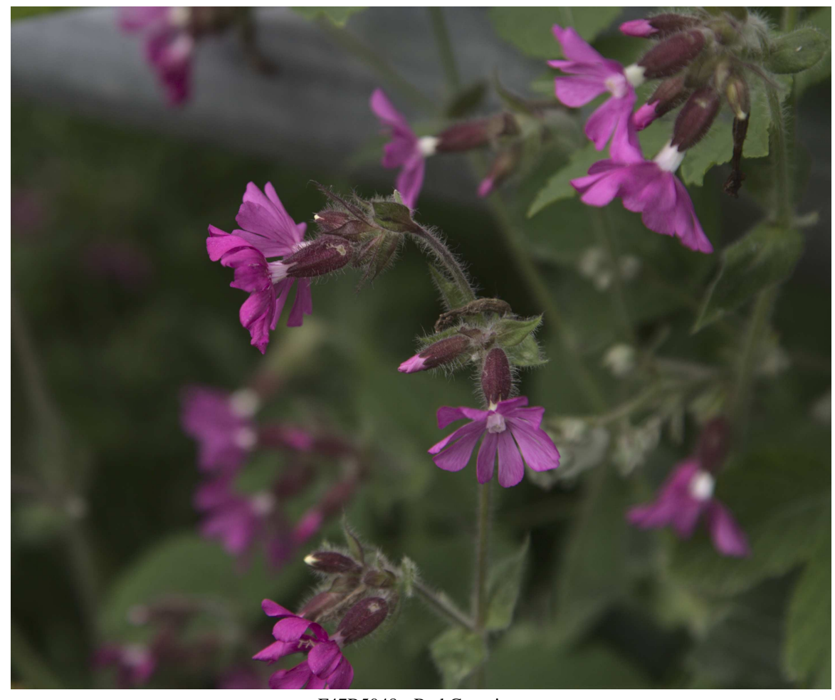
F47B5048 - Red Campion.