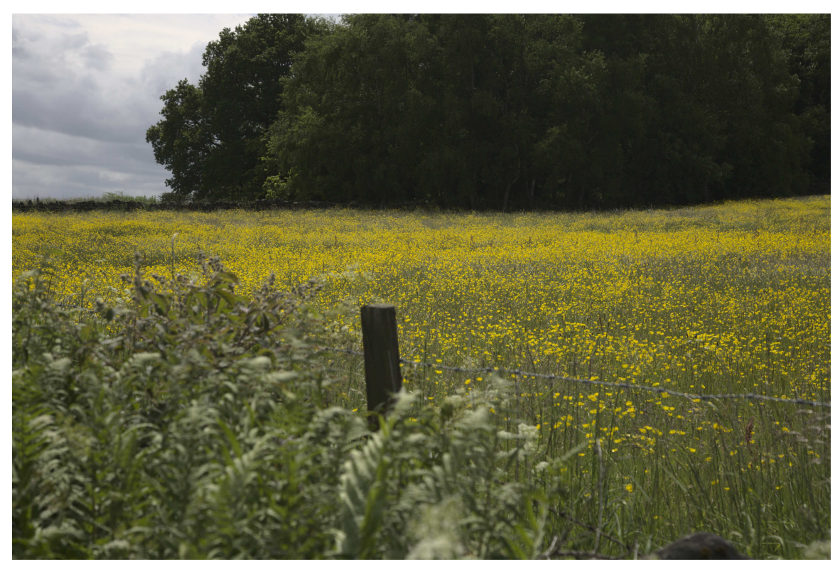
F47B5046 - Field of gold.