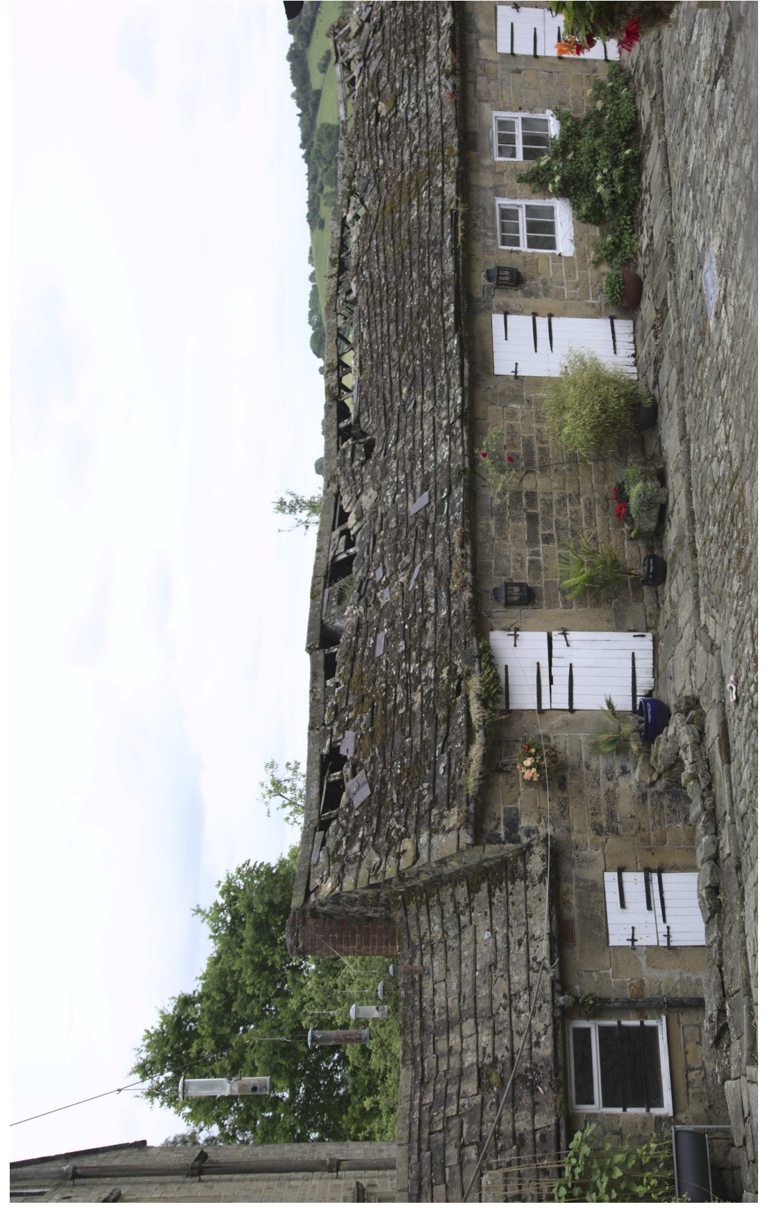
F47B5061 - Stable block.