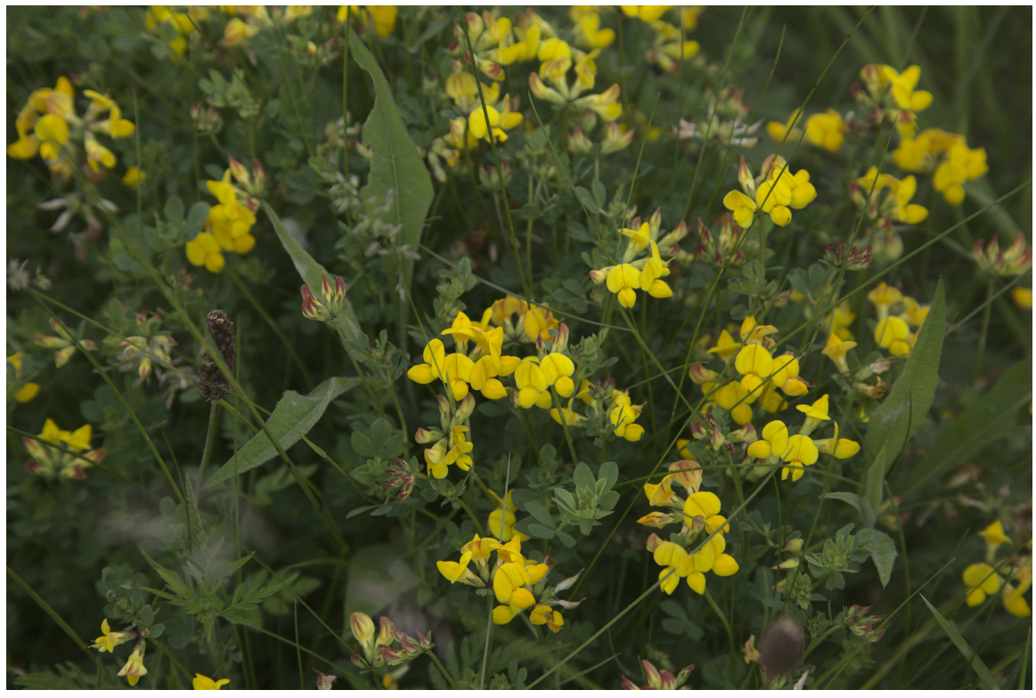
F47B5065 - Nestling yellow.