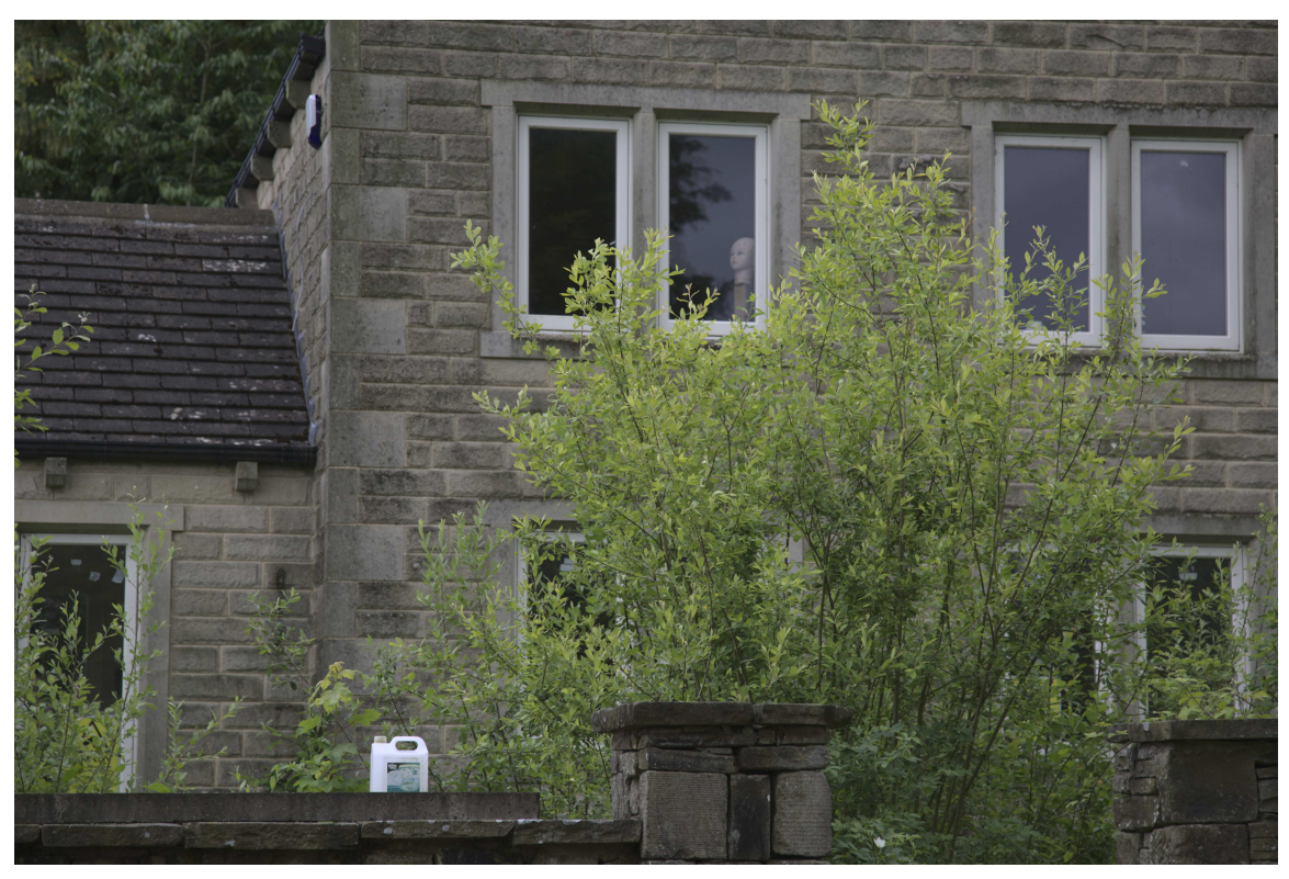
F47B5057 - Mysterious house.