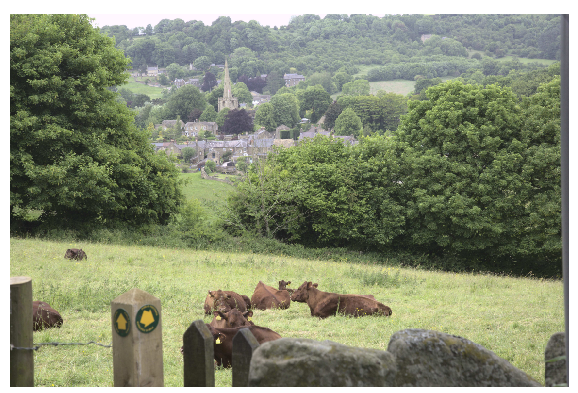
F47B5068 - Village in the green.