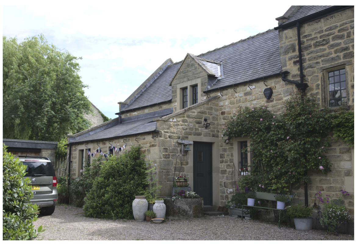
F47B5028 - Cottage.