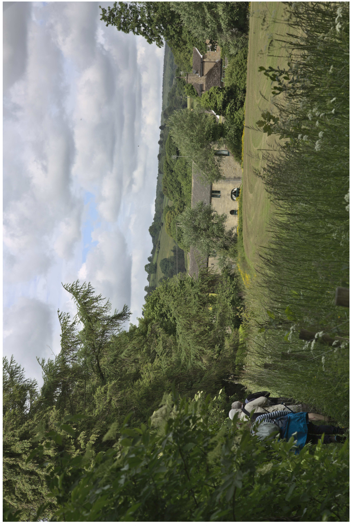
F47B5032 - Toward Narrowleys Lane.