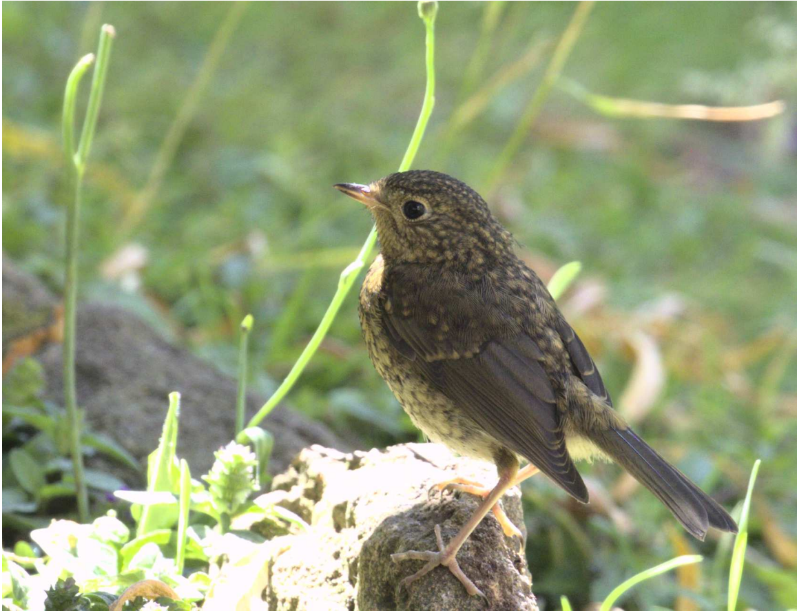
F47B5079 - Juvenile robin.