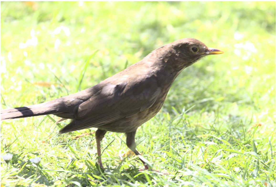
F47B5090 - Blackbird.