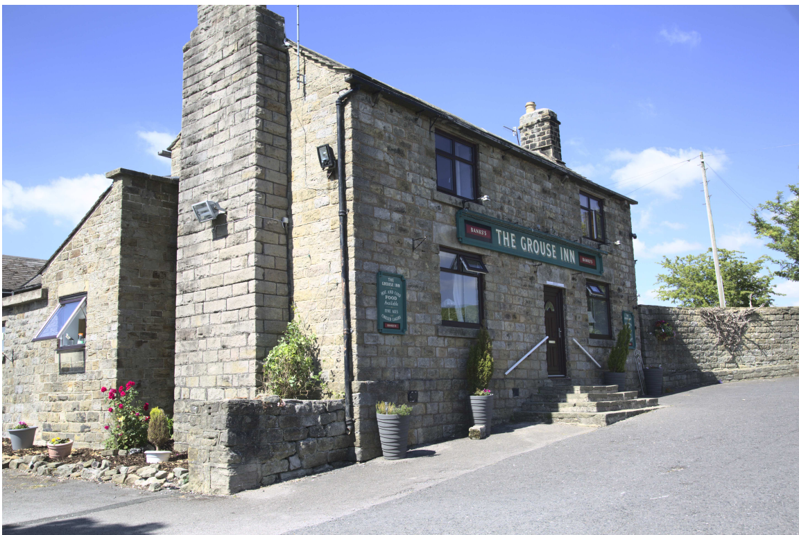
F47B5129 - The Grouse Inn.