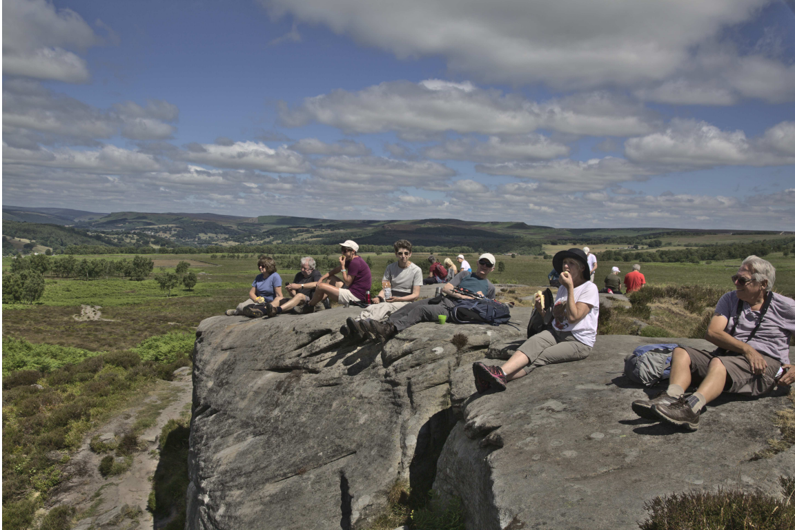
F47B5121 - Taking a break on a gritstone edge.