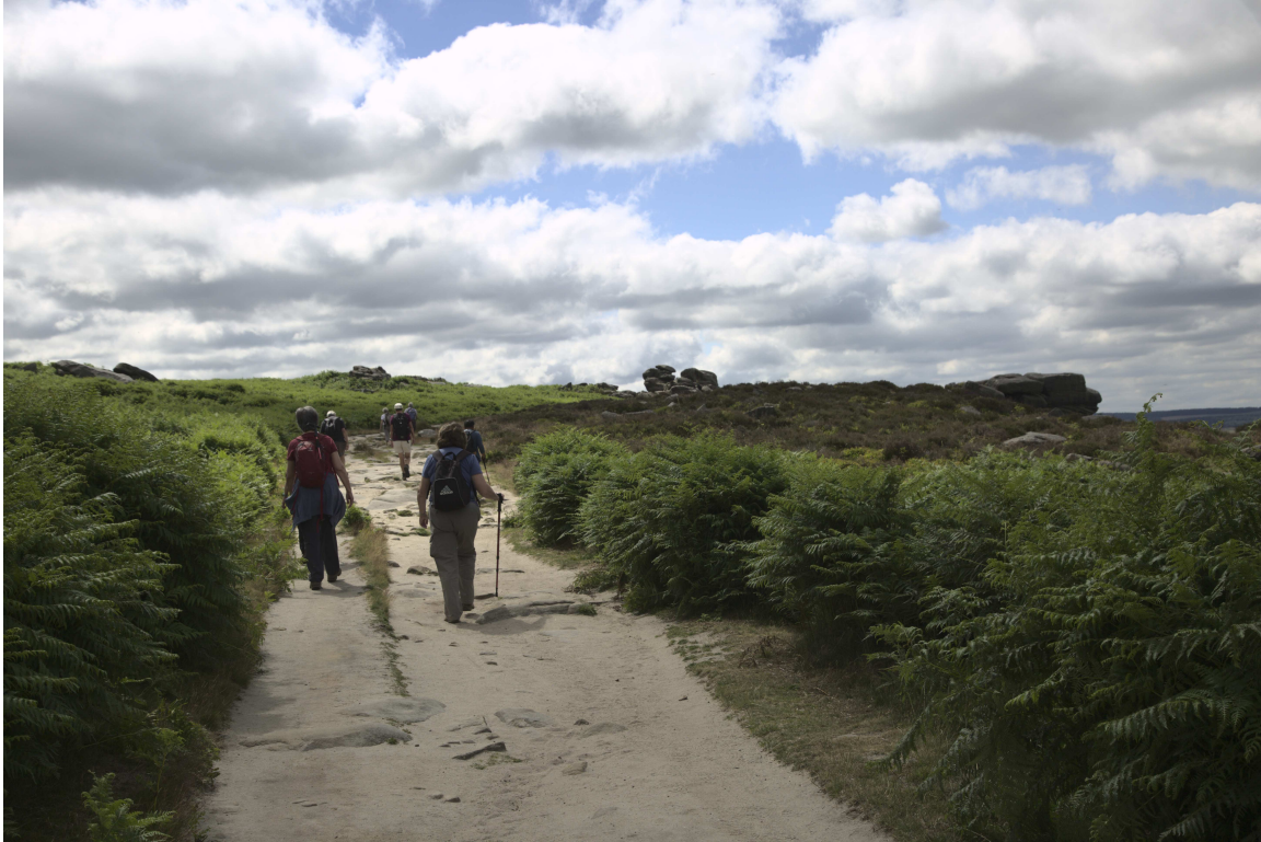
F47B5107 - Froggat Edge.