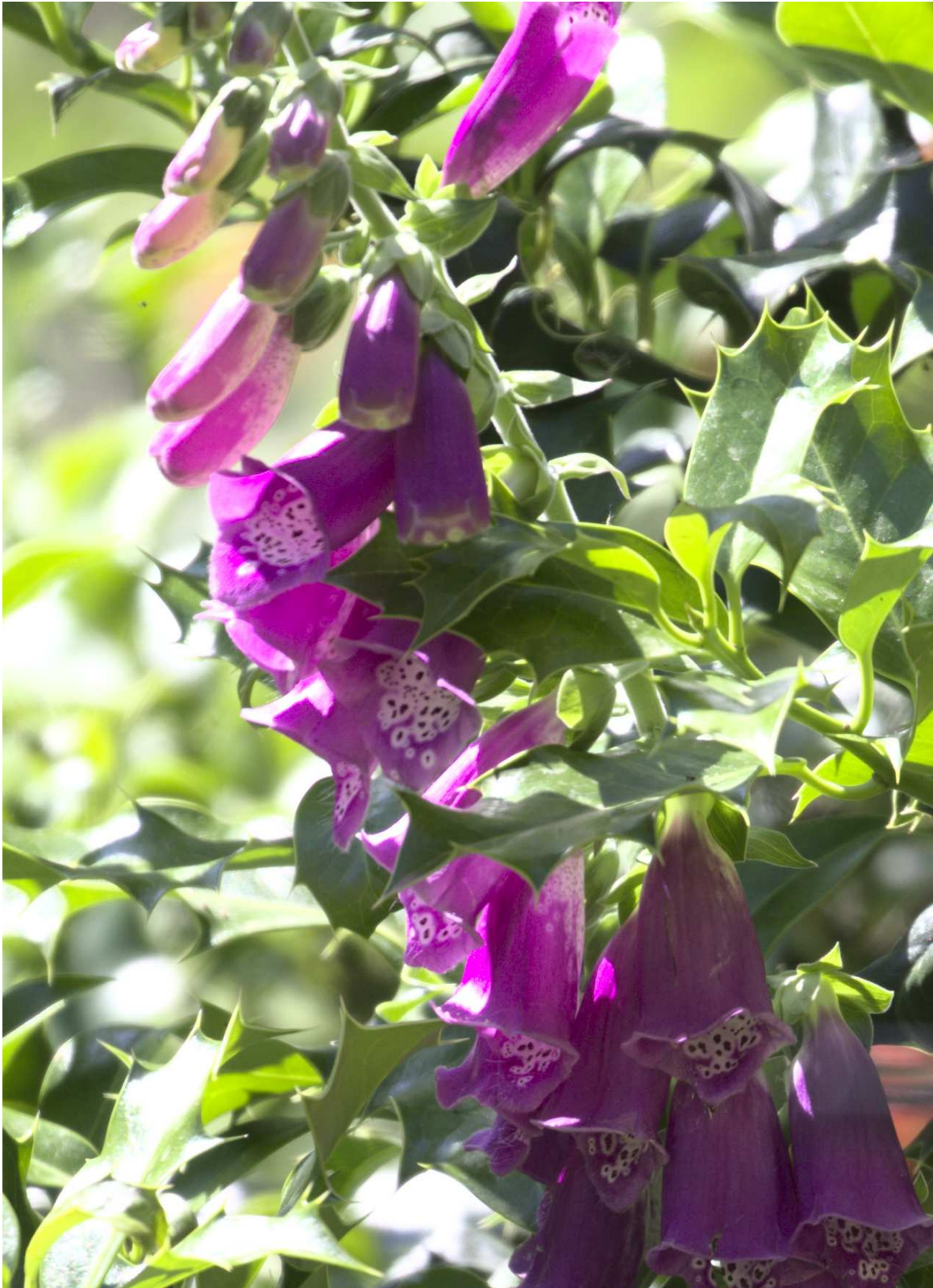
F47B5105 - Fox glove.