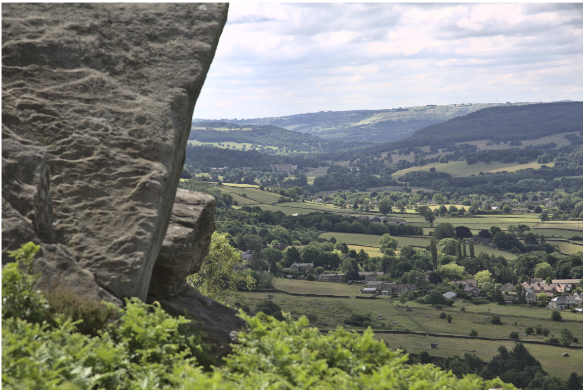
F47B5118 - Gritstone Rocks.