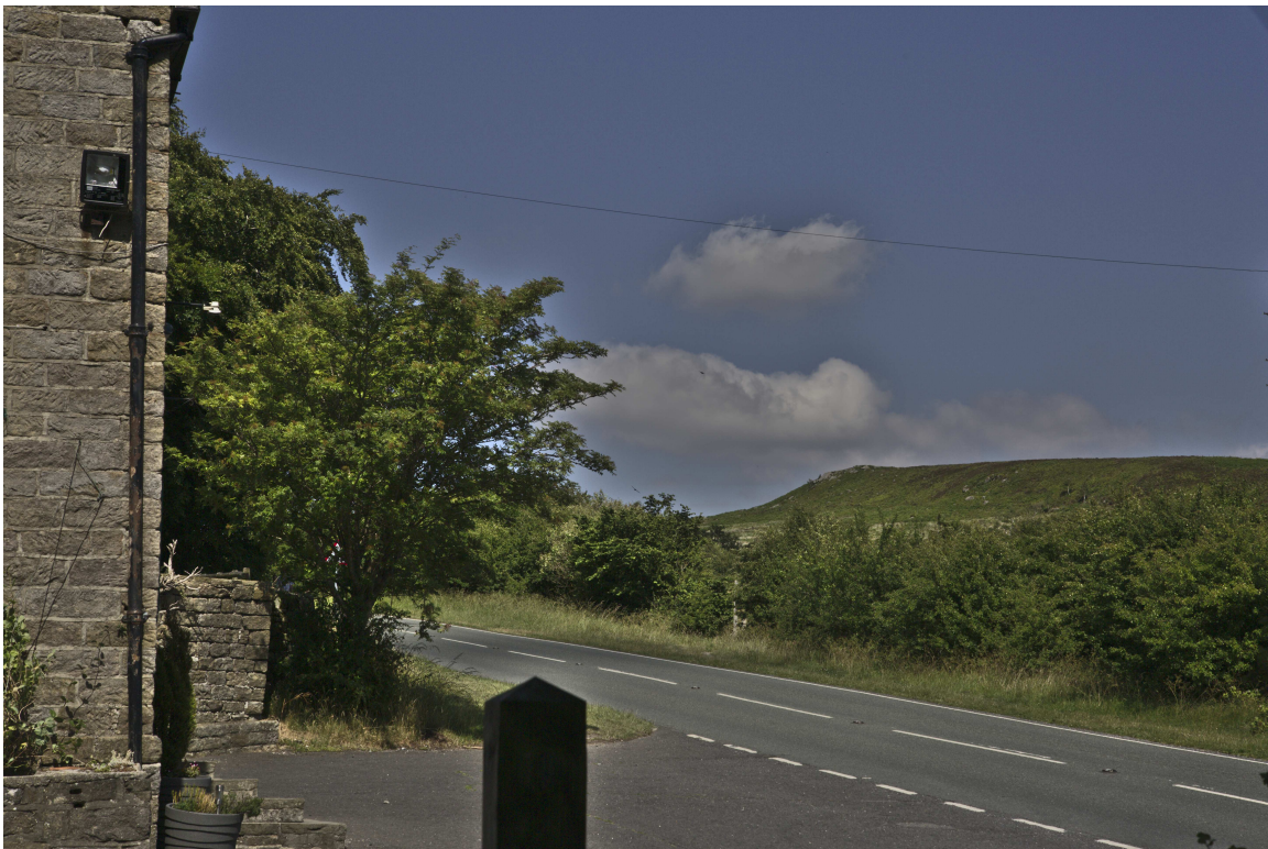
F47B5133 - White Edge Moor.