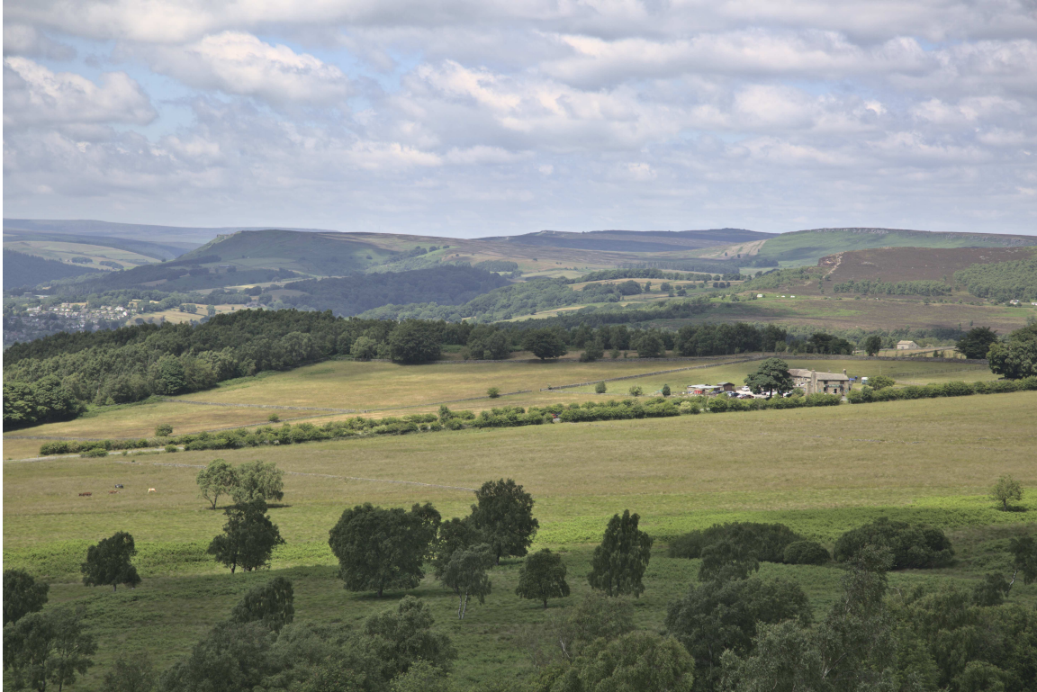
F47B5128 - The Grouse Inn.