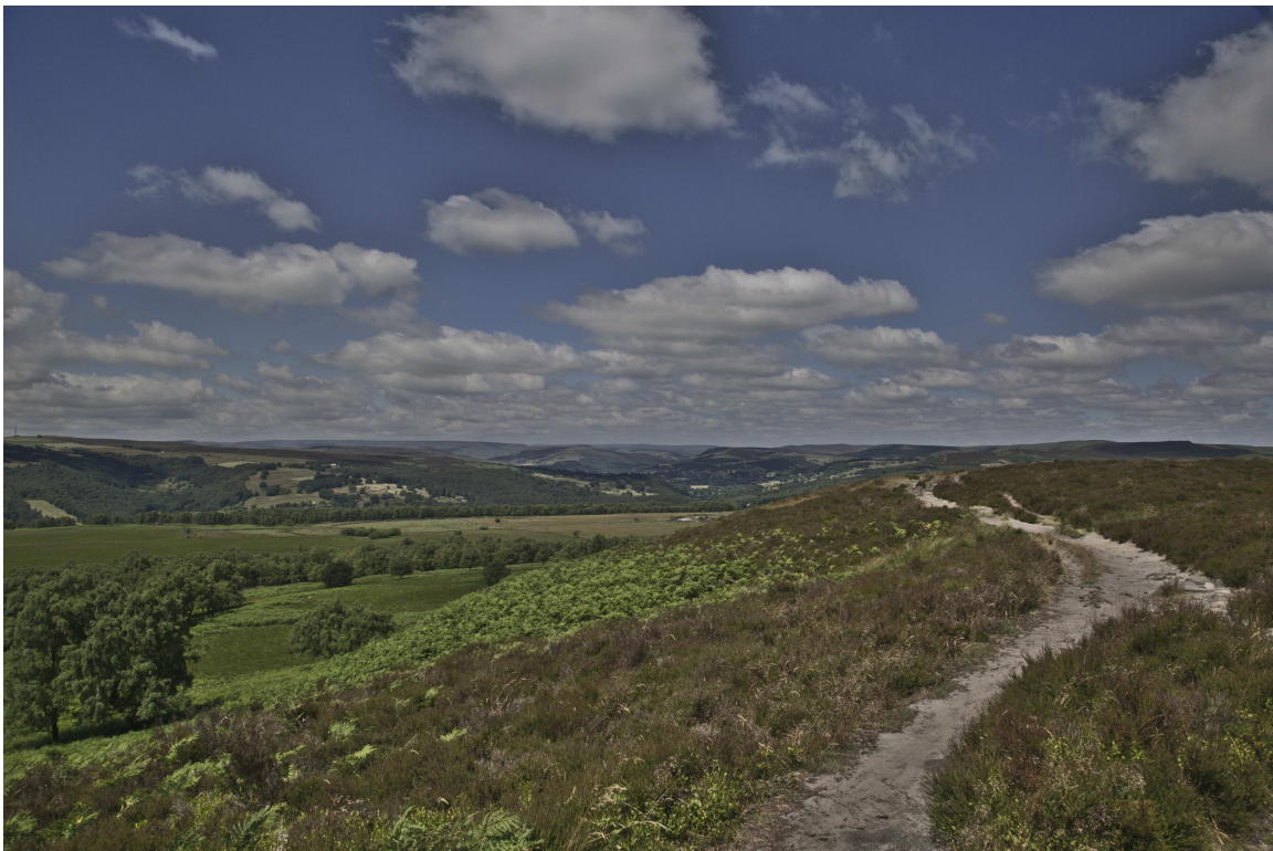
F47B5124 - White Edge of Derwent Valley.