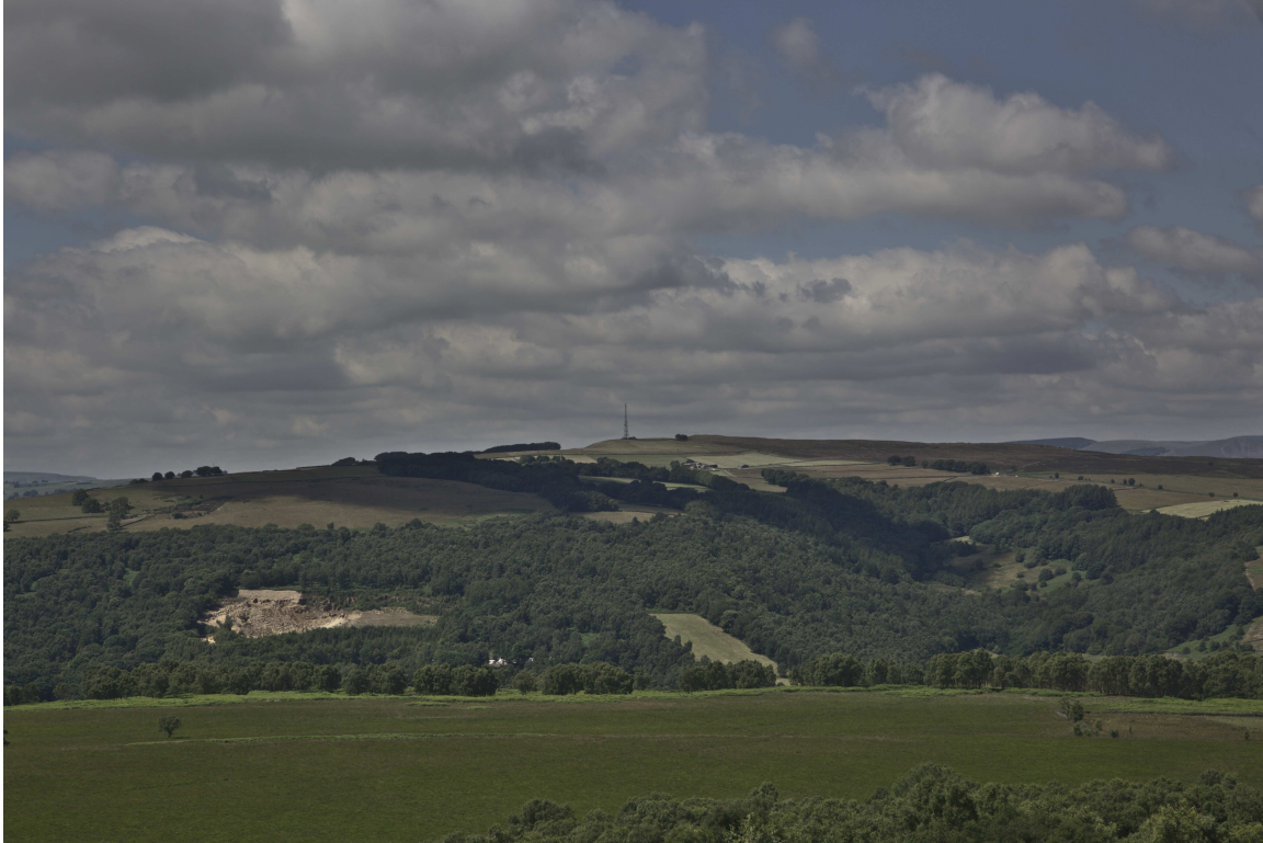
F47B5125 - Calver Peak.