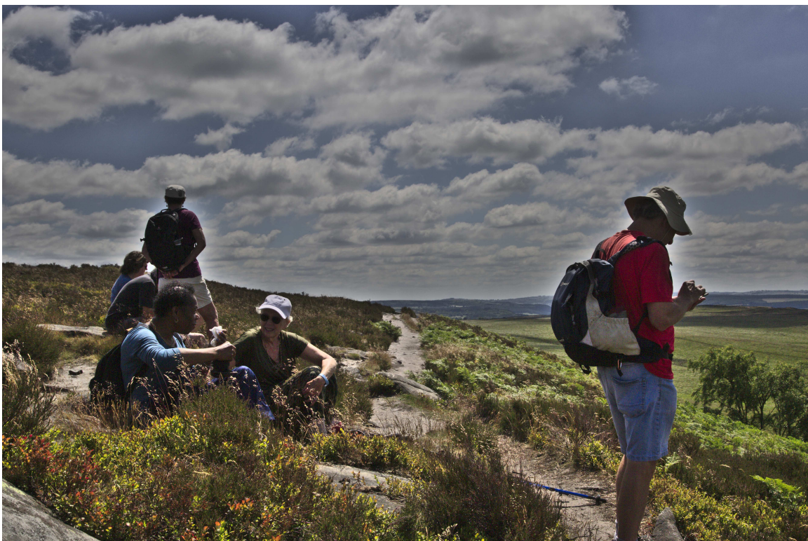
F47B5127 - A rest on White Stone Edge.