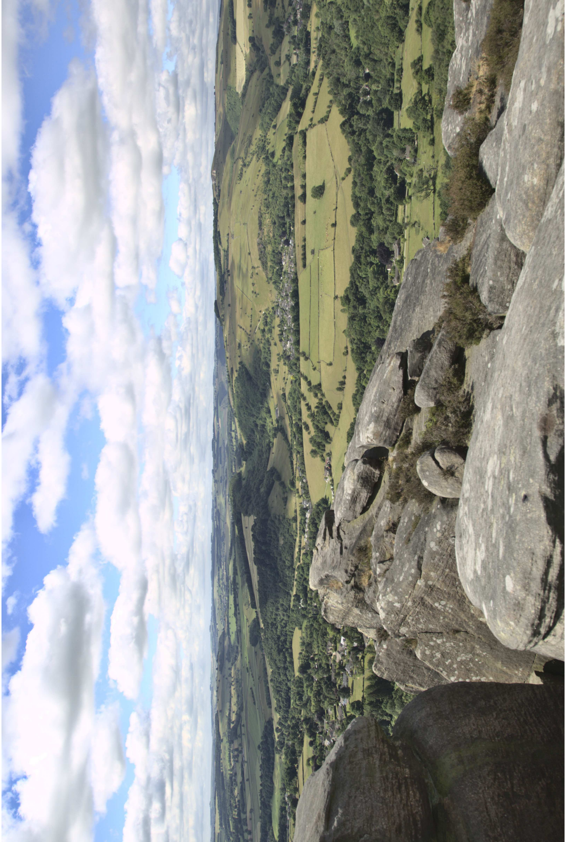
F47B5119 - Gritstone Rocks.