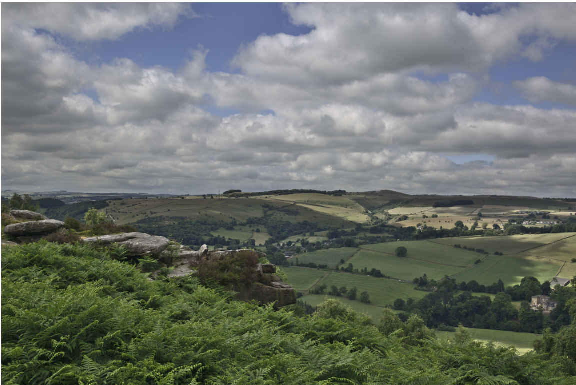
F47B5108 - Froggat Edge.