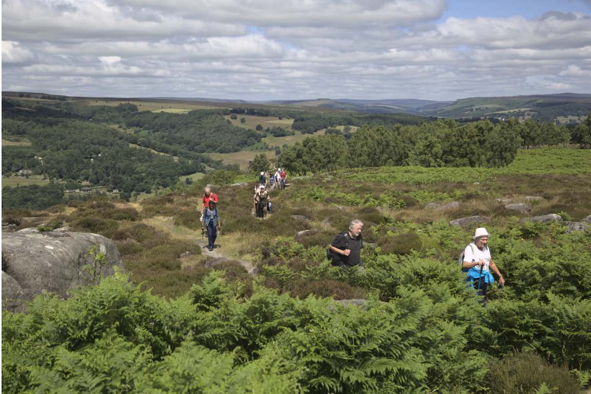
F47B5115 - Walking Group.