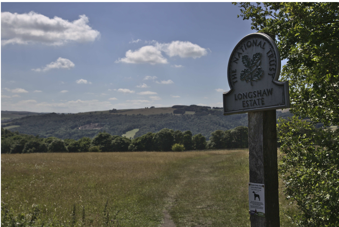
F47B5134 - Longshaw Estate.