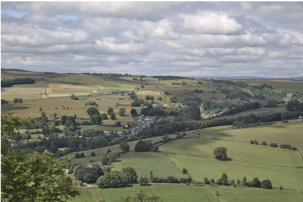
F47B5113 - Froggat.