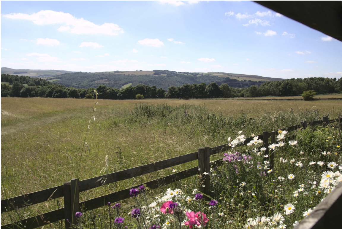
F47B5130 - Flowers at The Grouse Inn.