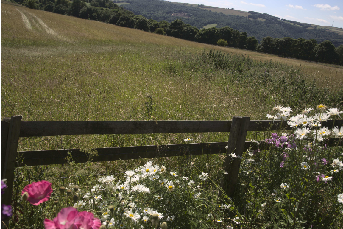
F47B5132 - Flowers at The Grouse Inn.