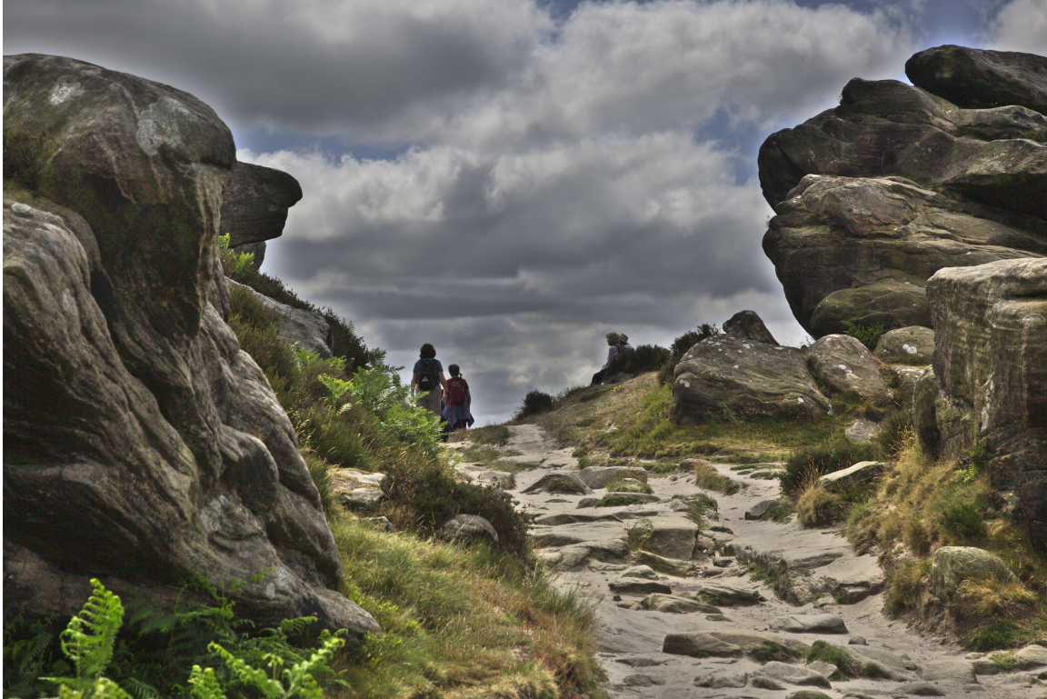
F47B5112 - Froggat Edge.