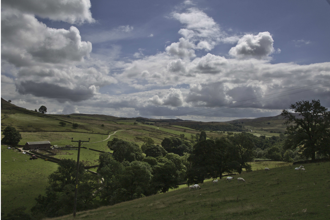
F47B5292 - Dane Valley Way.