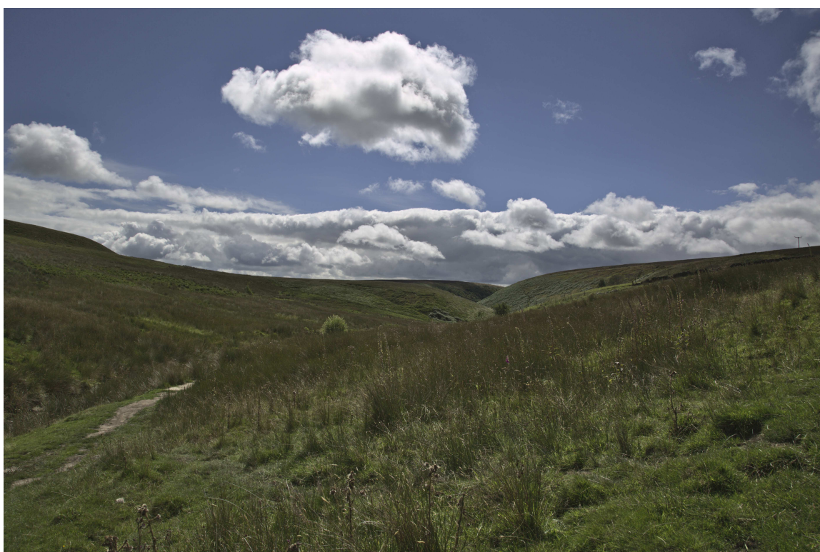
F47B5269 - Dane Valley Way.