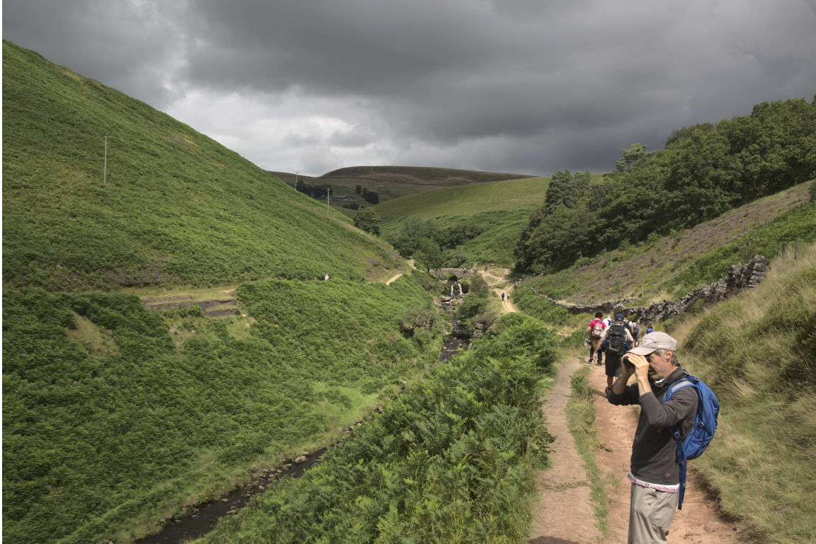
F47B5263 - Dane Valley Way.