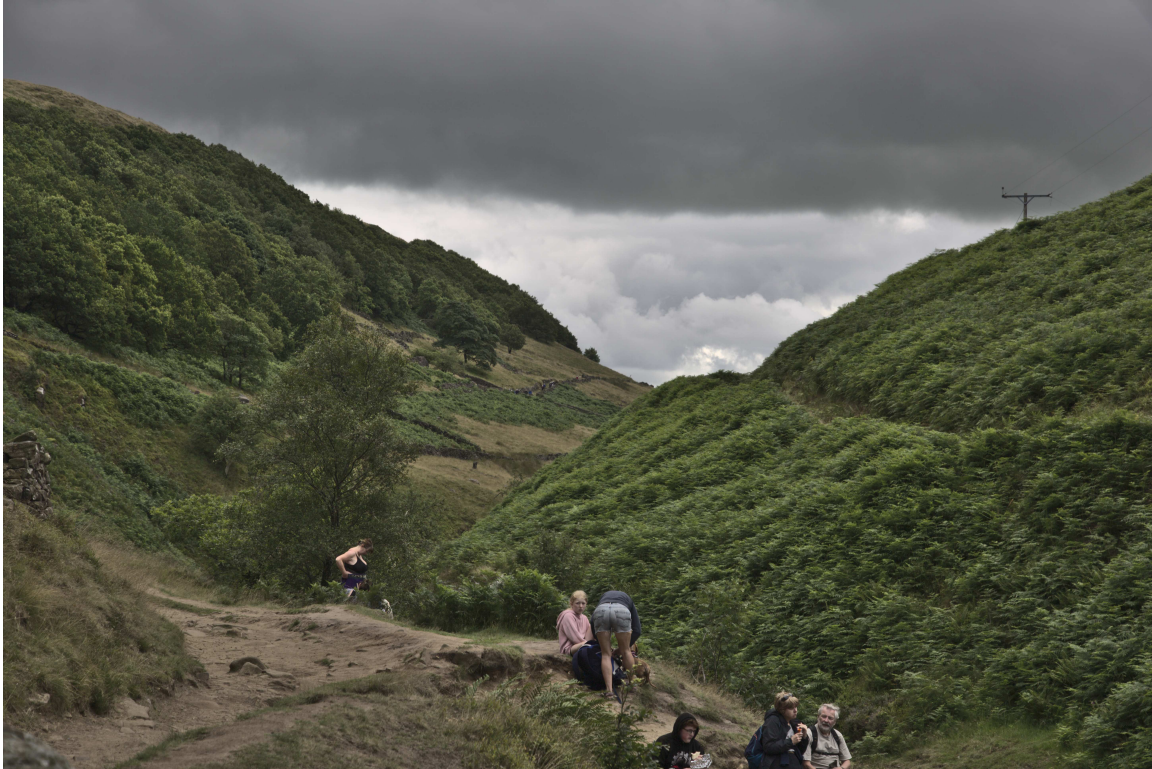
F47B5282 - Panniers Pool.