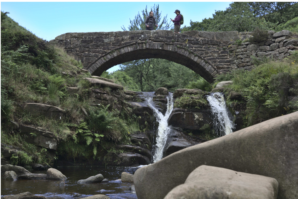
F47B5286 - Packhorse Bridge.