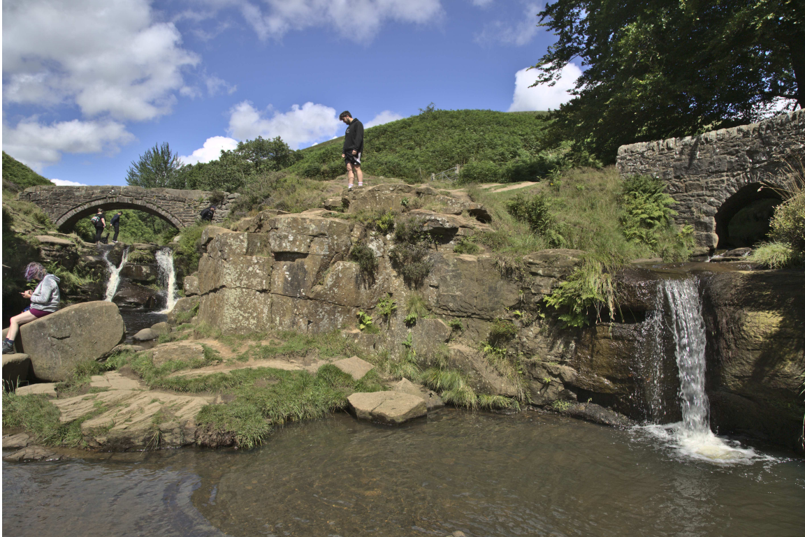
F47B5287 - Panniers Pool.