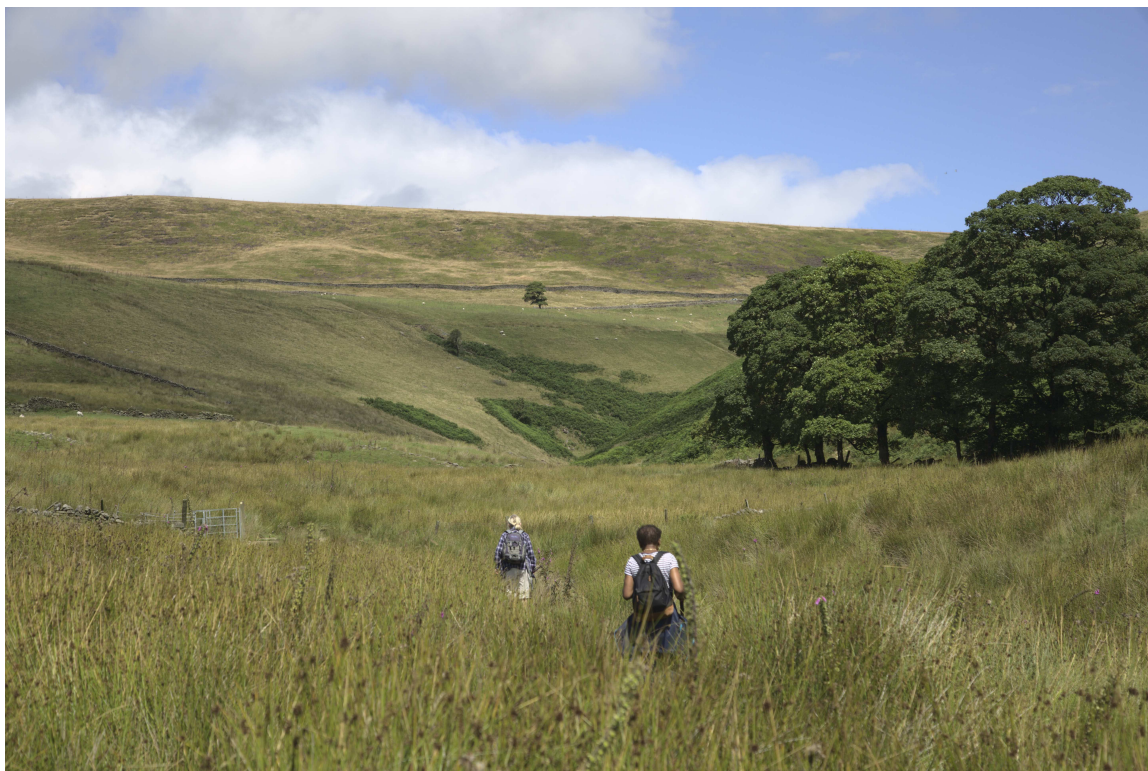
F47B5266 - Dane Valley Way.