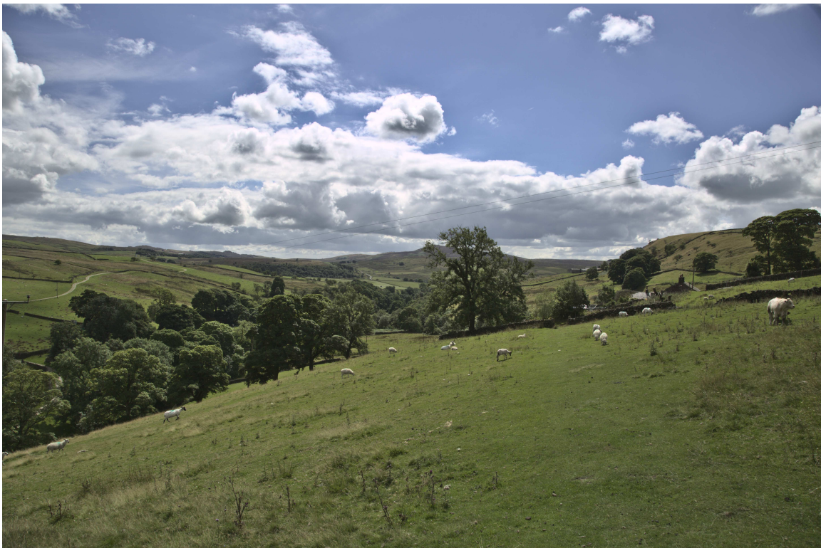
F47B5290 - Dane Valley Way.