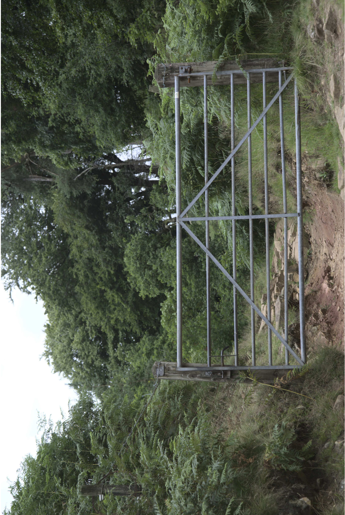
F47B5281 - Steel gate.