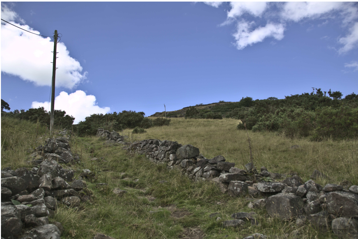
F47B5293 - Dane Valley Way.