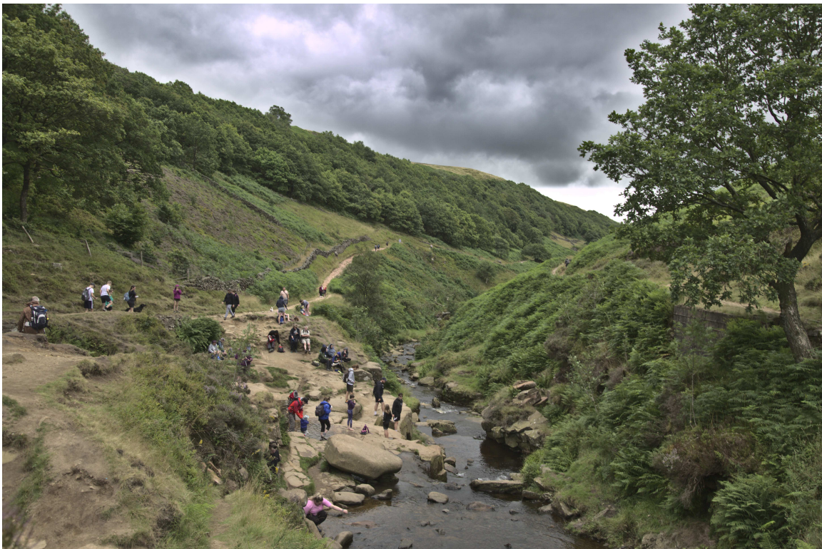
F47B5280 - Panniers Pool.