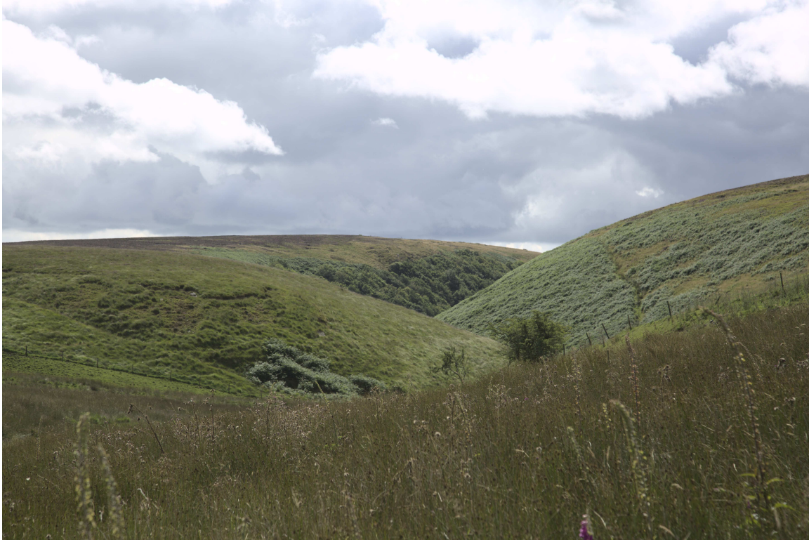
F47B5270 - Dane Valley Way.