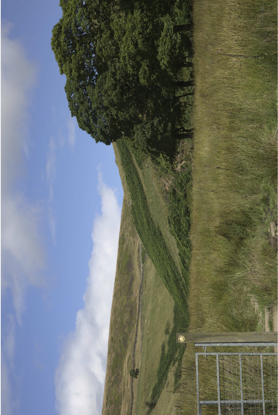
F47B5267 - Dane Valley Way.