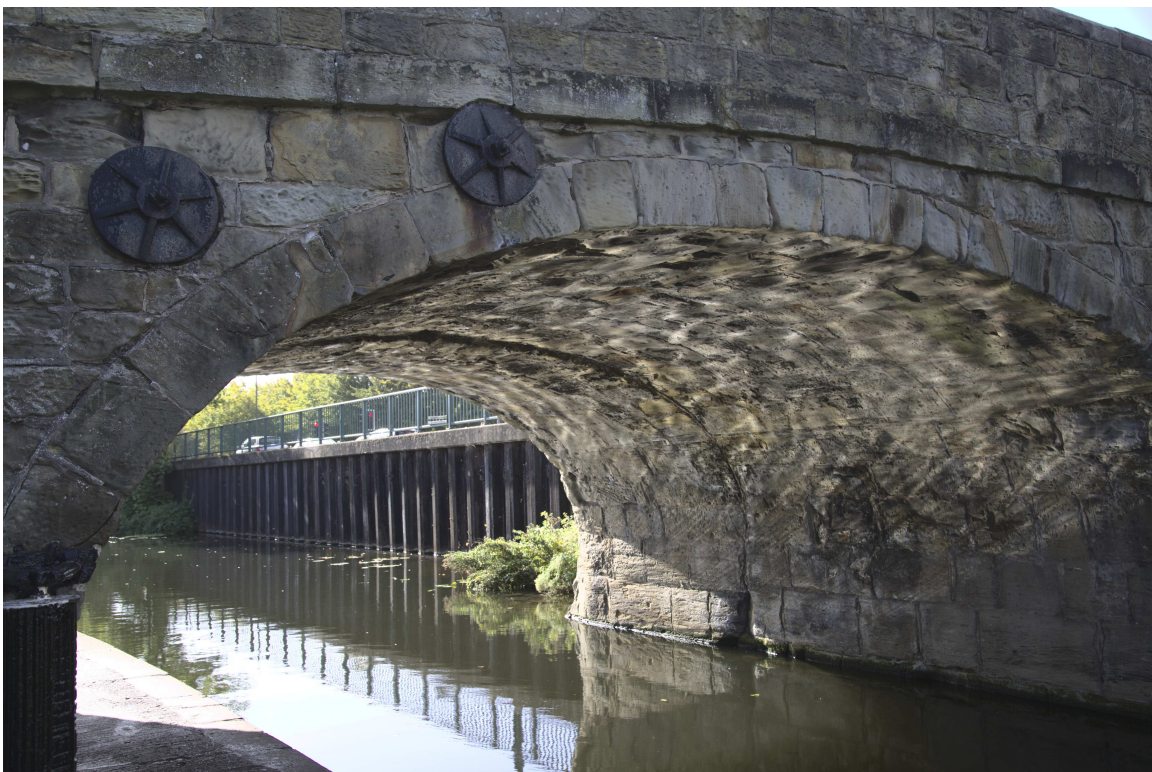
F47B5385 - Canal reflections from under a bridge.