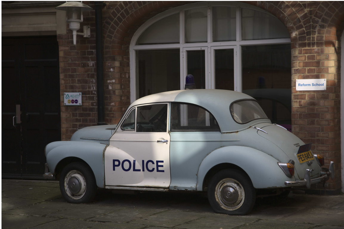
F47B5386 - Police car 1960s.