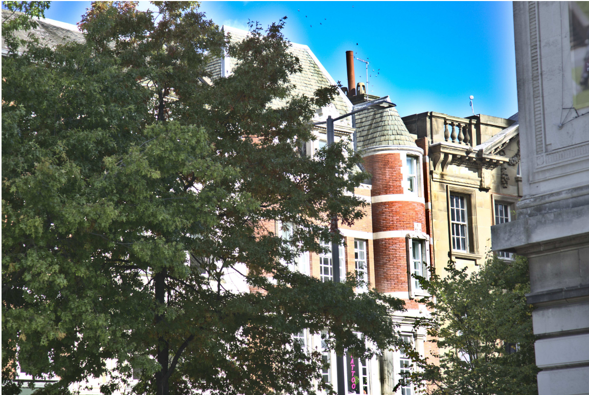
F47B5399 - Long Row.