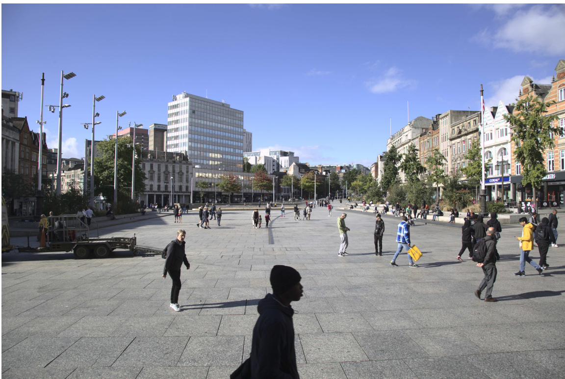
F47B5401 - Silhouette in slab square looking West.