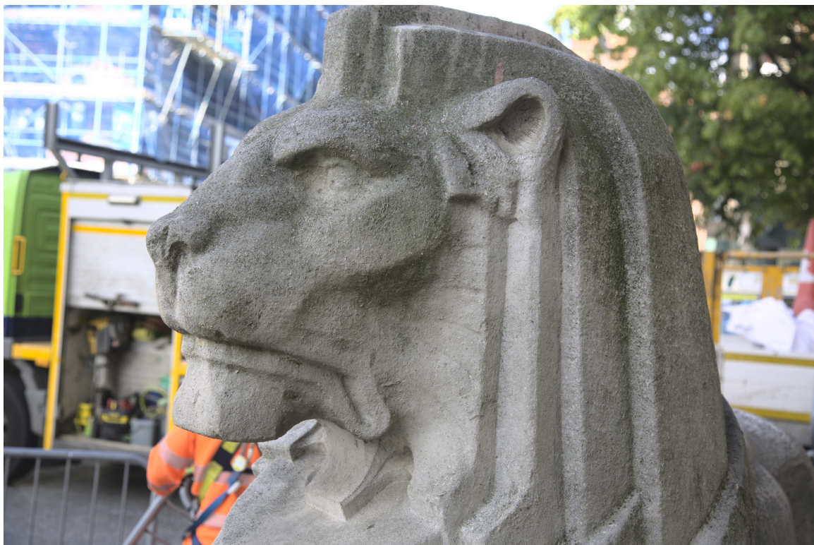
F47B5394 - Lion's head.