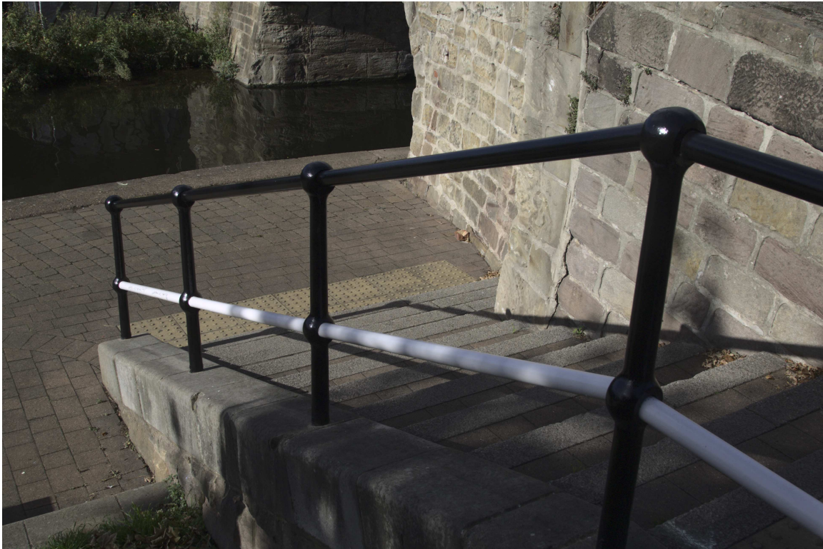
F47B5378 - Canal steps.