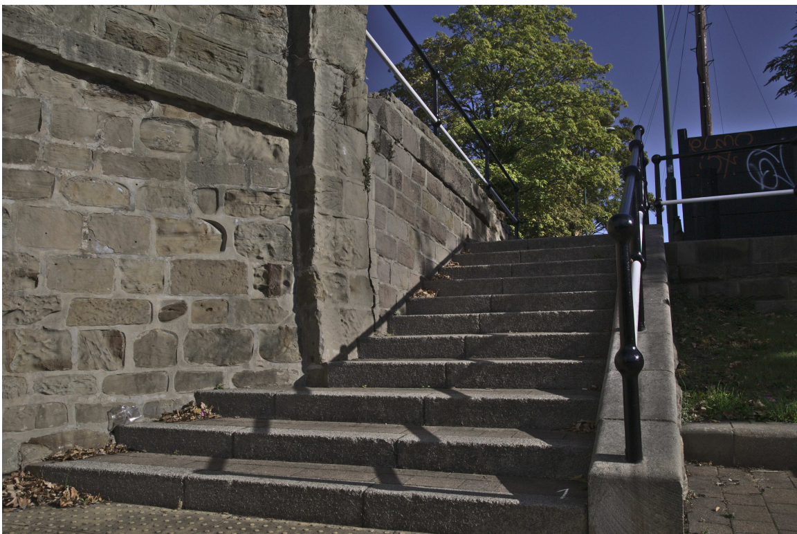
F47B5381 - Canal steps.