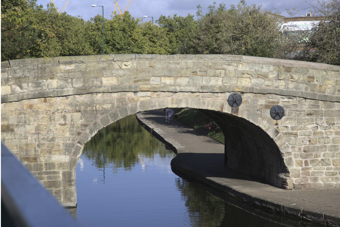
F47B5373 - Canal bridge.