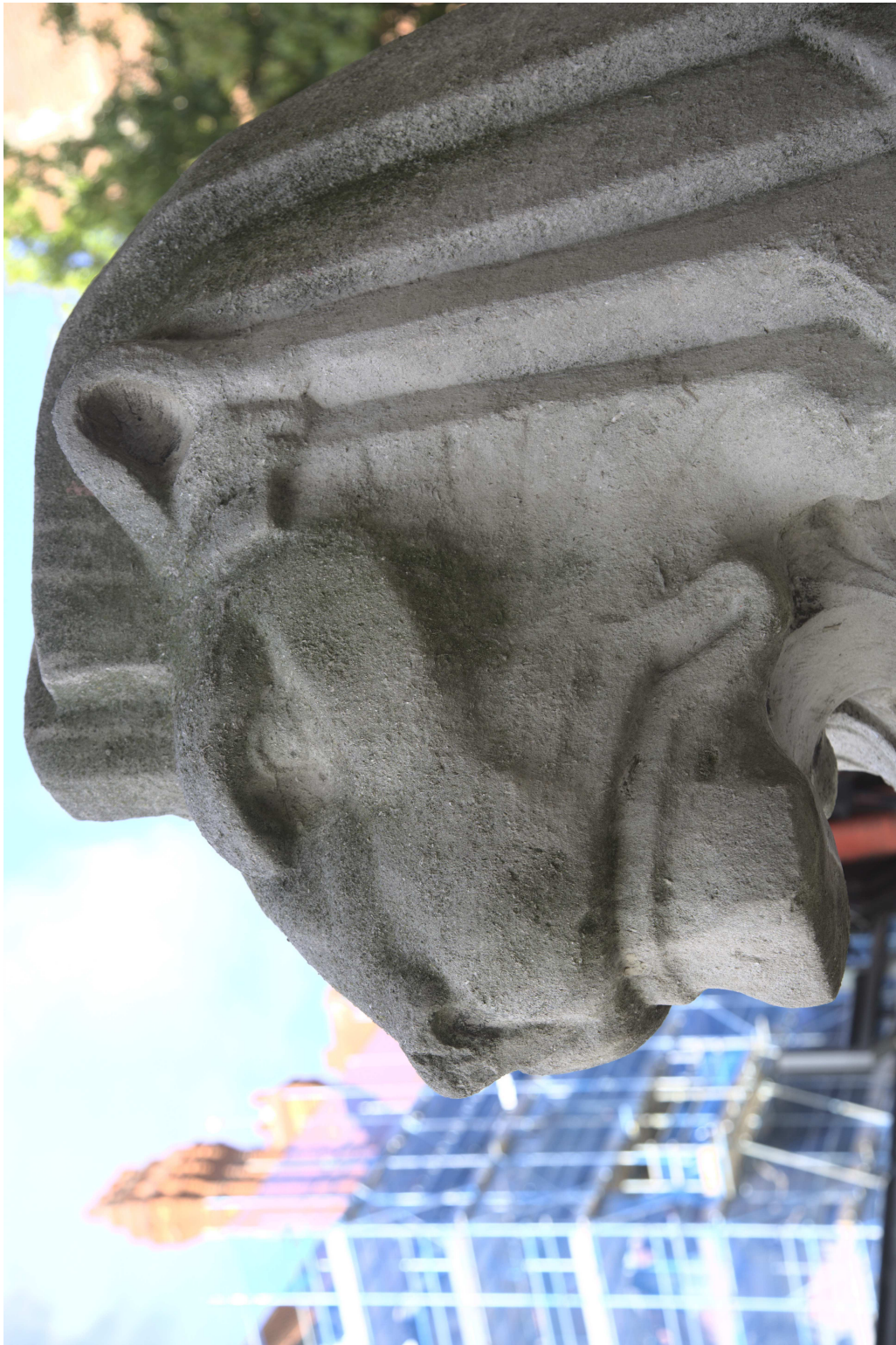
F47B5397 - Lion's head.