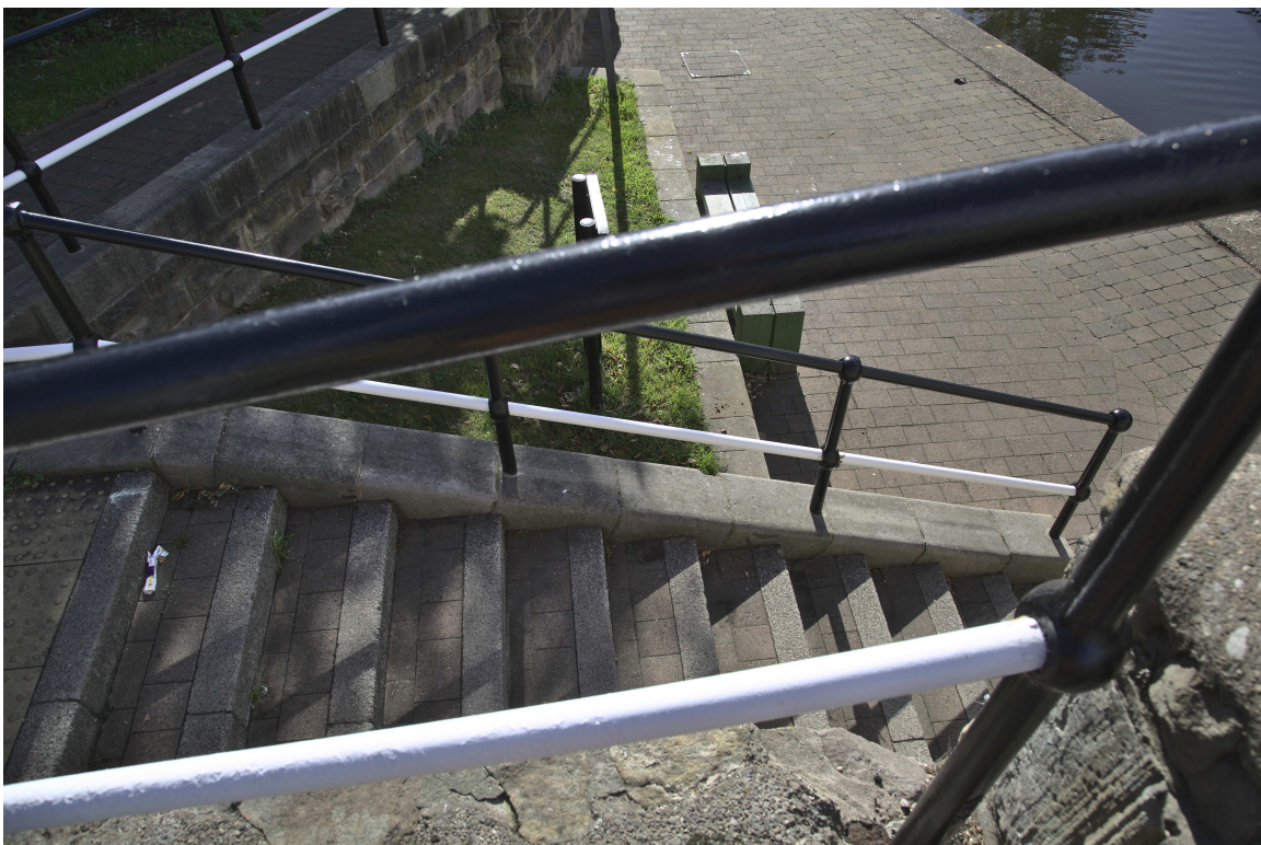
F47B5377 - Canal steps.