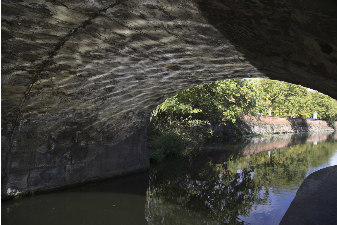
F47B5383 - Canal reflections from under a bridge.