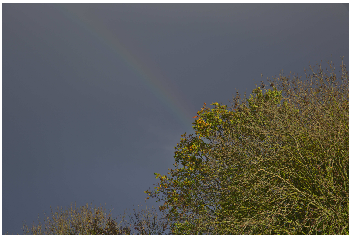
F47B5635 - Lit by a rainbow.