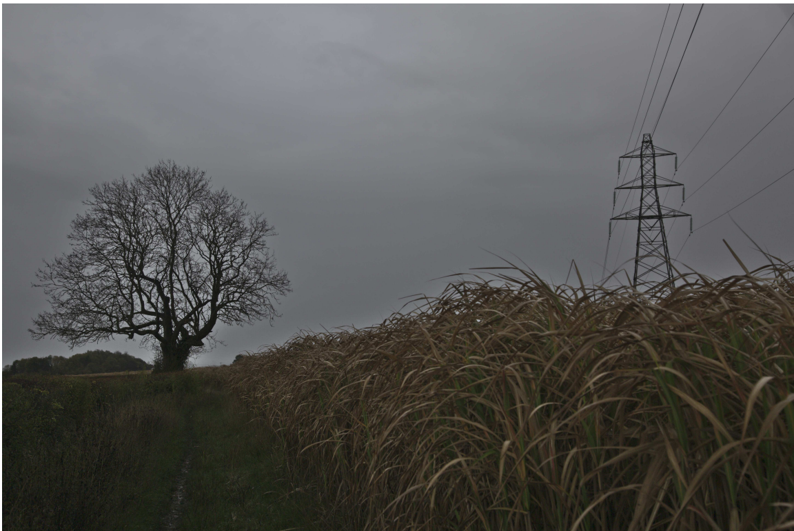
F47B5620 - Crops and a pylon.