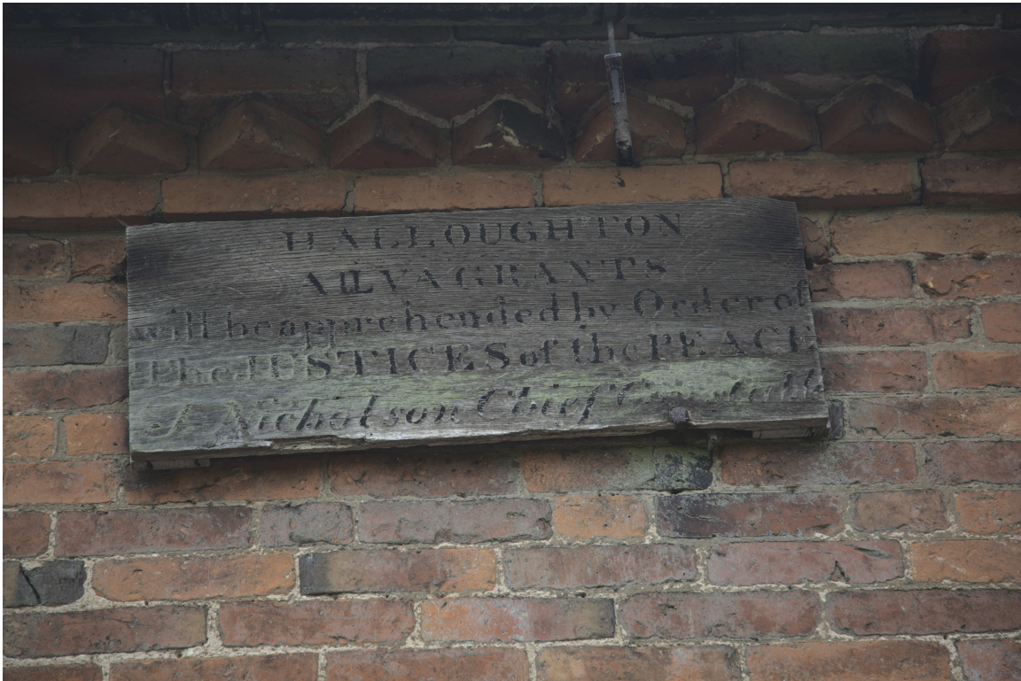
F47B5614 - Carved signboard.