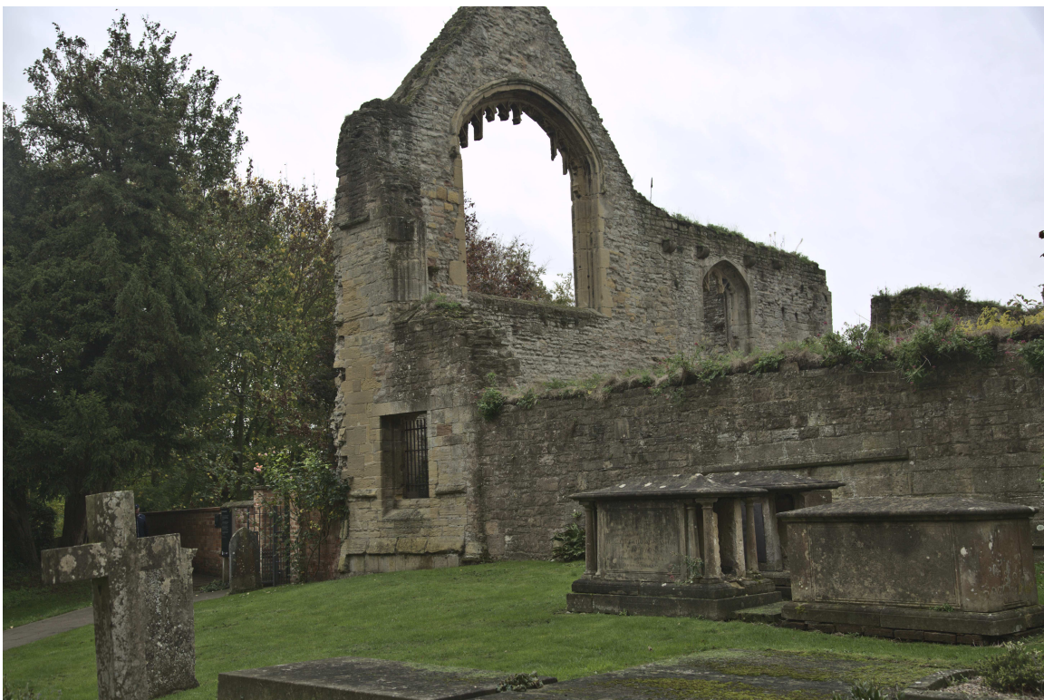
F47B5605 - Bishop's Palace Garden.