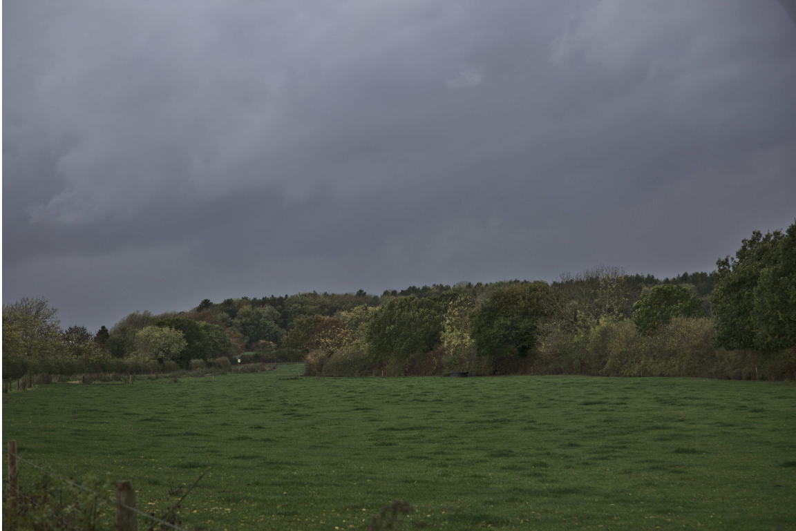
F47B5617 - Landscape.