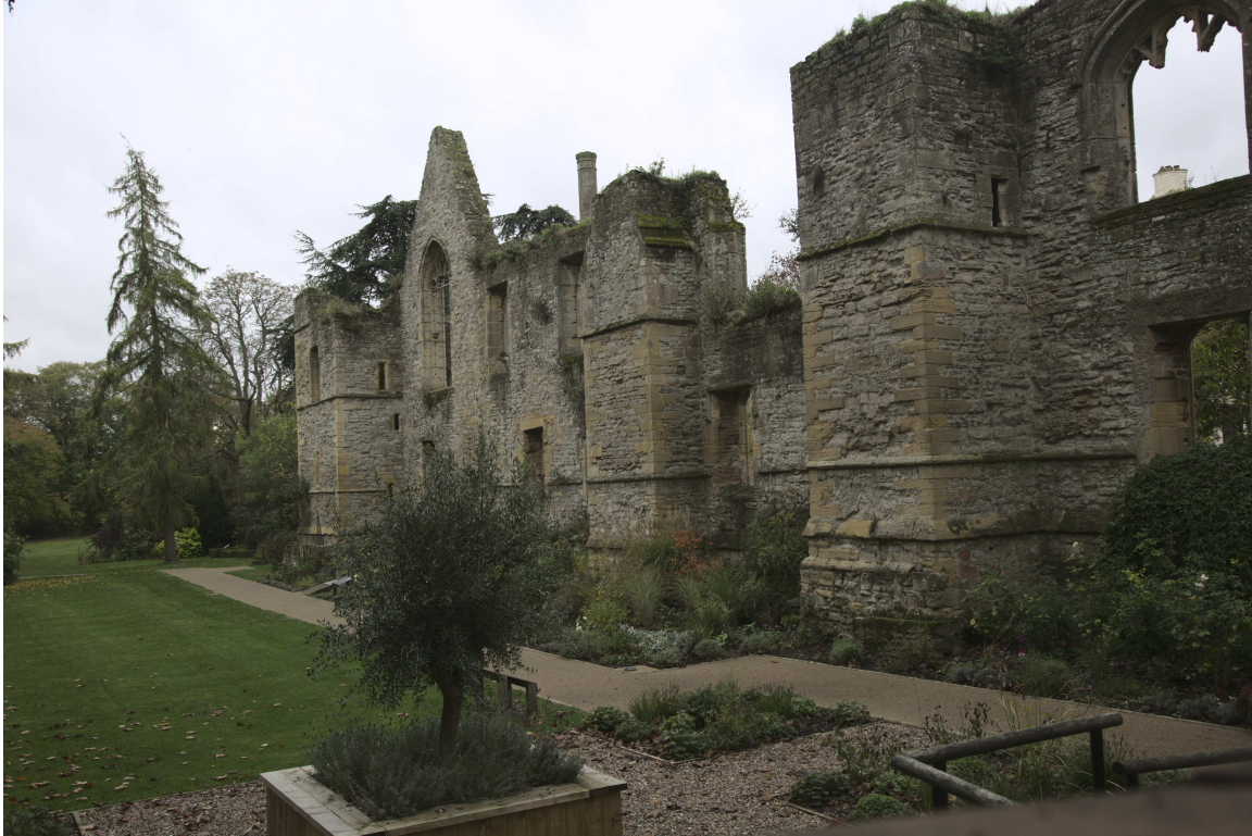
F47B5601 - Bishop's Palace Garden.