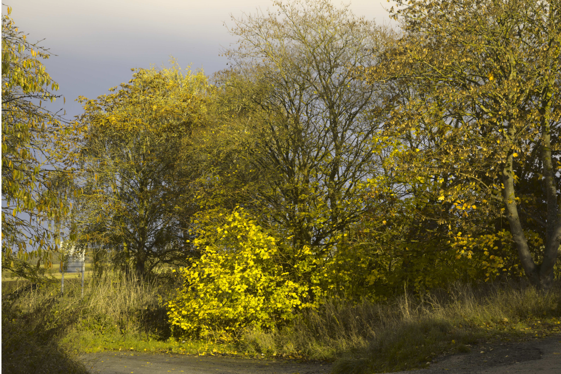
F47B5638 - Break in the clouds.