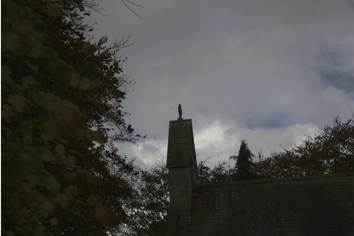
F47B5610 - St James Parish Church.