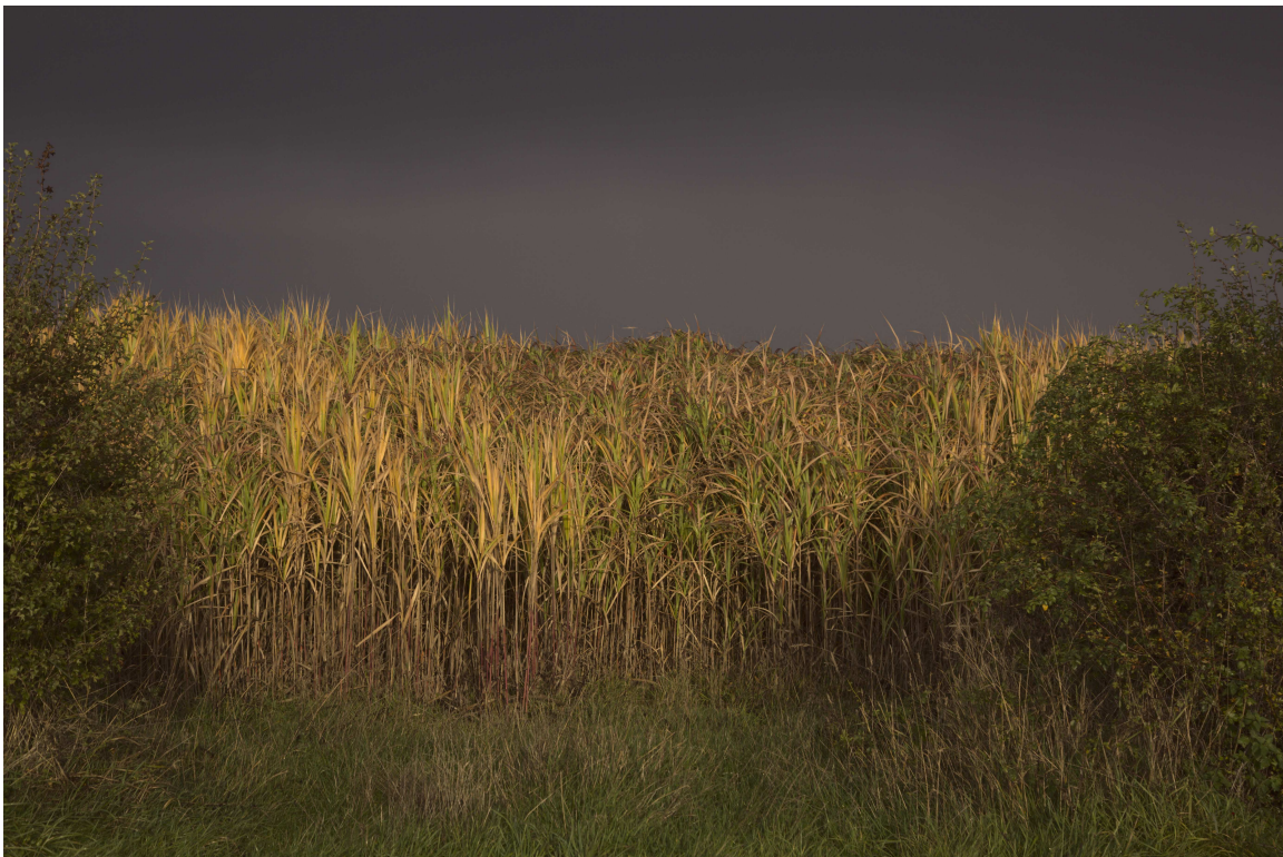
F47B5632 - Crops glowing.