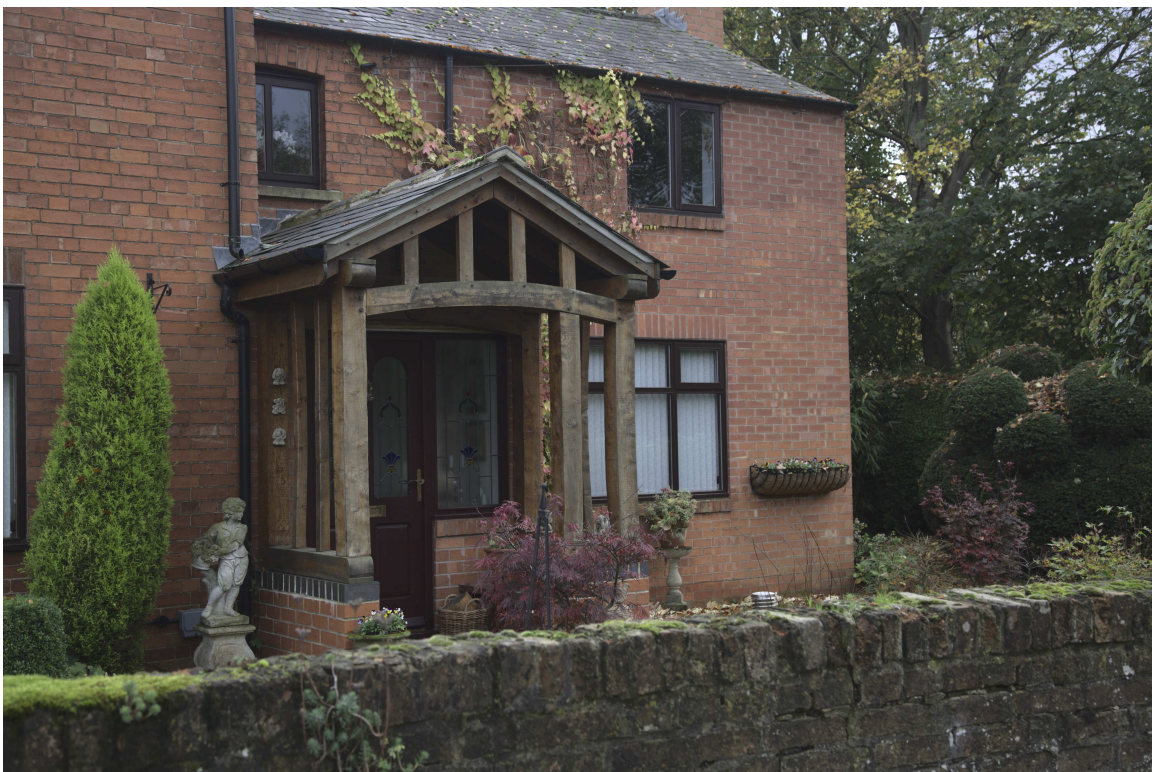
F47B5615 - Cottage.