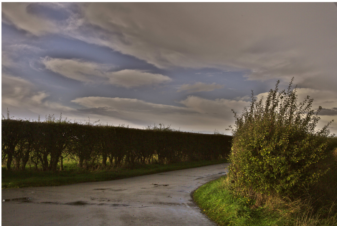
F47B5634 - Break in the clouds.