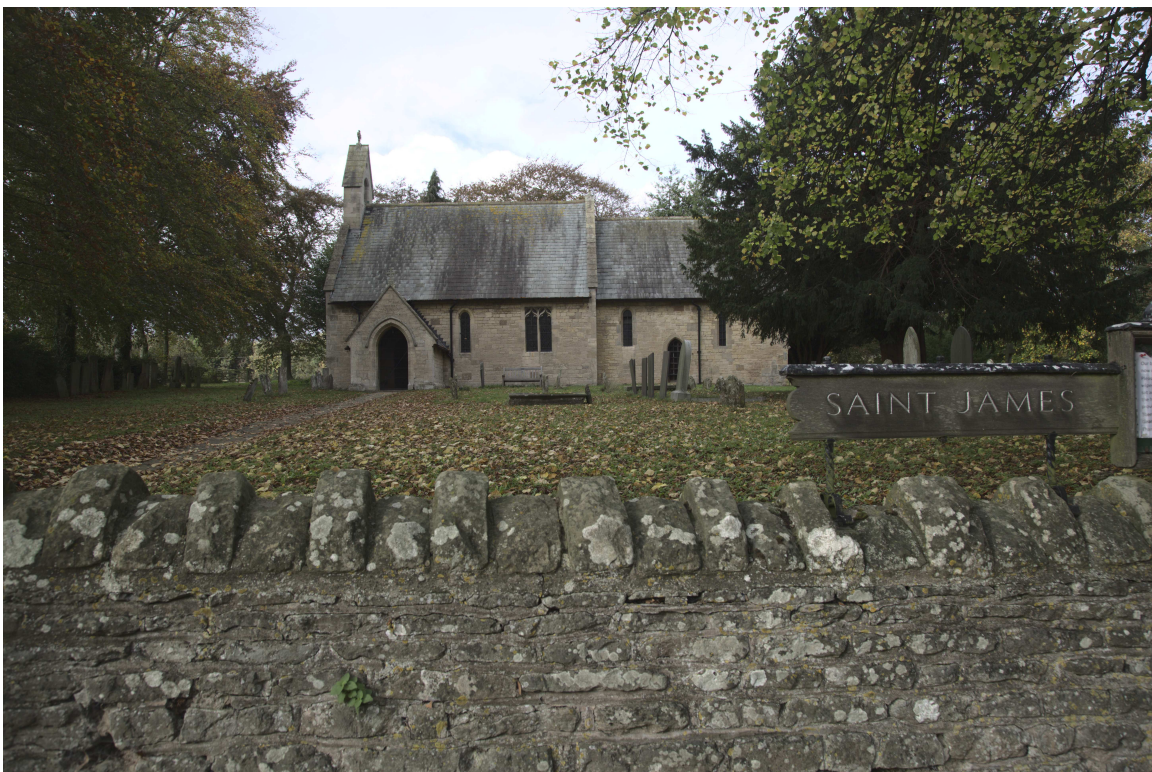
F47B5609 - St James Parish Church.