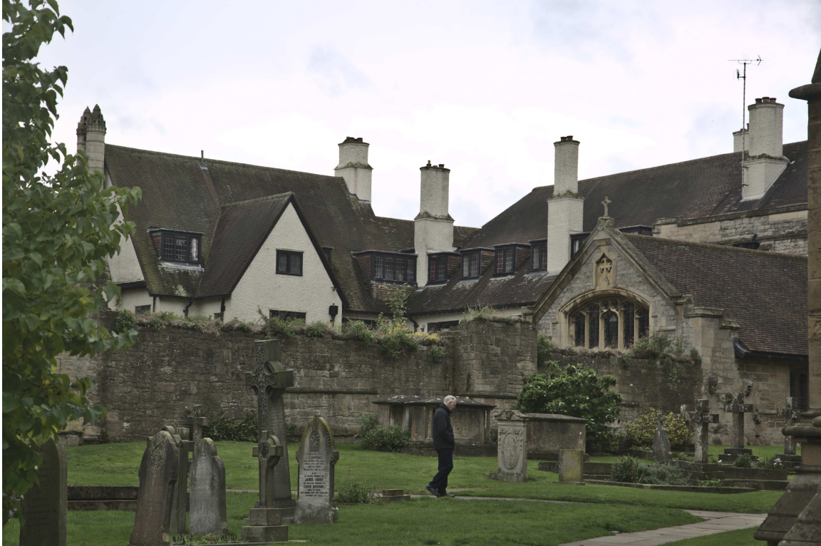
F47B5606 - Bishop's Palace Remains of.