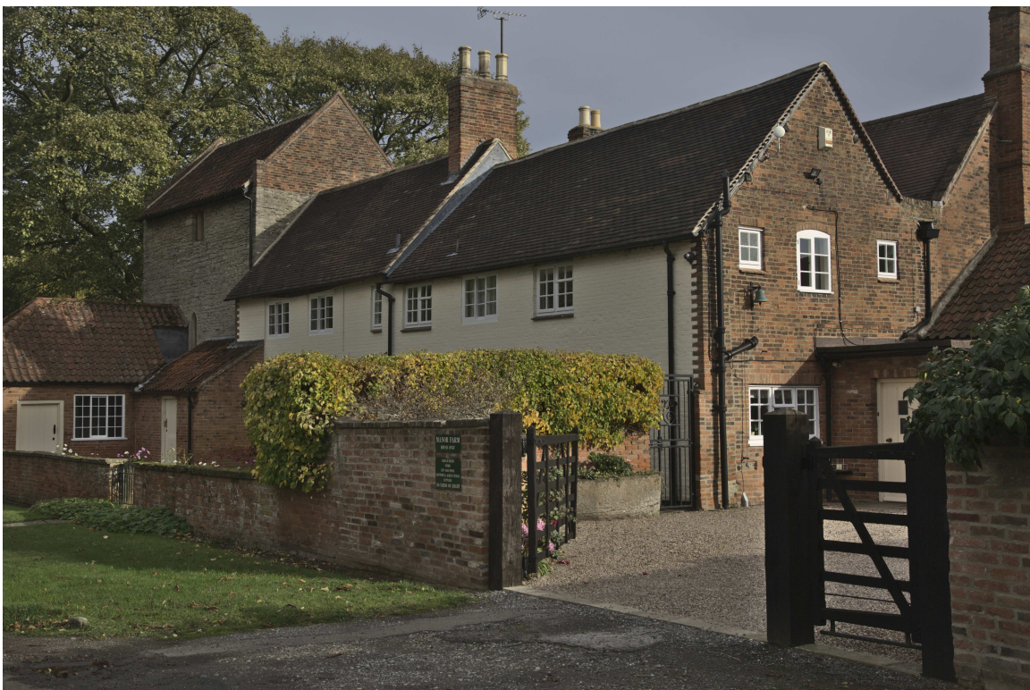
F47B5613 - Manor Farm.