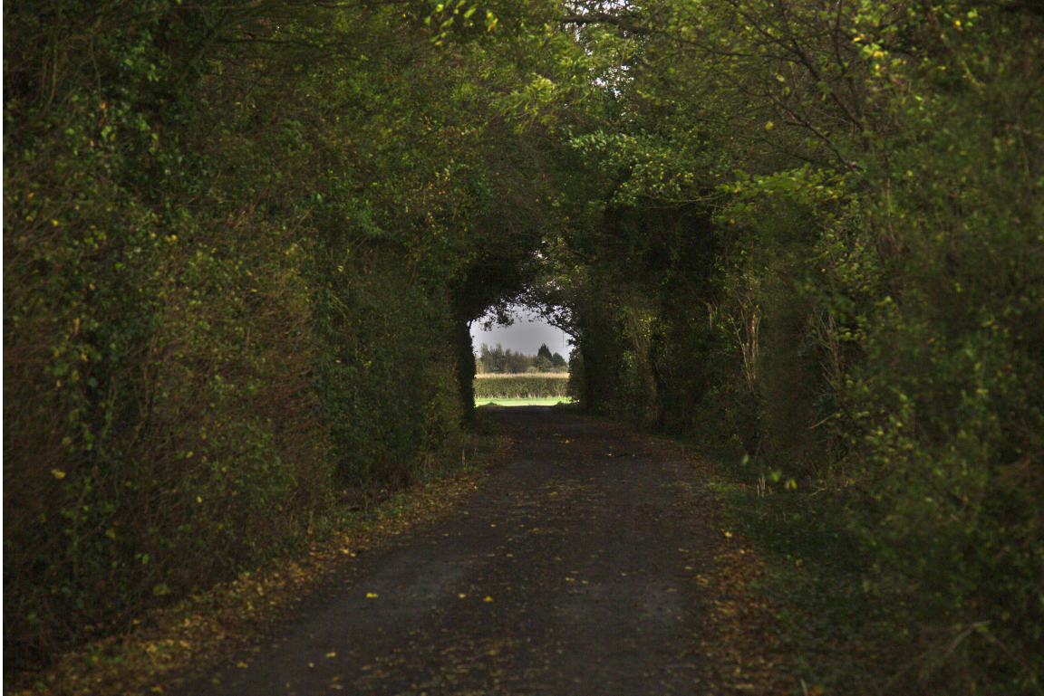
F47B5626 - Tunnel of trees.