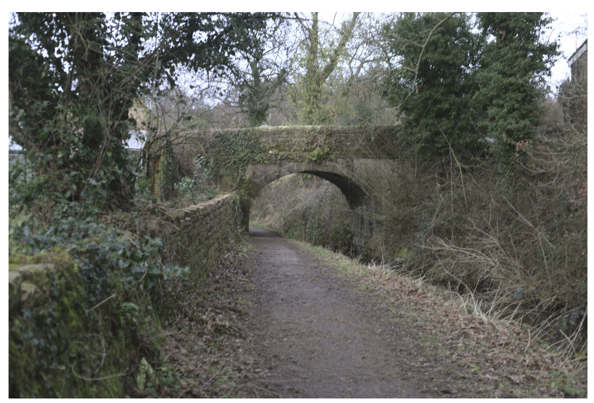
F47B6137 - Canal Bridge.