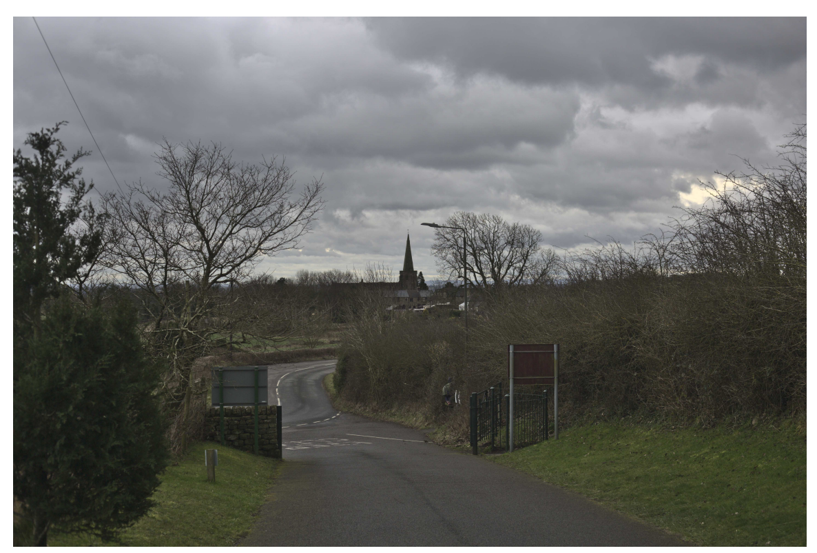
F47B6162 - Church spire.