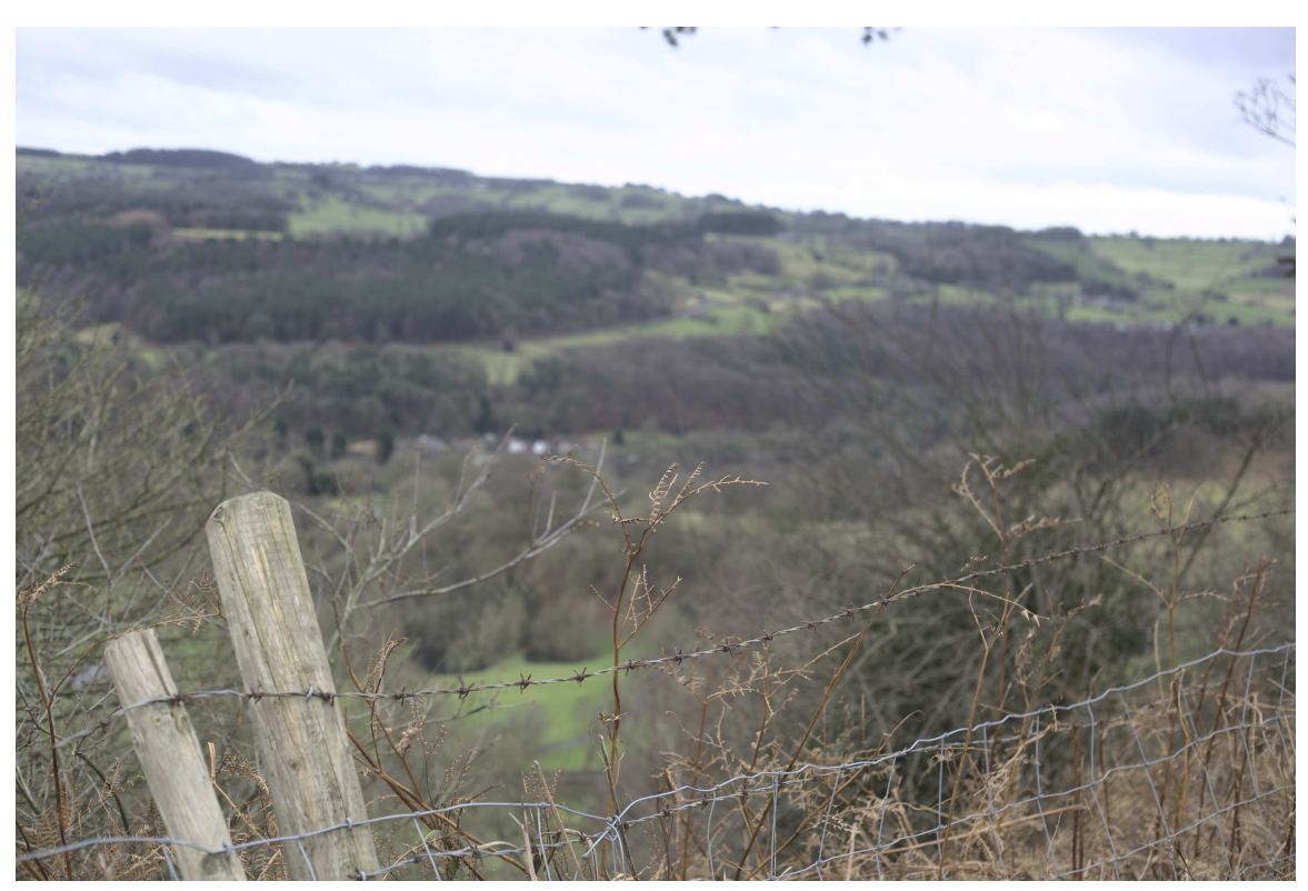
F47B6142 - Barbed wire and sheep fencing.