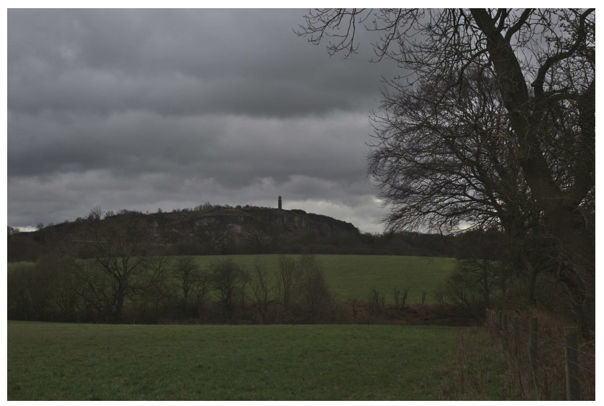
F47B6149 - Cliffside.