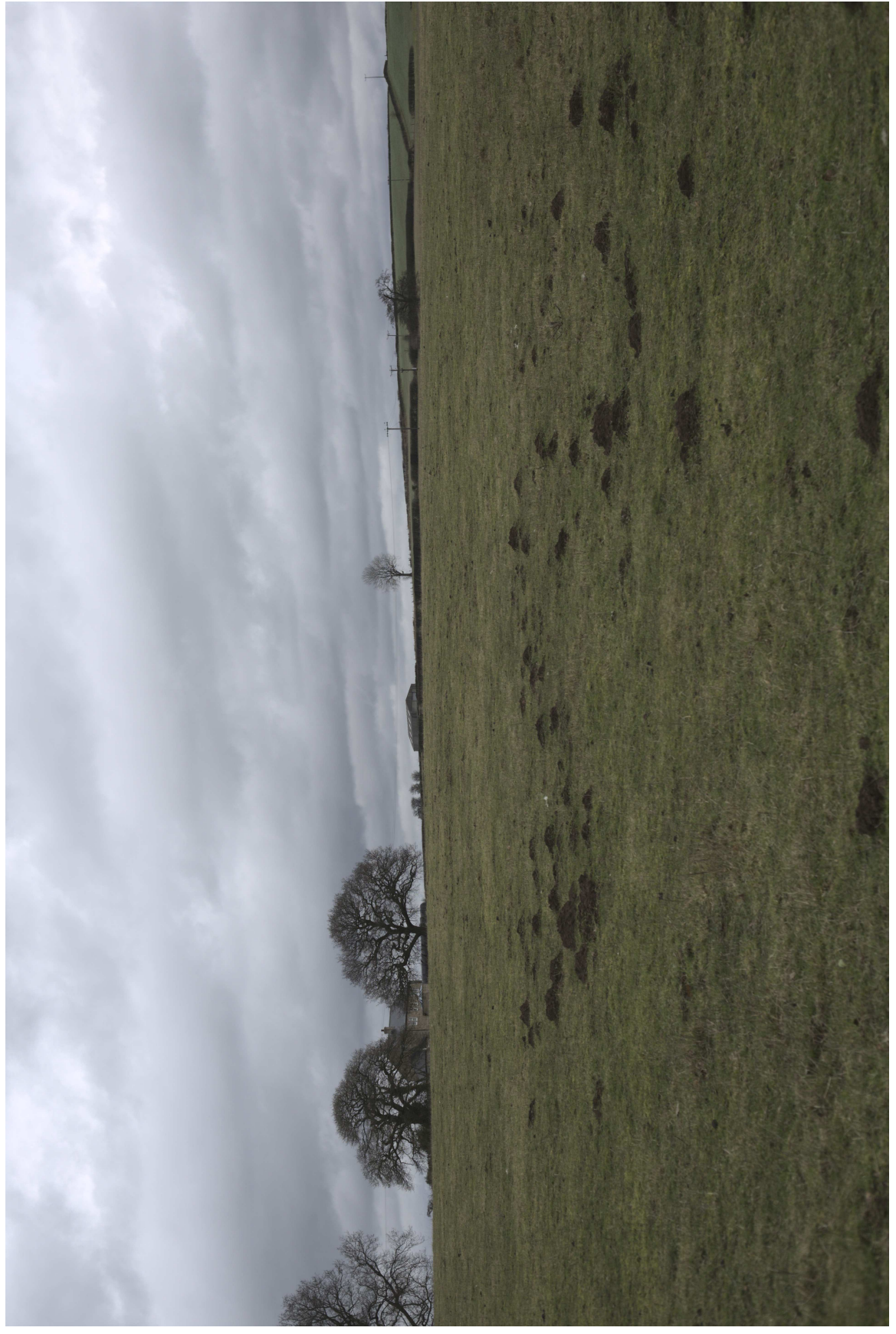
F47B6140 - Moorland farms.