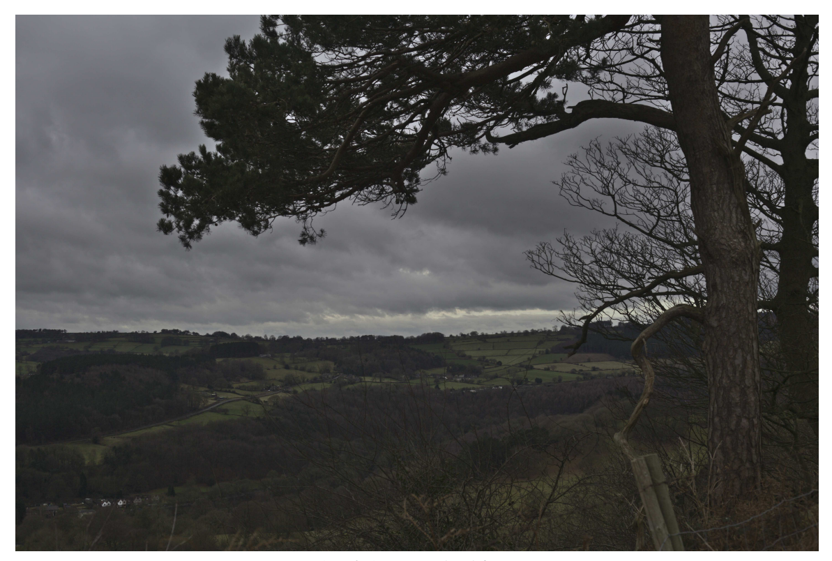
F47B6141 - Moorland farms.