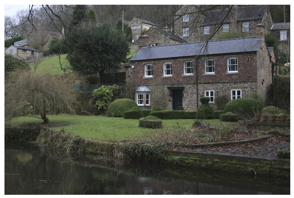
F47B6134 - Oakford Cottage.