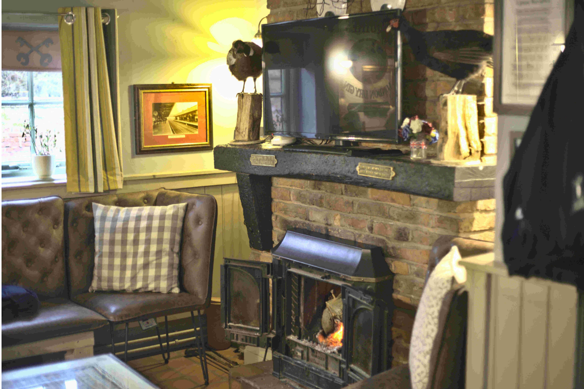
F47B6246 - Open fire.