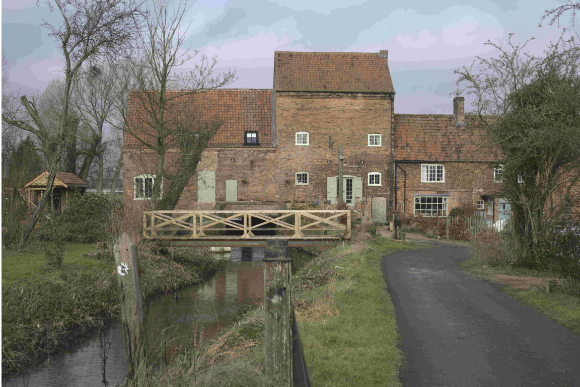
F47B6204 - Mill Farm.