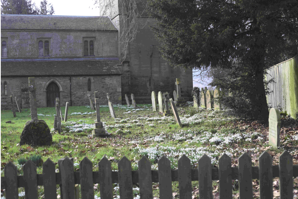
F47B6207 - Snowdrops and the dead.