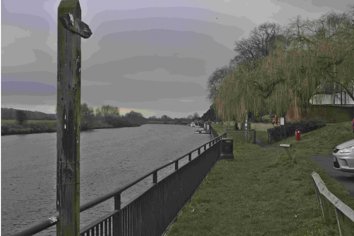
F47B6216 - Riverside stop.