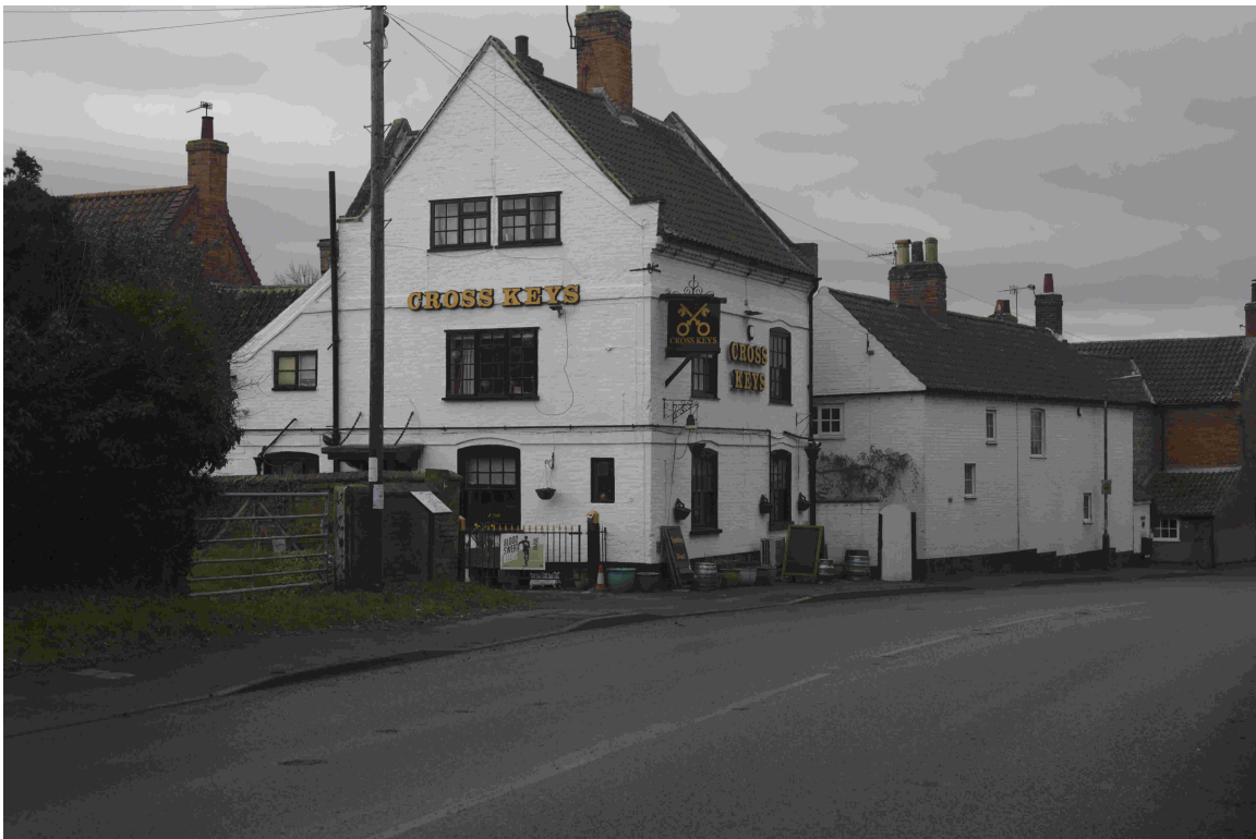
F47B6241 - Cross Keys.