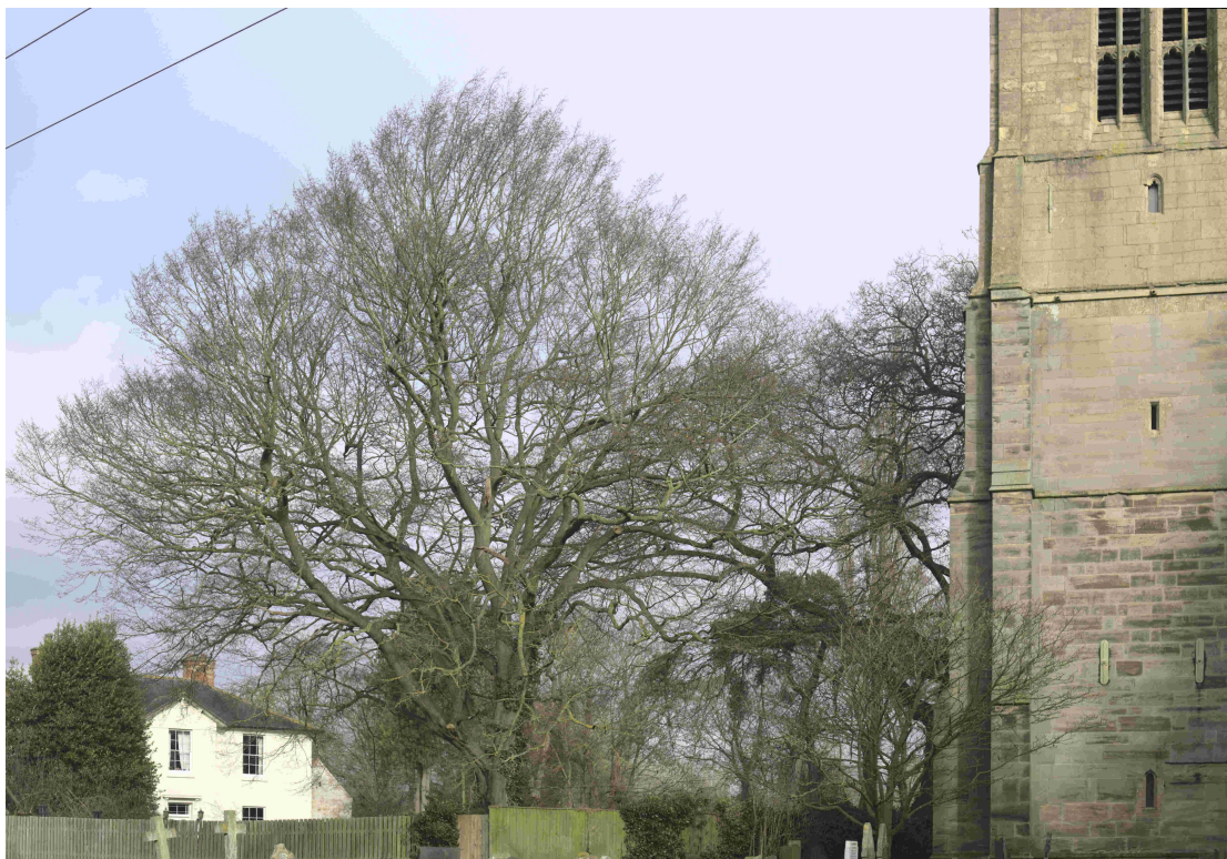
F47B6211 - Church and Rectory.