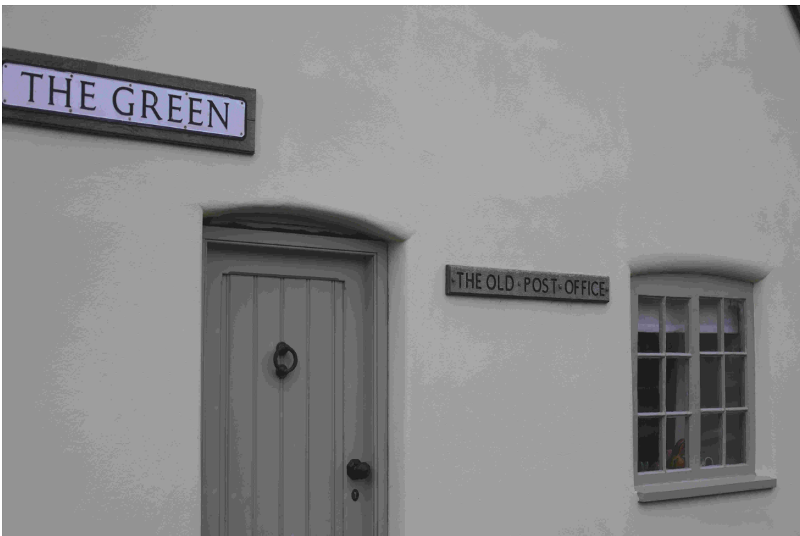
F47B6234 - Post Office on the Green.