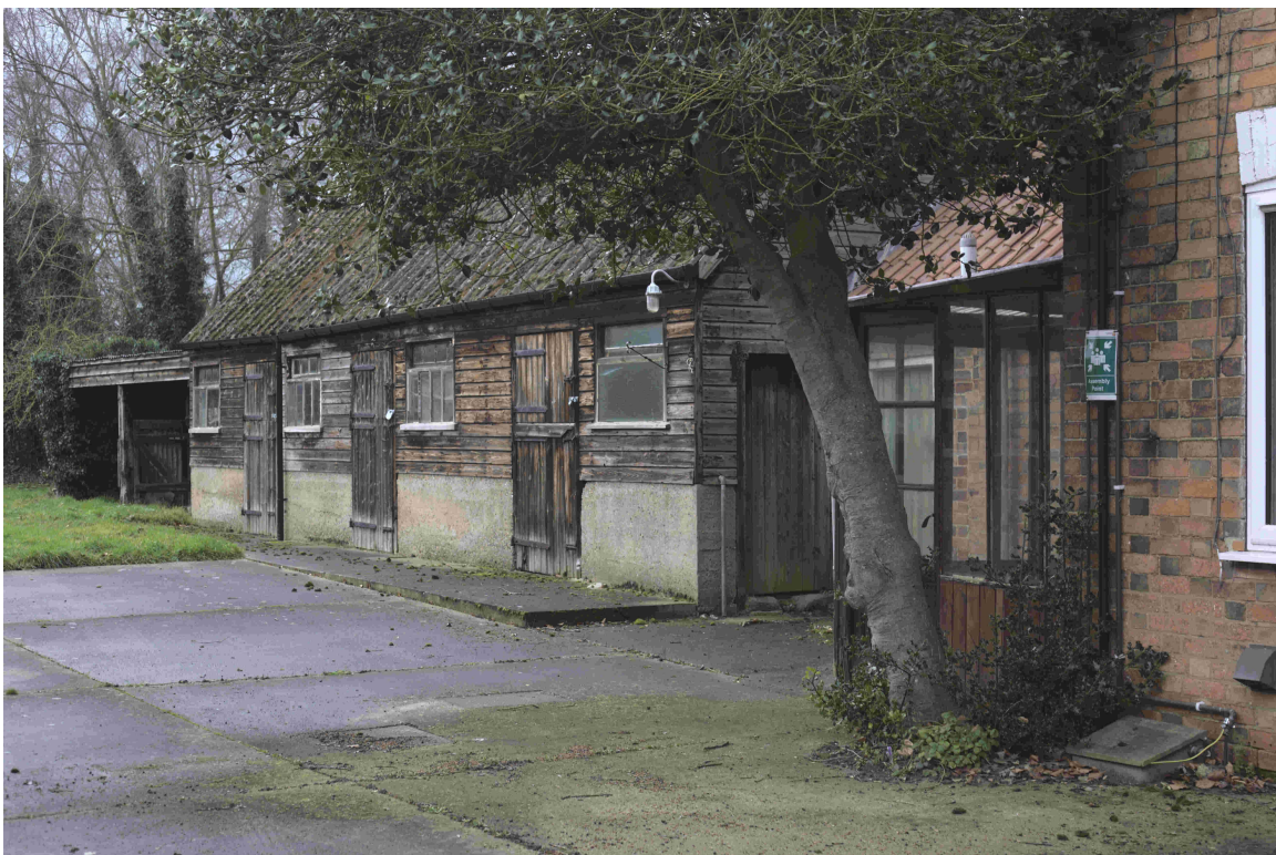
F47B6219 - Stable block.