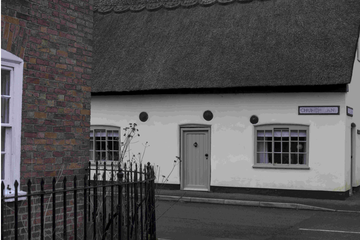
F47B6233 - Thatched cottage.