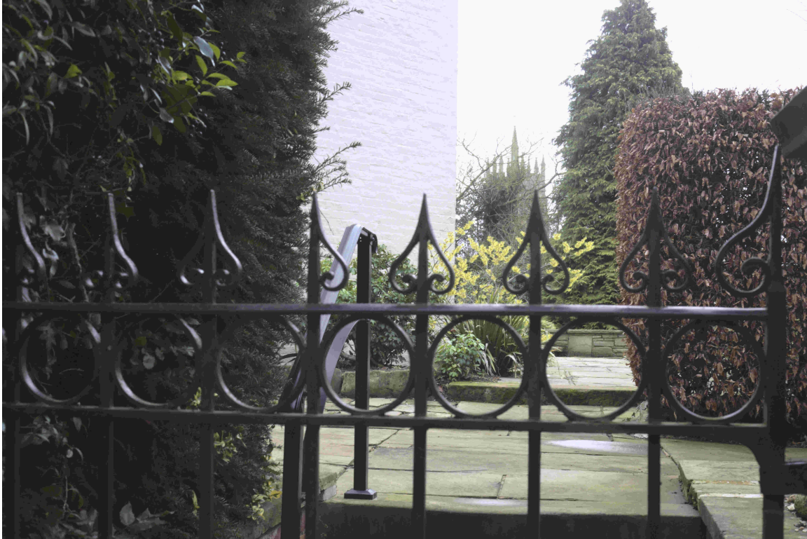
F47B6239 - Manor House.