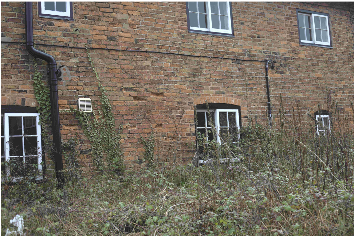
F47B6231 - Abandoned cottage.