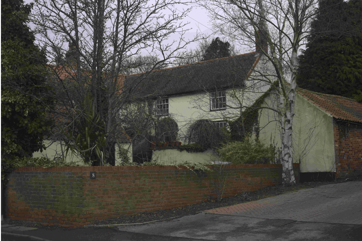
F47B6227 - 8 Main Street.