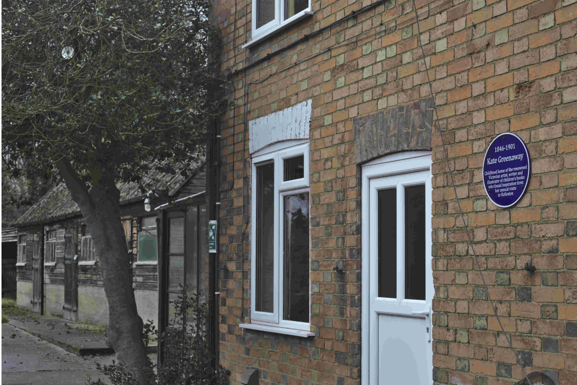
F47B6221 - Blue plaque.